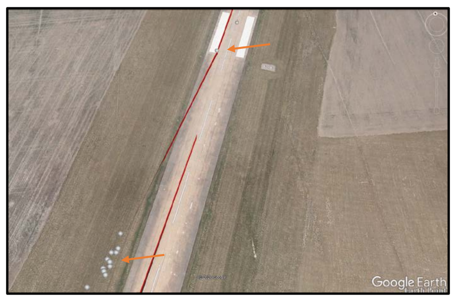
Figure 2: Second landing data point and airplane off side of runway.