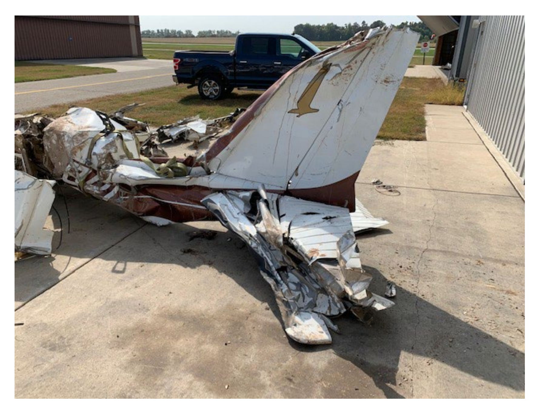
Photo 4 - Main Wreckage Layout - Empennage, Left Side