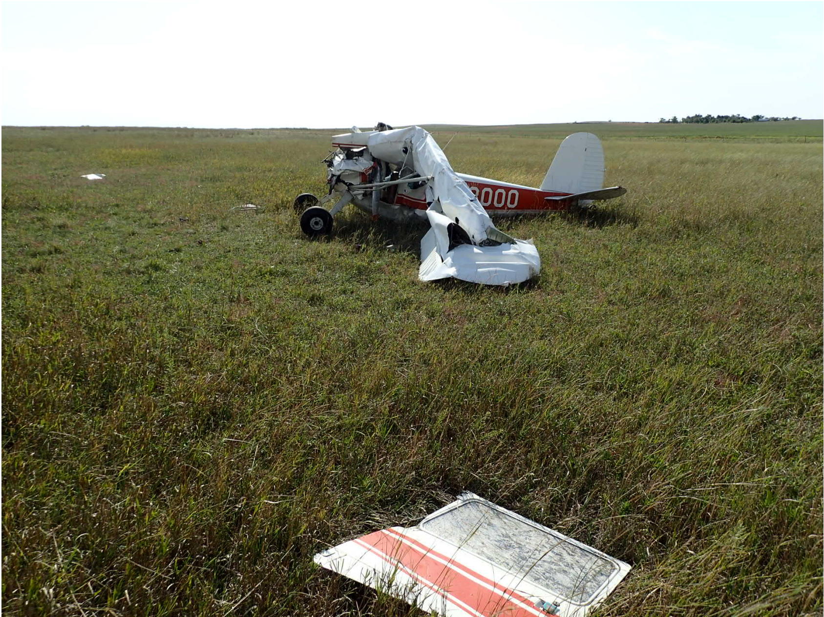
Photo 1 – View of the airplane looking to the south. The student pilot’s private airstrip is located in the upper right corner of the photograph near the trees.