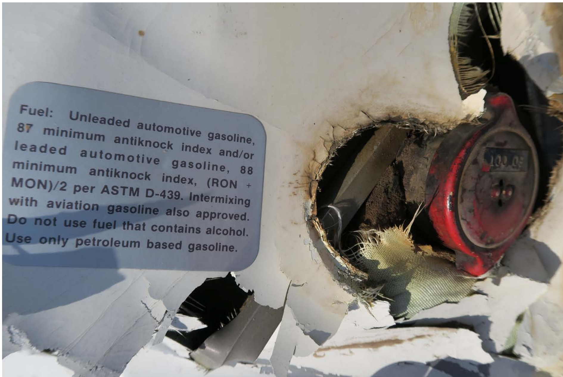
Photo 11 – View of the fuel placard (courtesy of Textron Aviation).