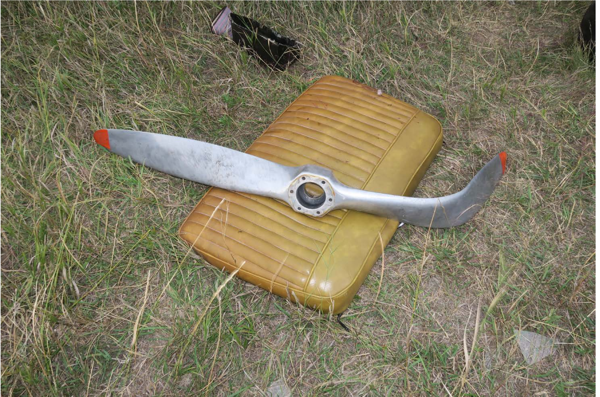
Photo 13 – View of the propeller removed from the engine.