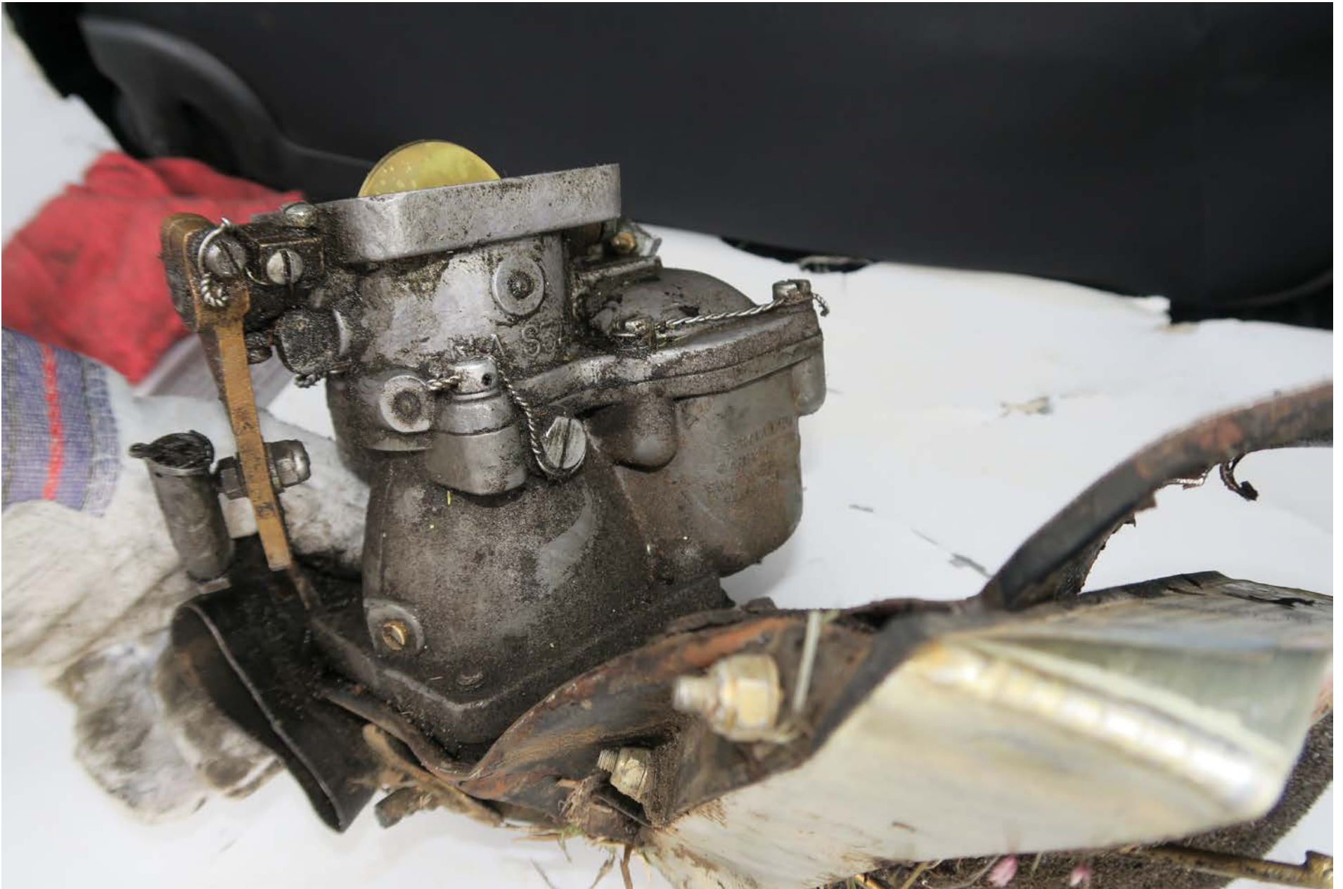
Photo 9 – View of the carburetor intact (courtesy of Textron Aviation).