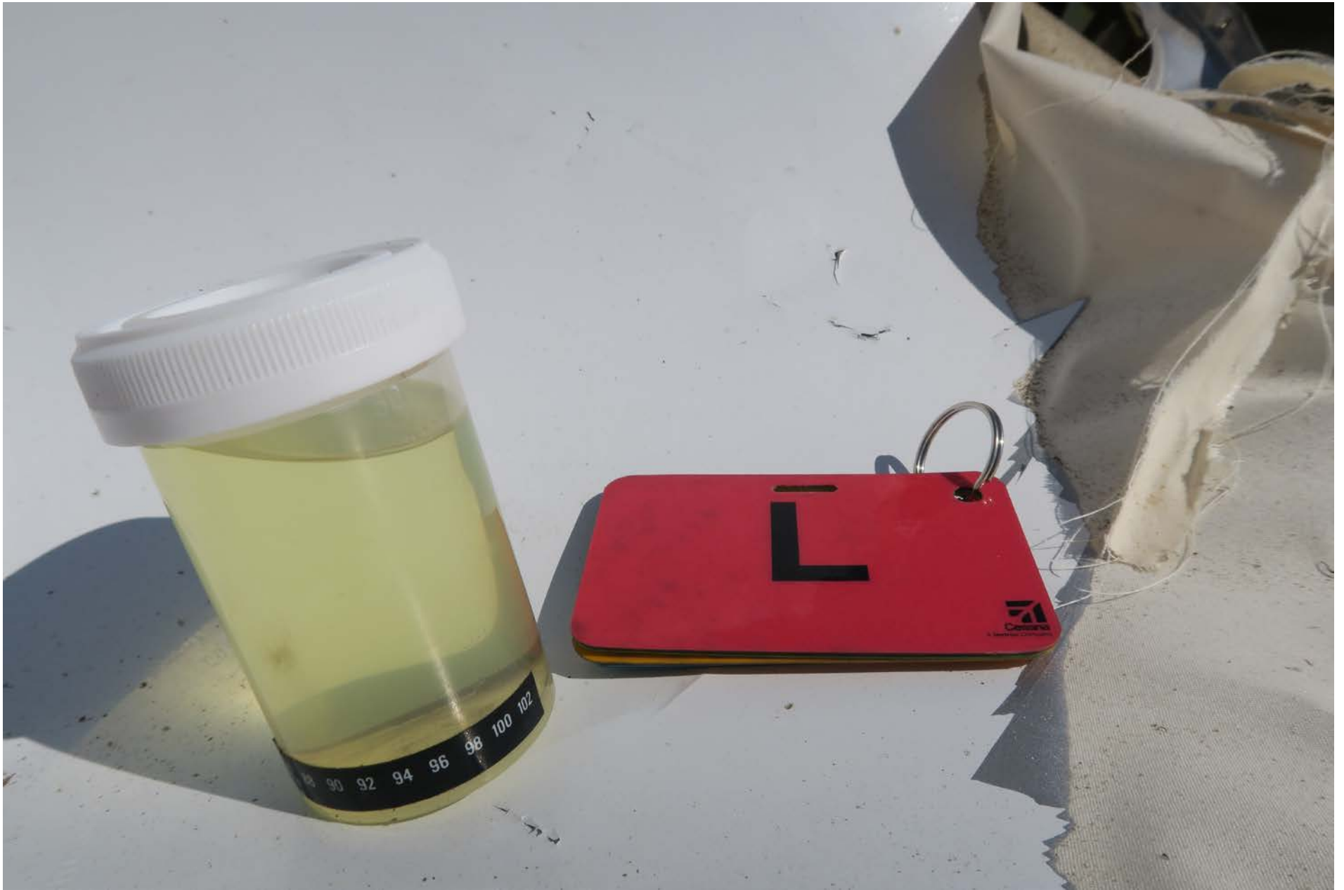
Photo 12 – View of a fuel sample from the left fuel tank (courtesy of Textron Aviation).