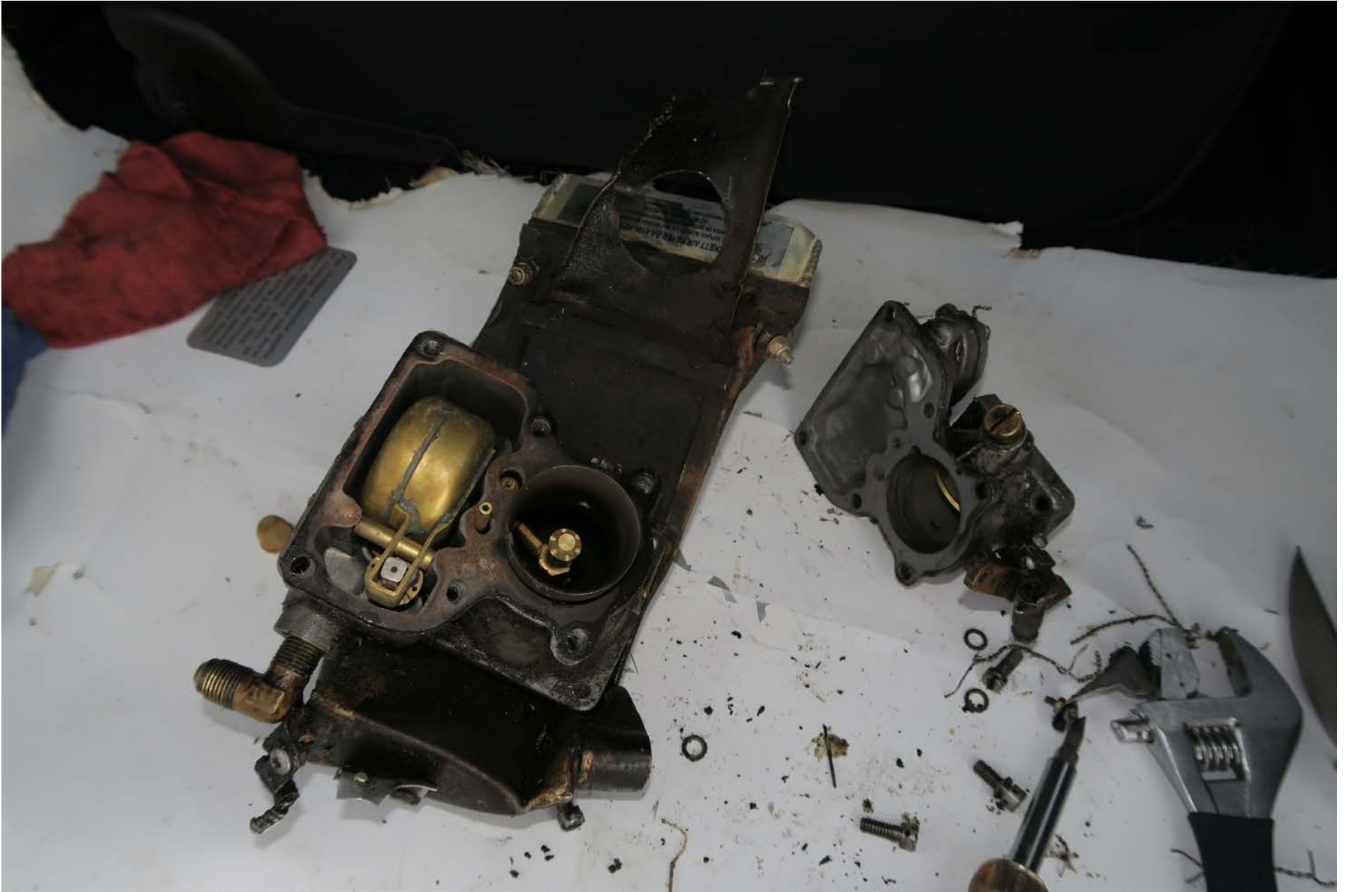
Photo 10 – View of the carburetor disassembled (courtesy of Textron Aviation).