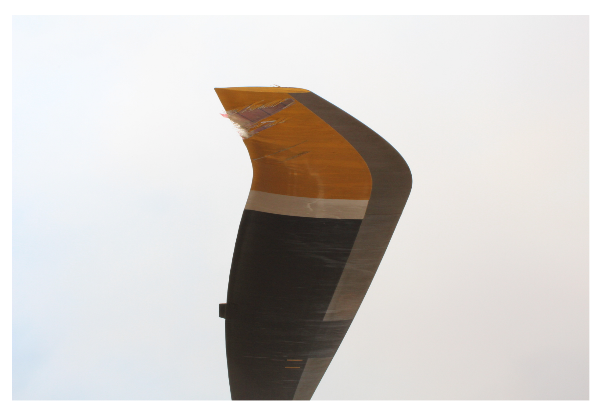
Photo 8 – View of impact damage to the "red" main rotor blade.