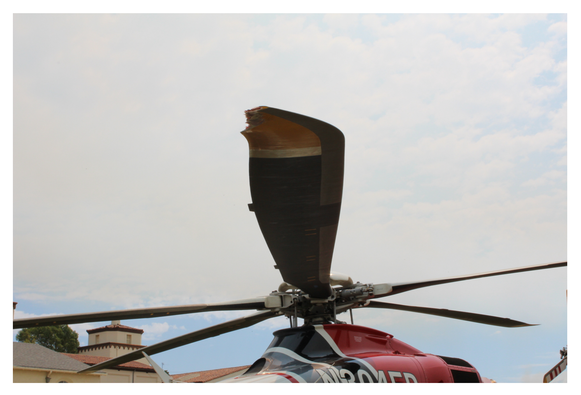
Photo 7 – View of impact damage to the "blue" main rotor blade.