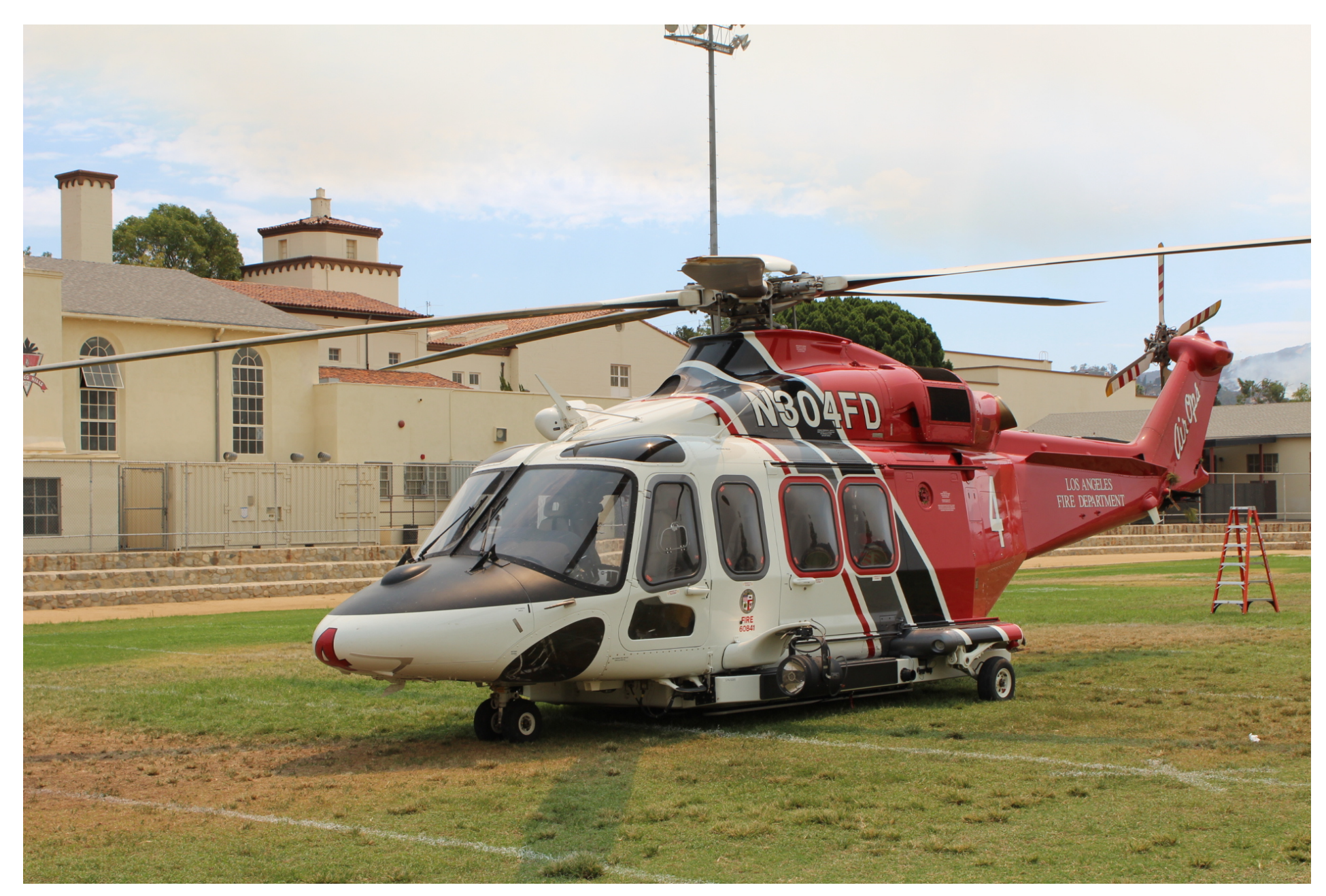
Photo 3 – Postaccident view of the helicopter equipped with the belly-mounted Simplex Aerospace Model 326 GII Fire Attack System.