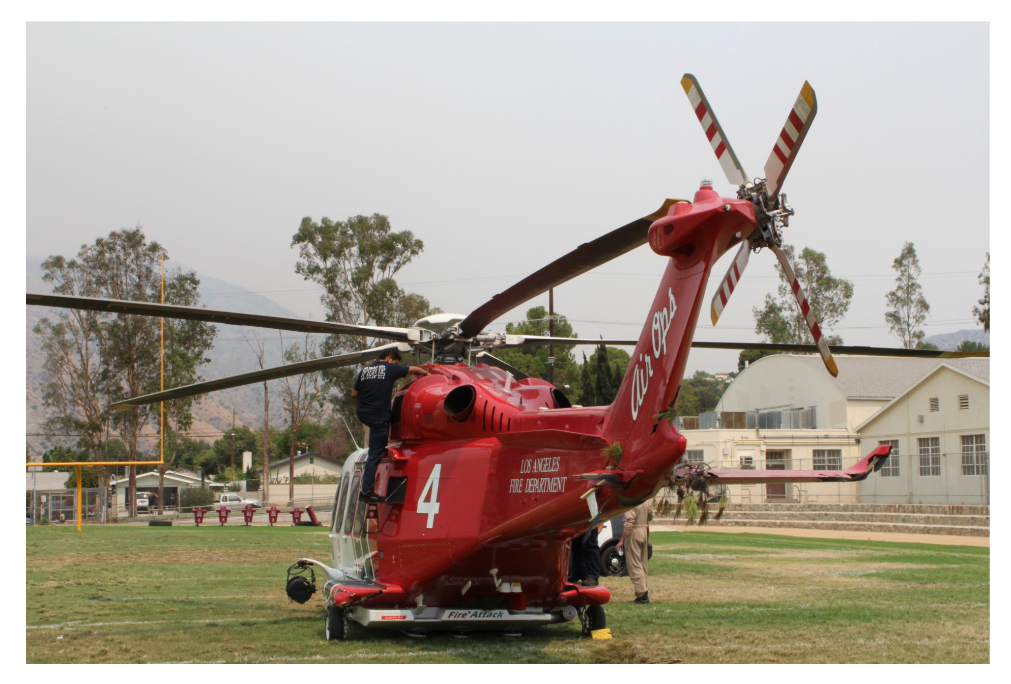
Photo 5 – View of the substantial damage to the empennage with embedded pine tree branches.