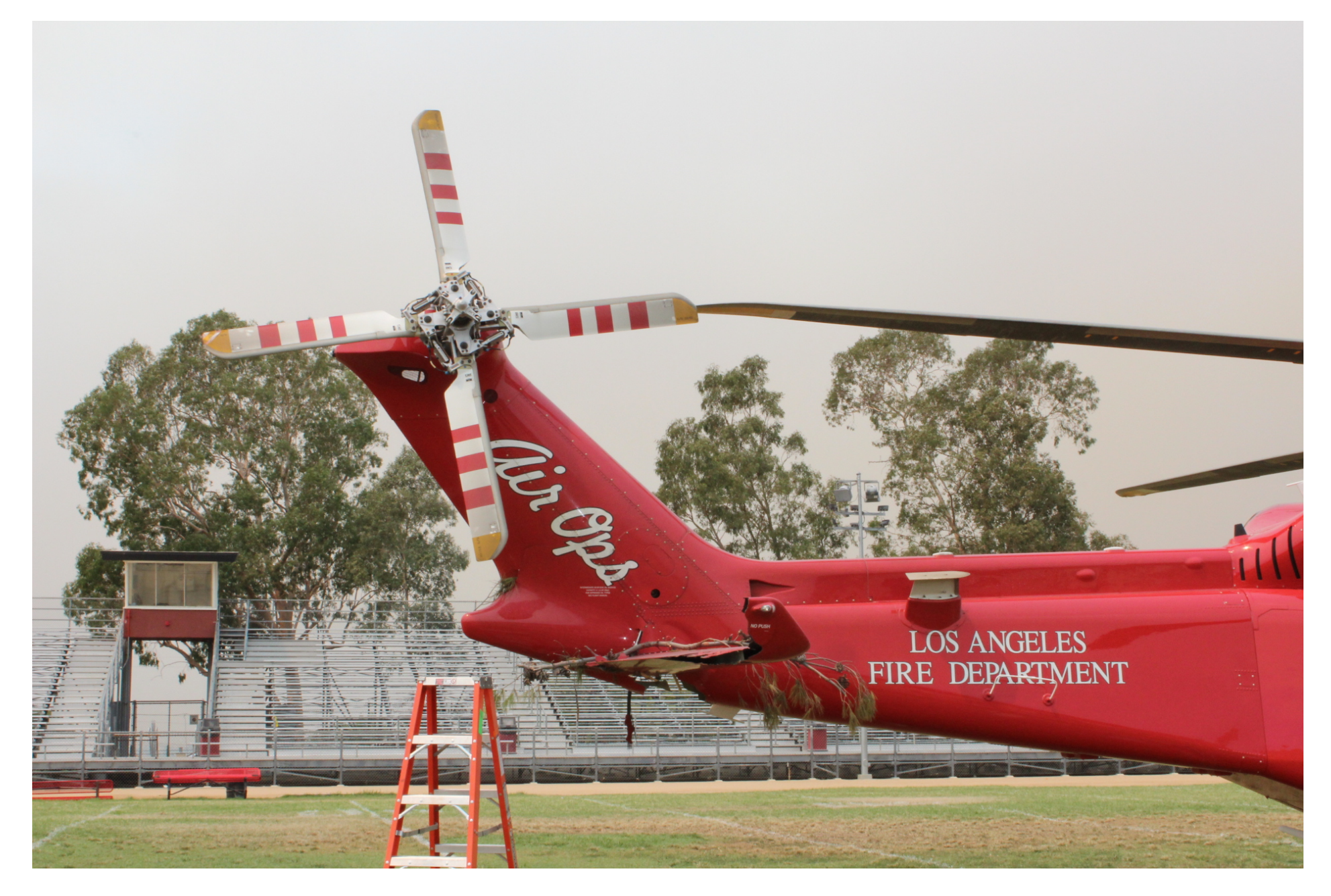
Photo 4 – View of the substantial damage to the empennage with embedded pine tree branches (courtesy of the LAFD).