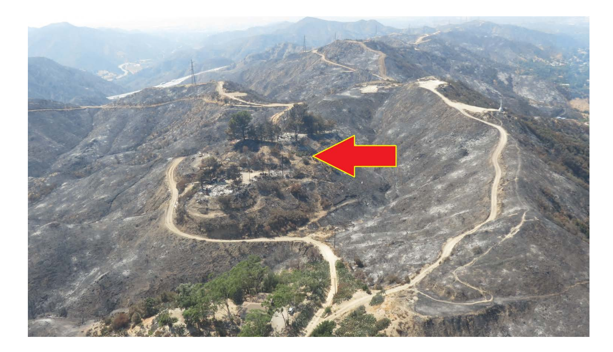
Photo 2 – Aerial view, looking to the west, of the residential complex after the fire was contained. The residential complex is marked with the red arrow.