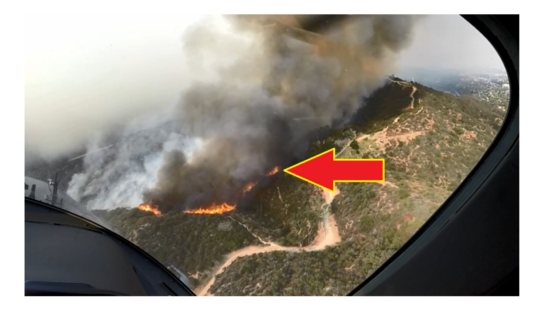
Photo 1 – Aerial view from Fire 2 just prior to the time of the accident, looking to the west, of the residential complex during aerial firefighting operations. The residential complex is marked with the red arrow.