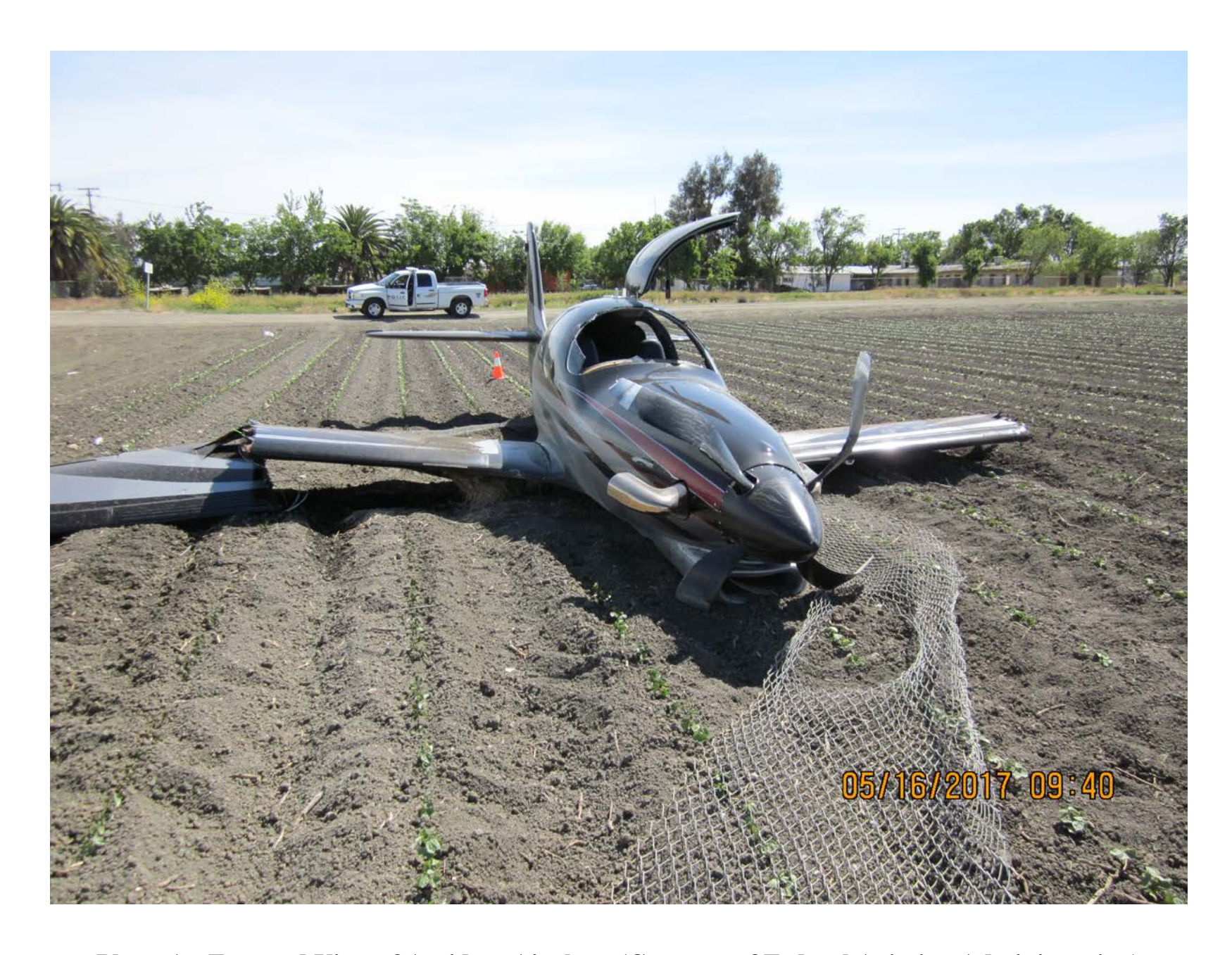
Photo 1 – Forward View of Accident Airplane