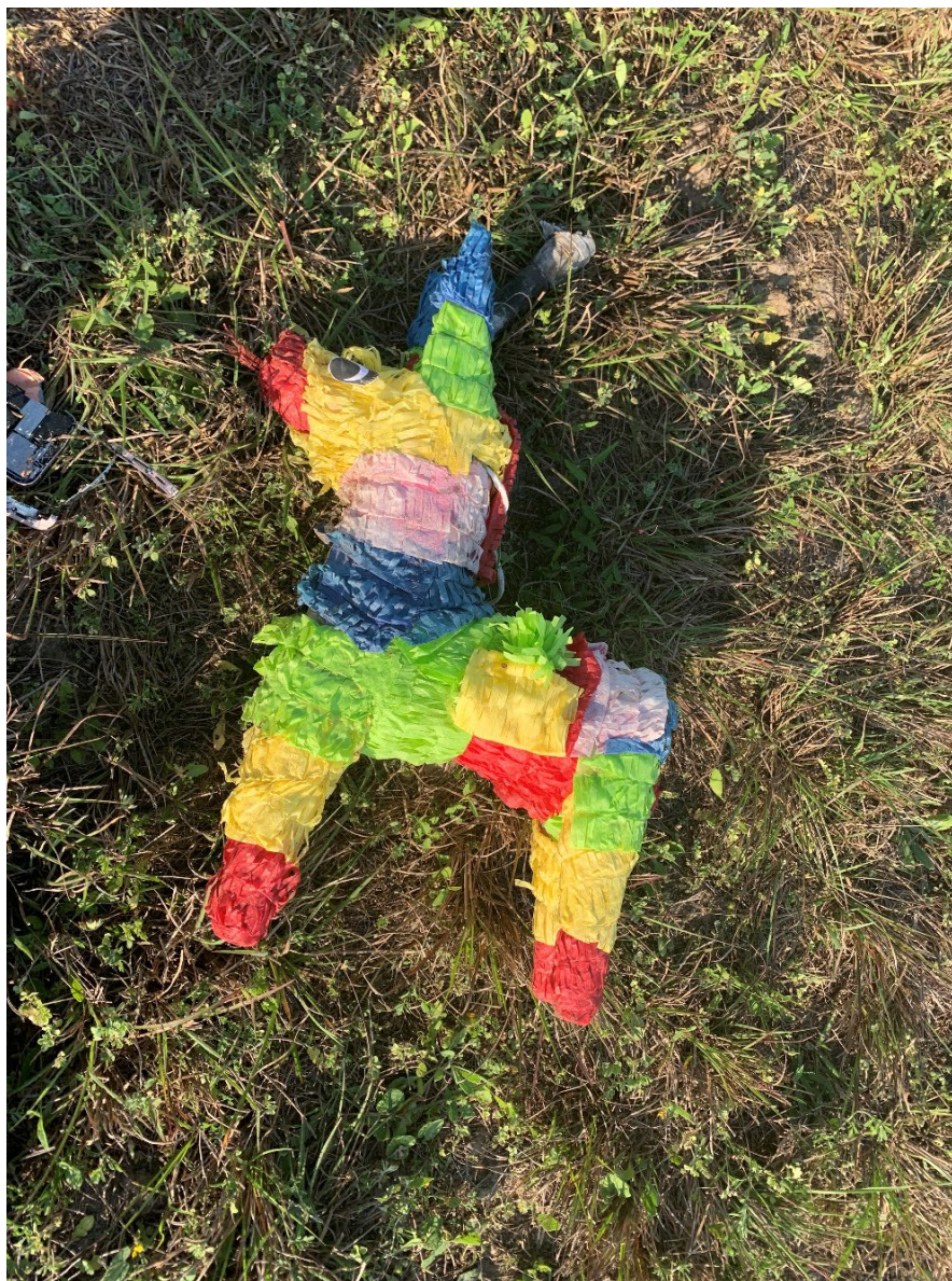
Photograph 14 - View of the pinata found at the accident site.