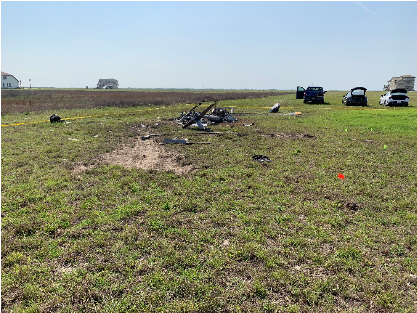
Photograph 3 - Overall rear view of the helicopter.