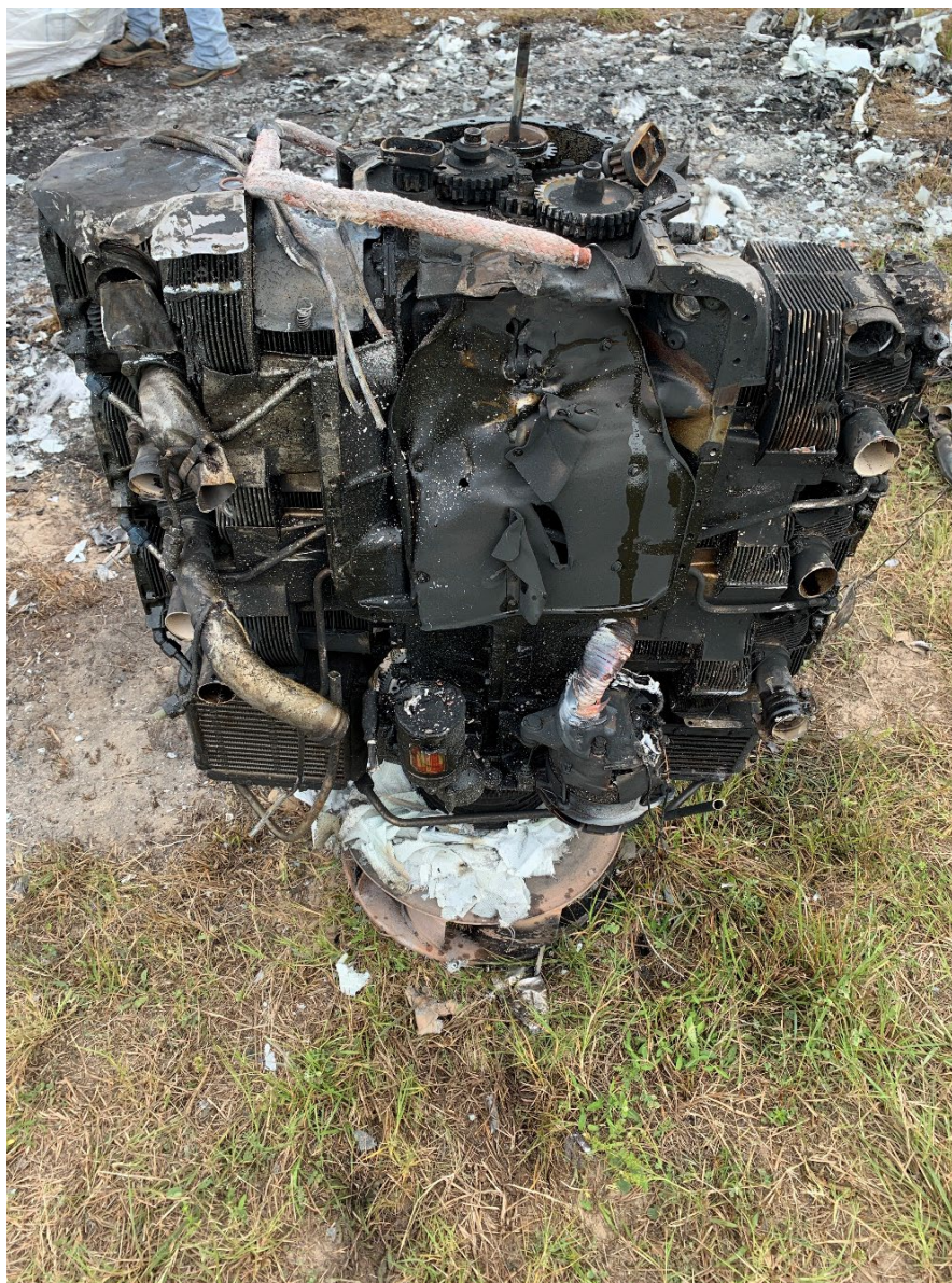
Photograph 12 - View of the bottom of the engine.