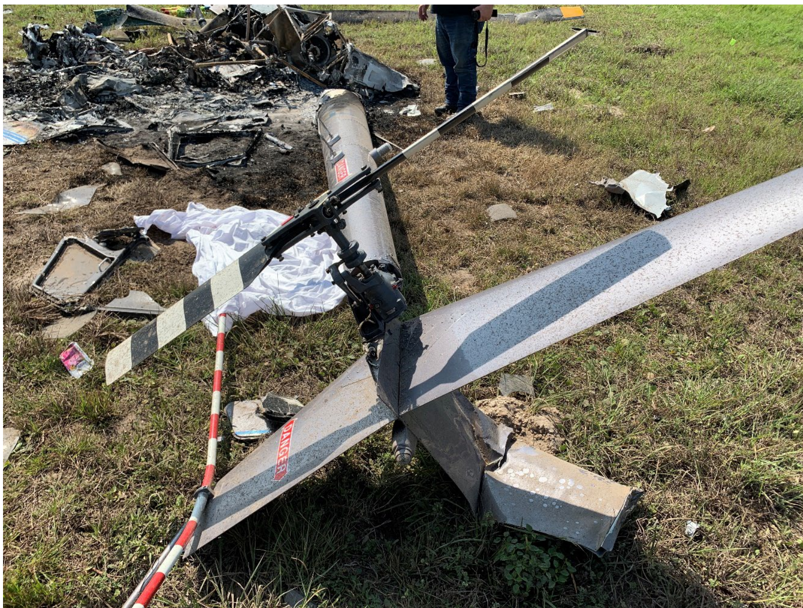
Photograph 7 - View of the tail rotor system.