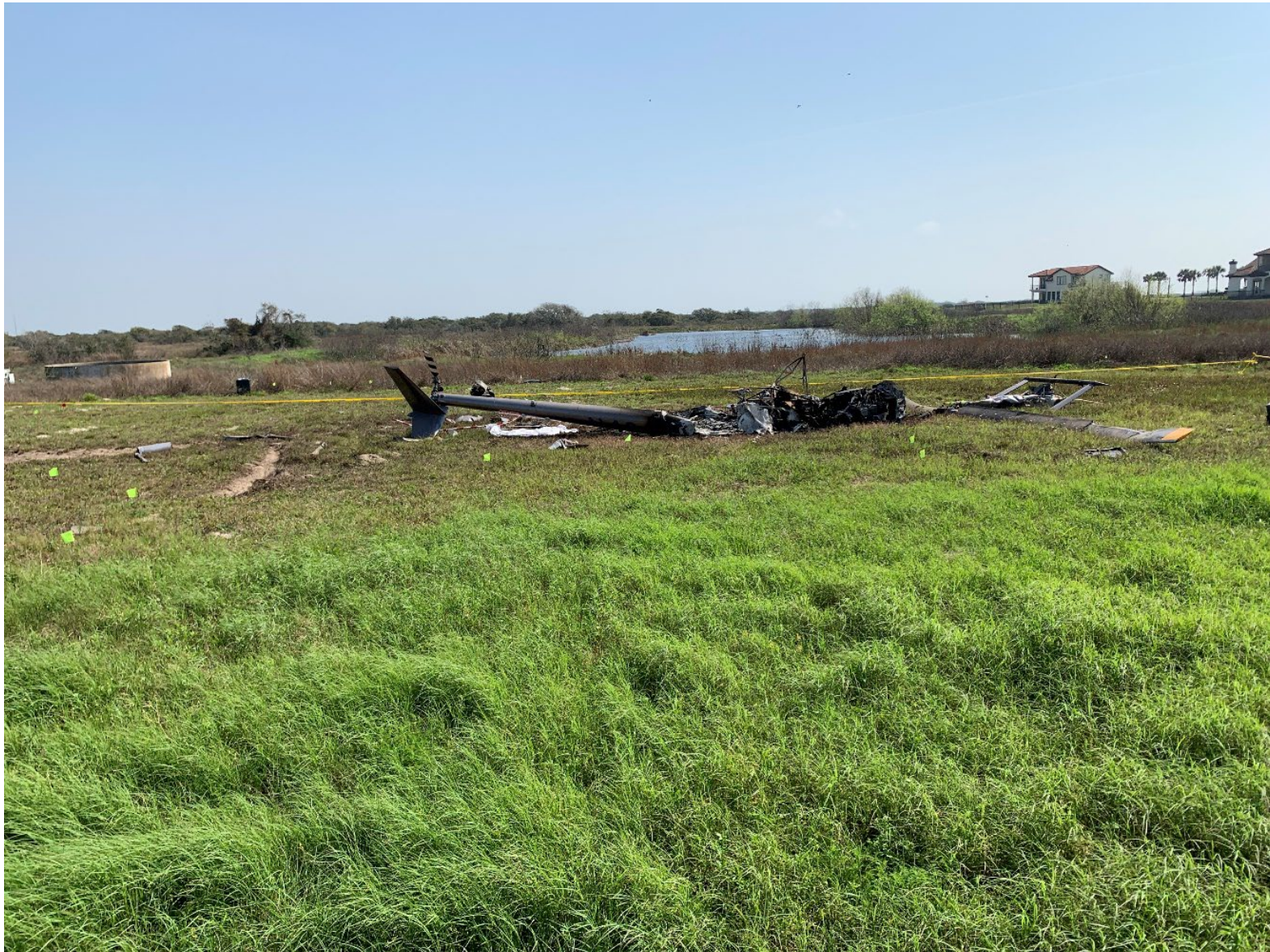
Photograph 4 - Overall side view of the helicopter.