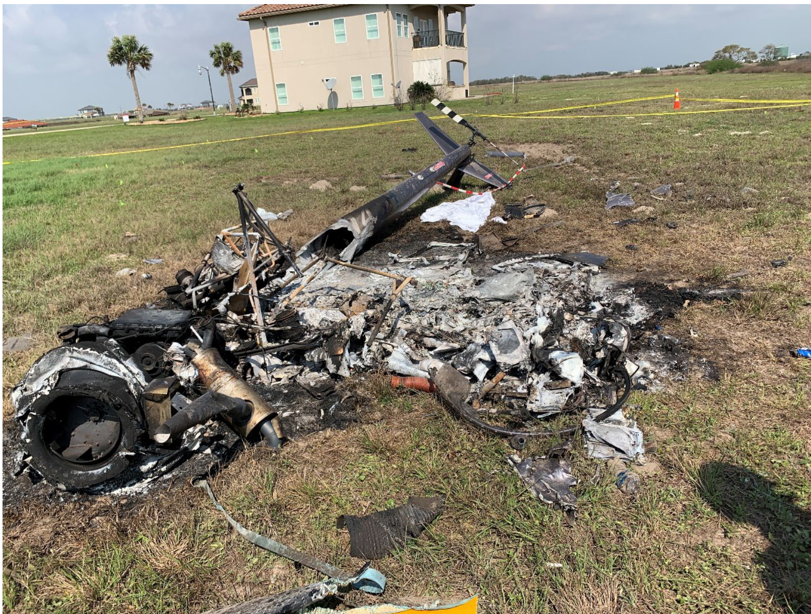
Photograph 5 - View of the cockpit and cabin areas.