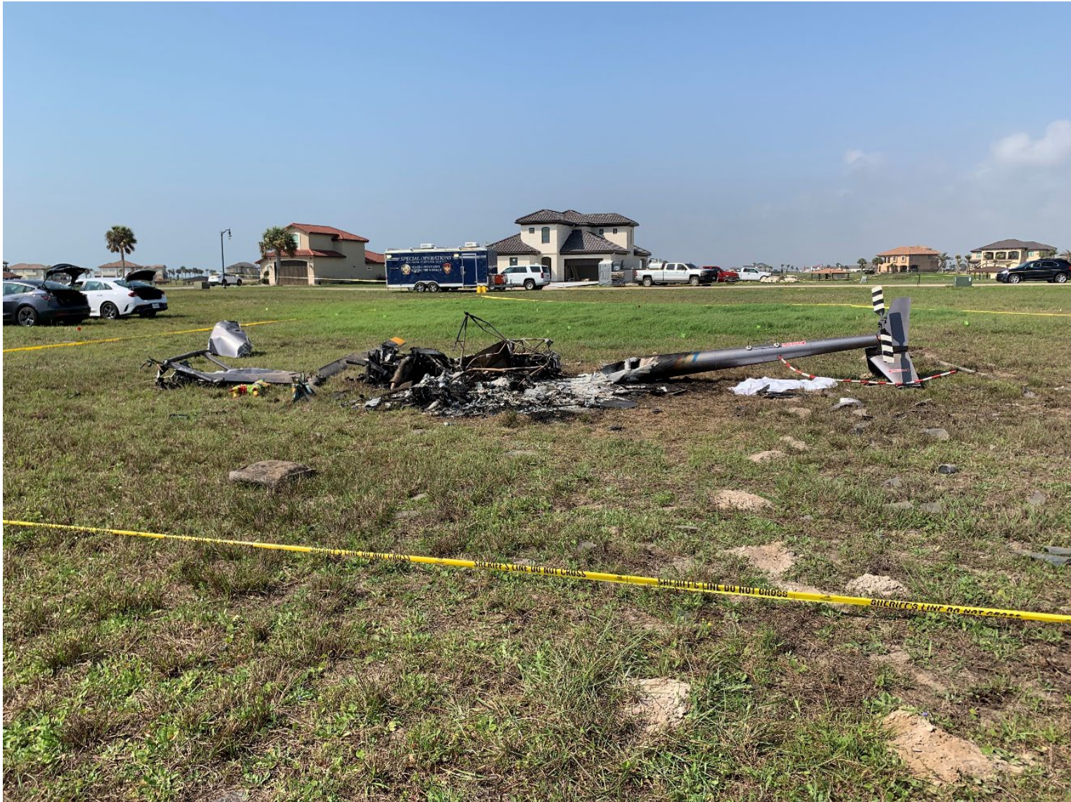
Photograph 2 - Overall side view of the helicopter.