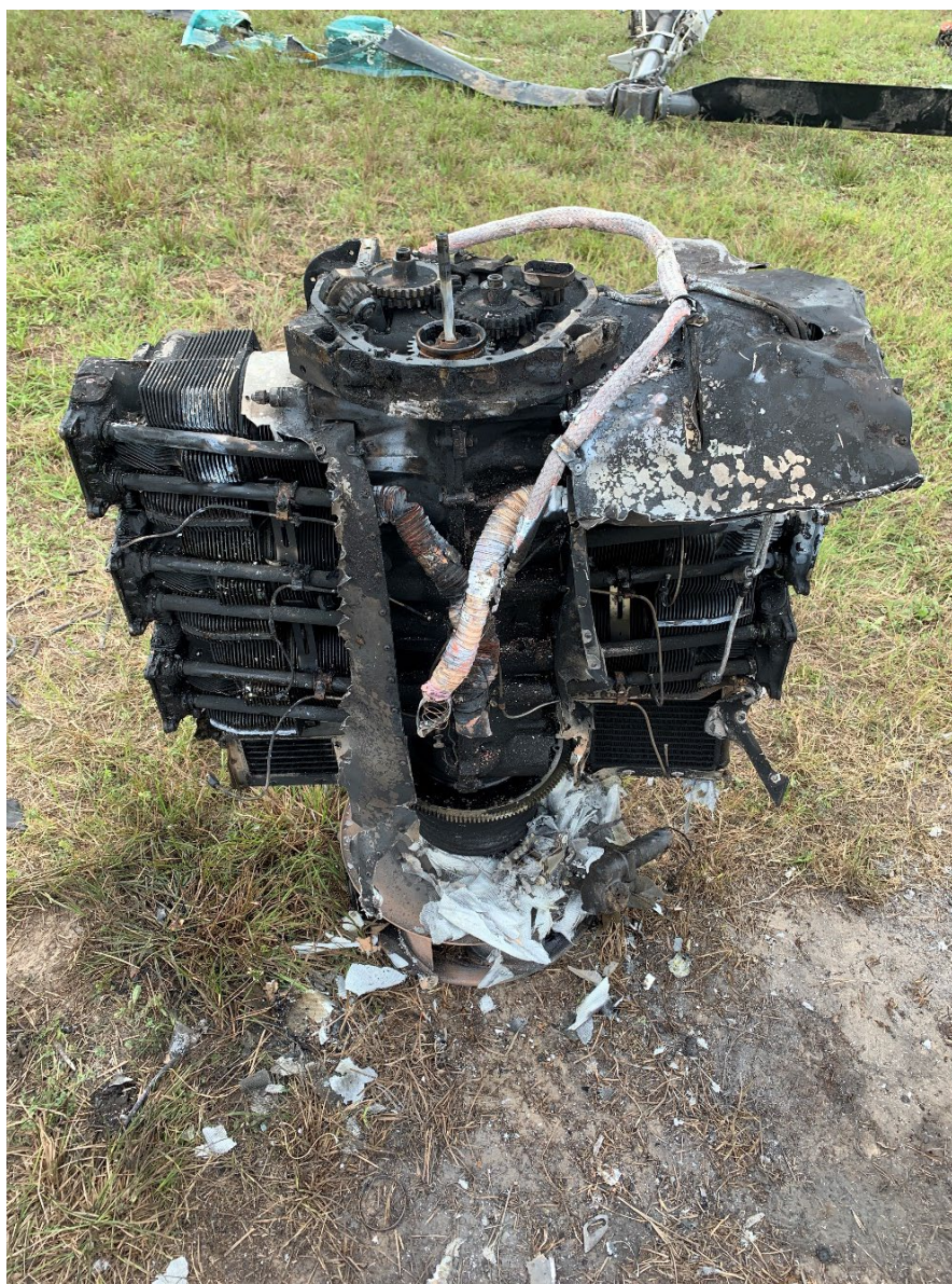
Photograph 13 - View of the top of the engine.