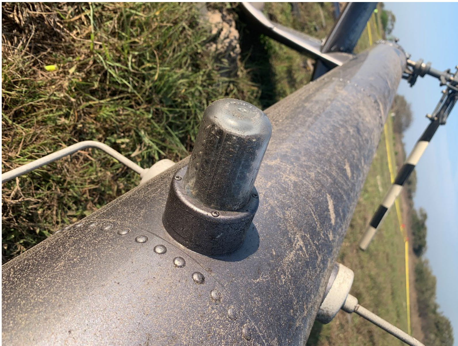
Photograph 10 - View of the anti-collision (strobe) light.