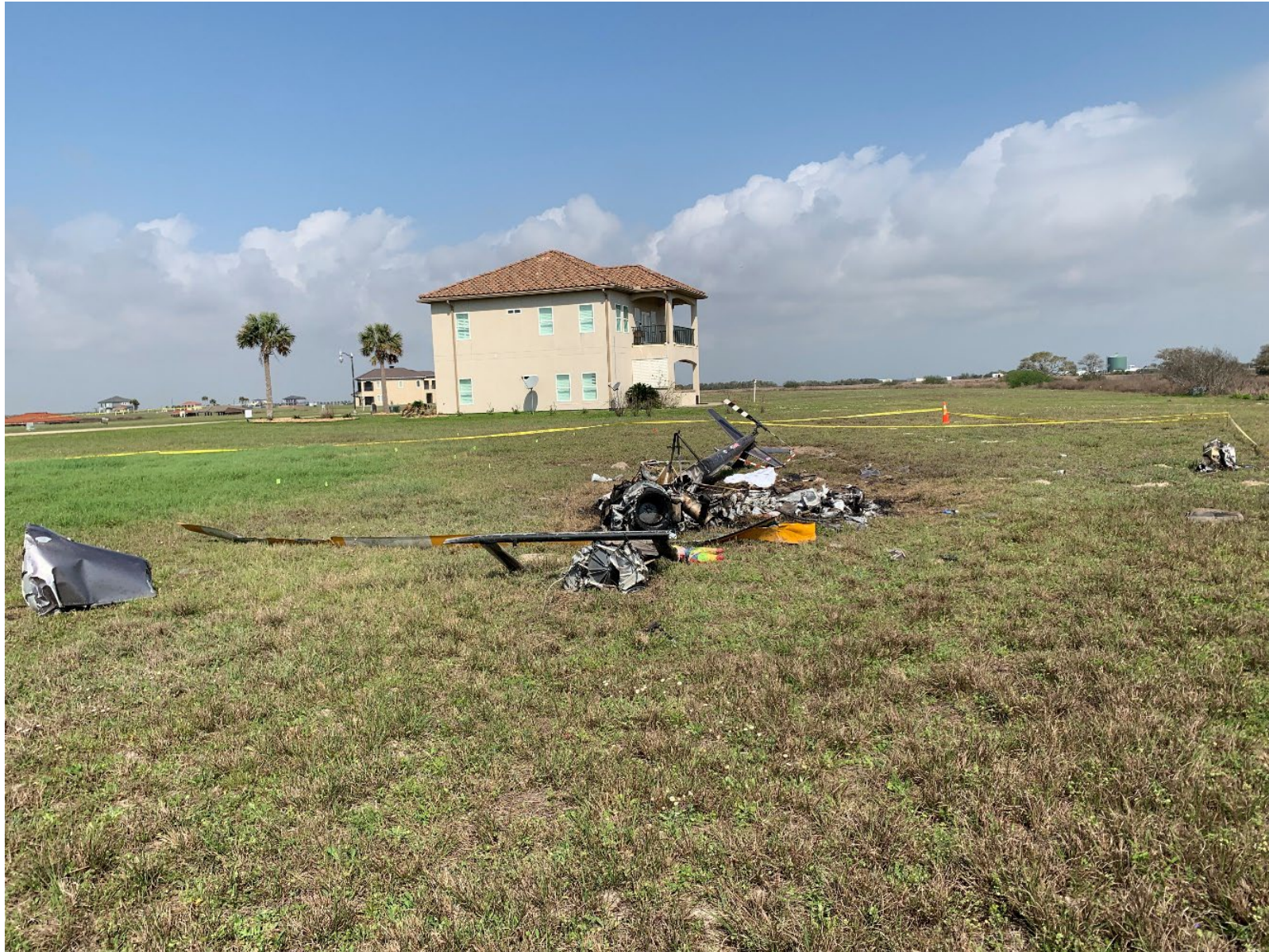
Photograph 1 - Overall front view of the helicopter.