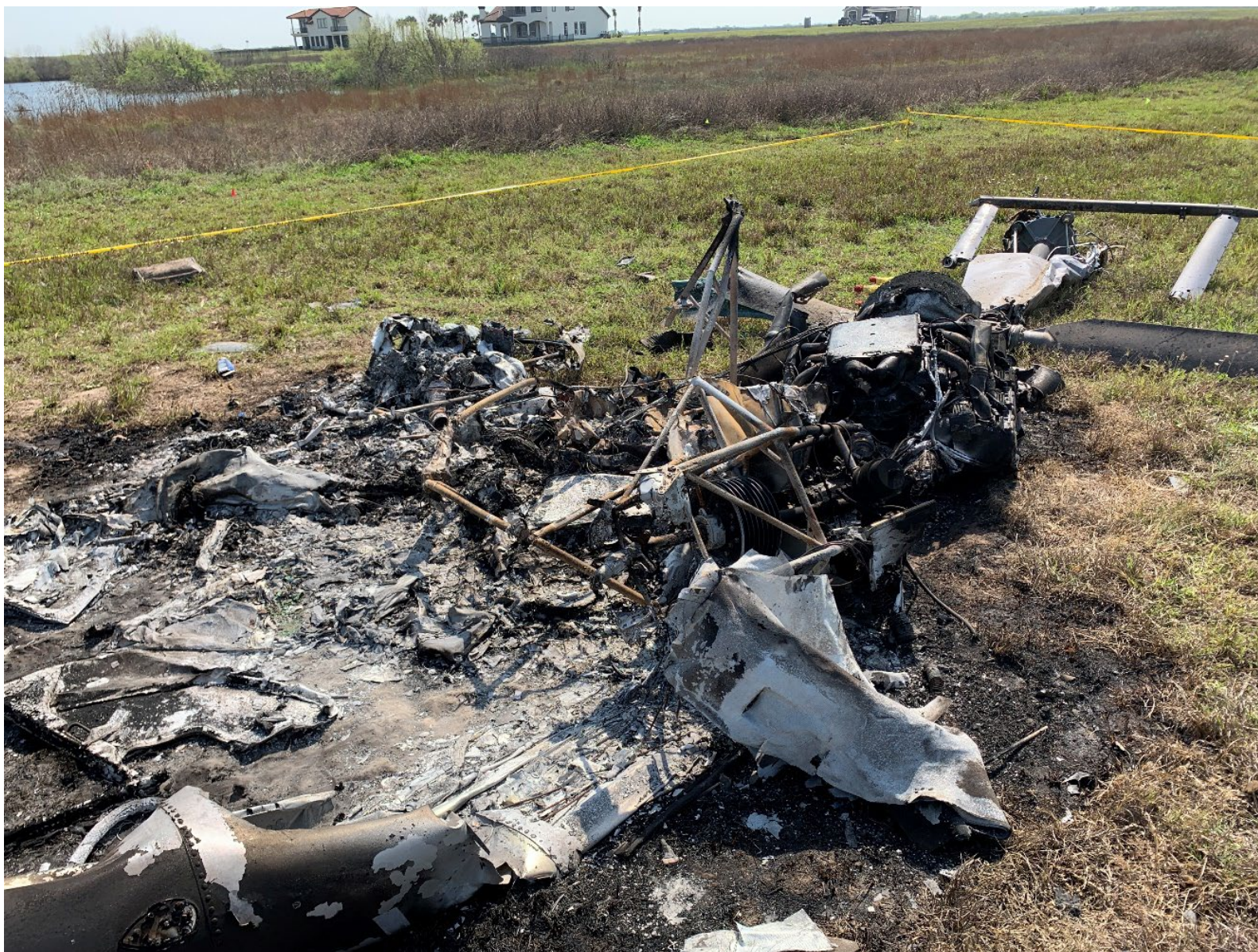
Photograph 6 - View of the cockpit and cabin areas.