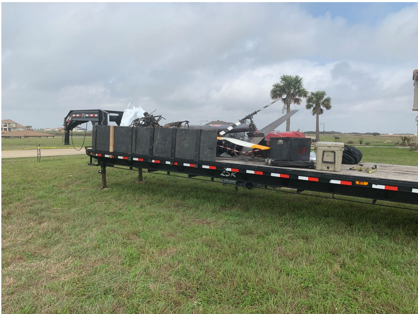
Photograph 15 - View of the helicopter after it was recovered from the accident site.