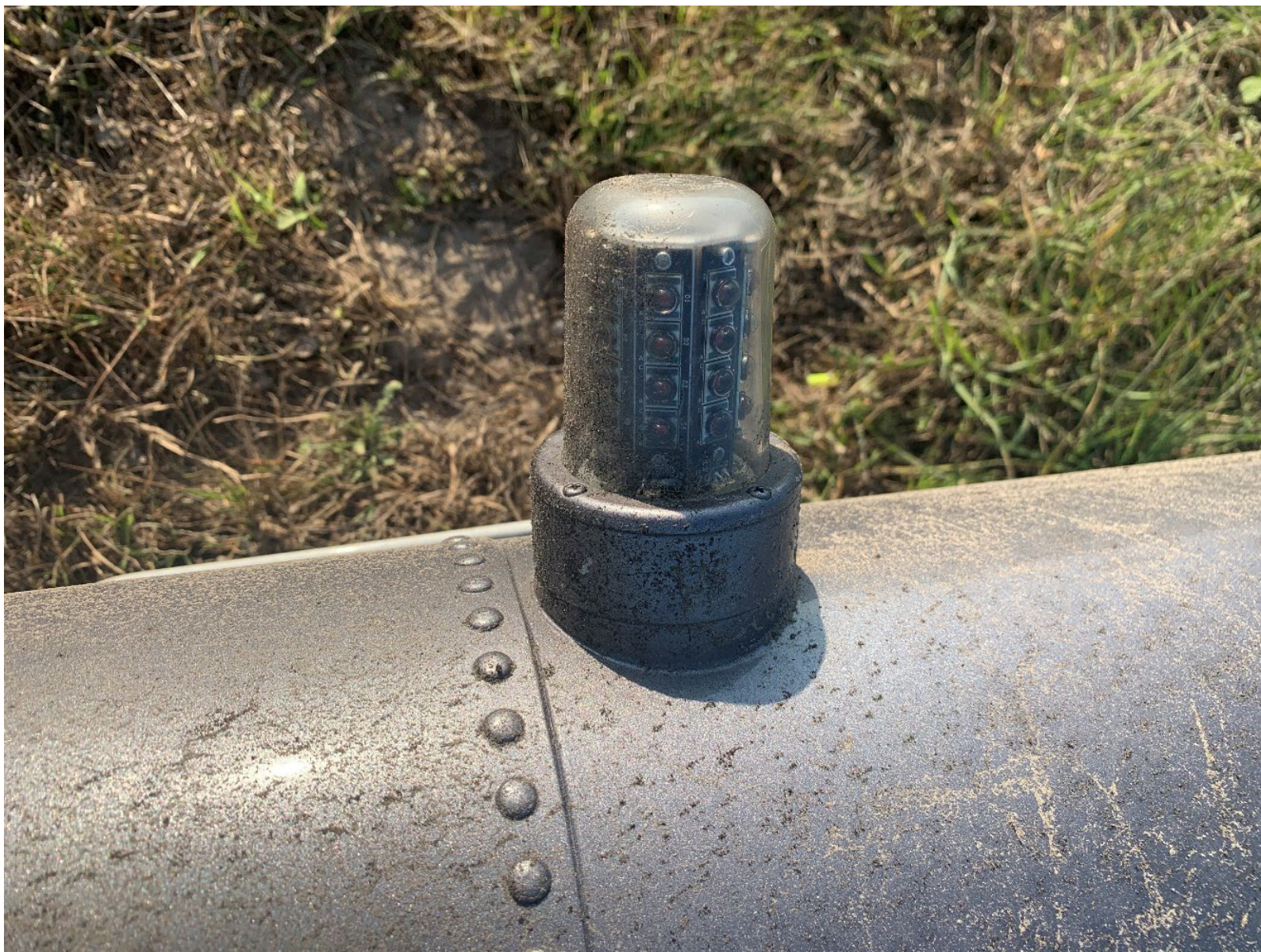
Photograph 11 - View of the anti-collision (strobe) light.