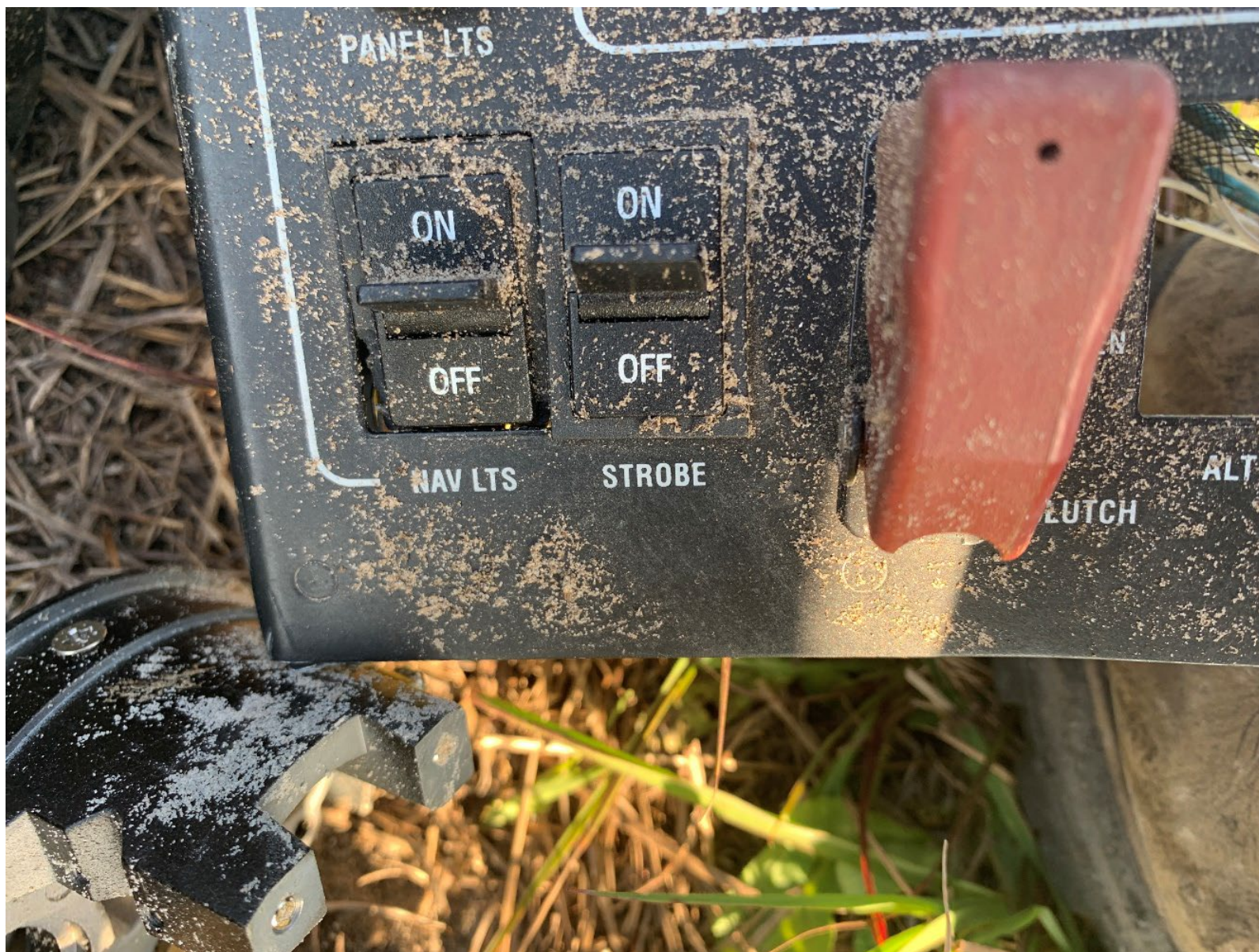
Photograph 9 - View of the navigation lights and anti-collision (strobe) light switches.