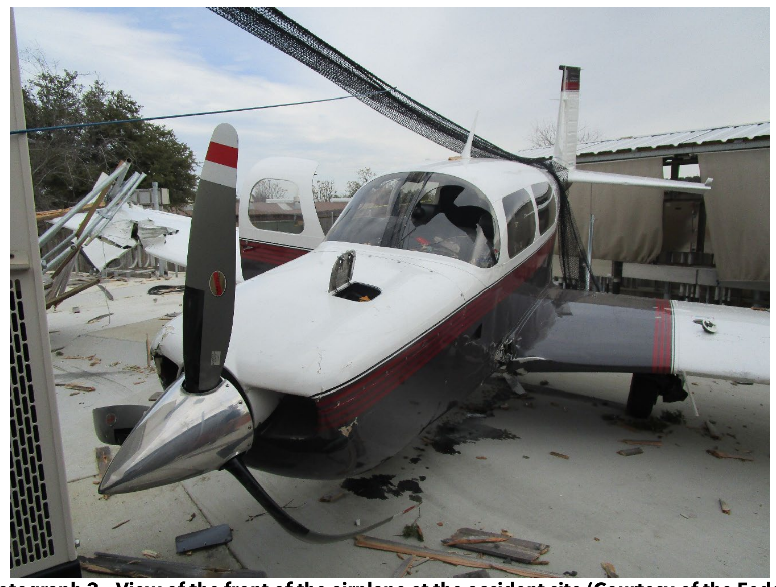
Photograph 3 - View of the front of the airplane at the accident site