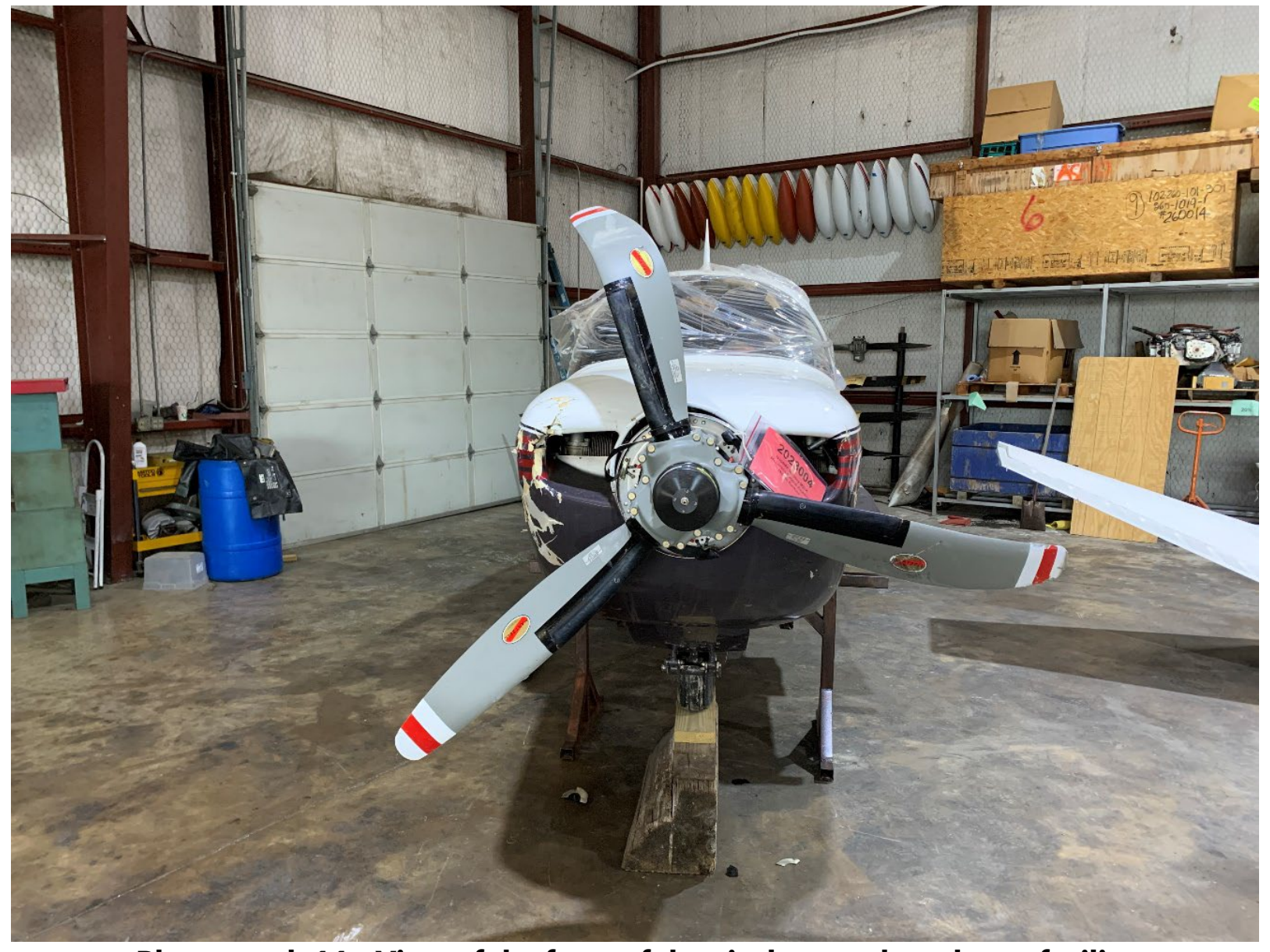
Photograph 11 - View of the front of the airplane at the salvage facility