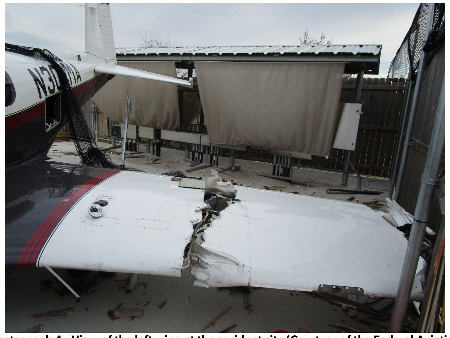
Photograph 4 - View of the left wing at the accident site