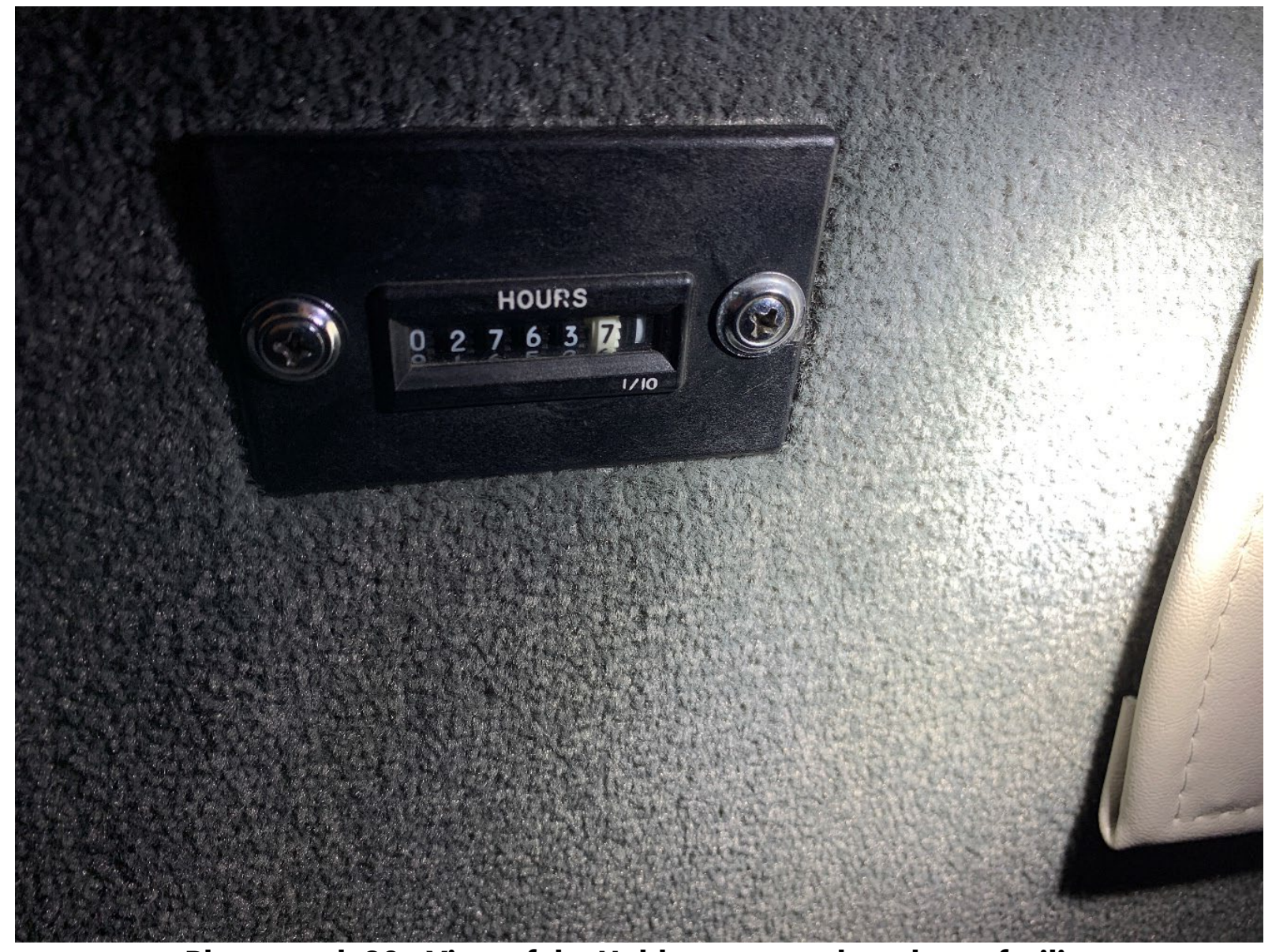
Photograph 20 - View of the Hobbs meter at the salvage facility