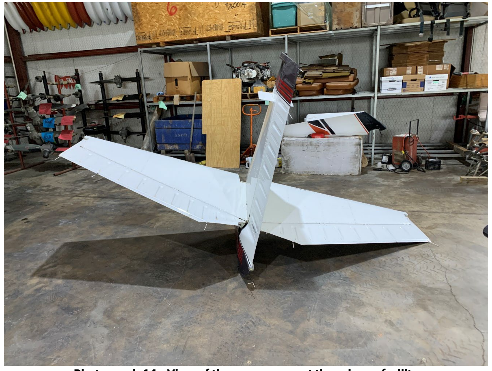
Photograph 14 - View of the empennage at the salvage facility