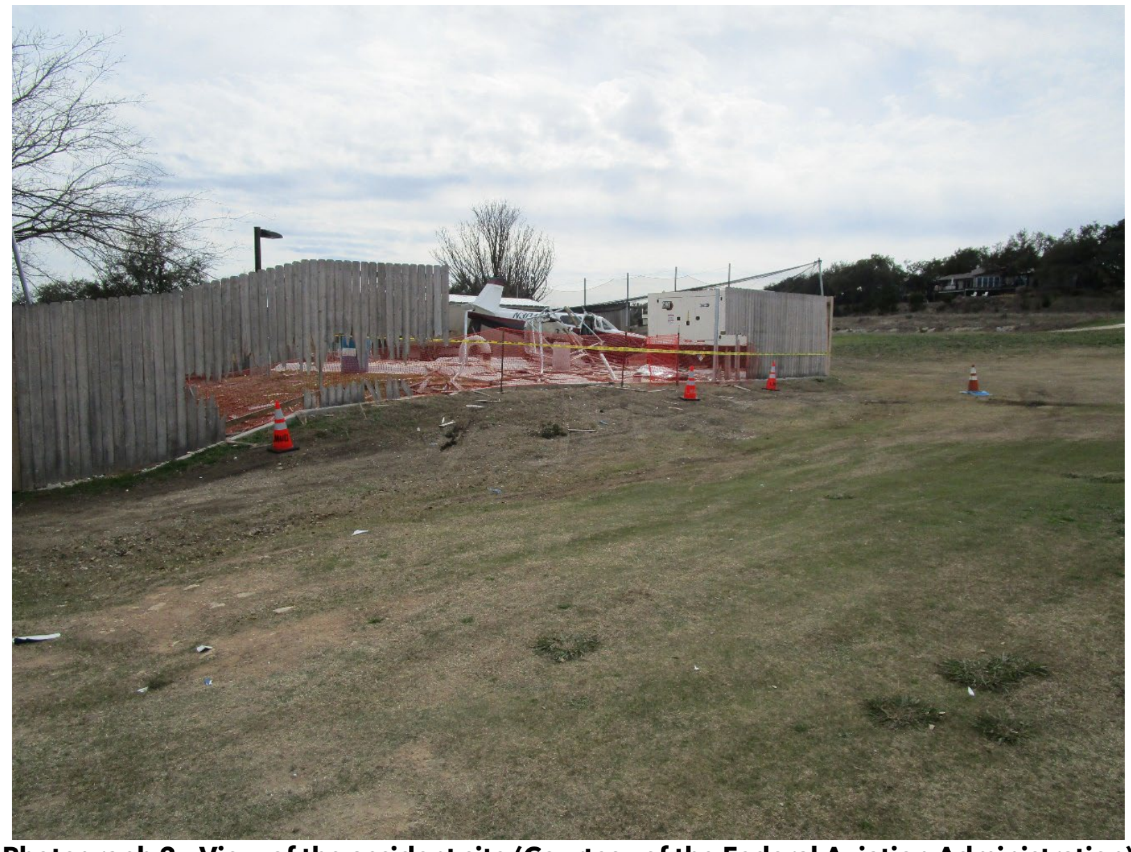
Photograph 2 - View of the accident site (Courtesy of the Federal Aviation Administration)