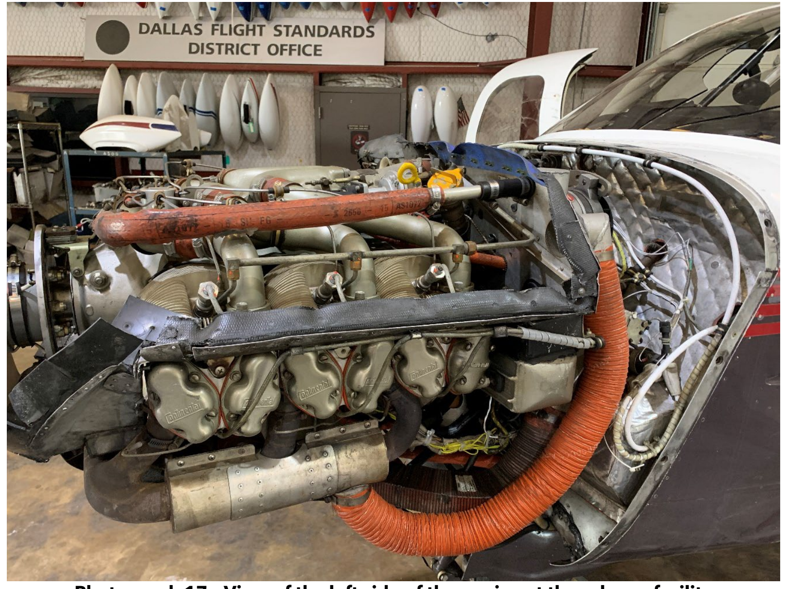
Photograph 17 - View of the left side of the engine at the salvage facility