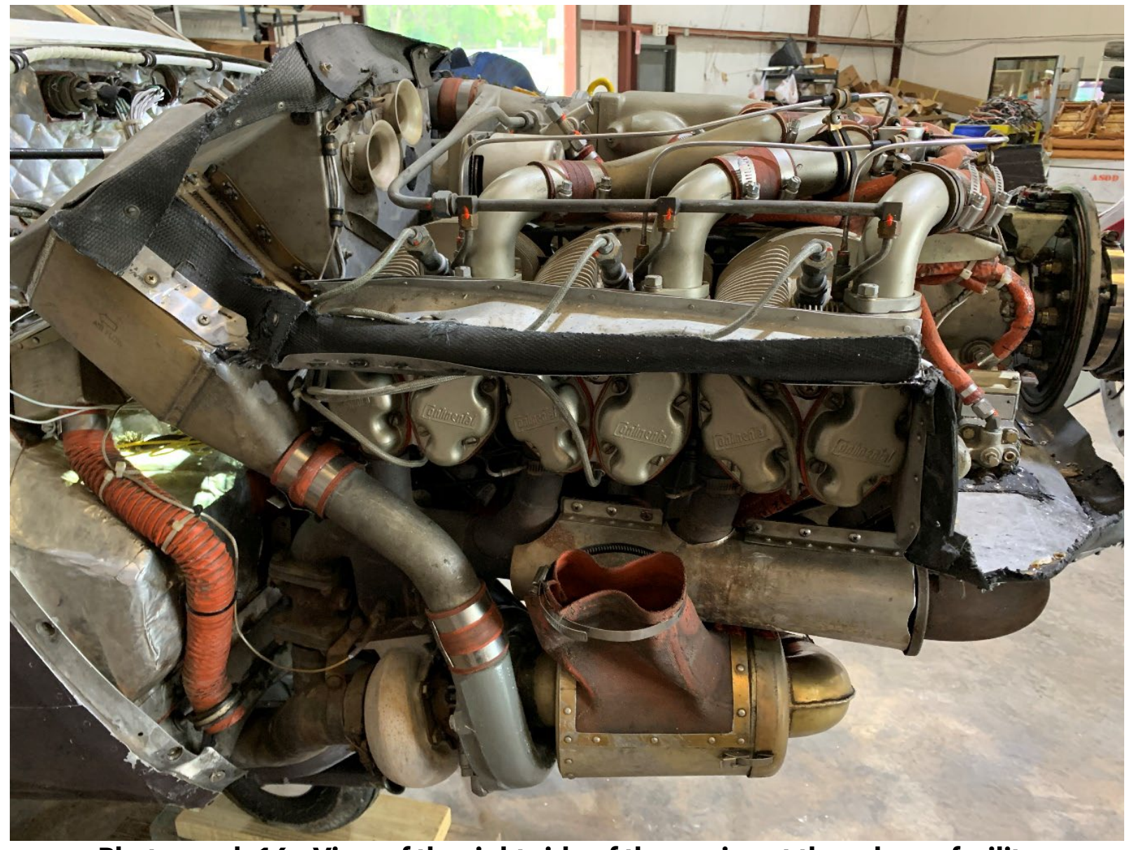
Photograph 16 - View of the right side of the engine at the salvage facility