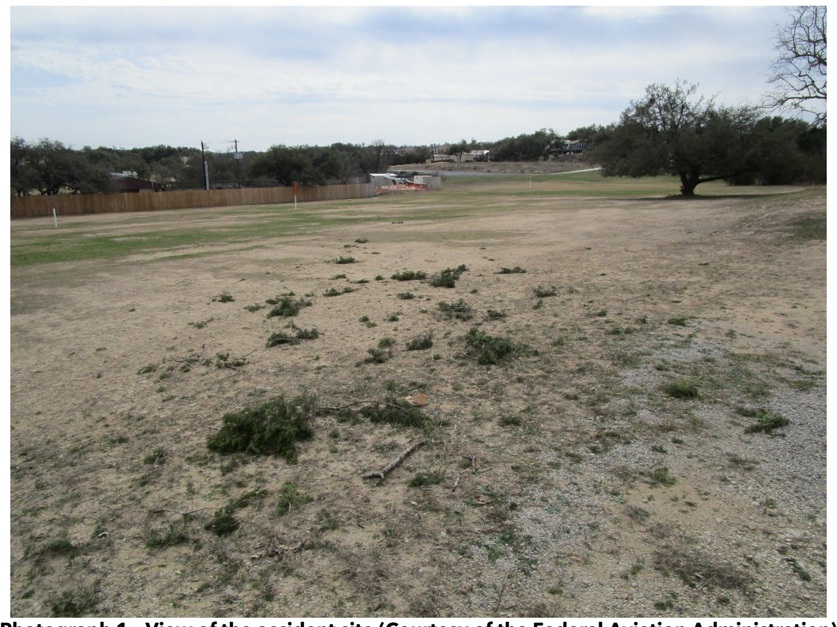
Photograph 1 - View of the accident site