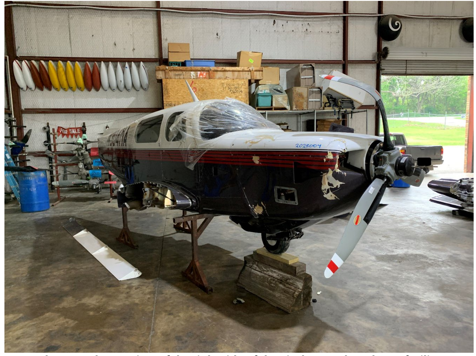
Photograph 12 - View of the right side of the airplane at the salvage facility