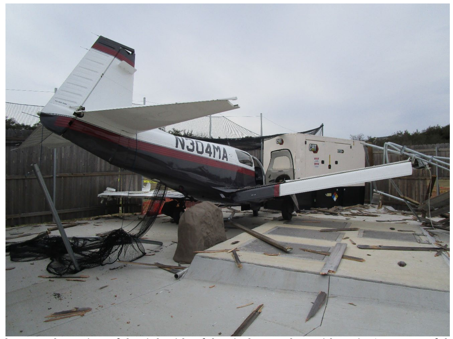
Photograph 6 - View of the right side of the airplane at the accident site