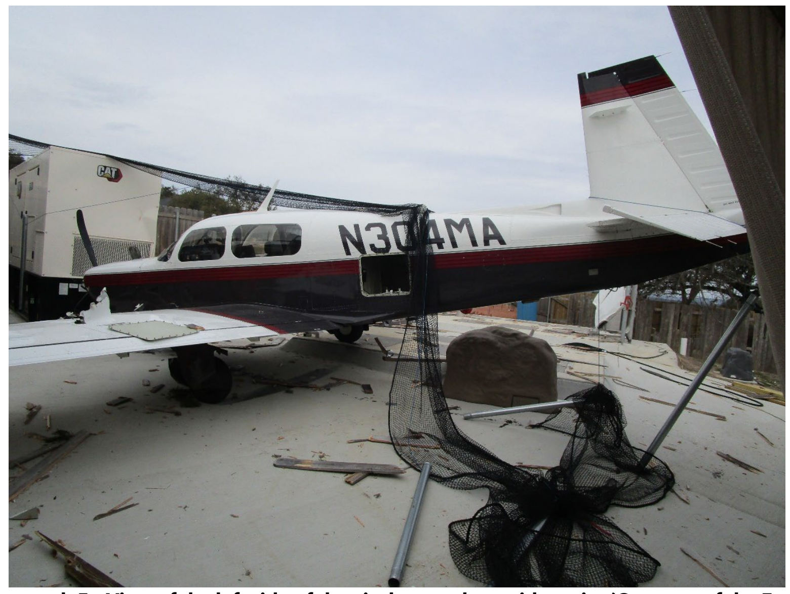
Photograph 5 - View of the left side of the airplane at the accident site