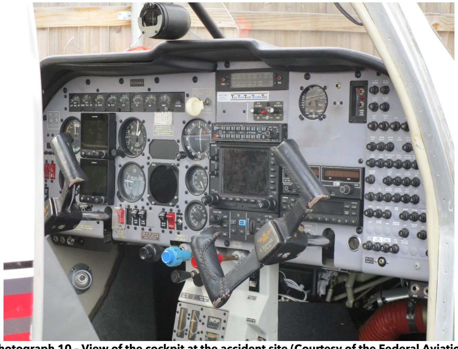
Photograph 10 - View of the cockpit at the accident site