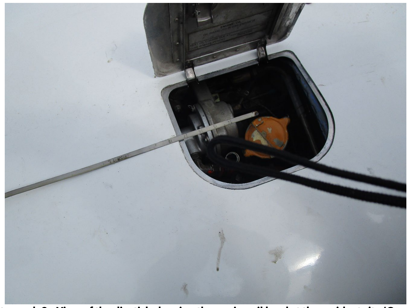
Photograph 9 - View of the dipstick showing the engine oil level at the accident site