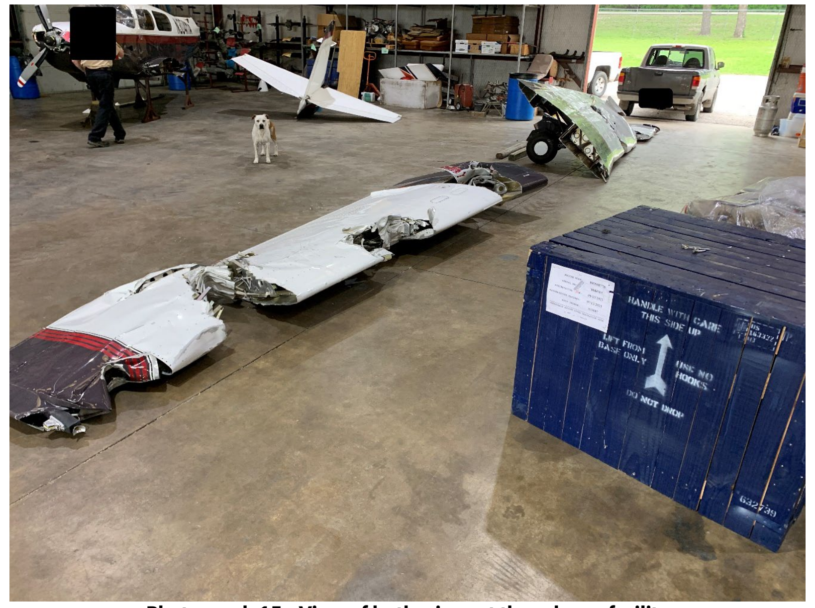
Photograph 15 - View of both wings at the salvage facility