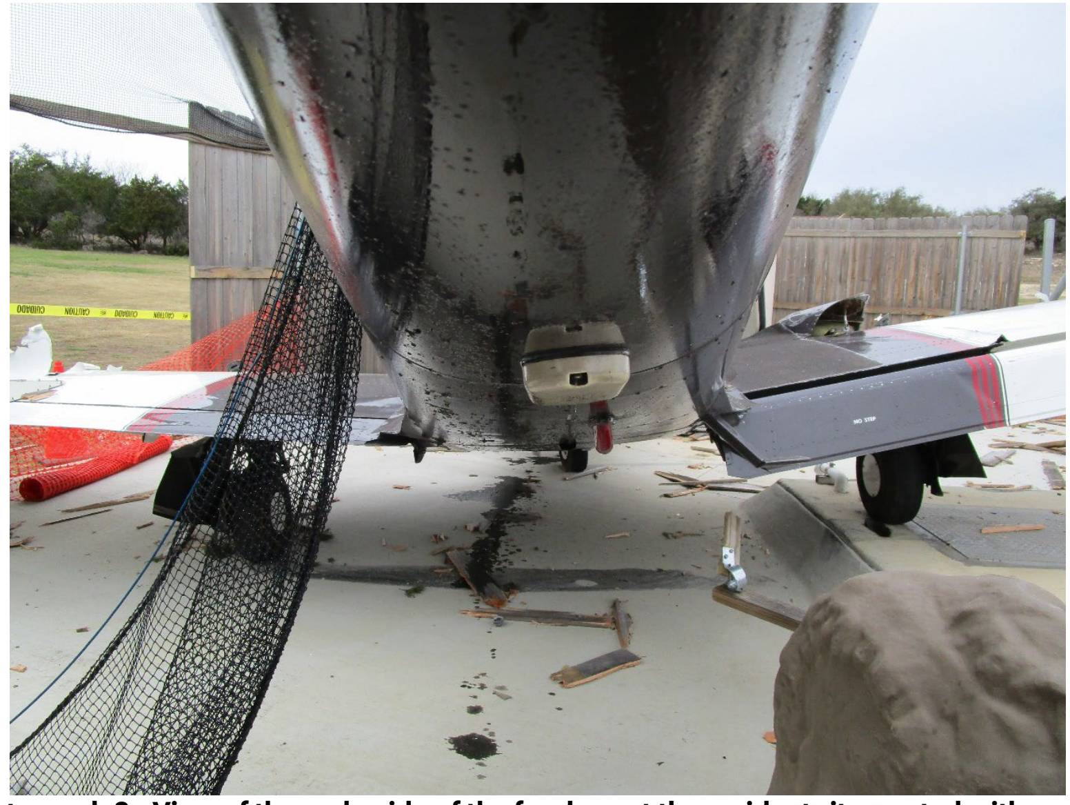
Photograph 8 - View of the underside of the fuselage at the accident site, coated with engine oil