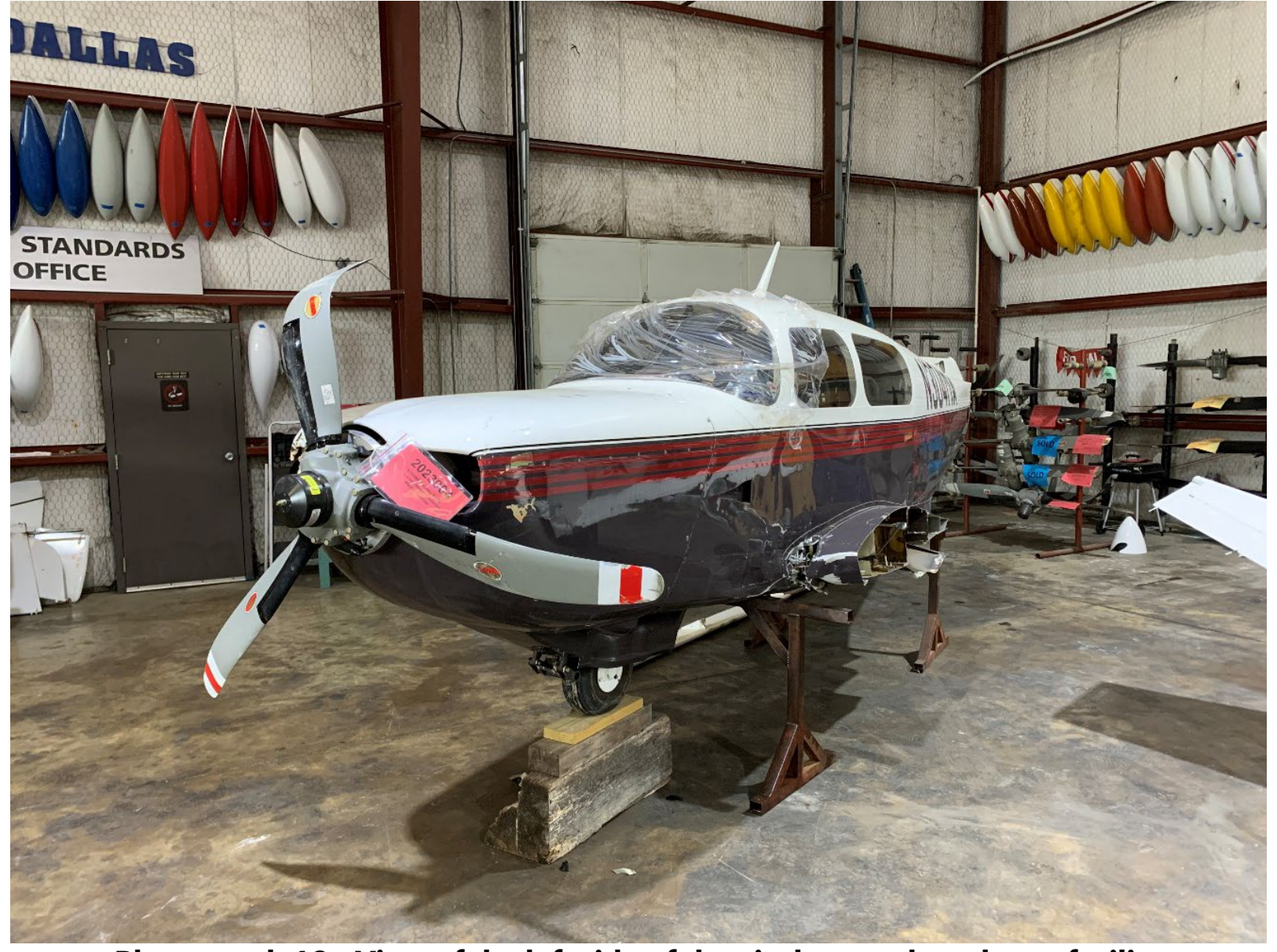
Photograph 13 - View of the left side of the airplane at the salvage facility