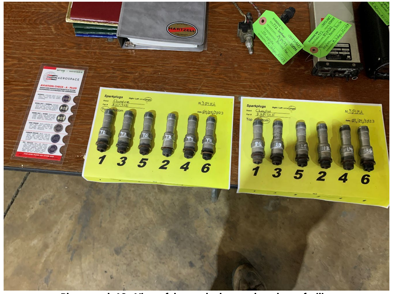
Photograph 19 - View of the spark plugs at the salvage facility