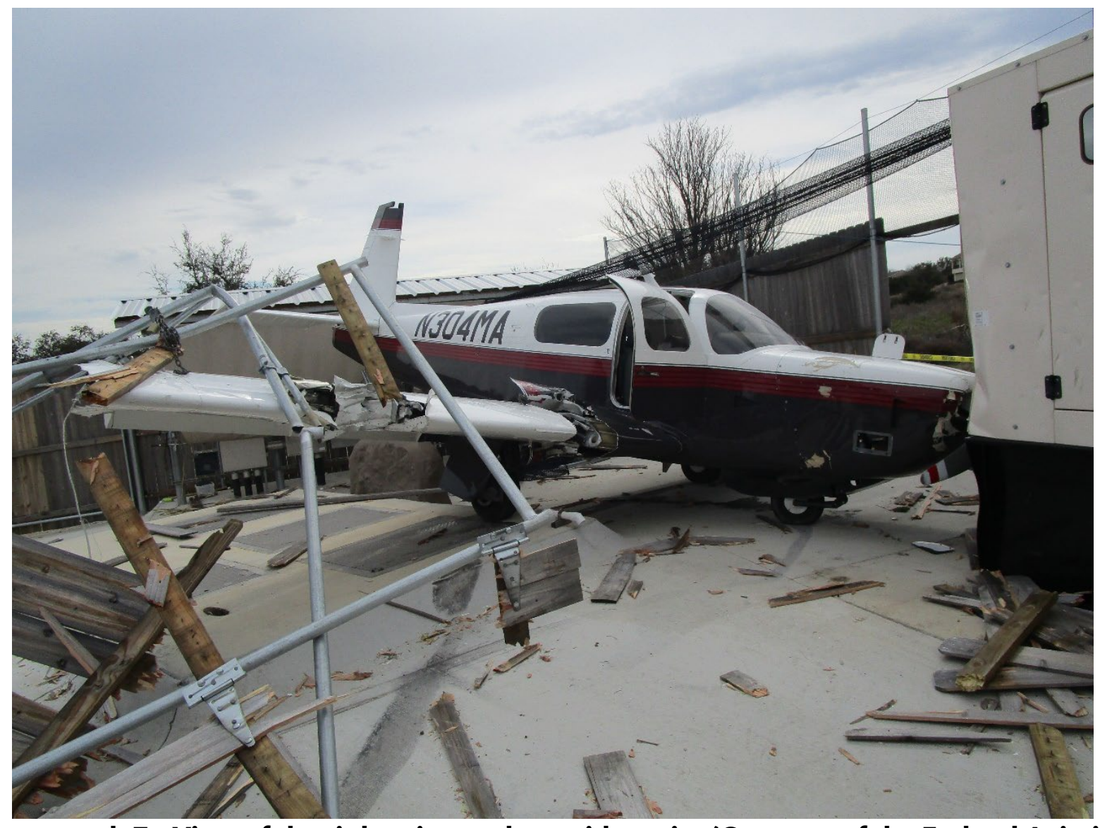
Photograph 7 - View of the right wing at the accident site