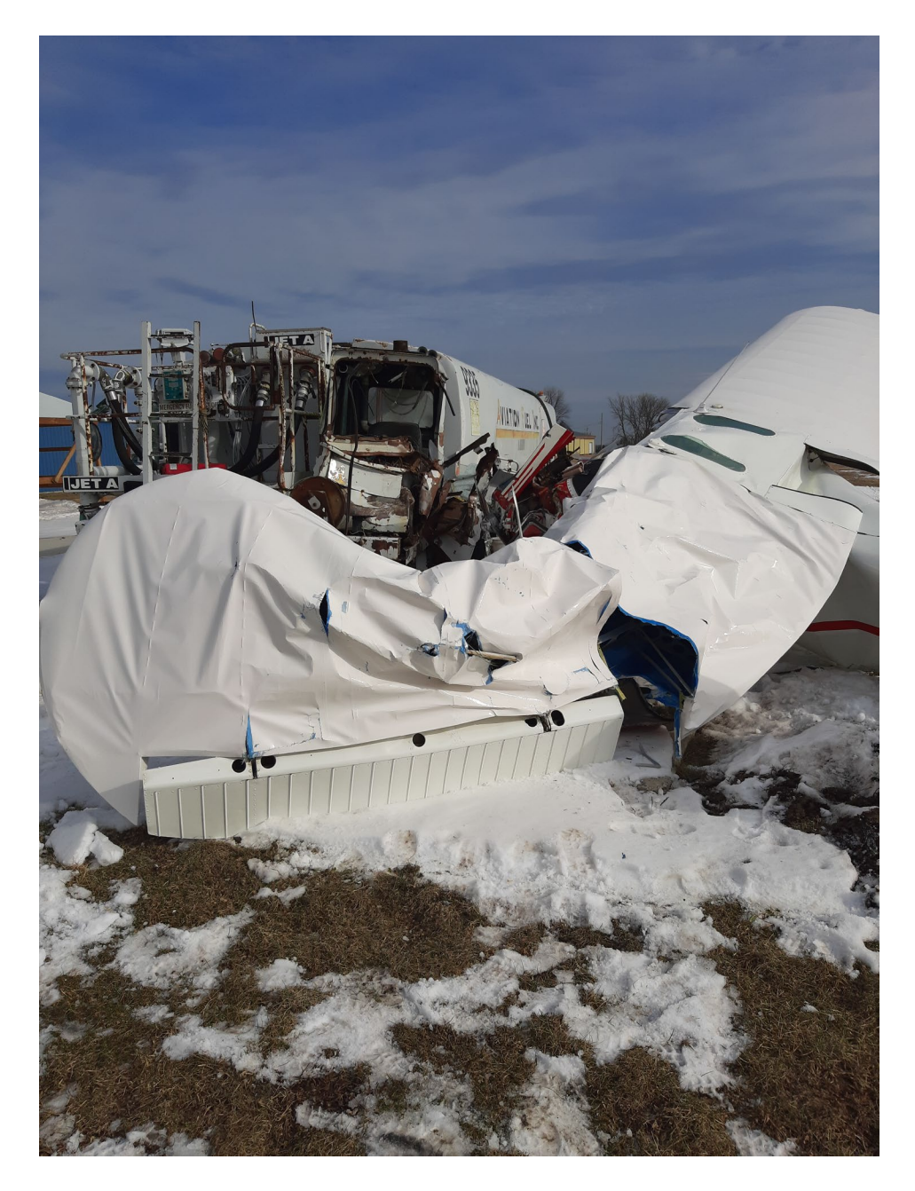
Photo 2 – View of the fuel truck and the airplane (courtesy of the Racine County Sheriff's Office).