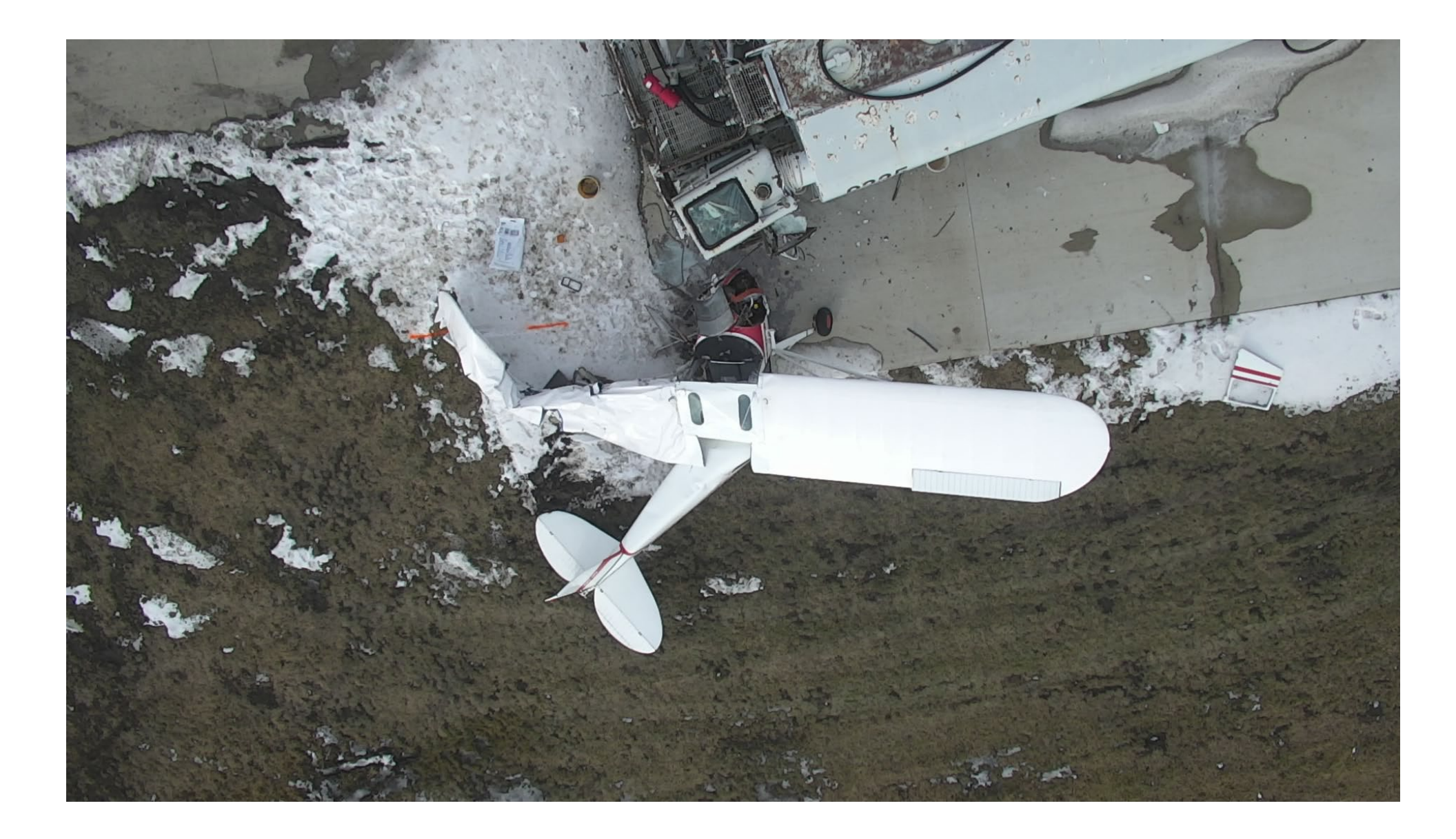
Photo 6 – Aerial view of the fuel truck and the airplane.