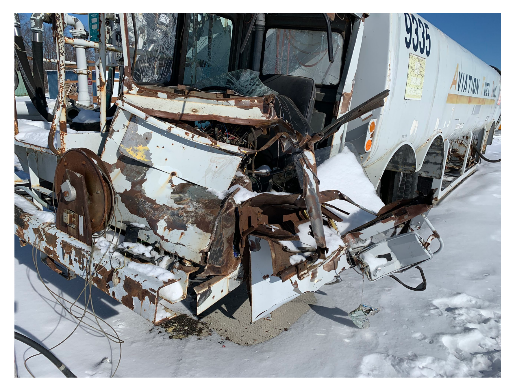
Photo 9 – View of the damage that was sustained to the fuel truck.