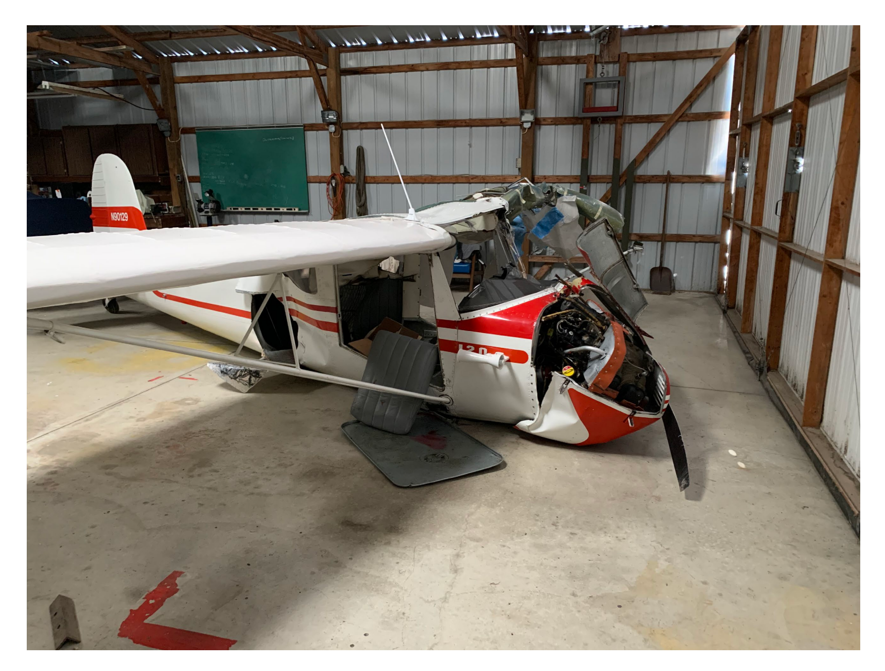
Photo 7 – View of the airplane after it was recovered from the accident site.