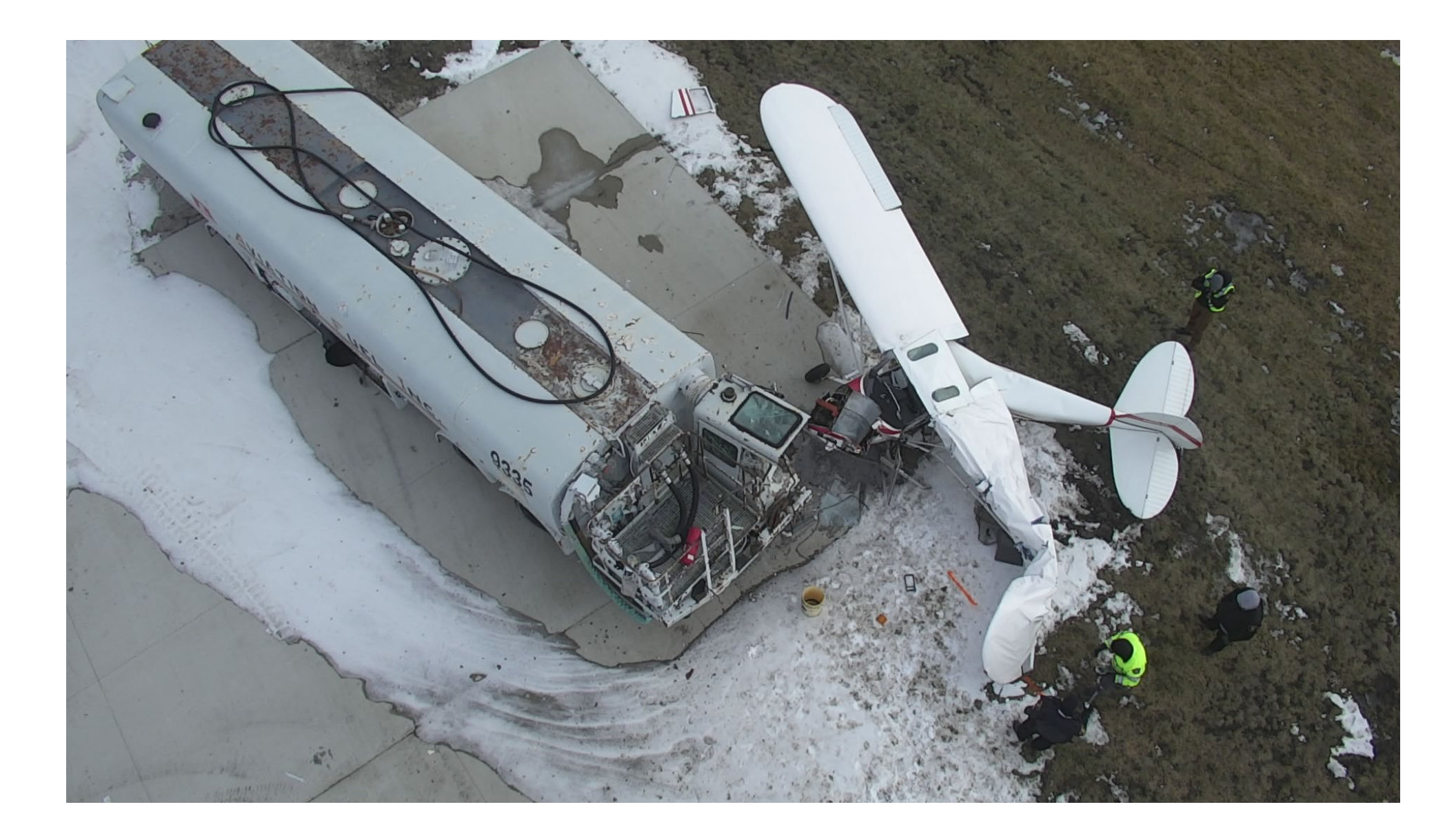
Photo 5 – Aerial view of the fuel truck and the airplane.