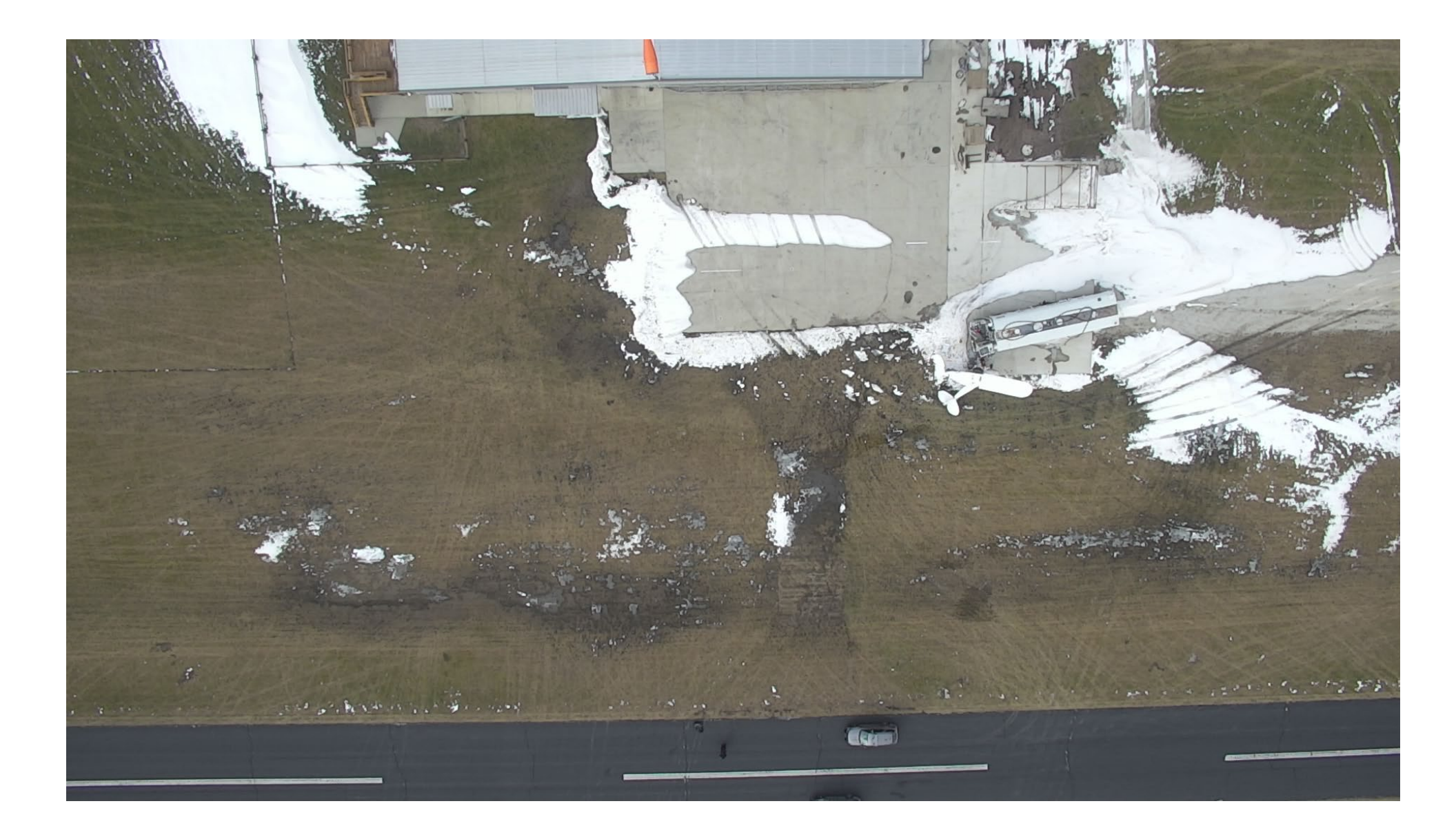
Photo 4 – Aerial view of the fuel truck and the airplane (courtesy of the Racine County Sheriff's Office).