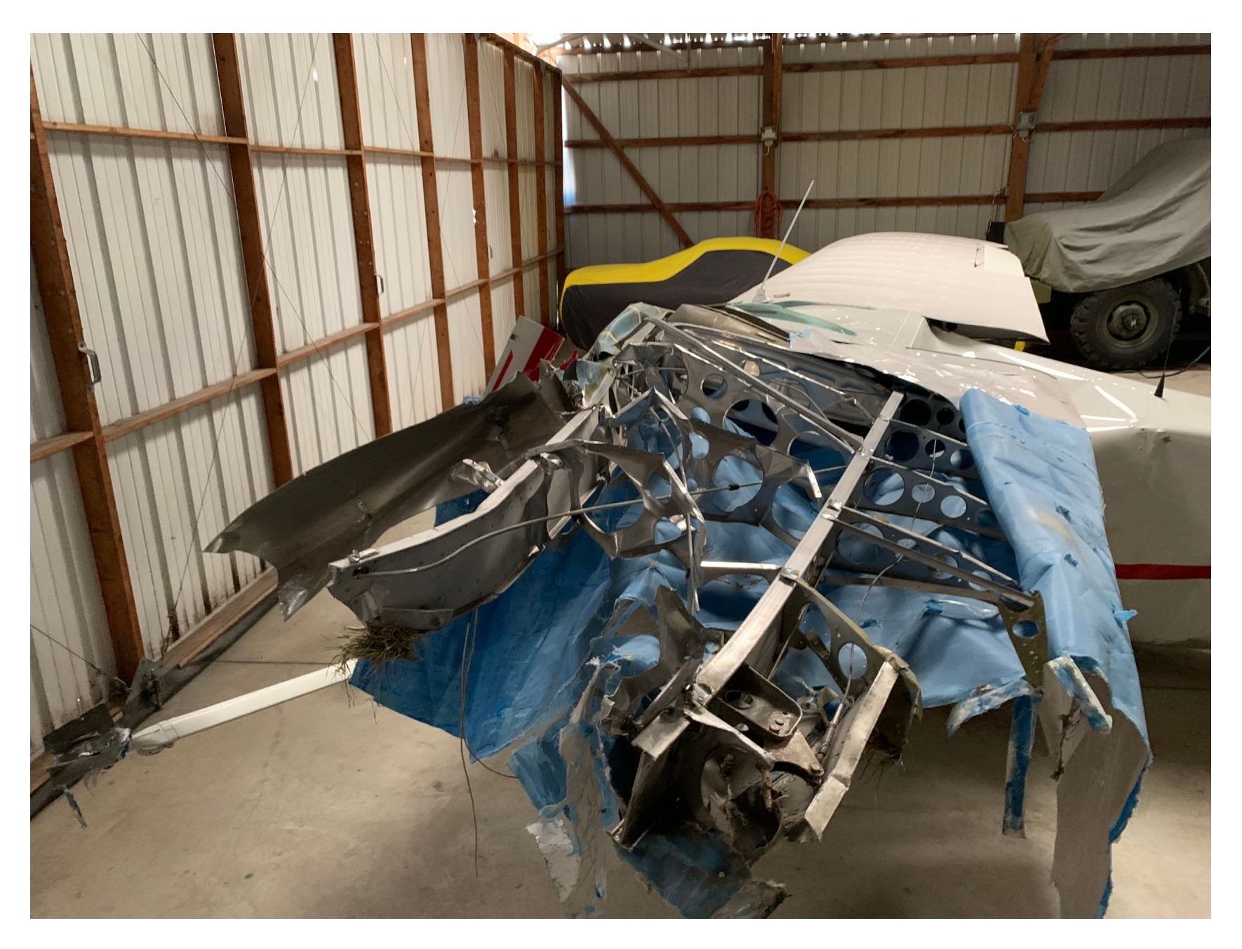
Photo 8 – View of the airplane after it was recovered from the accident site.