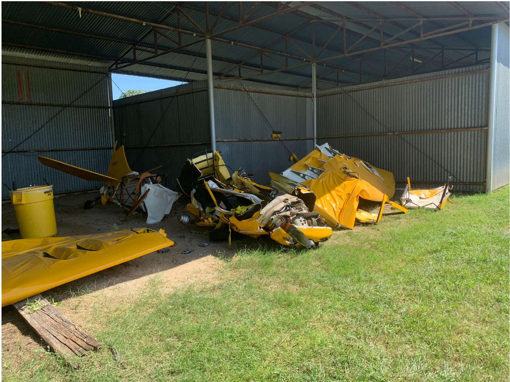
Photo 6 – View of the wreckage laid out after it was recovered from the accident site.