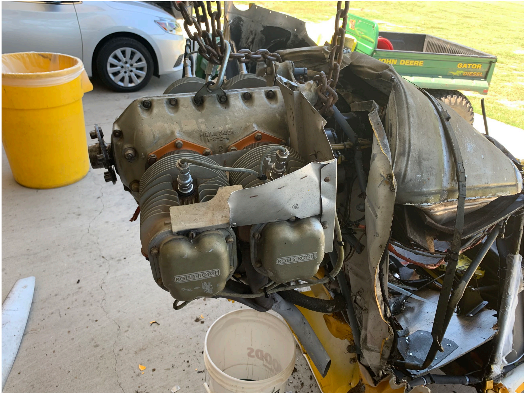
Photo 10 – View of the left side of the engine during the examination.