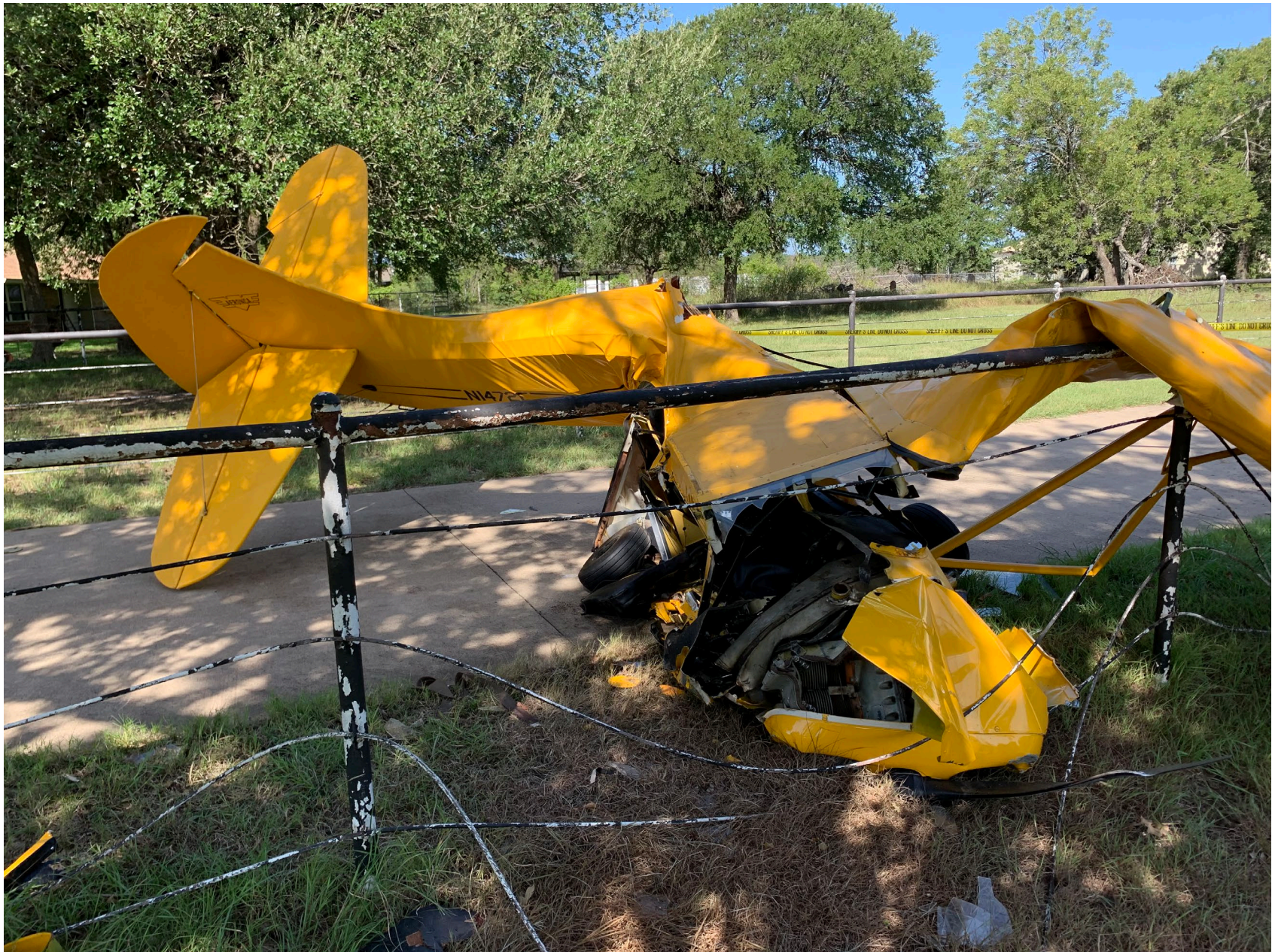
Photo 5 – Close up view of the front of the airplane at the accident site.