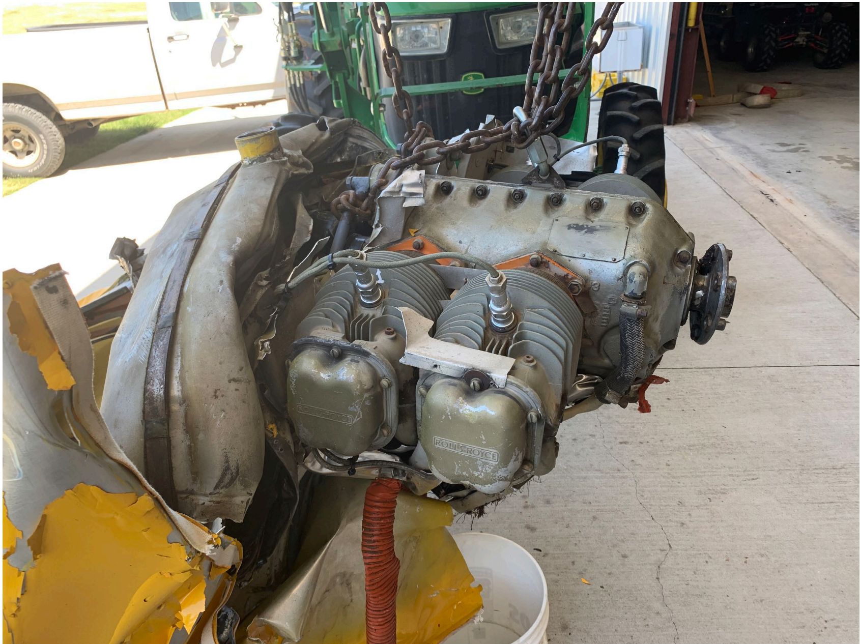
Photo 8 – View of the right side of the engine during the examination.