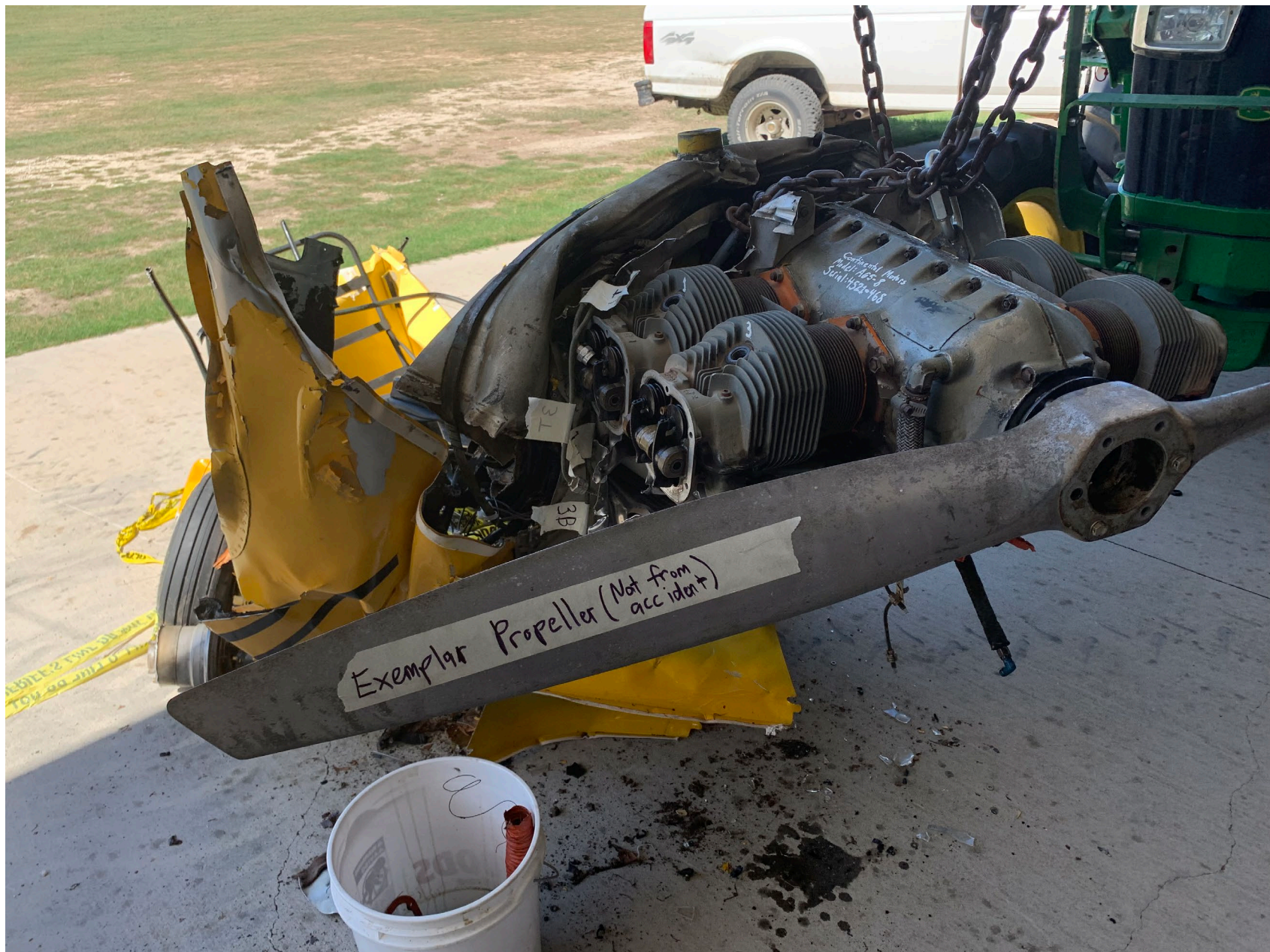
Photo 12 – View of an exemplar propeller installed on the engine during the examination.