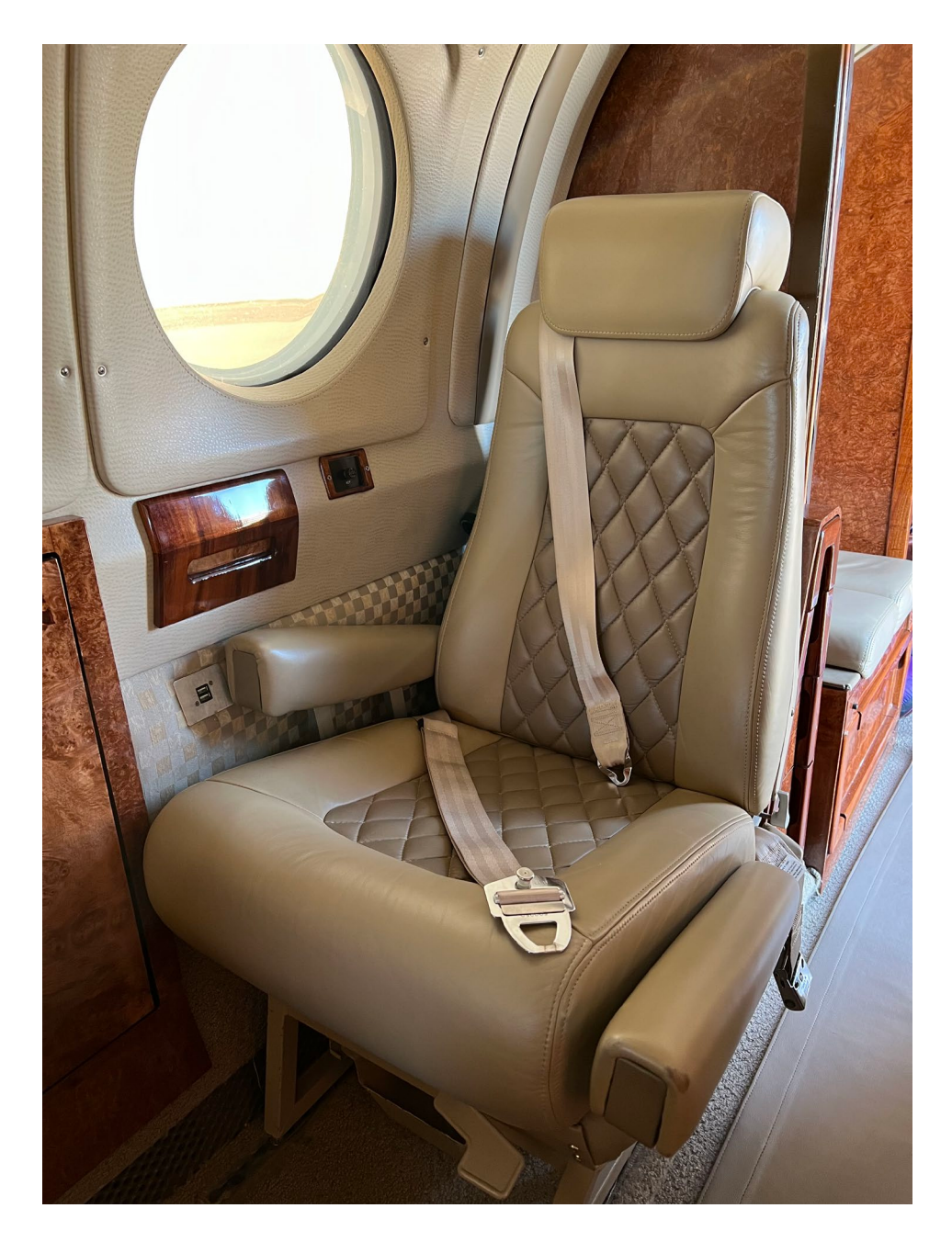
Photo 4 – View of the cabin seat the injured passenger was stationed in.