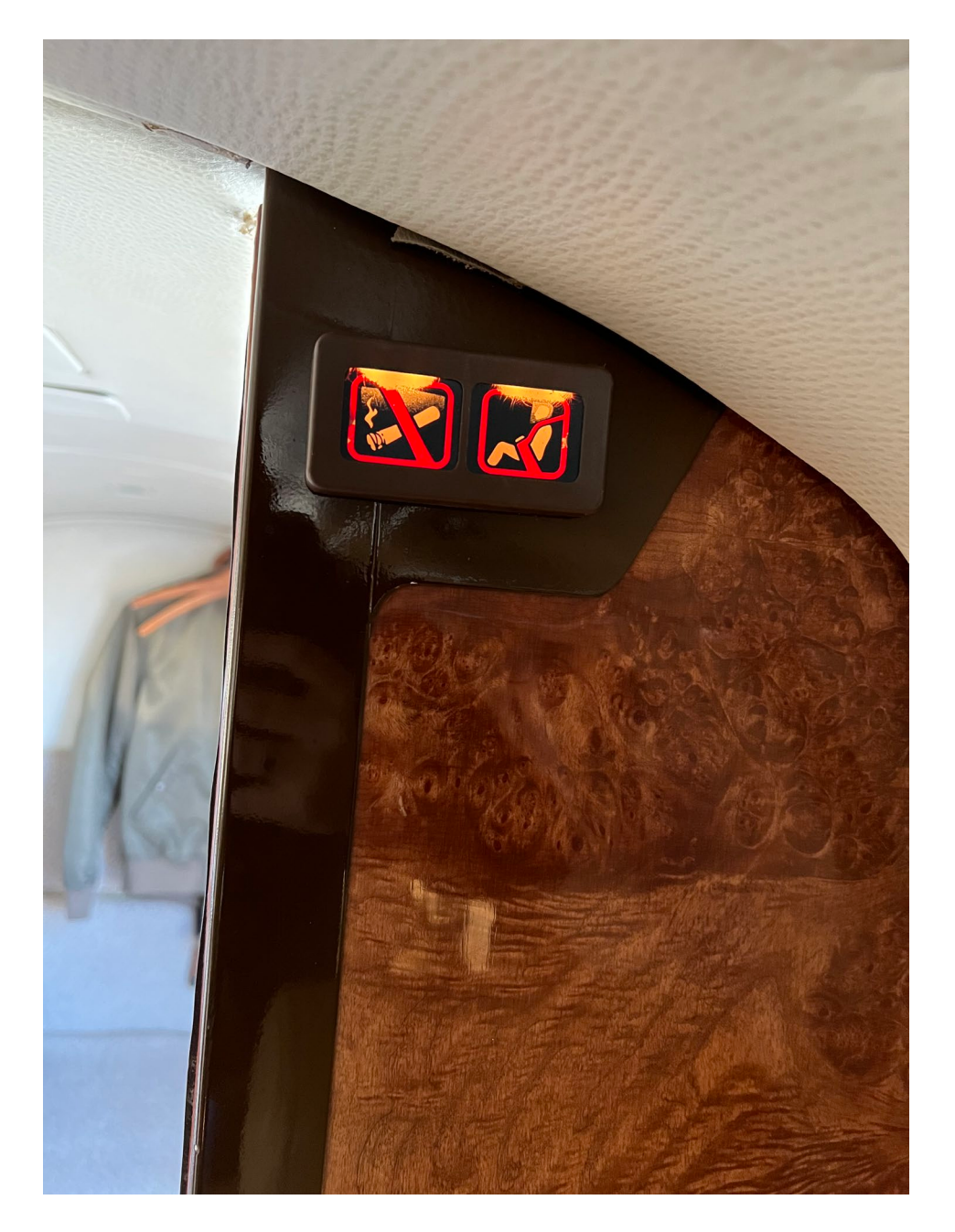
Photo 3 – View of the aft cabin light panel.