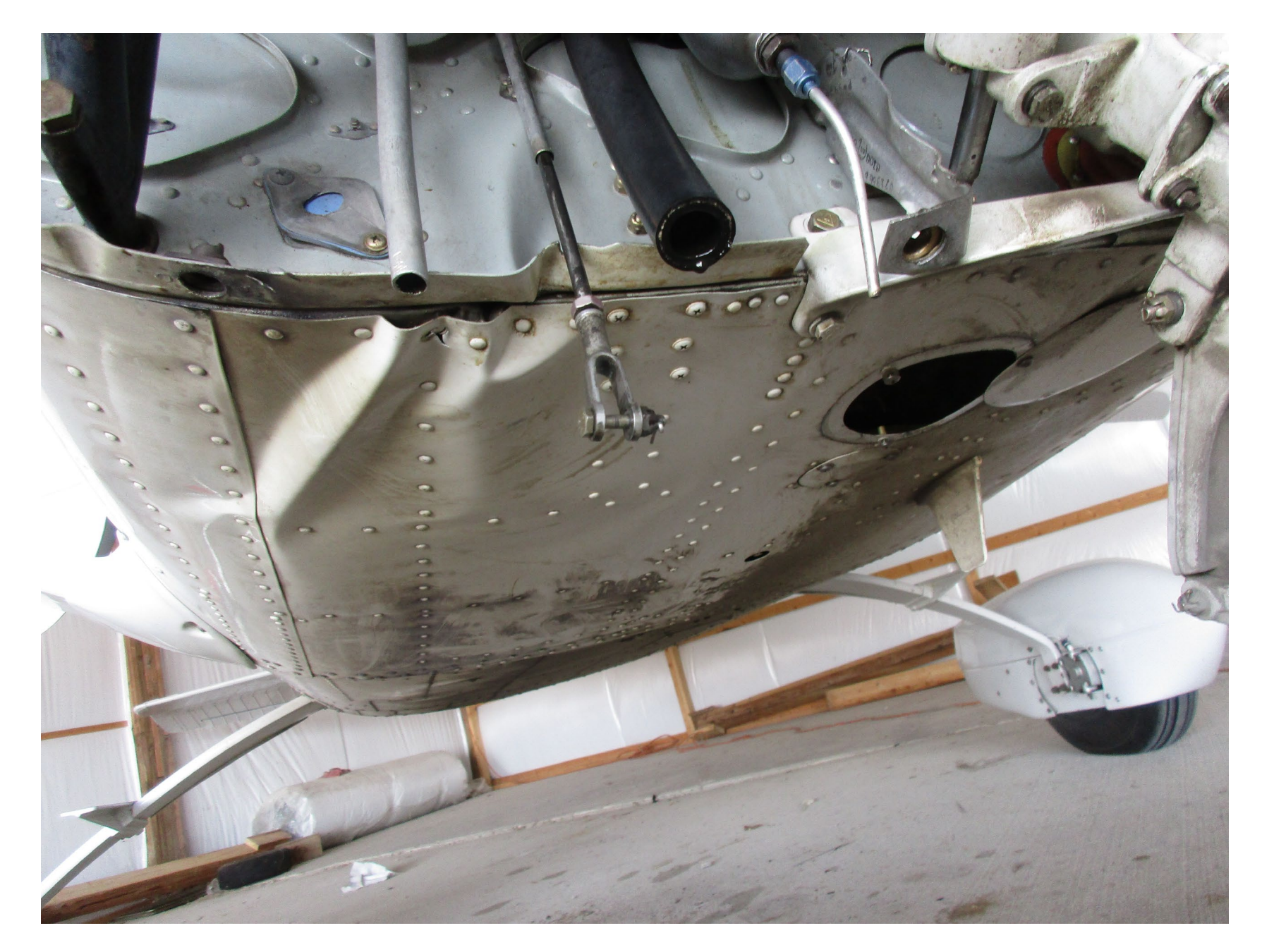
Photo 4 – View of the underside of the fuselage (courtesy of the Federal Aviation Administration).