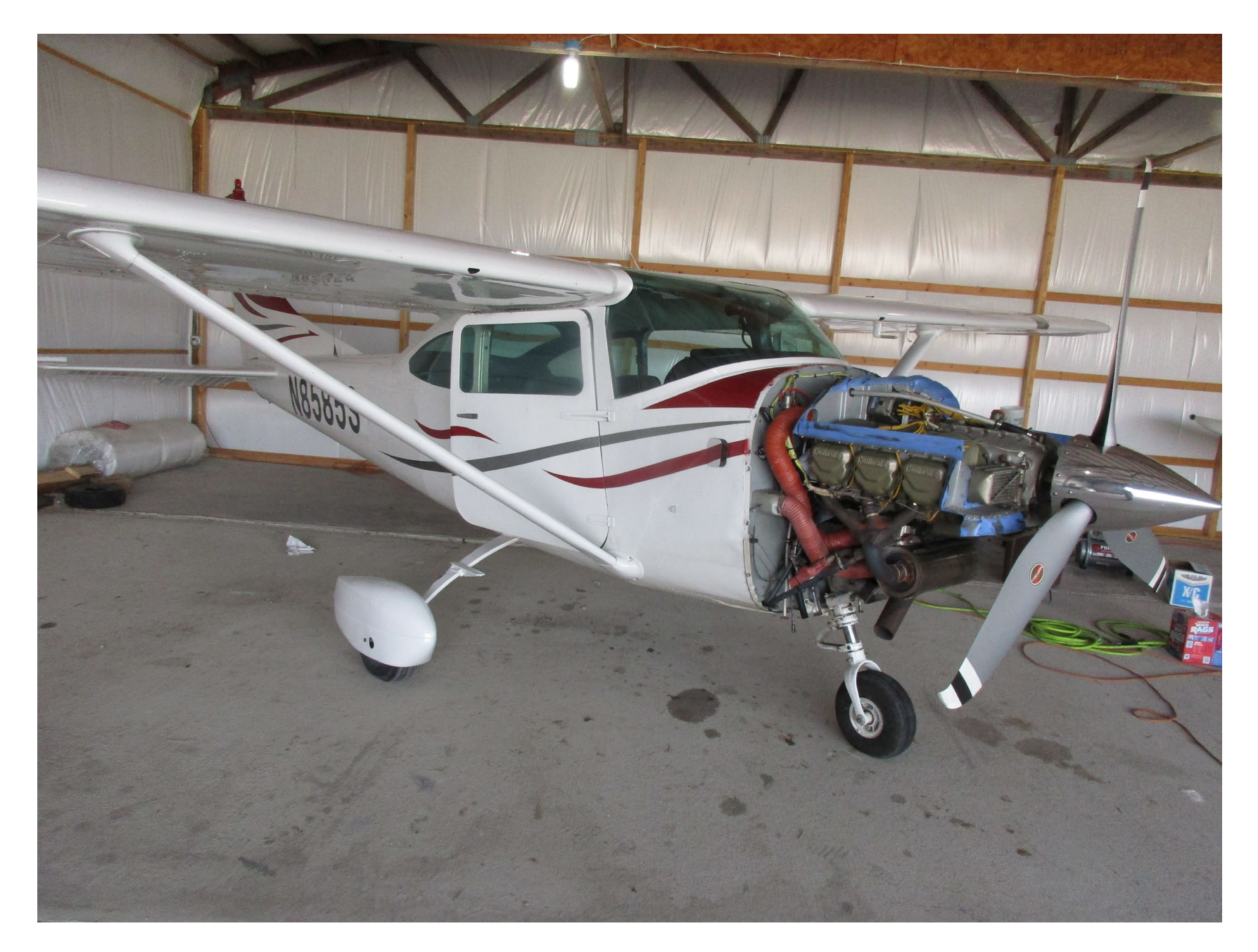
Photo 1 – View of the right side of the airplane after the accident.