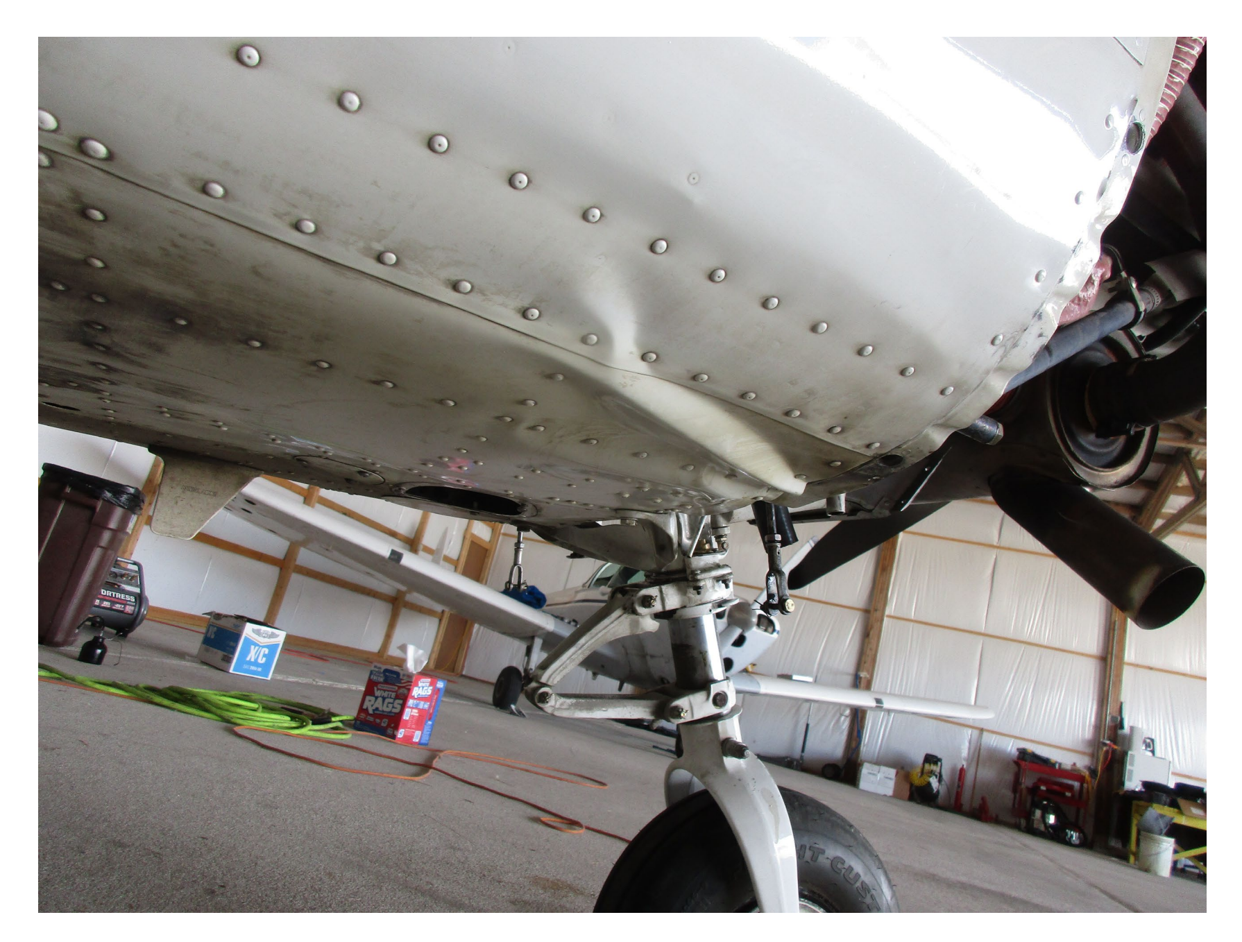
Photo 3 – View of the right side of the fuselage (courtesy of the Federal Aviation Administration).