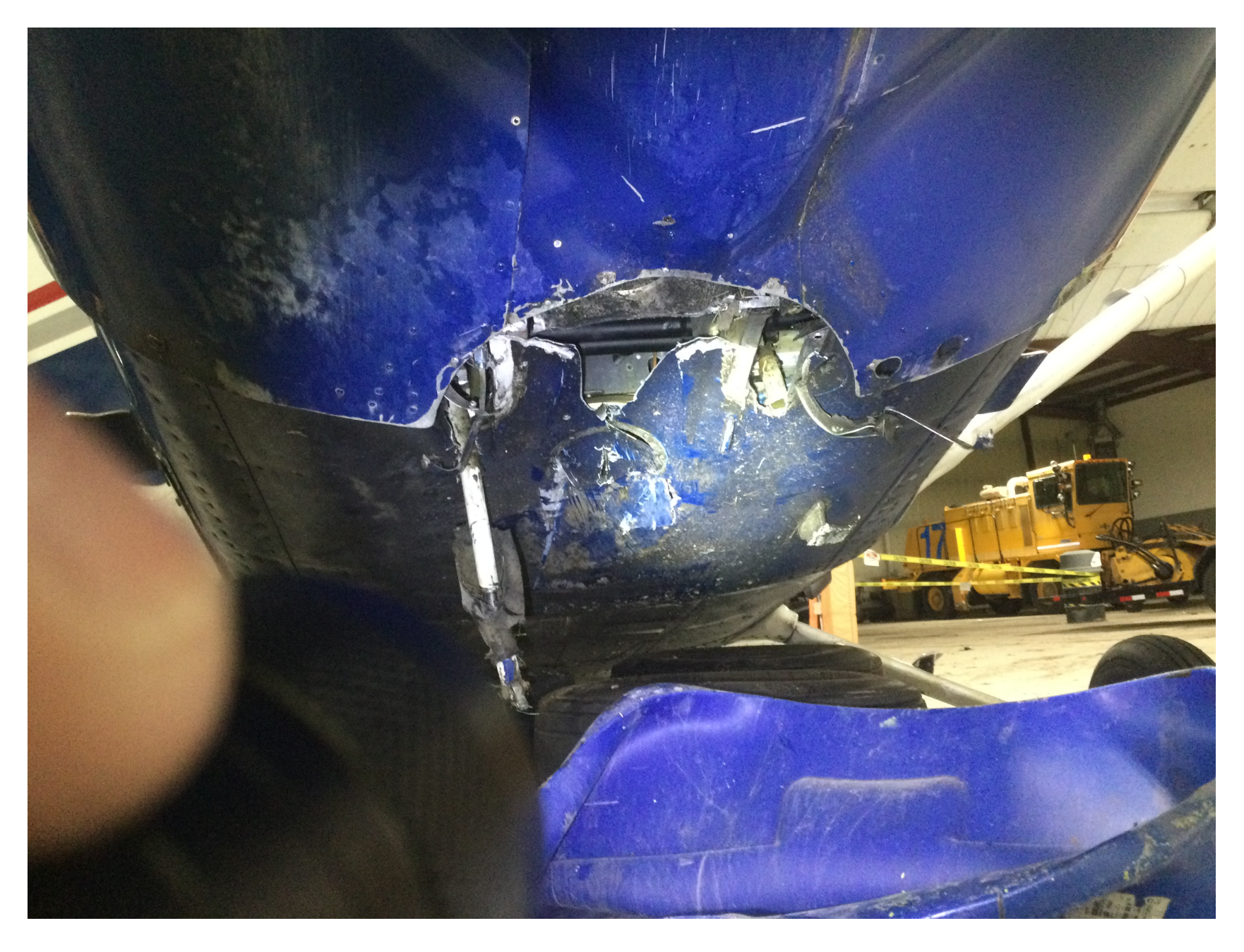
Photo 3 – Close-up frontal view of the underside of the fuselage.