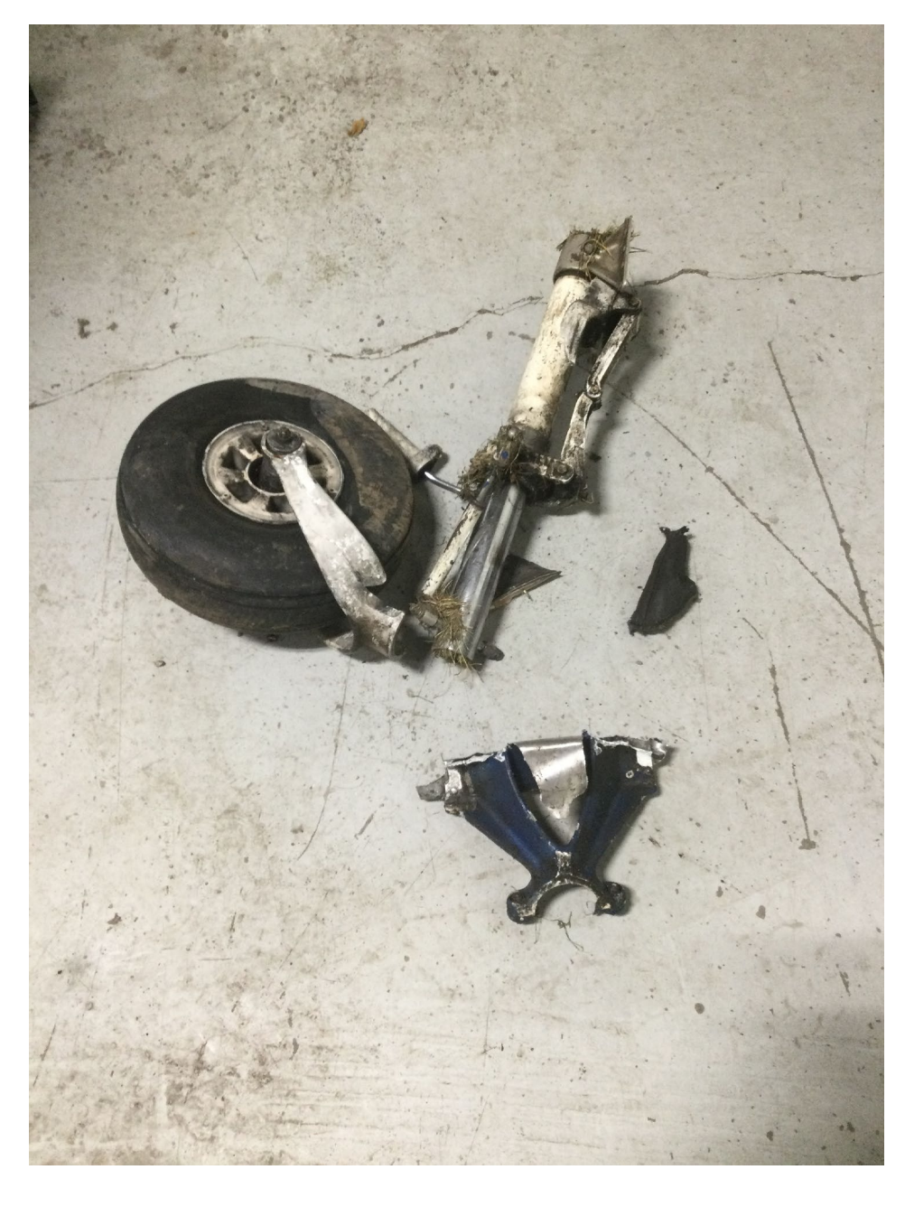
Photo 2 – Close-up view of the separated nose wheel assembly (courtesy of the Federal Aviation Administration).