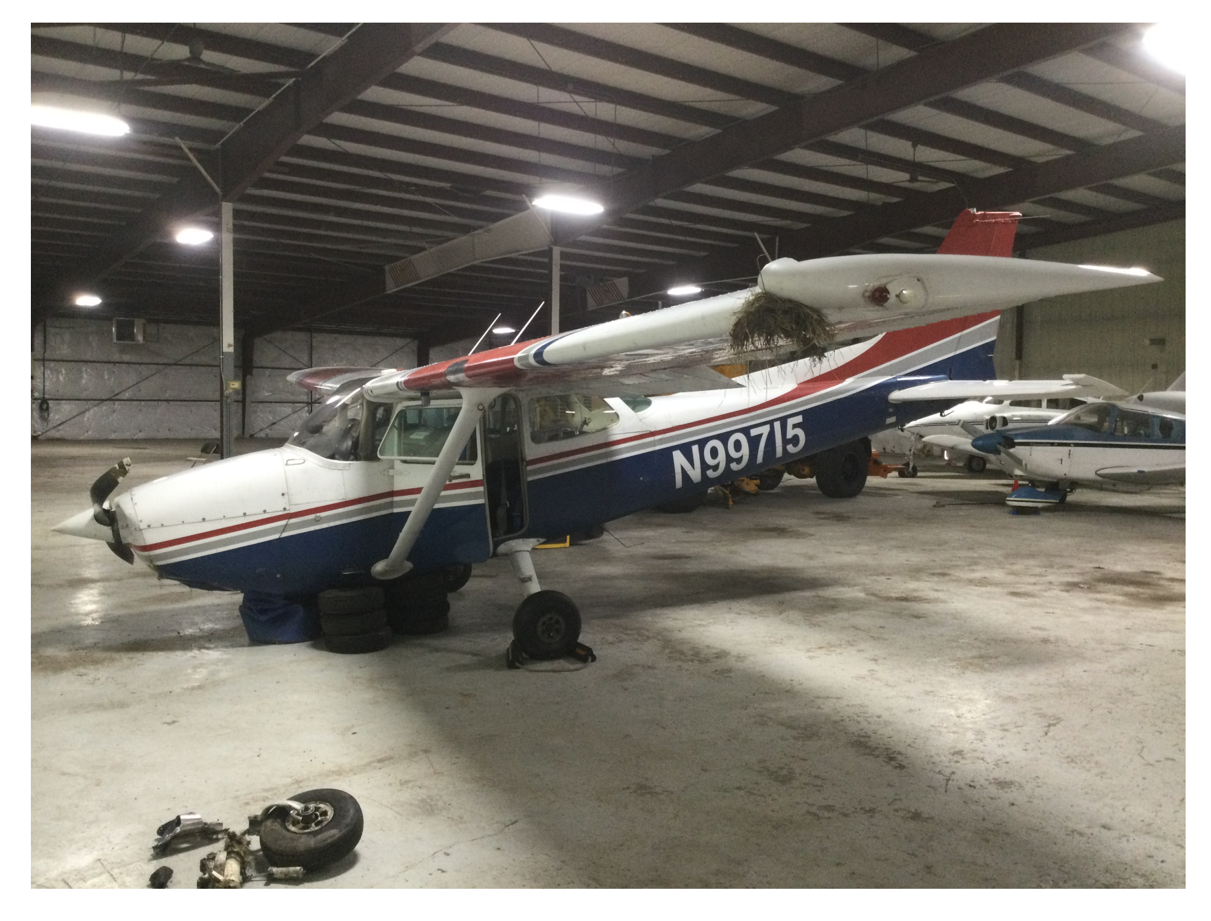
Photo 1 – Left side view of the airplane after it was recovered.