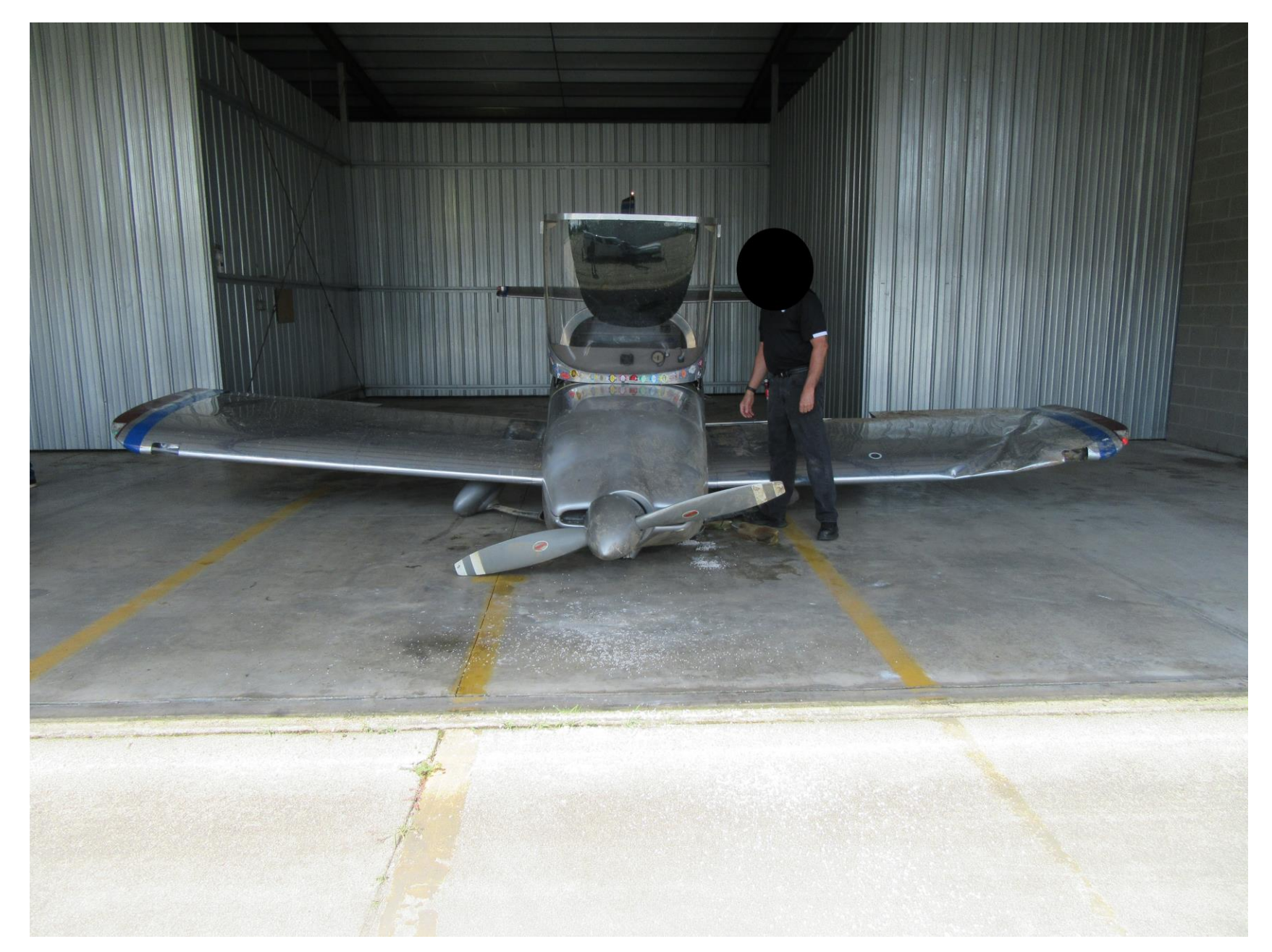
Photo 3 – Front view of the airplane after it was recovered from the field to a hangar.