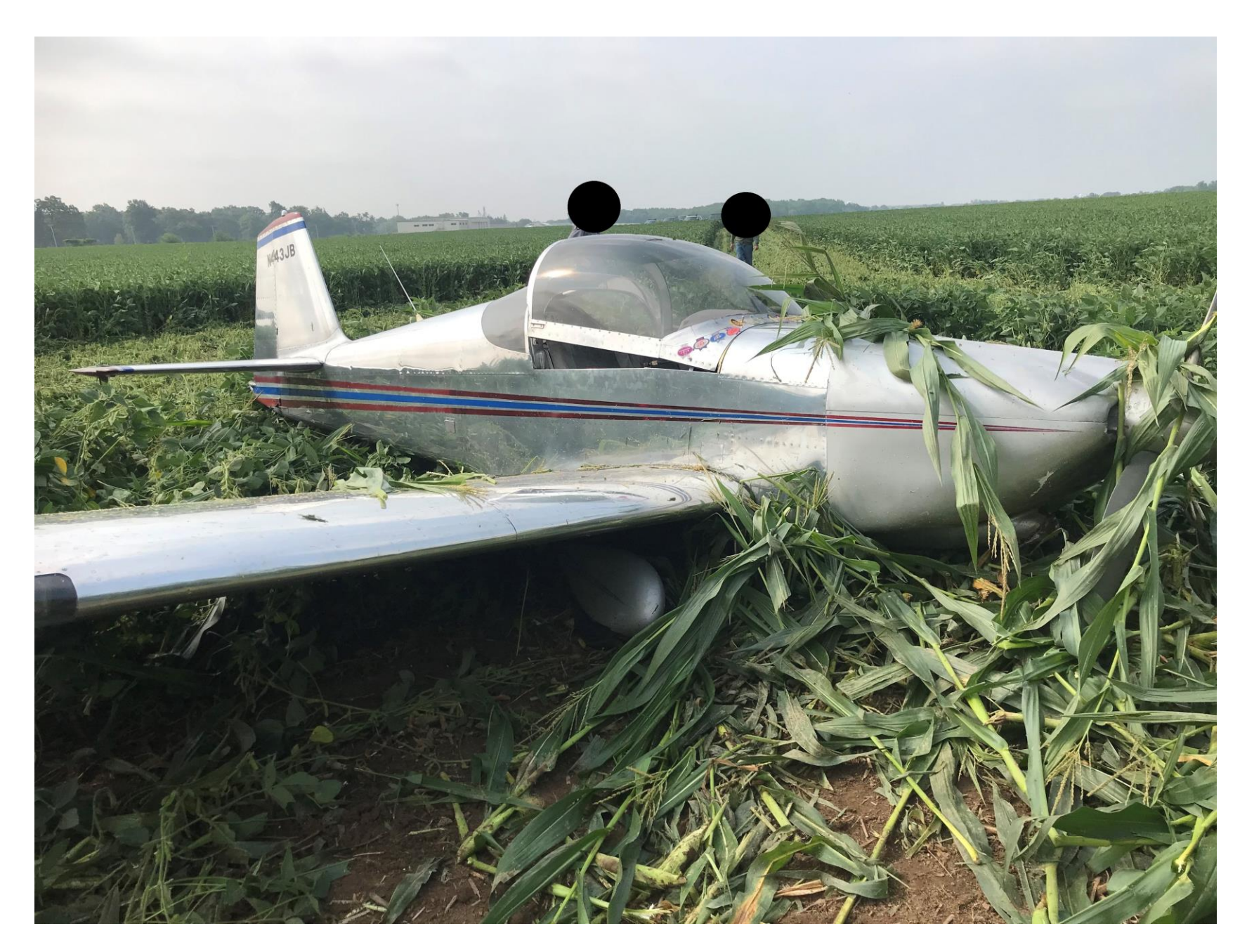
Photo 1 – Right side view of the airplane in the field.