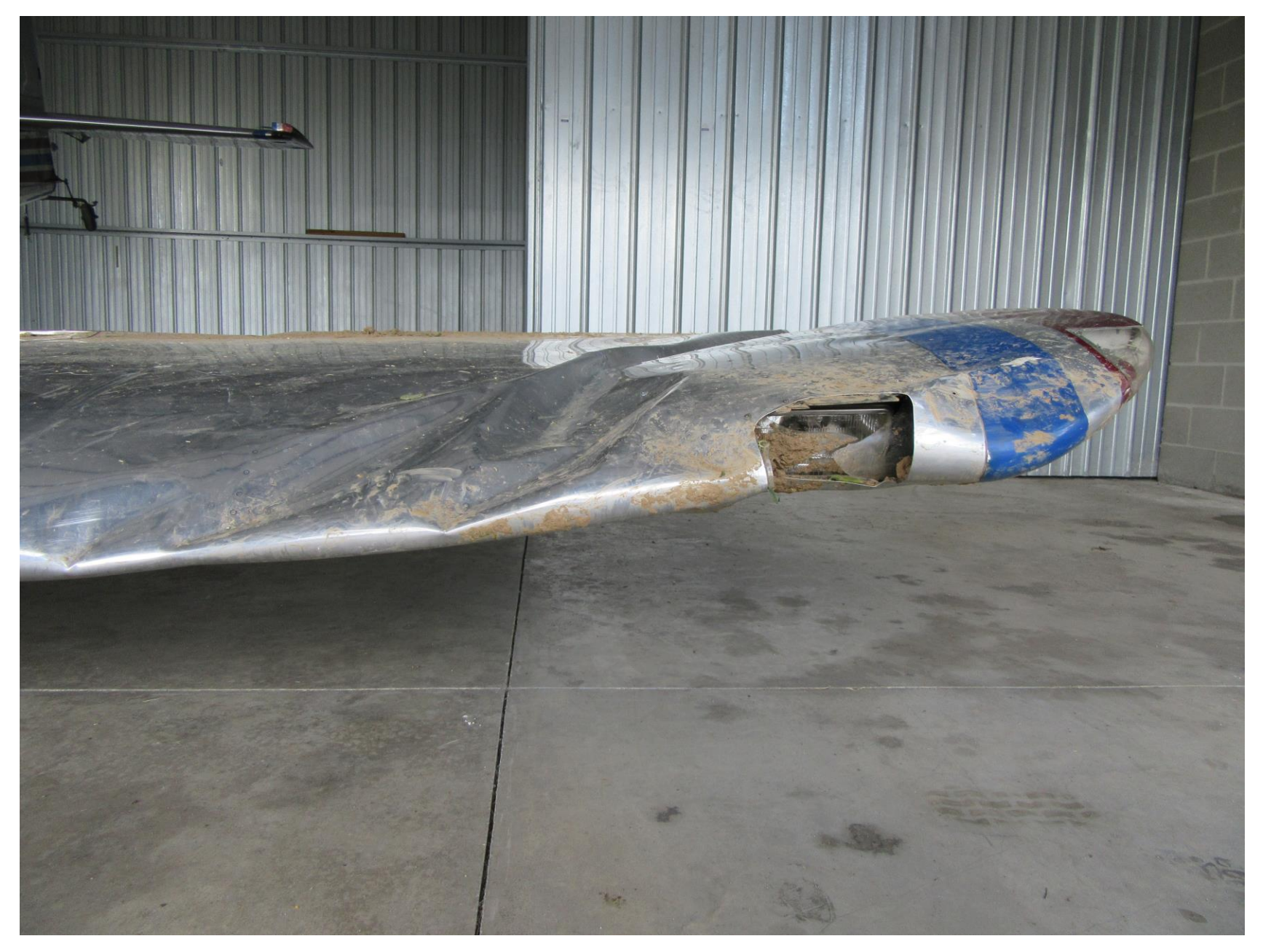
Photo 4 – Close up view of the substantial damage sustained to the left wing.