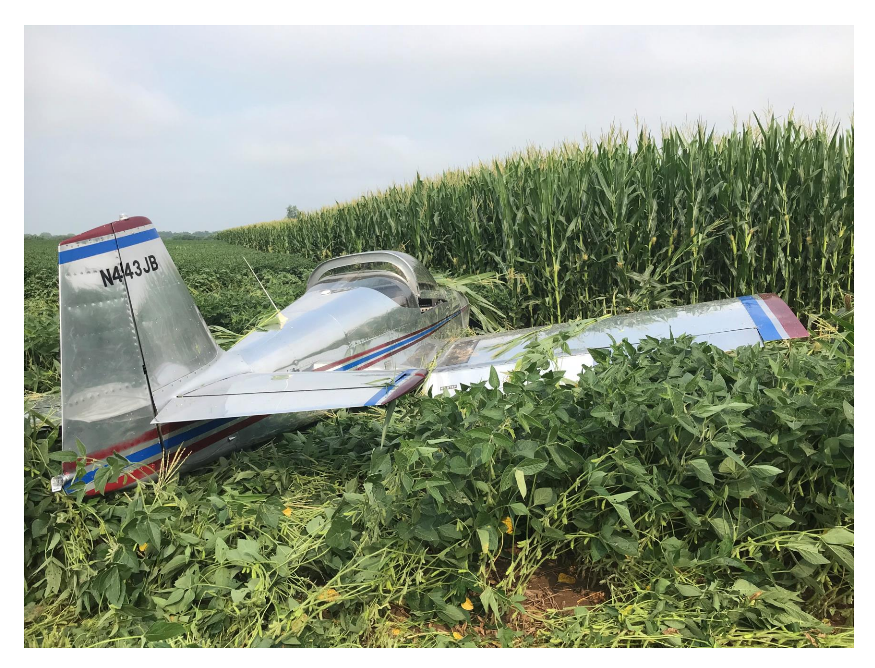
Photo 2 – Rear view of the airplane in the field (courtesy of the Federal Aviation Administration).