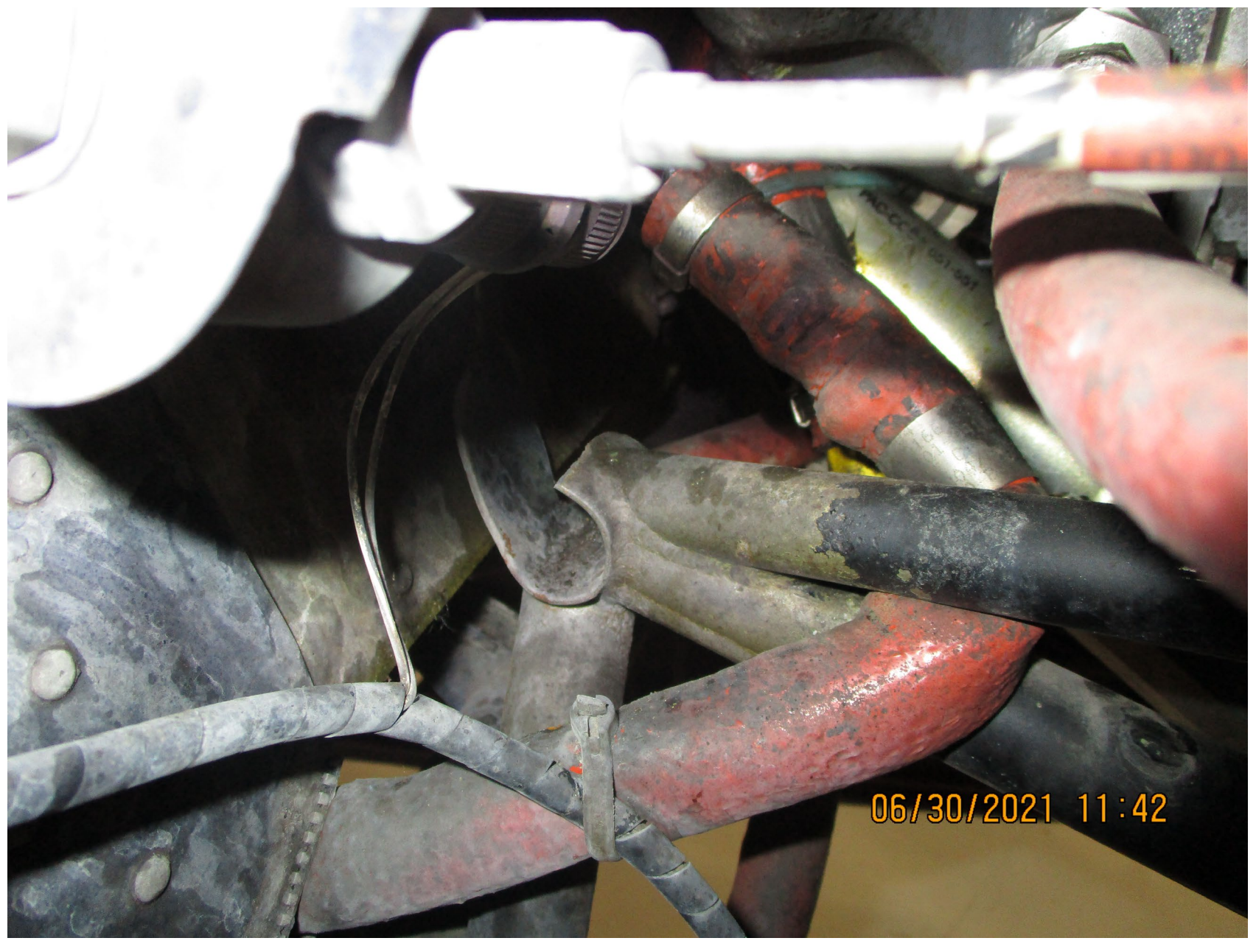
Photo 6 – Close up view of the fracture sustained to the upper portion of the engine mount (courtesy of the Federal Aviation Administration).