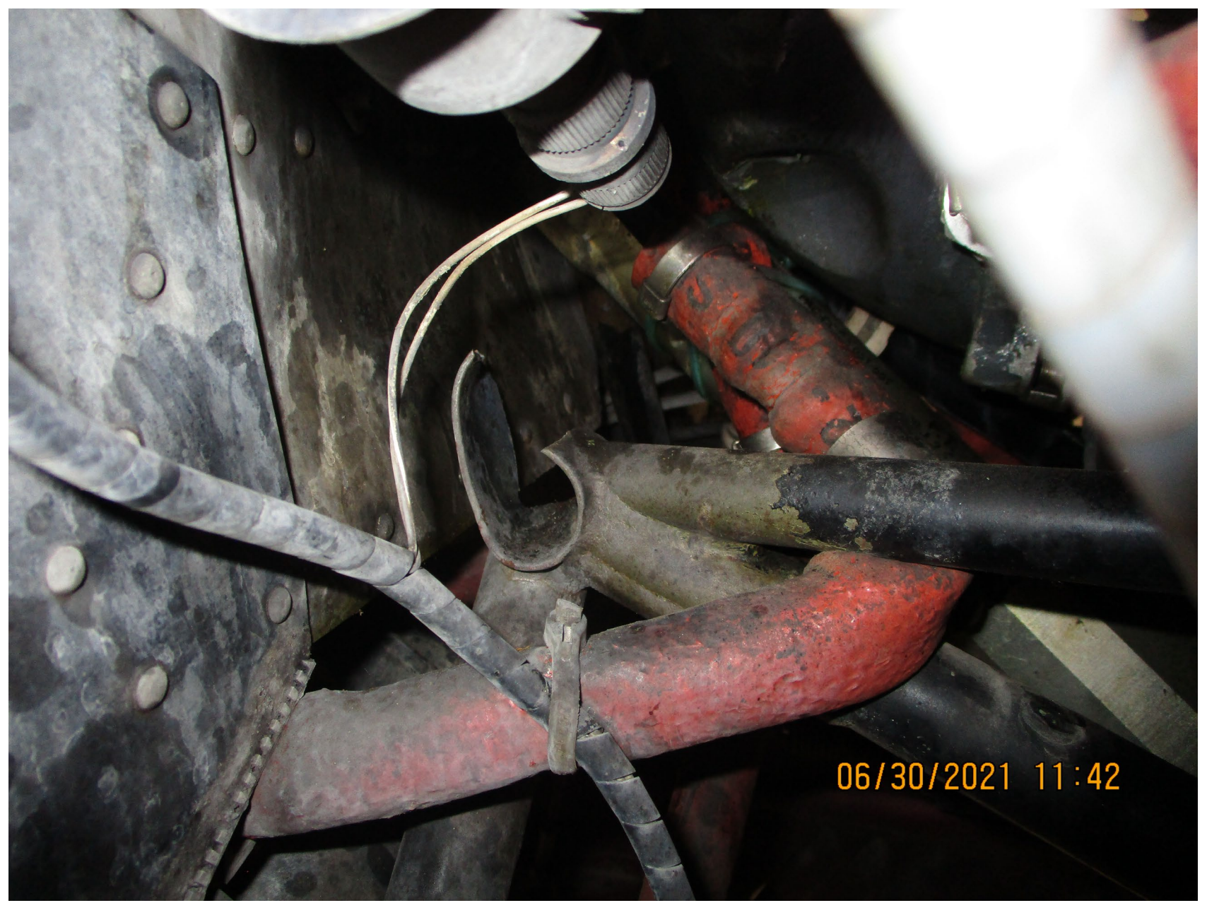
Photo 5 – Close up view of the fracture sustained to the upper portion of the engine mount.