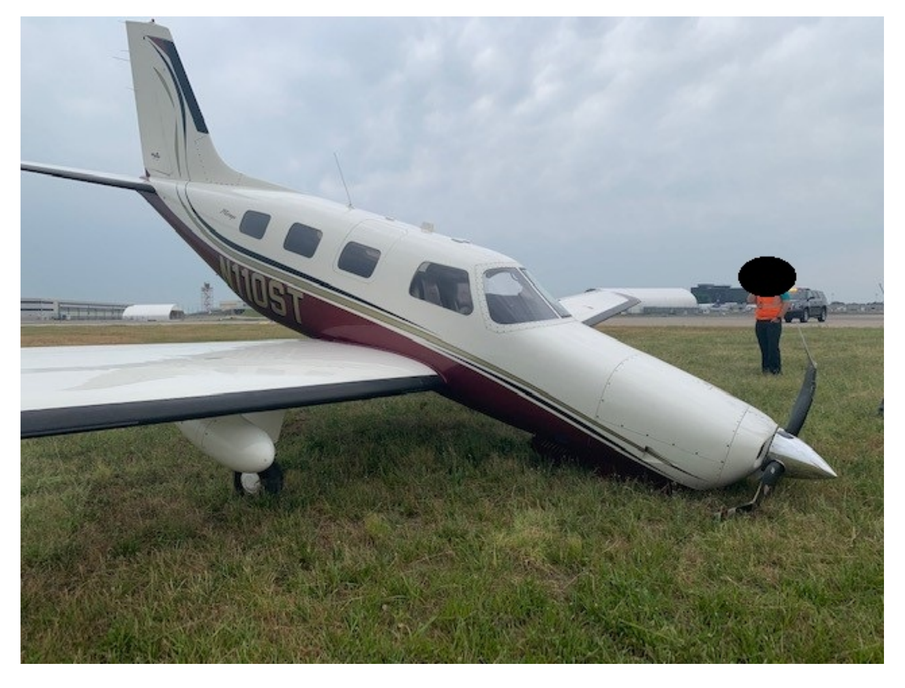
Photo 1 – Right side view of the airplane at the accident site (courtesy of the Federal Aviation Administration).