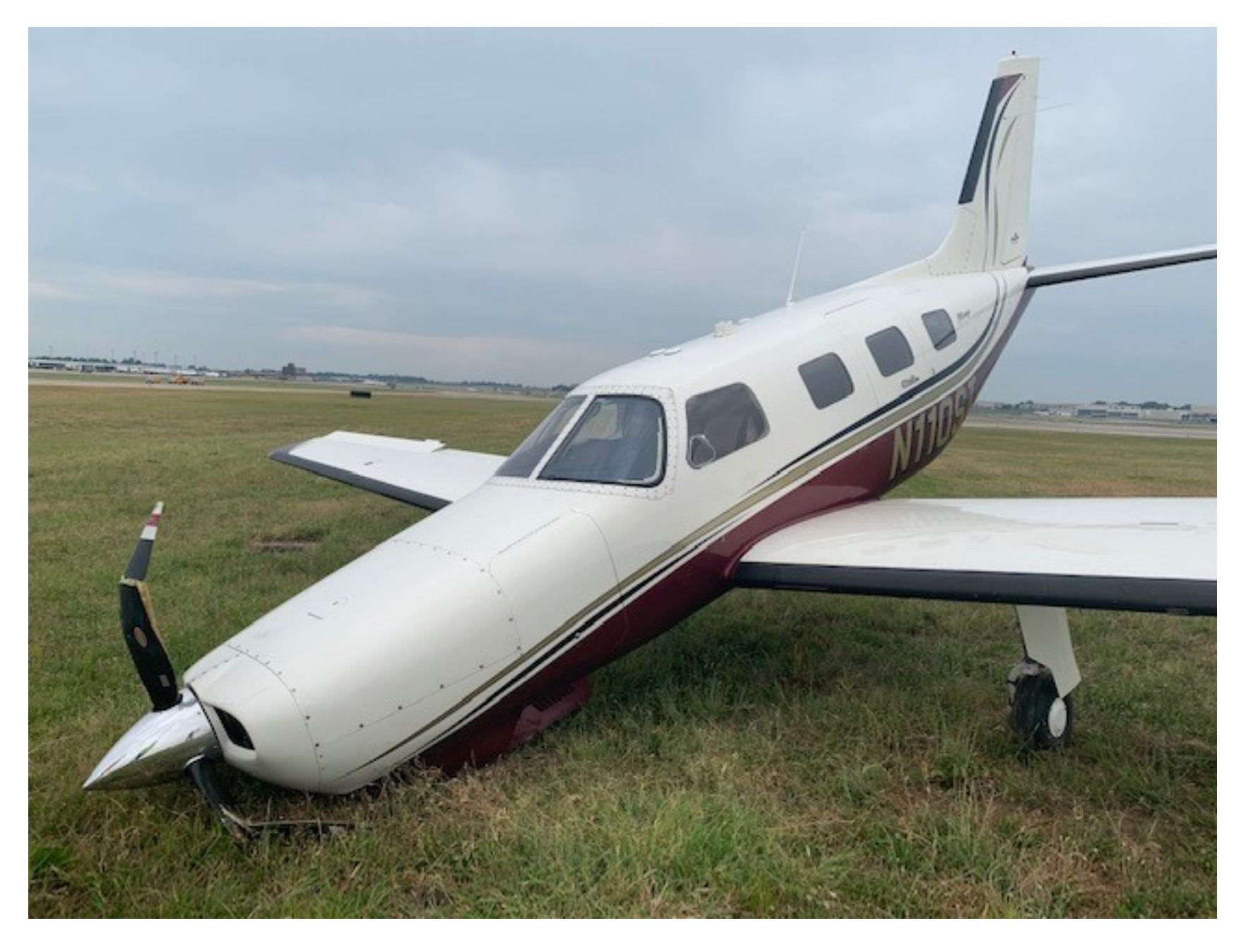
Photo 3 – Left side view of the airplane at the accident site (courtesy of the Federal Aviation Administration).