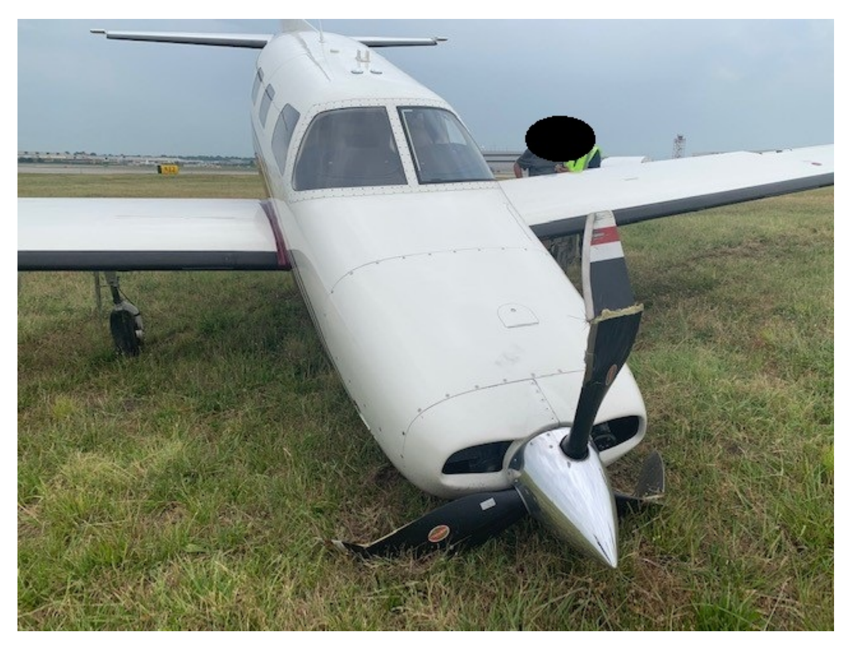
Photo 2 – Front view of the airplane at the accident site.