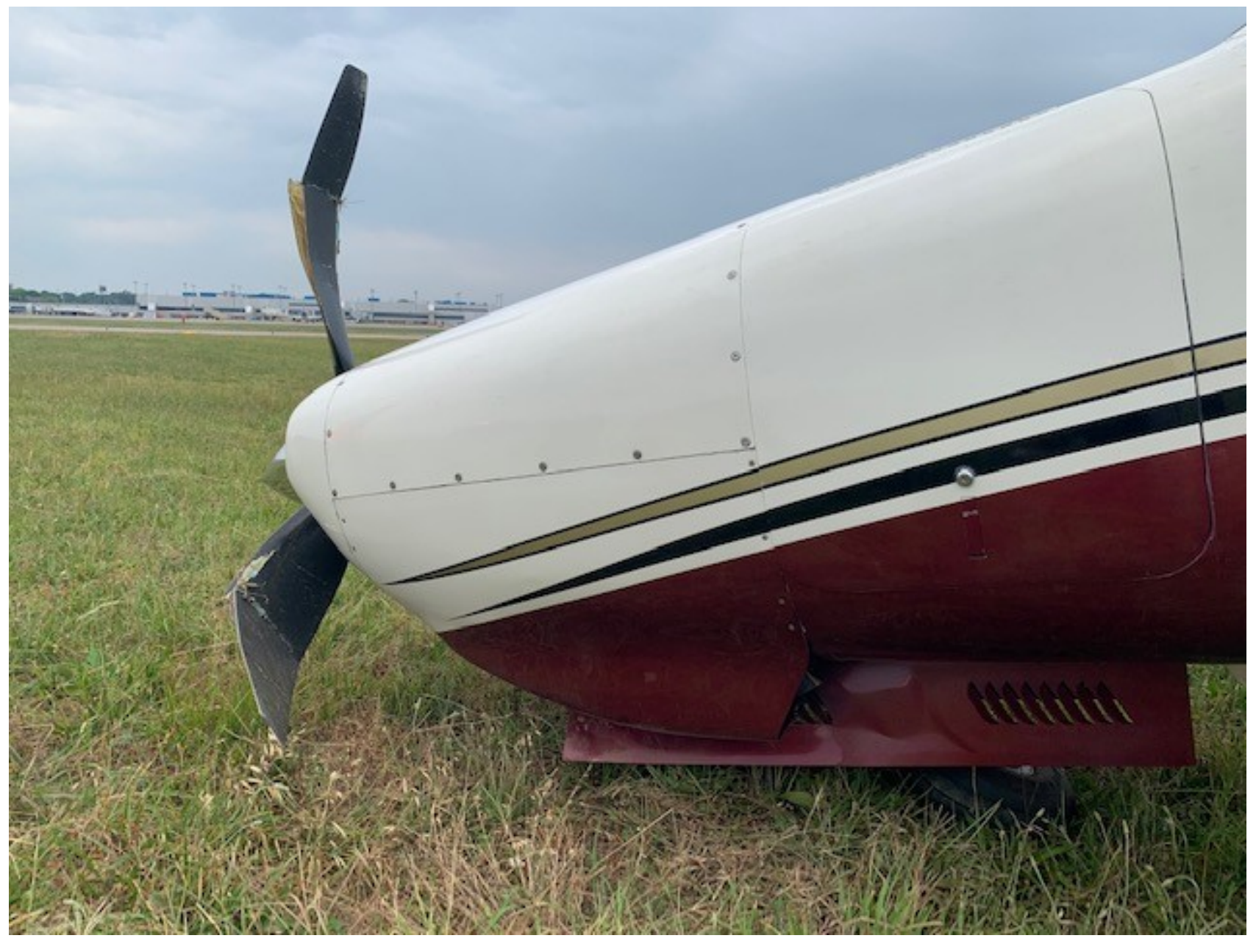
Photo 4 – Close up left side view of the collapsed nose landing gear at the accident site (courtesy of the Federal Aviation Administration).