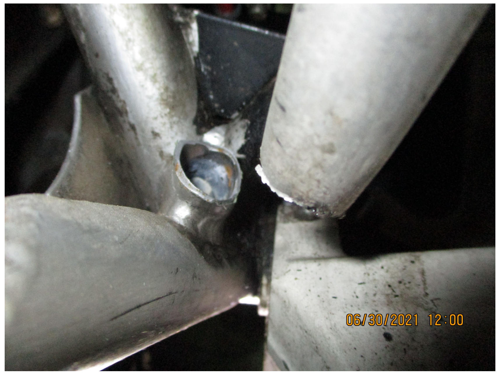
Photo 8 – Close up view of the fracture sustained to the lower portion of the engine mount (courtesy of the Federal Aviation Administration).