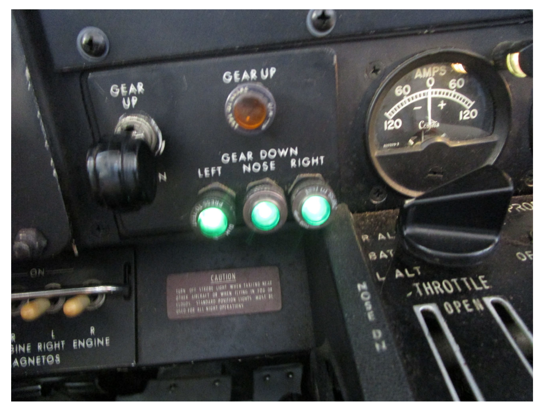
Photo 5 – Close up view of the cockpit-based main landing gear lever and status indicator lights (courtesy of the Federal Aviation Administration).