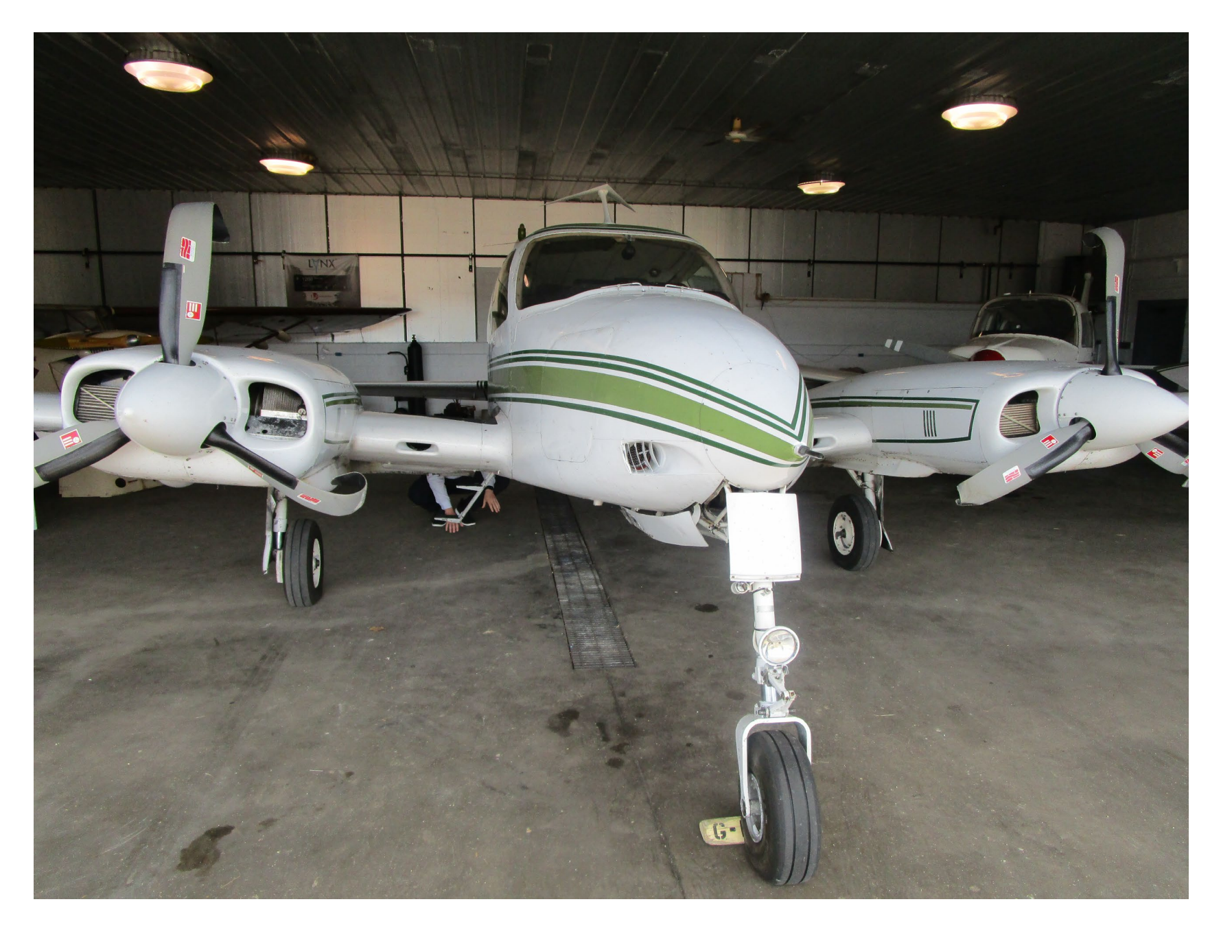
Photo 1 – Front view of the airplane (courtesy of the Federal Aviation Administration).