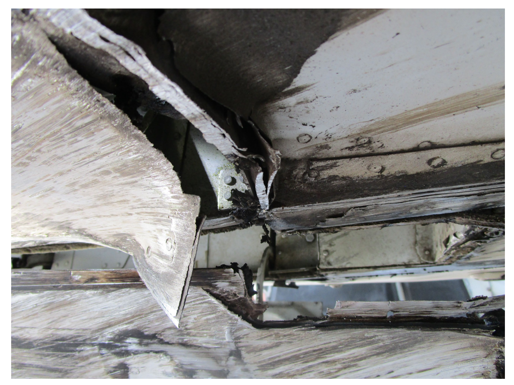
Photo 4 – Close up view of the substantial damage sustained to the bottom of the fuselage (courtesy of the Federal Aviation Administration).