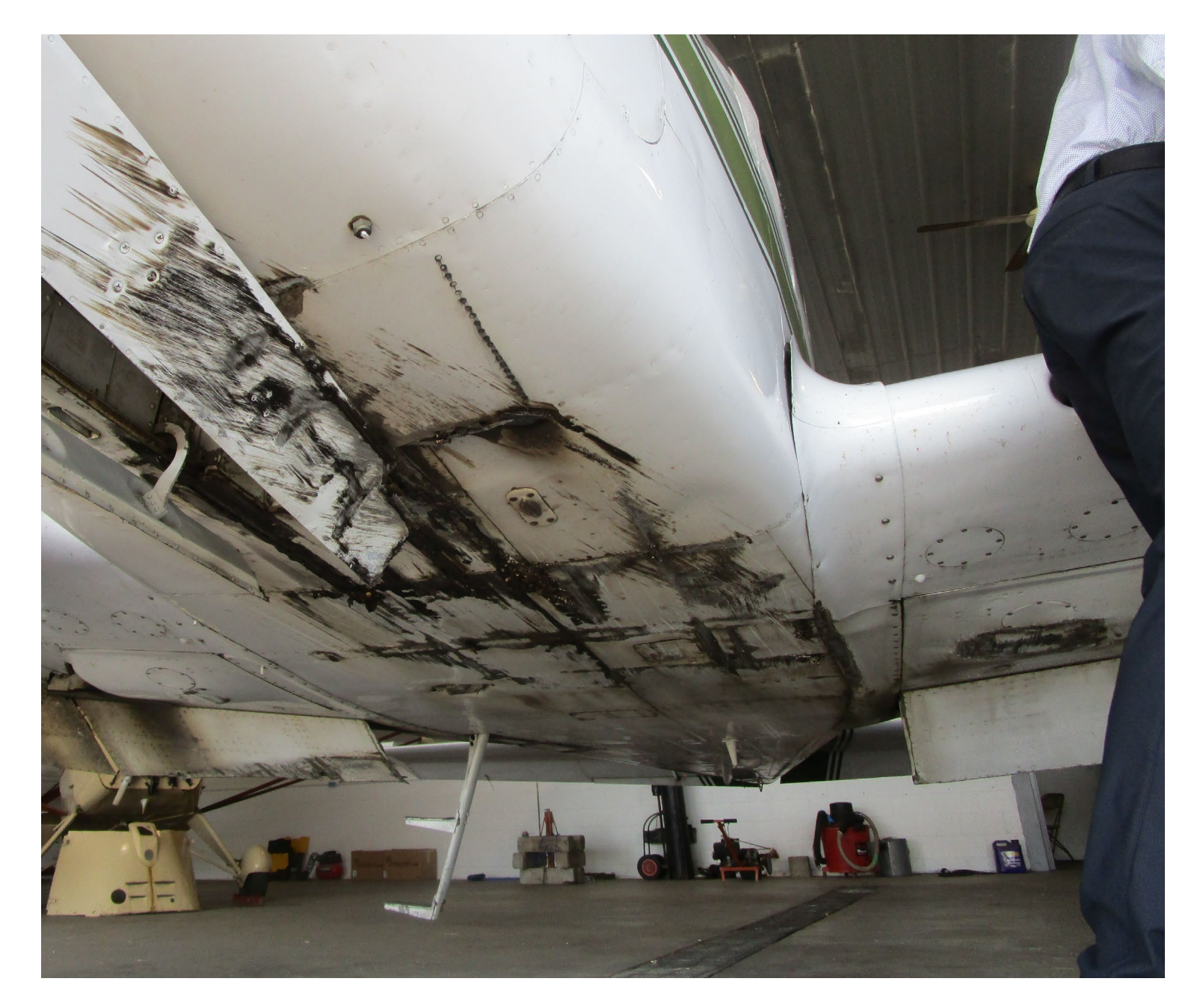
Photo 2 – Left side view of the underside of the fuselage (courtesy of the Federal Aviation Administration).