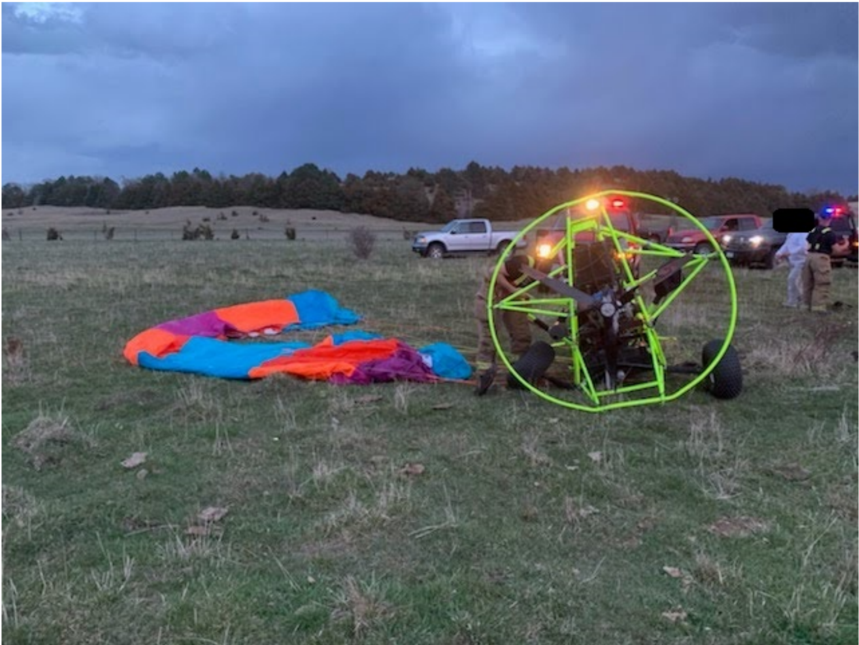
Photo 1 – View of the accident site and the aircraft (courtesy of the Federal Aviation Administration).