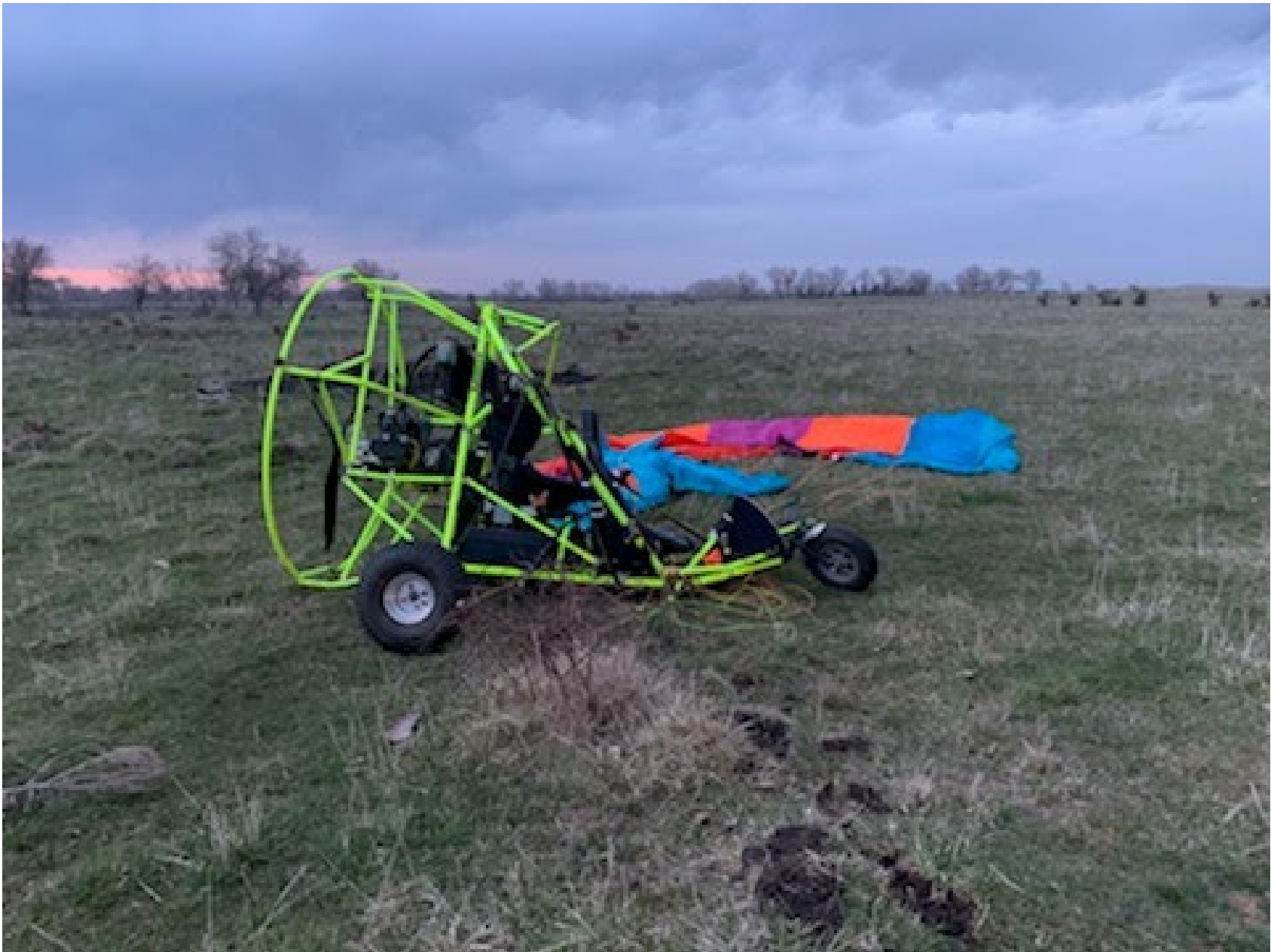
Photo 3 – Right side view of the aircraft.