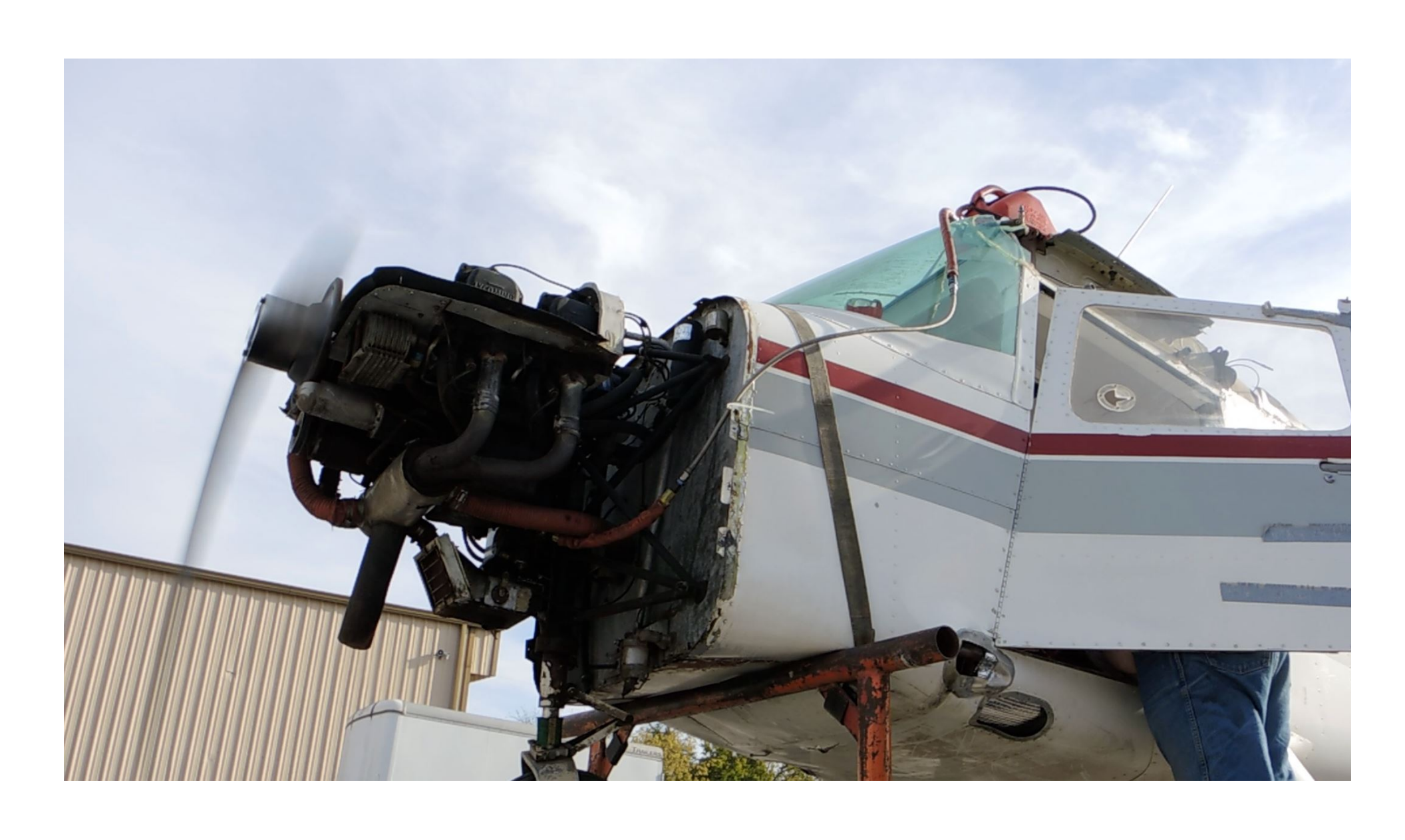
Photo 6 – Side view of the engine operating.