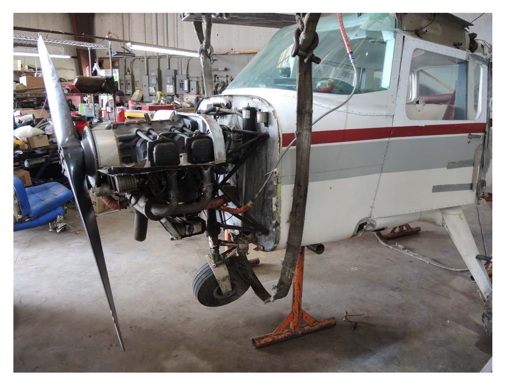
Photo 3 – Left side view of the engine.