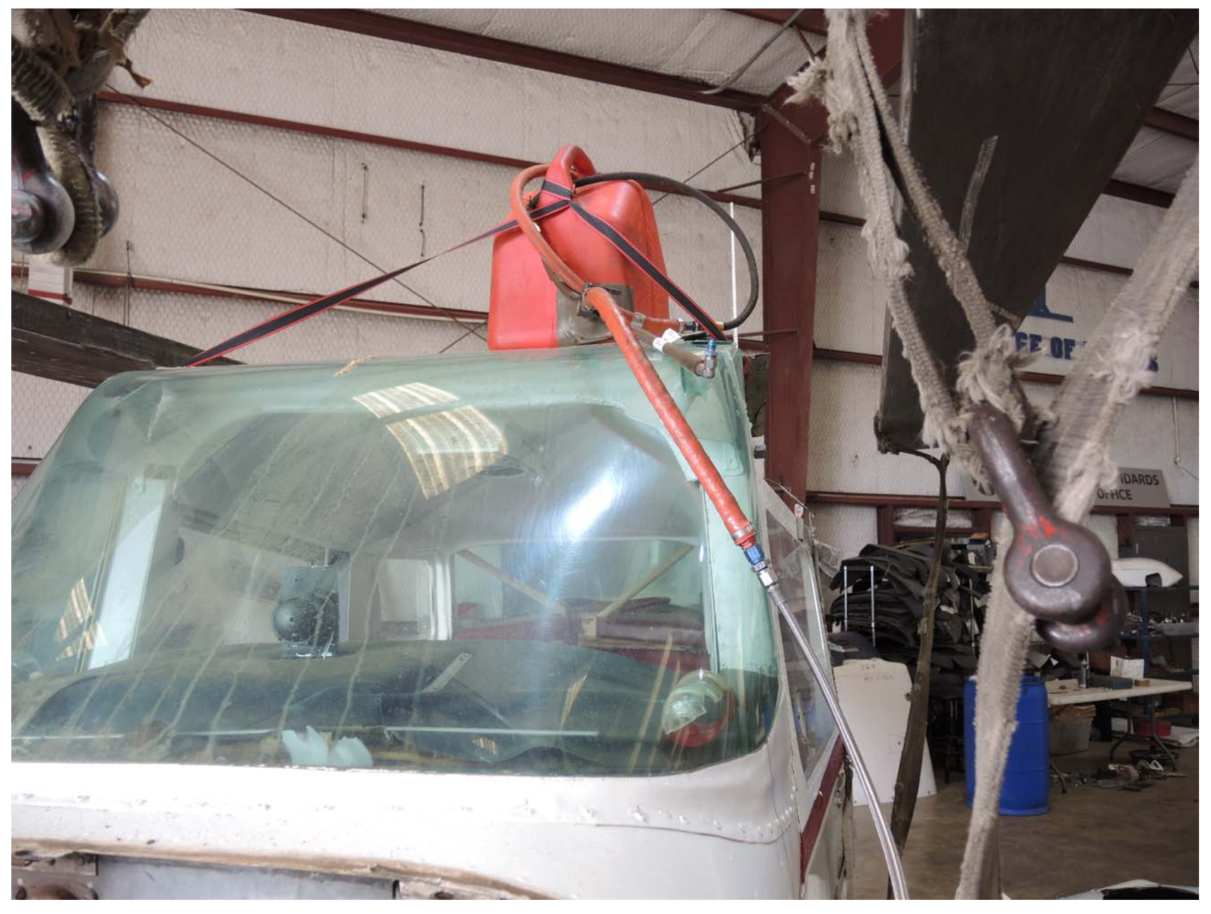
Photo 5 – Front view of the installed fuel tank to facilitate the engine run (courtesy of the National Transportation Safety Board).