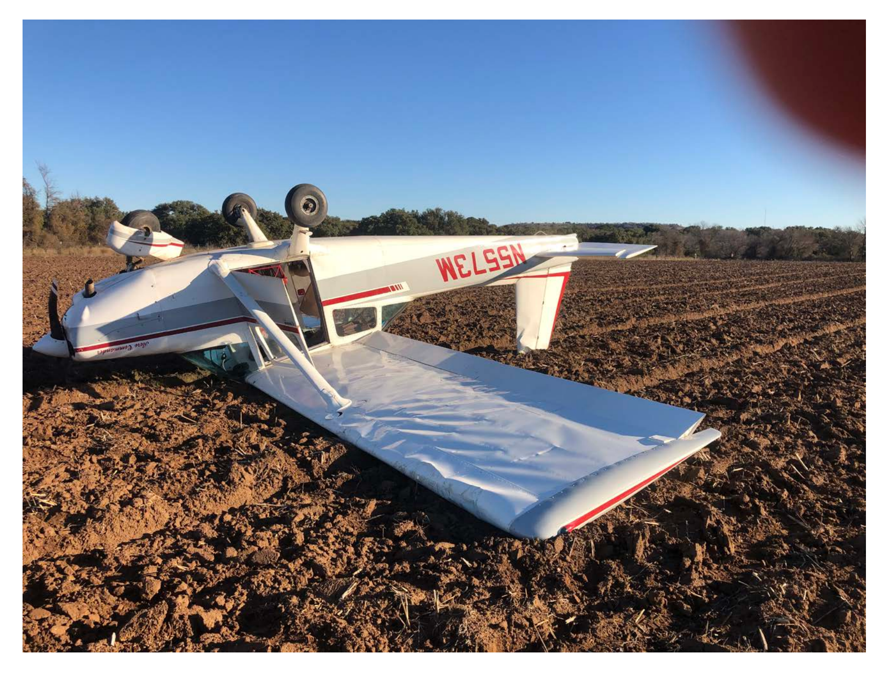
Photo 1-Side view of the inverted airplane in the dirt field.