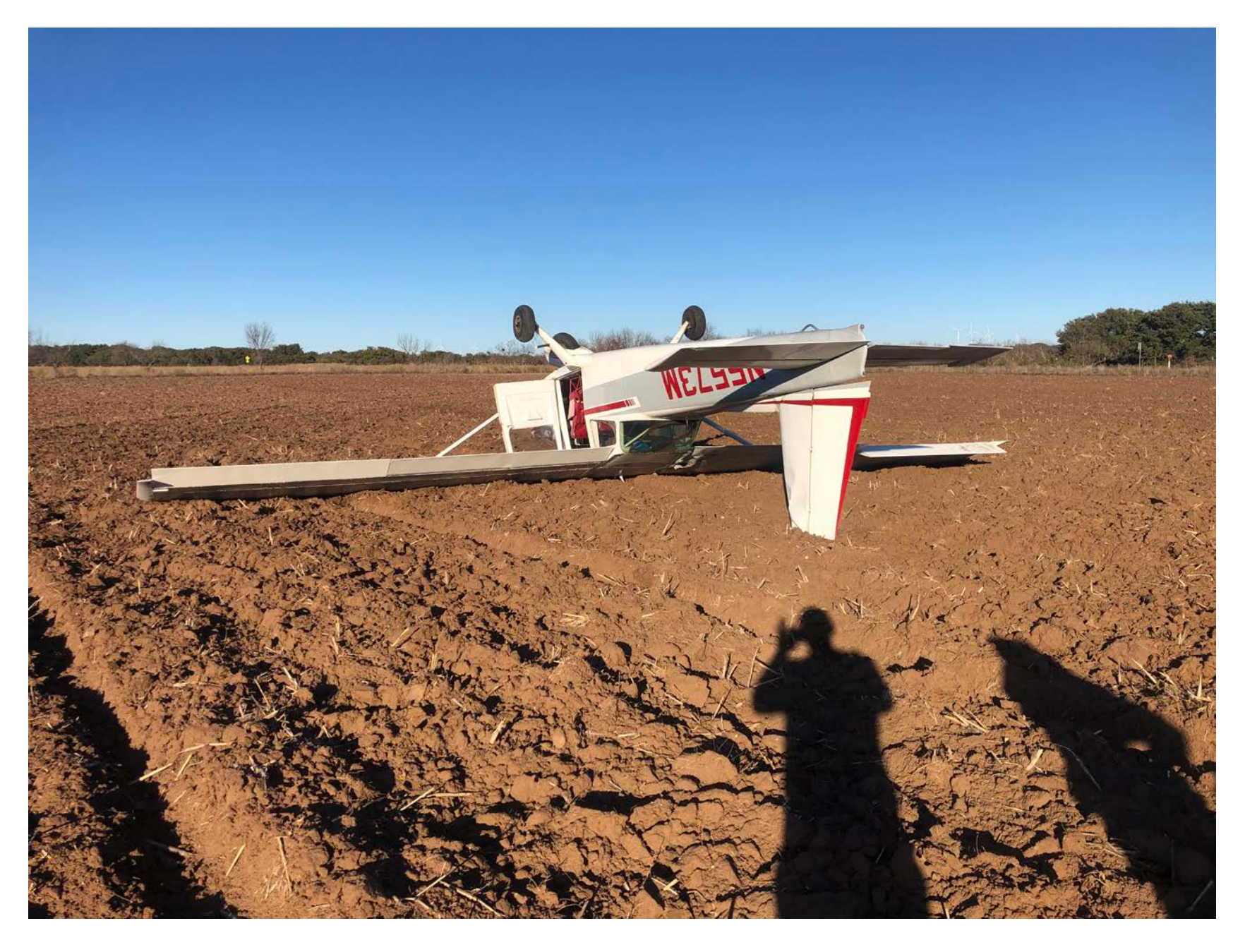
Photo 2 – Rear view of the inverted airplane in the dirt field (courtesy of the Federal Aviation Administration).