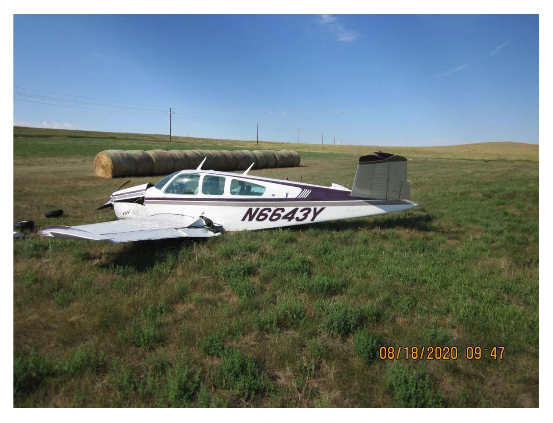
Photo 1 – View of the left side of the airplane.