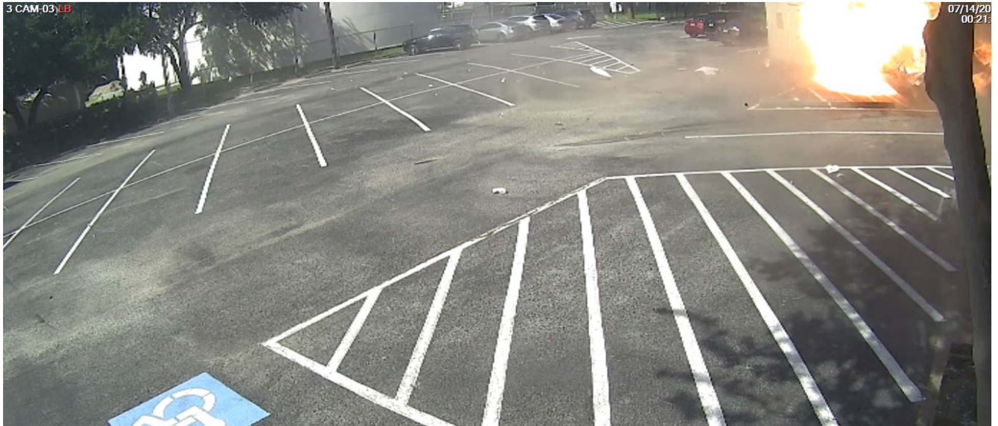
Photo 4 – Security camera footage of the airplane impacting the building (courtesy of the Mason Creek Community Center).