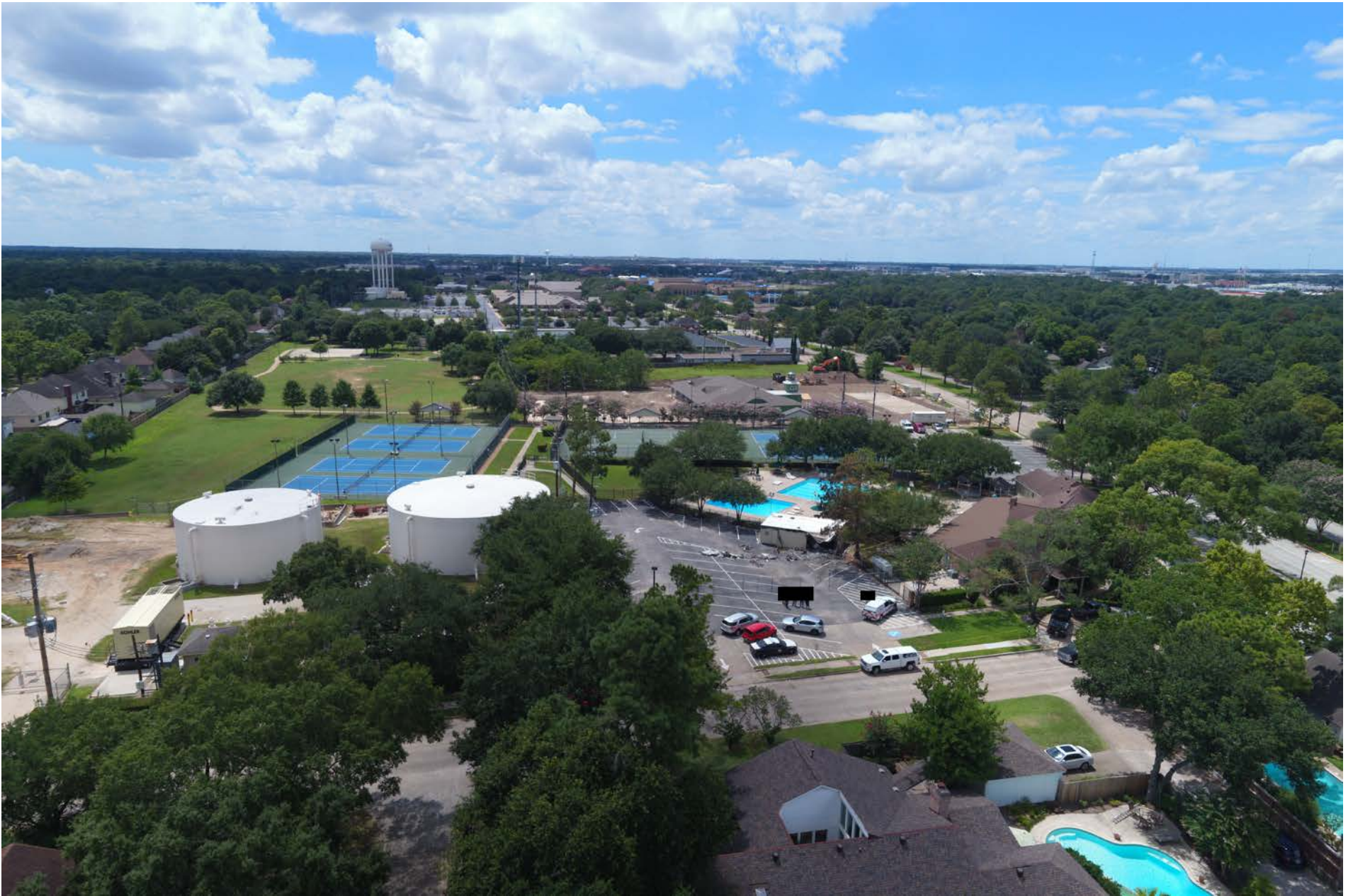
Photo 1 – Aerial view of the community center and accident site (courtesy of Touchstone District Services, in partnership with Harris County Emergency Services District #48).