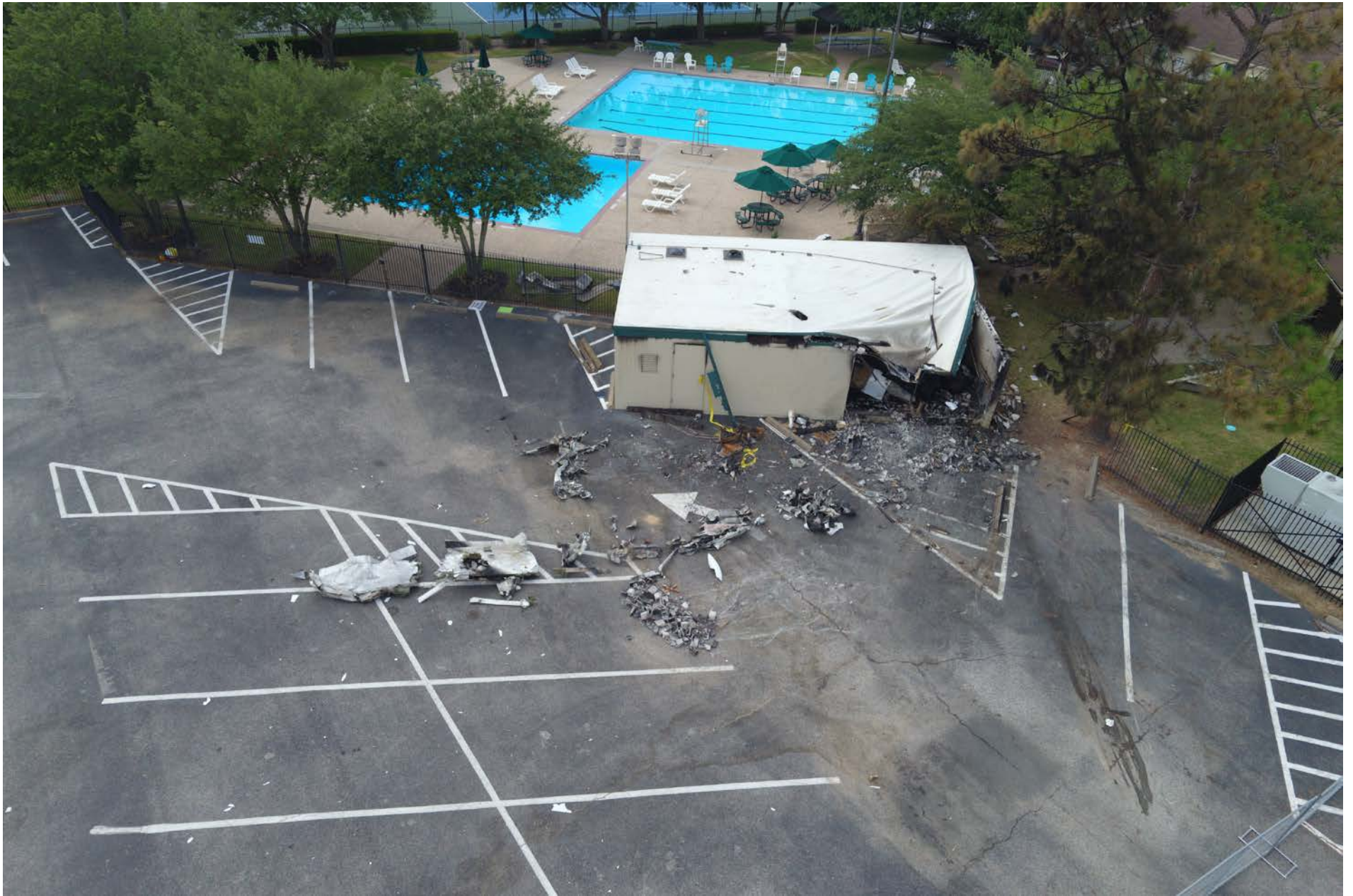
Photo 2 – Aerial view of the accident site (courtesy of Touchstone District Services, in partnership with Harris County Emergency Services District #48).