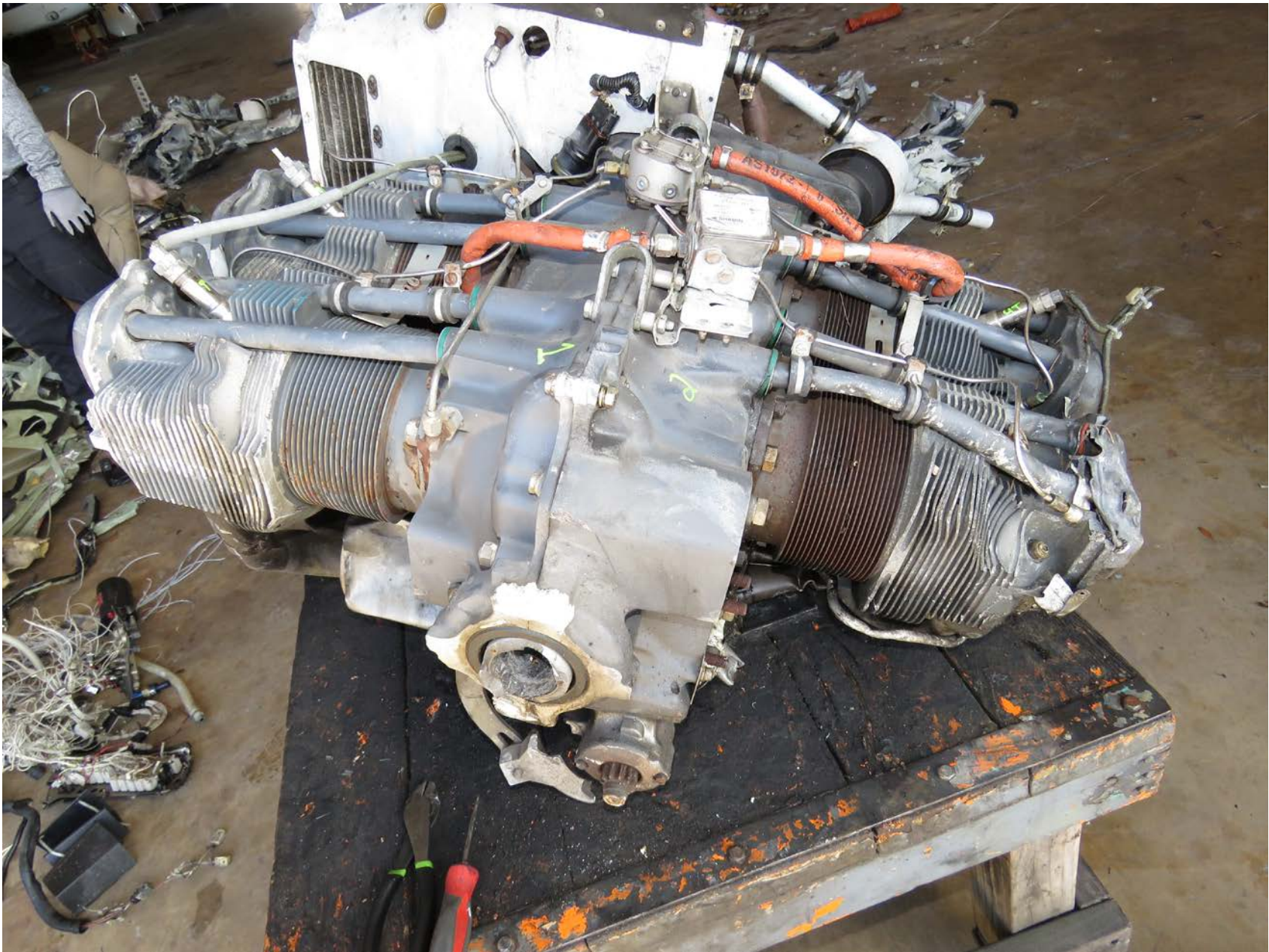
Photo 12 – Front view of the engine.