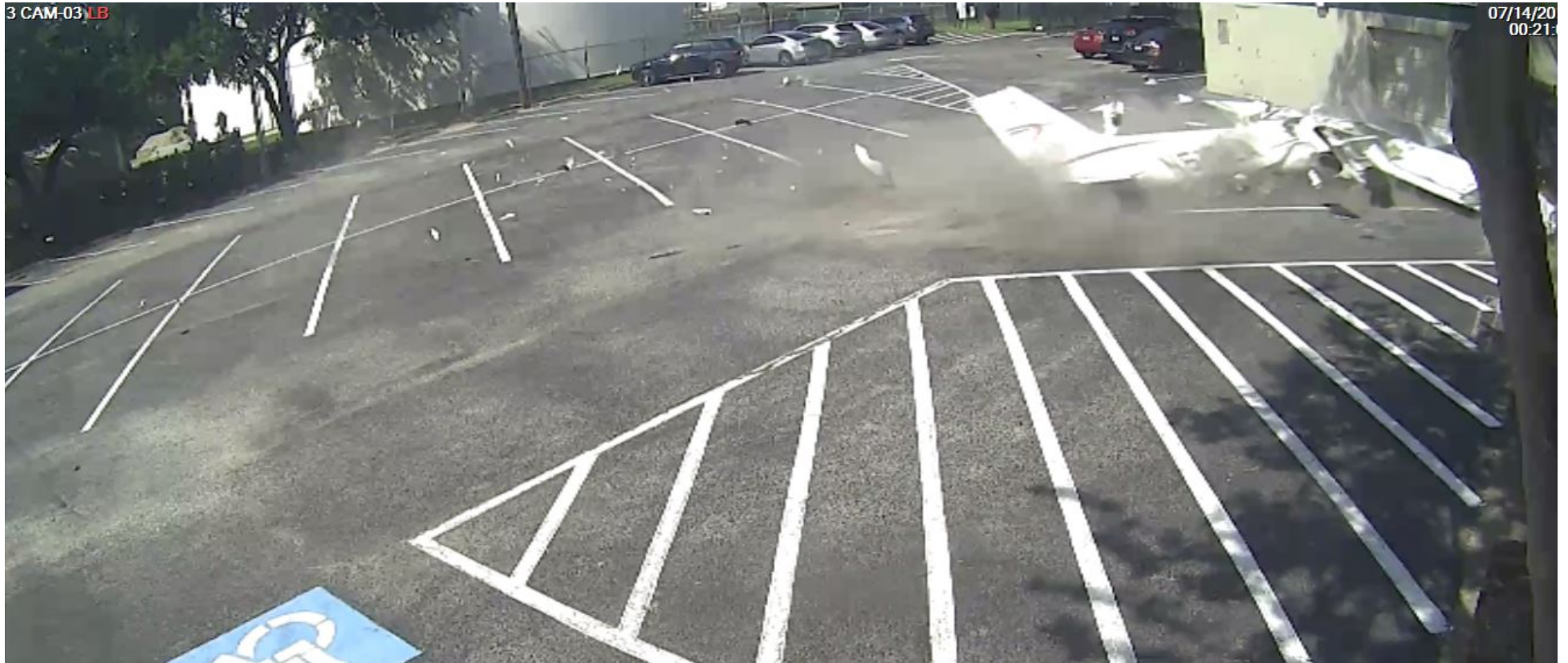
Photo 3 – Security camera footage of the airplane impacting the parking lot.