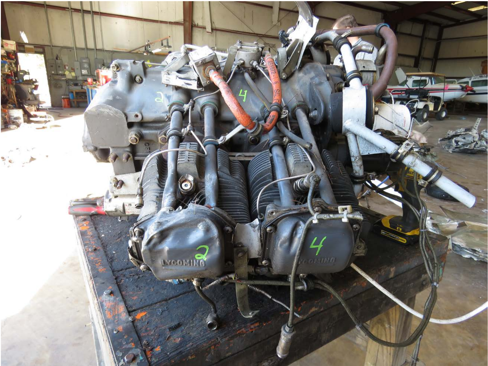
Photo 13 – Left side view of the engine (courtesy of Lycoming Engines).