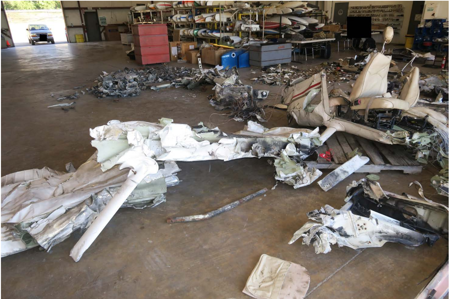
Photo 10 – View of the wreckage layout.