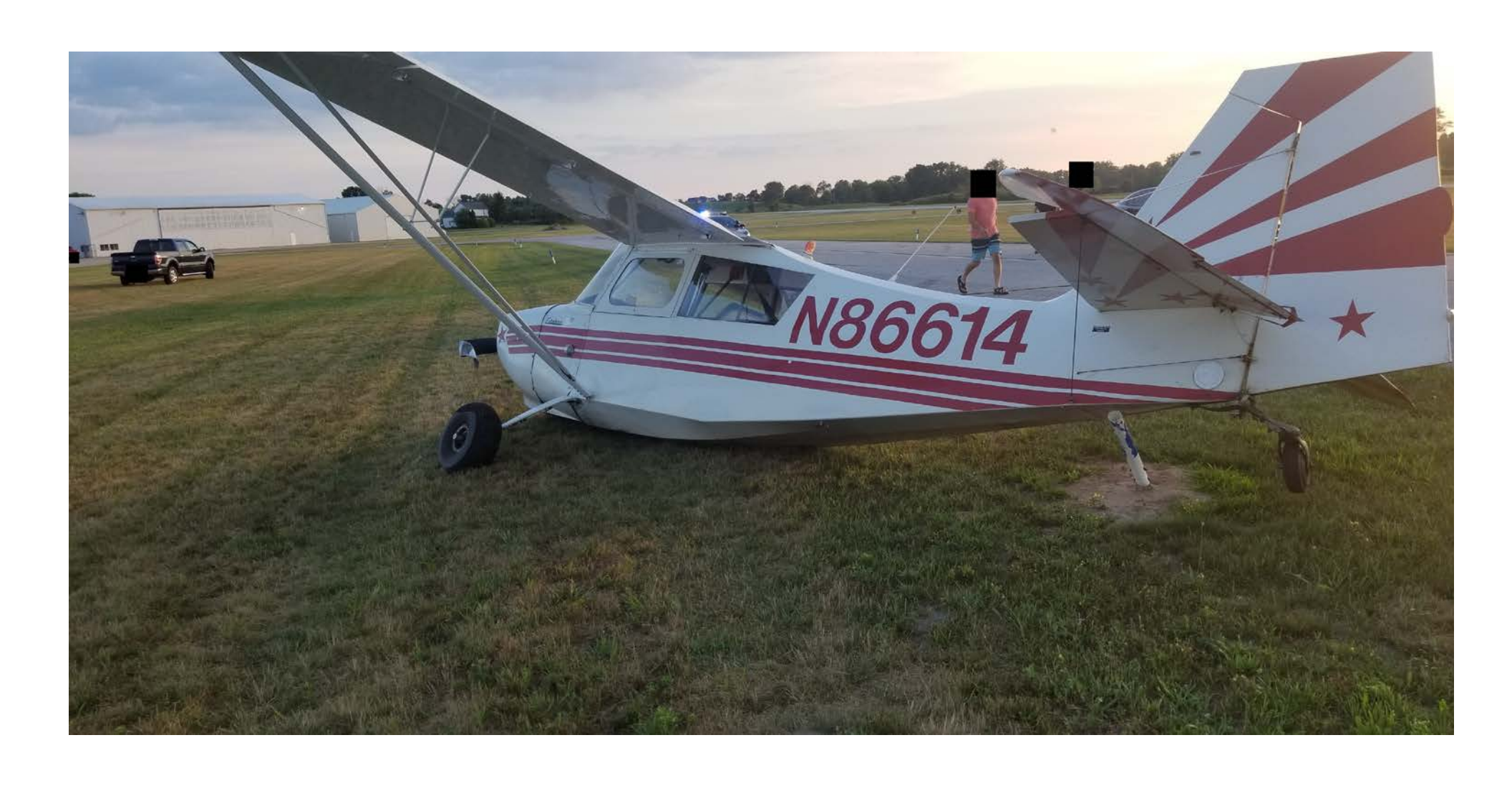
Photo 3 – View of the left side of the airplane.