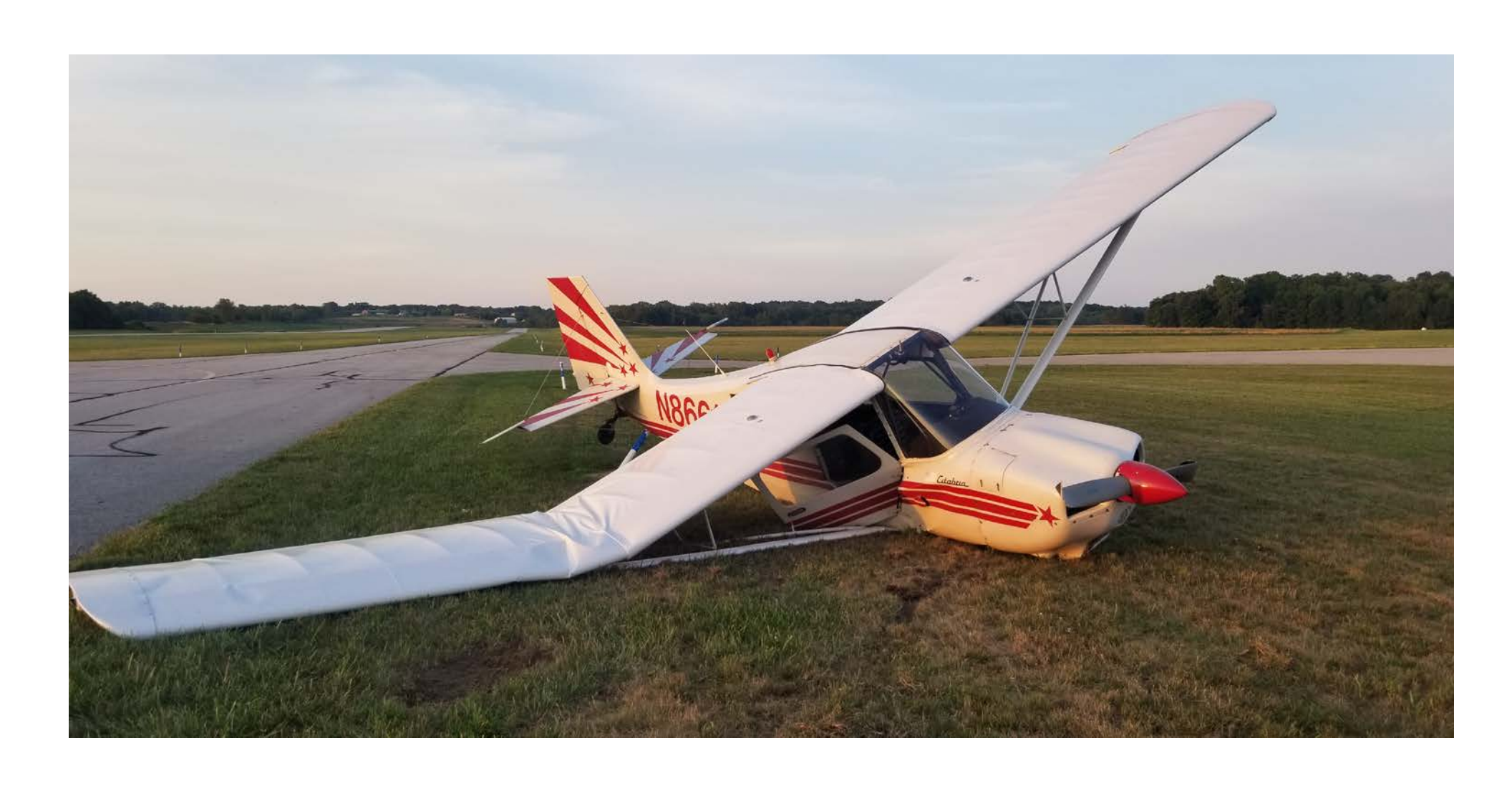
Photo 1 – View of the front of the airplane (courtesy of the Federal Aviation Administration).