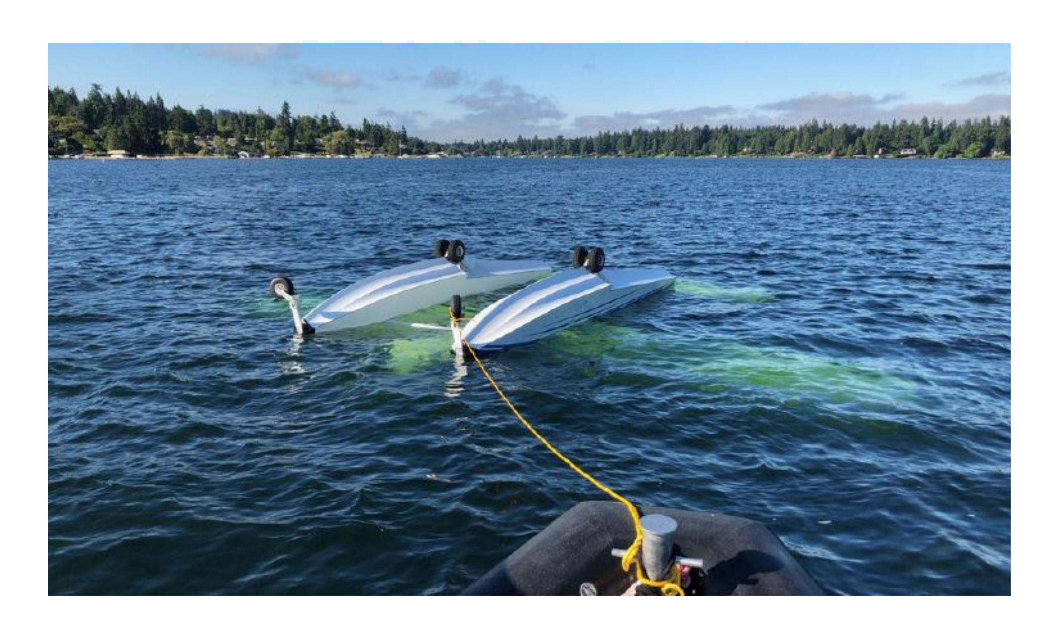
Photo 1 – View of nosed over amphibious float plane in a lake with extended landing gears