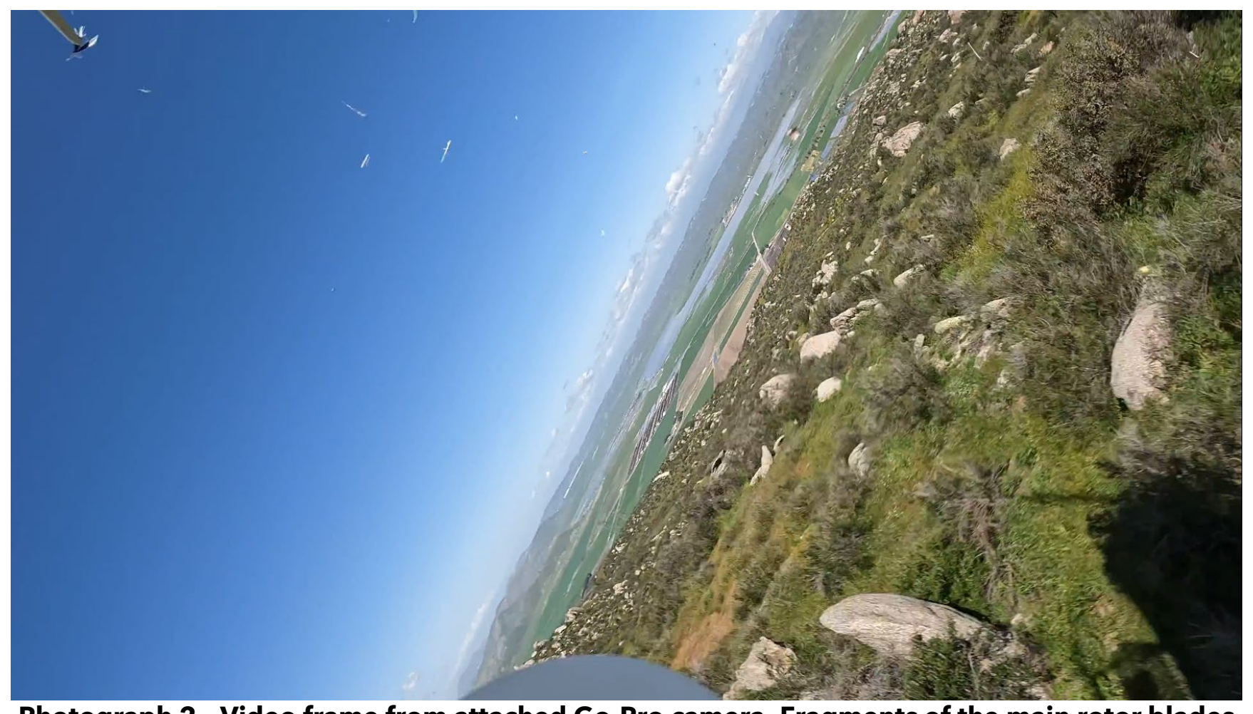
Photograph 2 - Video frame from attached Go-Pro camera. Fragments of the main rotor blades can be seen at the top of the frame.