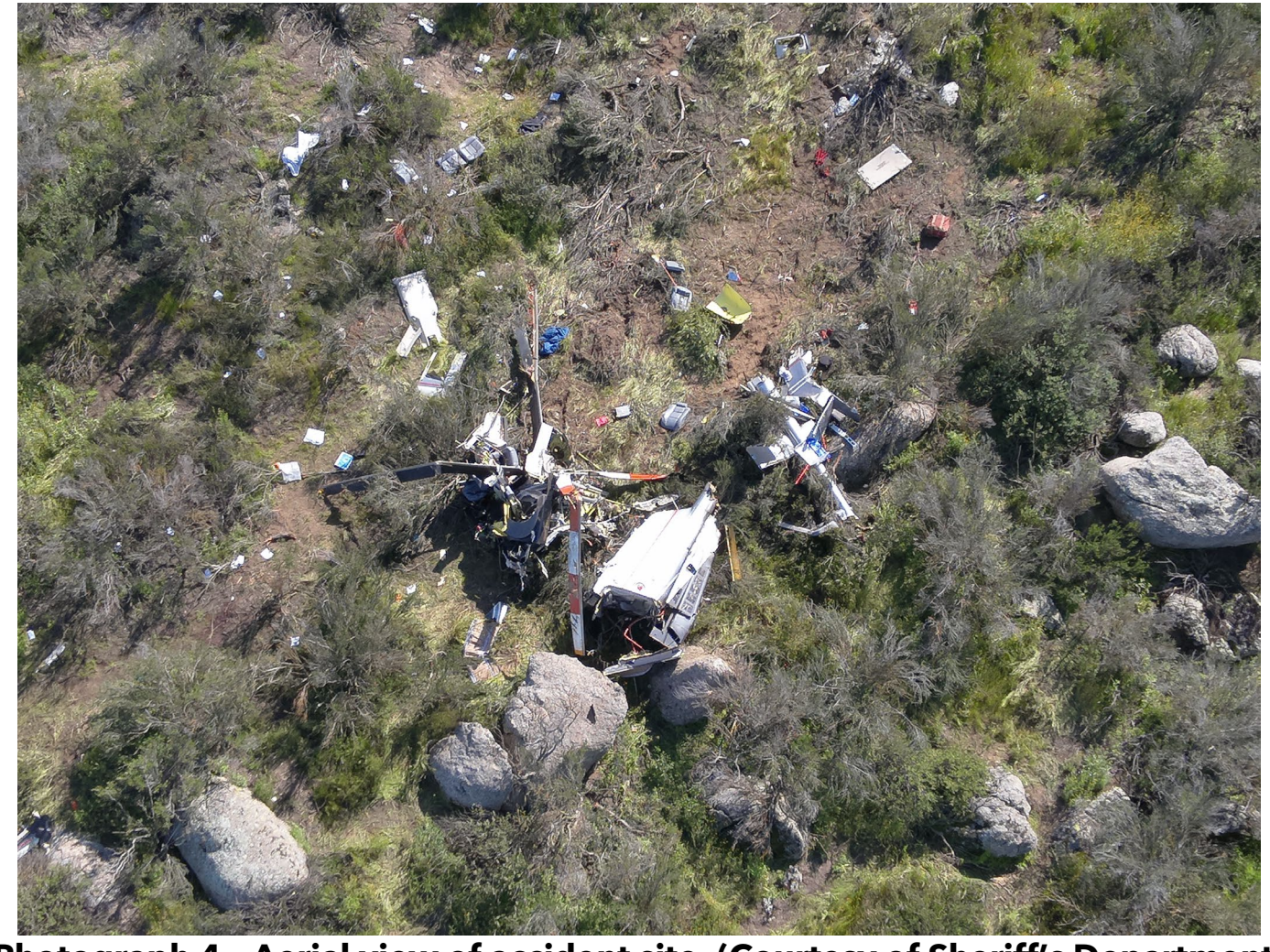
Photograph 4 - Aerial view of accident site.