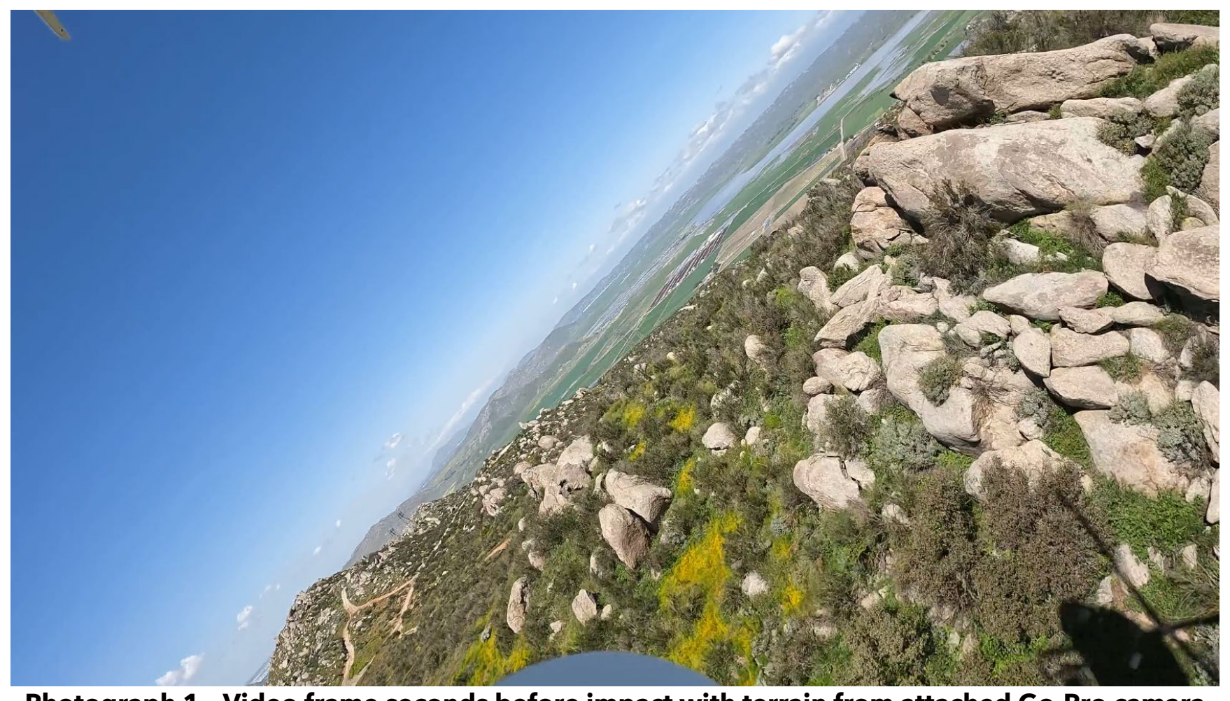
Photograph 1 - Video frame seconds before impact with terrain from attached Go-Pro camara on helicopter.