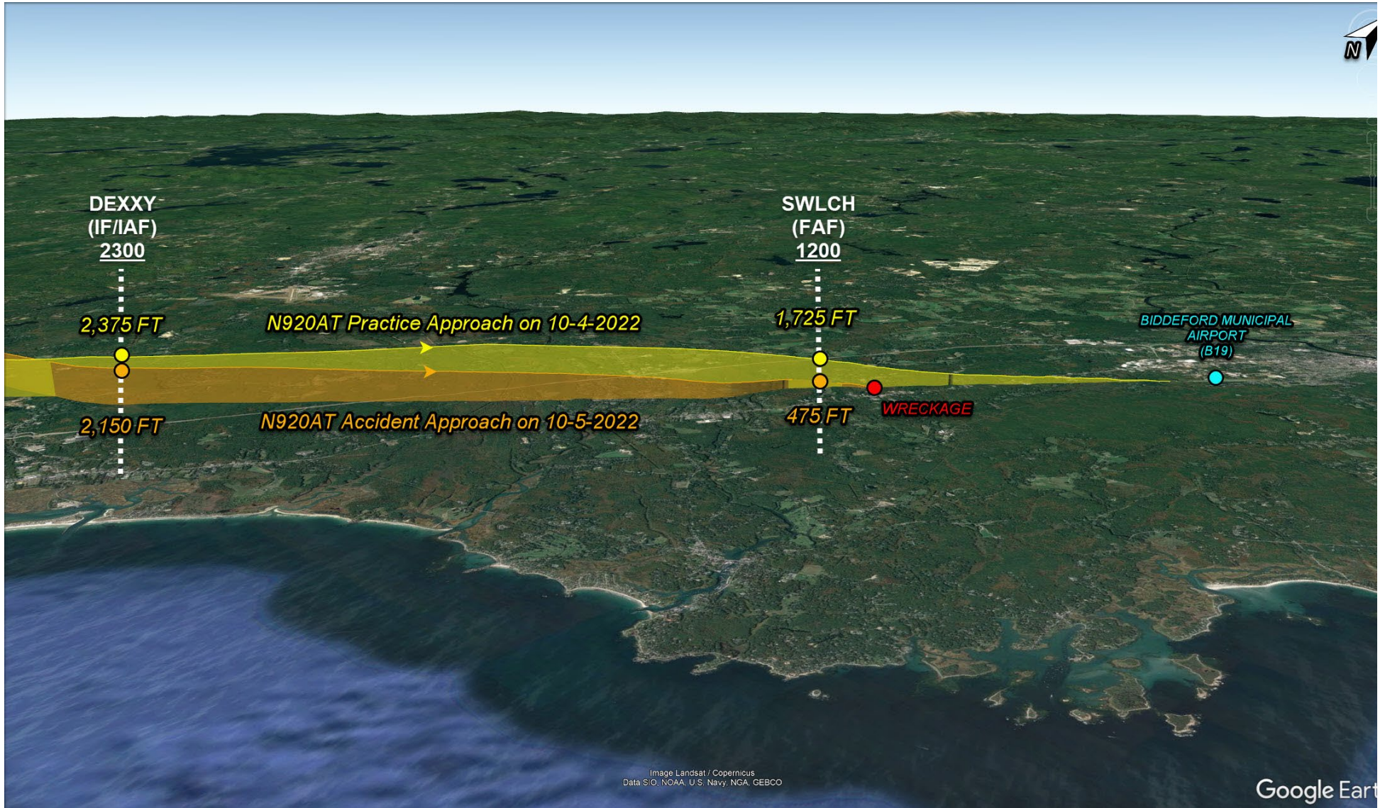
Photo 3 – Accident Track Superimposed over Practice Approach of Previous Day (NTSB)