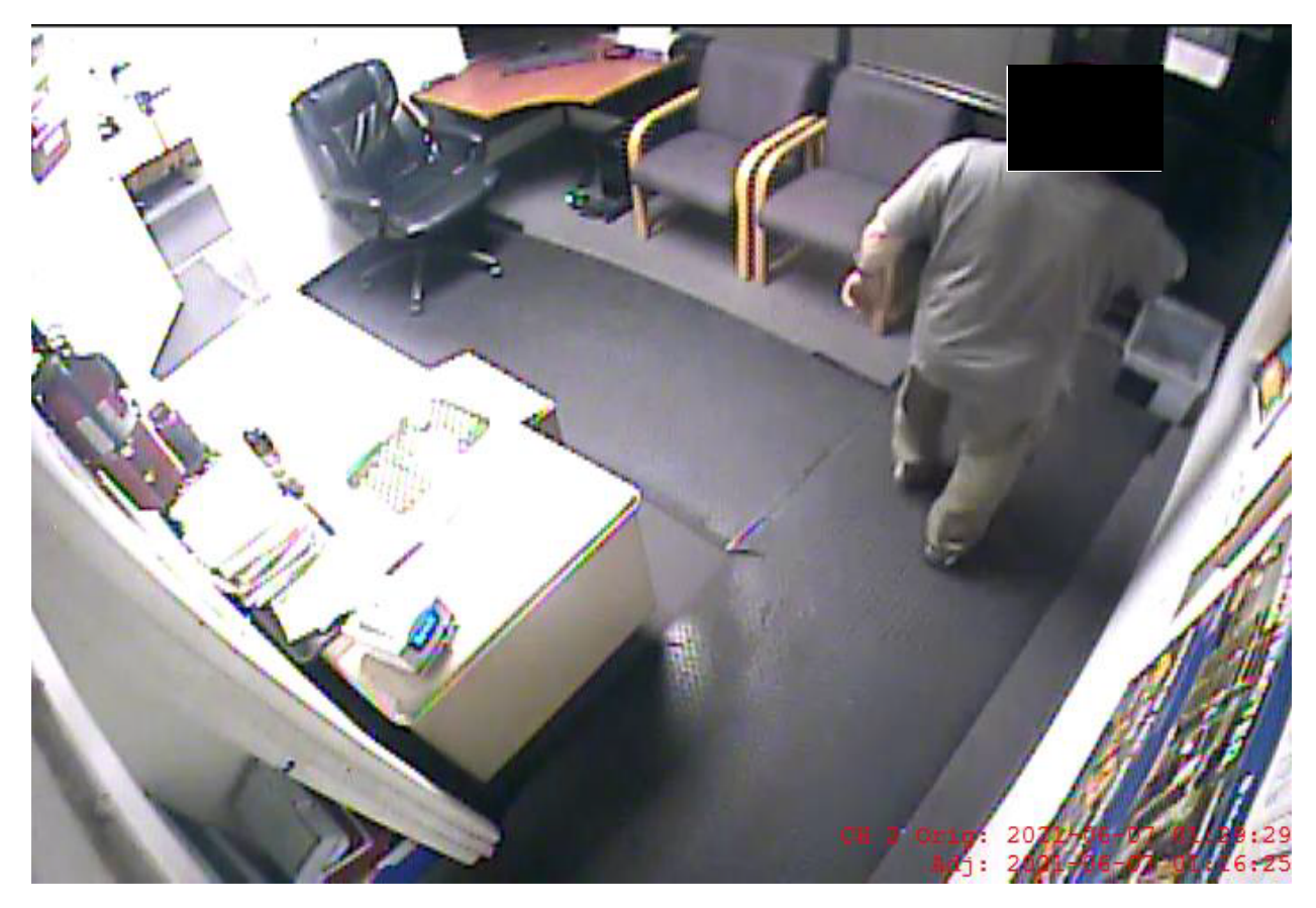
Figure 3. 06/07/2021, 01:16:25 - Driver leaving office.