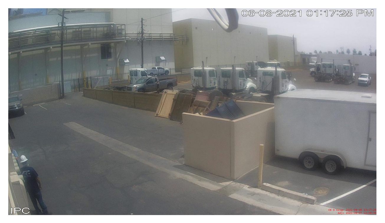
Figure 5. 06/07/2021, 13:08:56 - Driver parks POV near truck, checks out truck, then drives POV to parking spot.