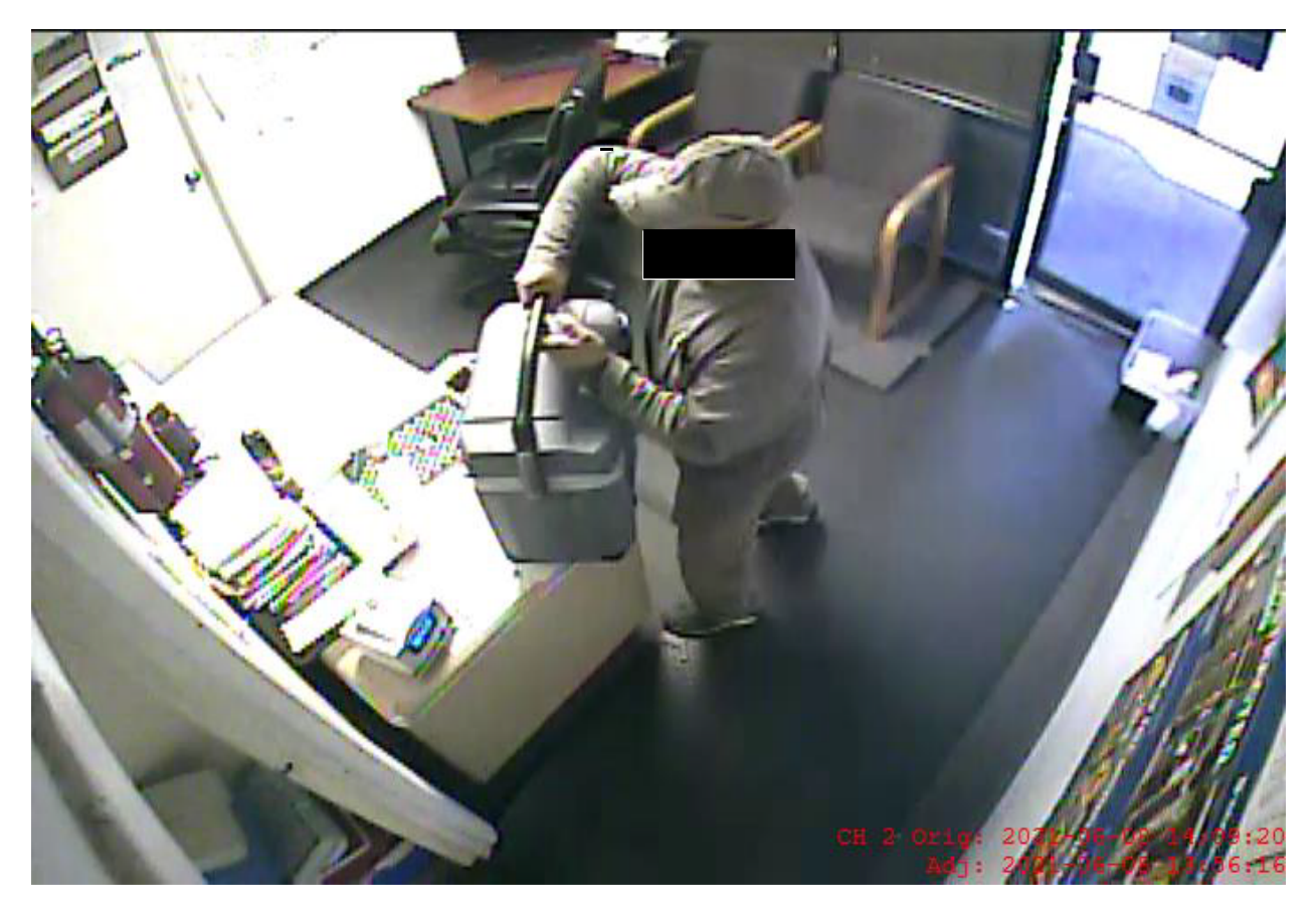
Figure 11. 06/08/2021, 13:56:16 - Driver in office.