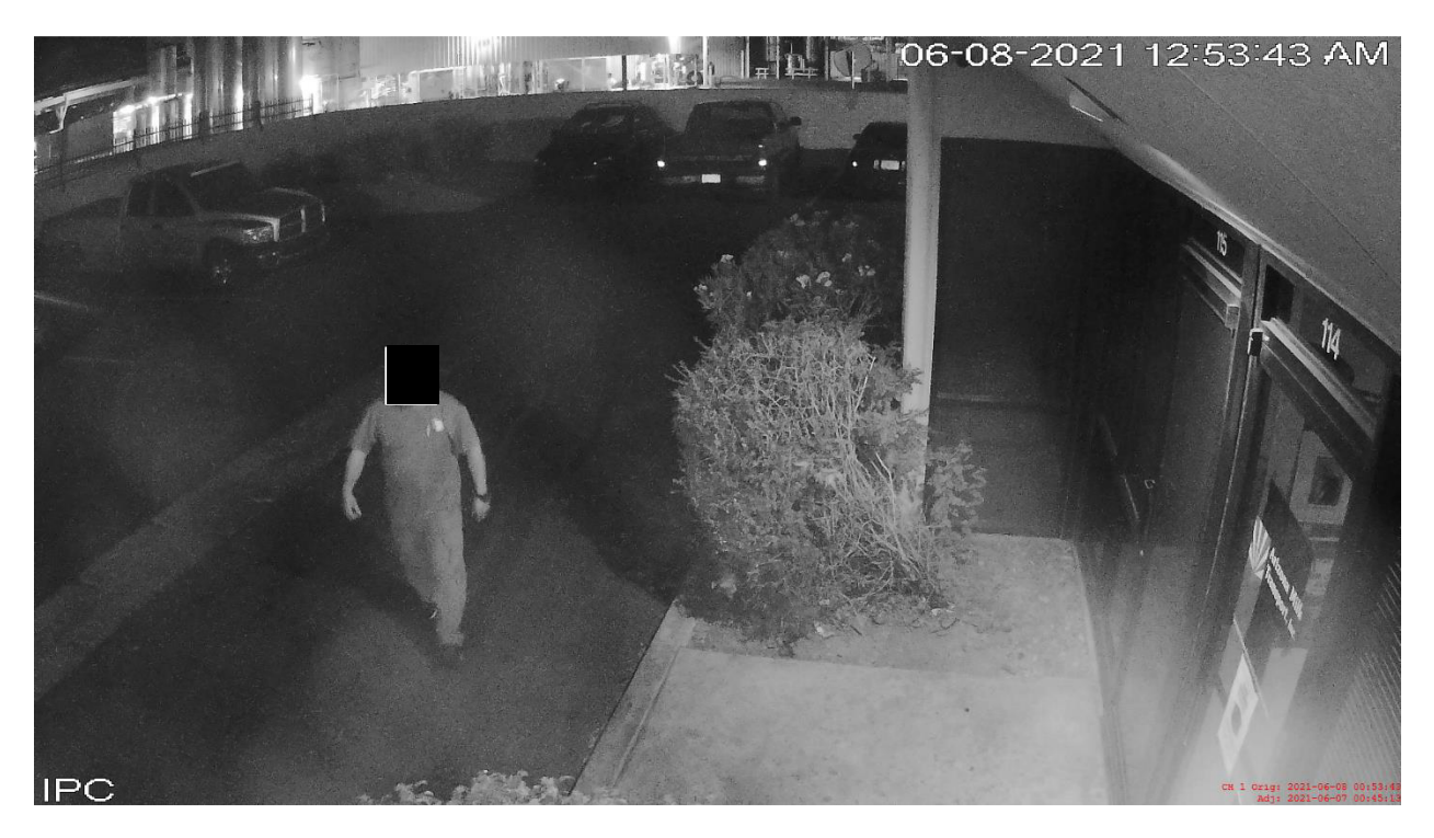
Figure 2. 06/07/2021 00:45:13 - Driver outside office, about to enter.