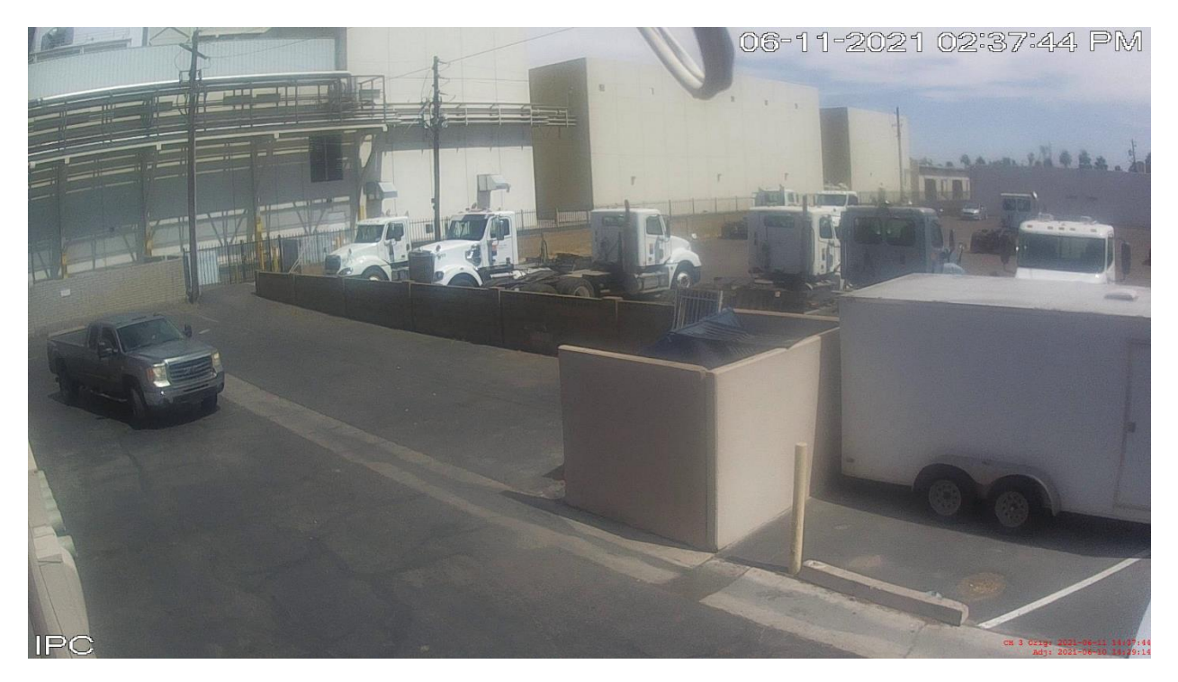
Figure 19. 06/10/2021, 14:29:14 - driver leaving in POV after accident.