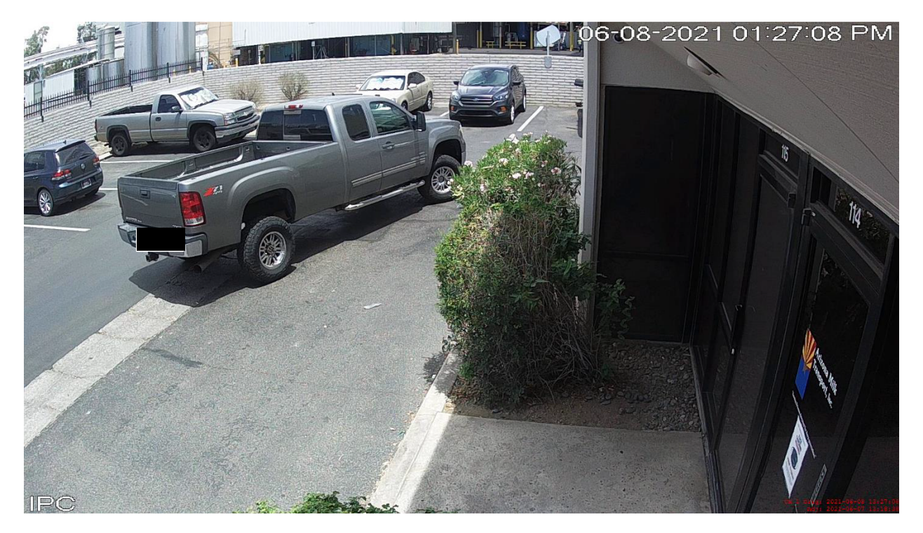
Figure 6. 06/07/2021, 13:18:38 - Driver's POV passing office door on way to parking spot.