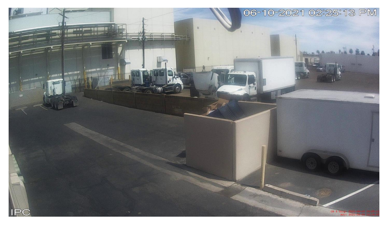
Figure 15. 06/09/2021, 14:16:43 - Driver POV parked next to truck, checked out truck, went to park POV.