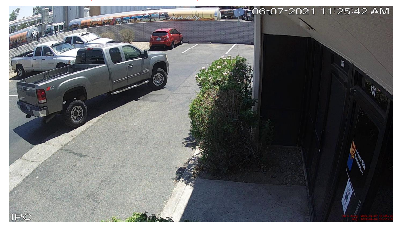
Figure 1. 06/06/2021, 11:17:13 - Driver in POV arrives at office.

Disclaimer : All times reflected in the following photo titles do not match video camera still image due to camera recording device not in sync with accurate time. For additional information, see NTSB Vehicle Recorder Division Security Video - Time Correlation Report in the Docket.