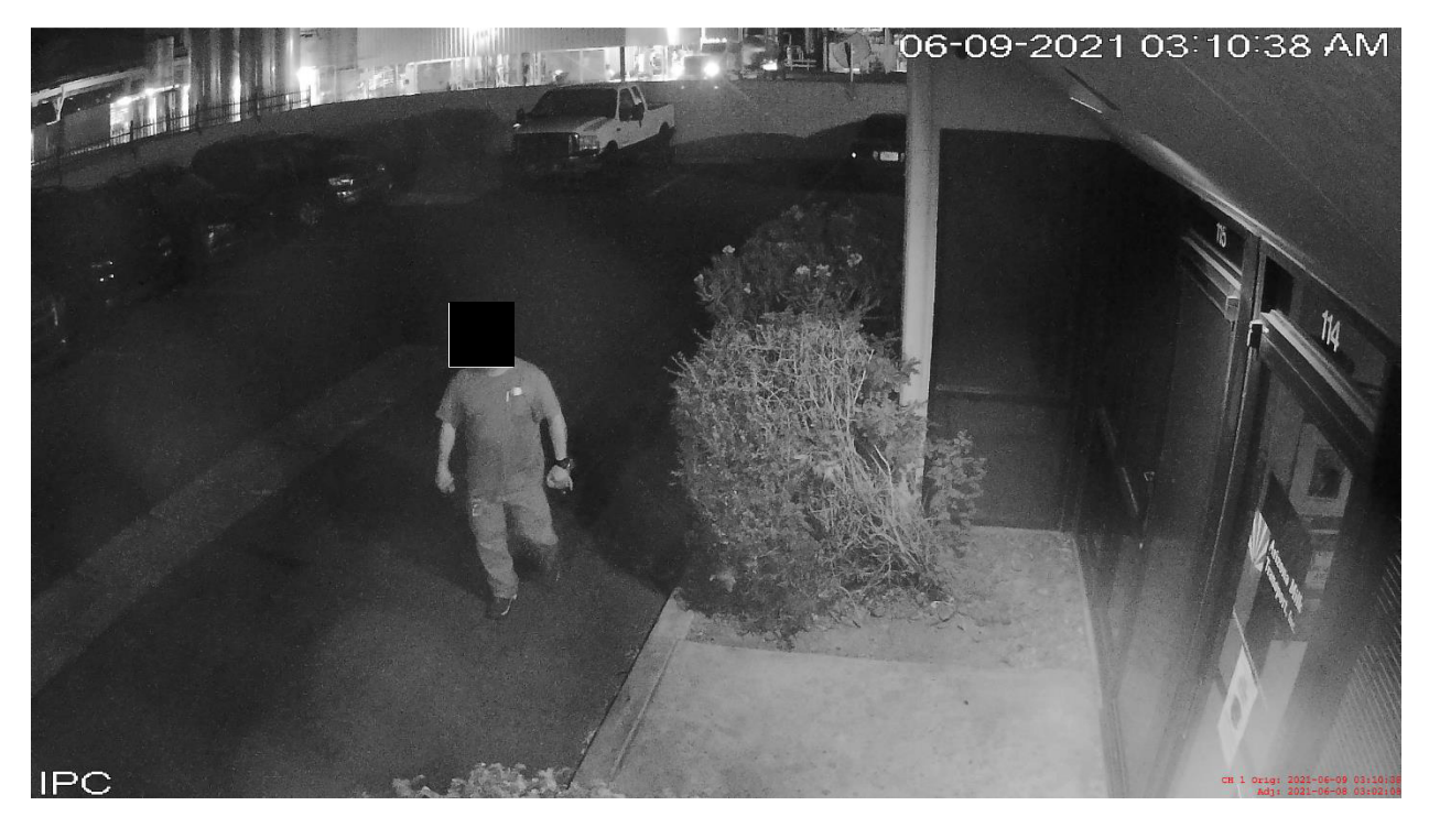
Figure 8. 06/08/2021, 03:02:08 - Driver returns to office.