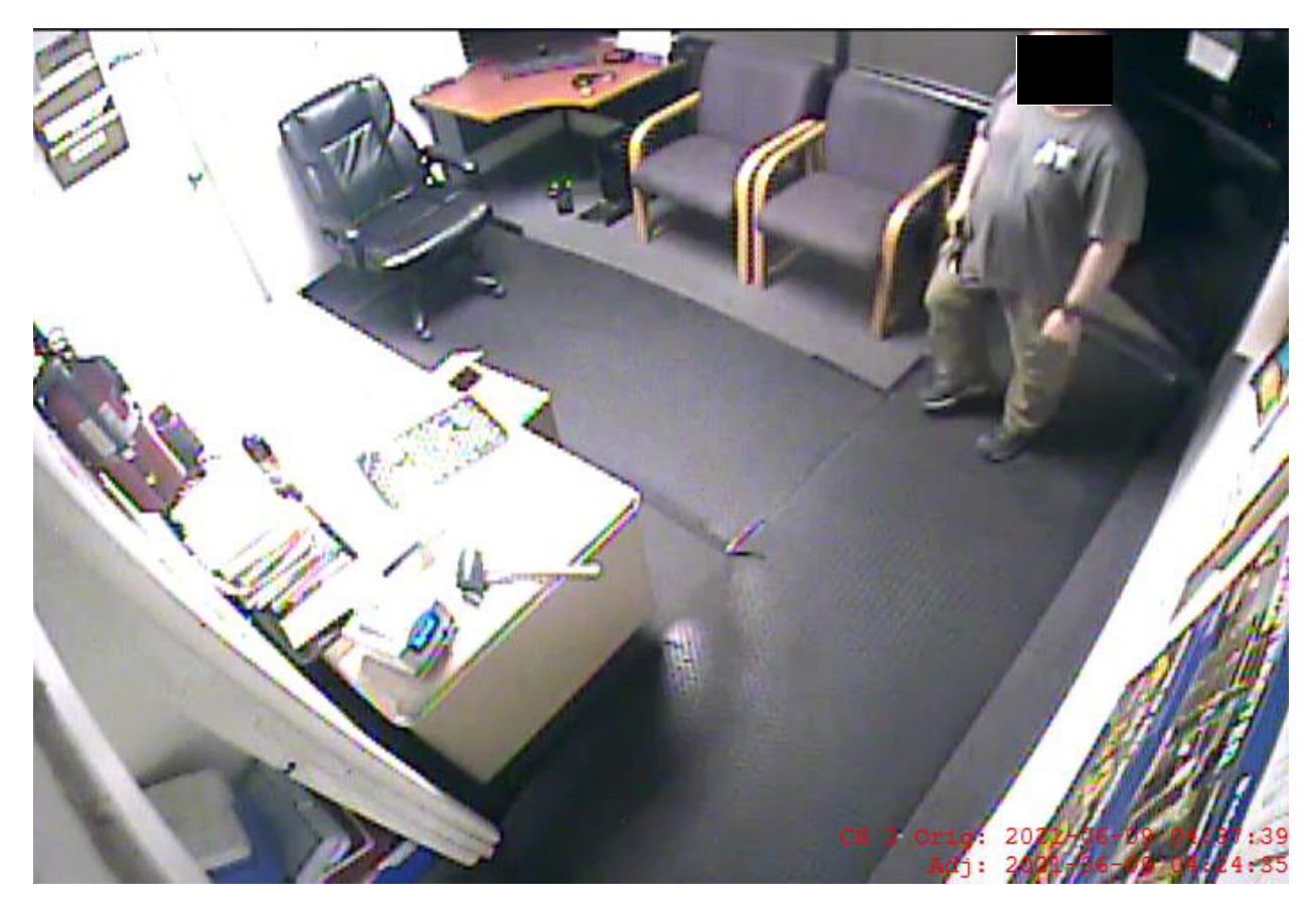
Figure 14. 06/09/2021. 04:24:35 - Driver enters office.