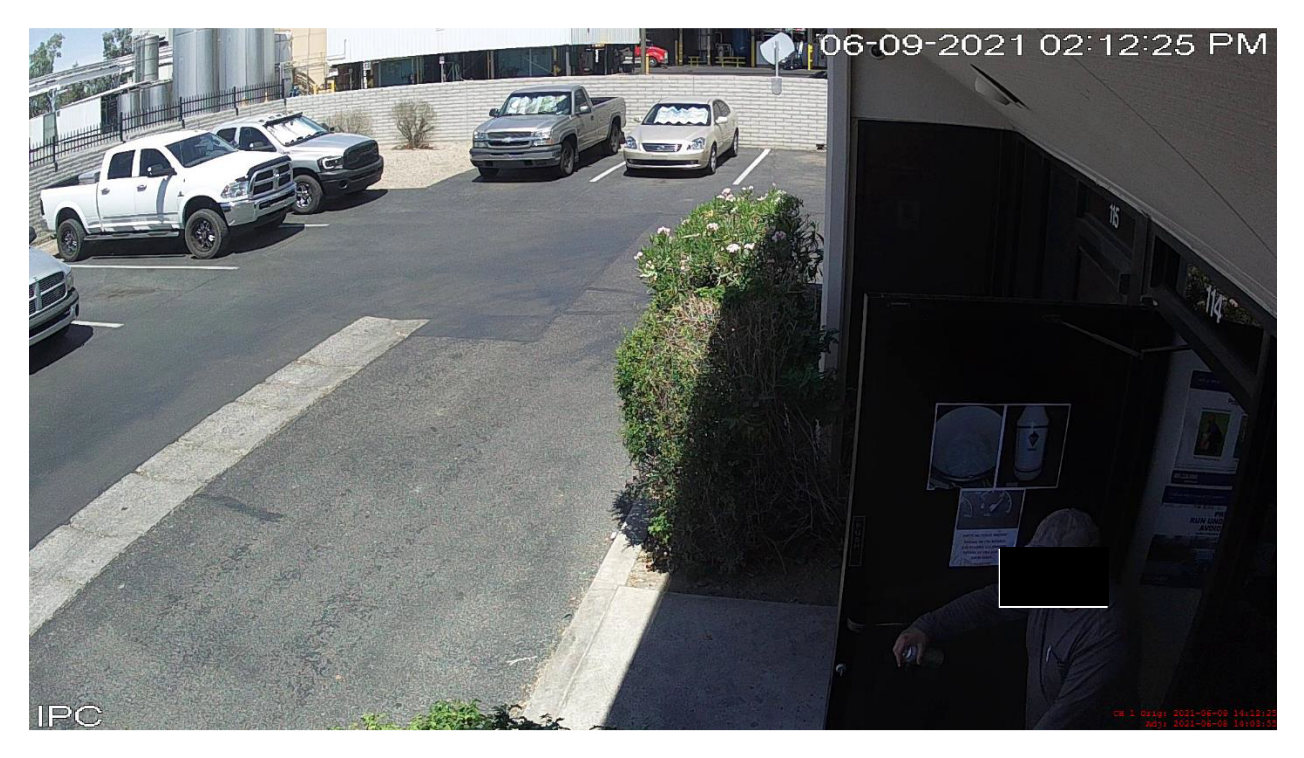
Figure 12. 06/08/2021, 14:03:55 - driver leaving office.