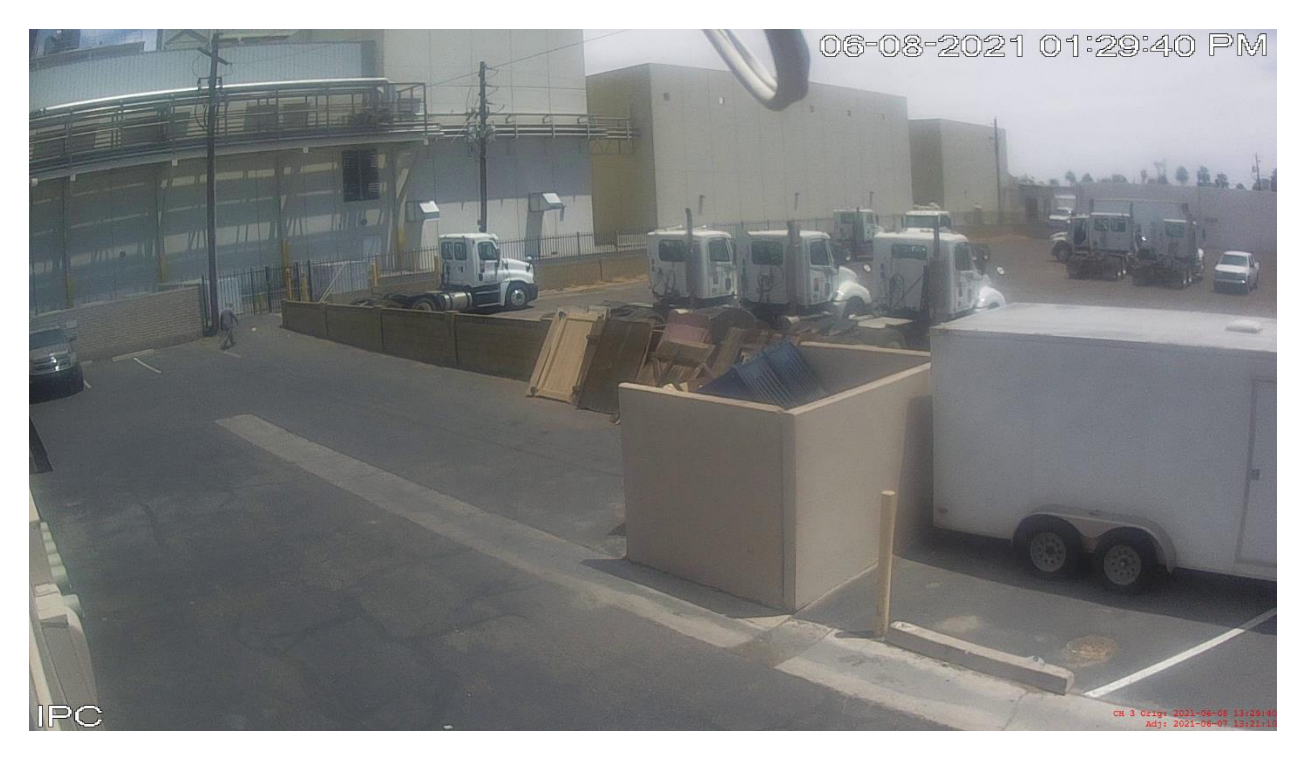
Figure 7. 06/07/2021, 13:21:10 - after parking POV, driver returns to truck and drives away.