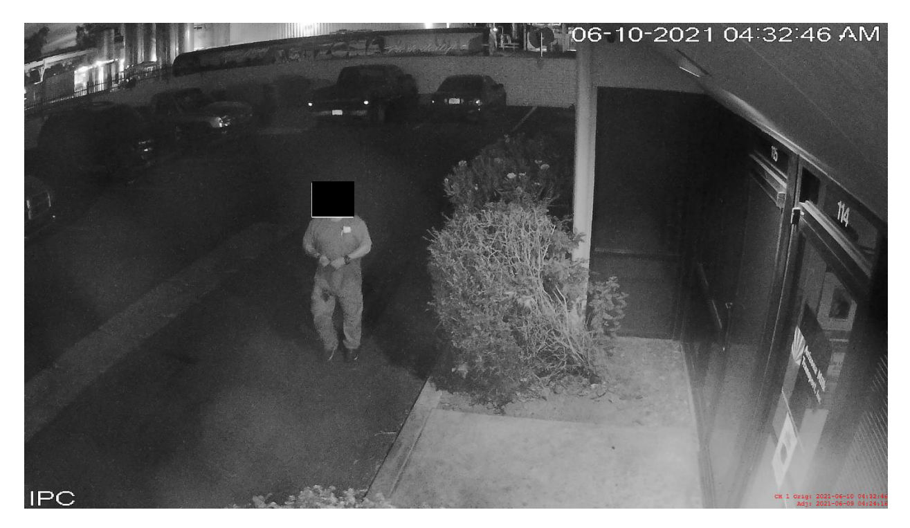
Figure 13. 06/09/2021, 04:24:16 - driver returns to office.