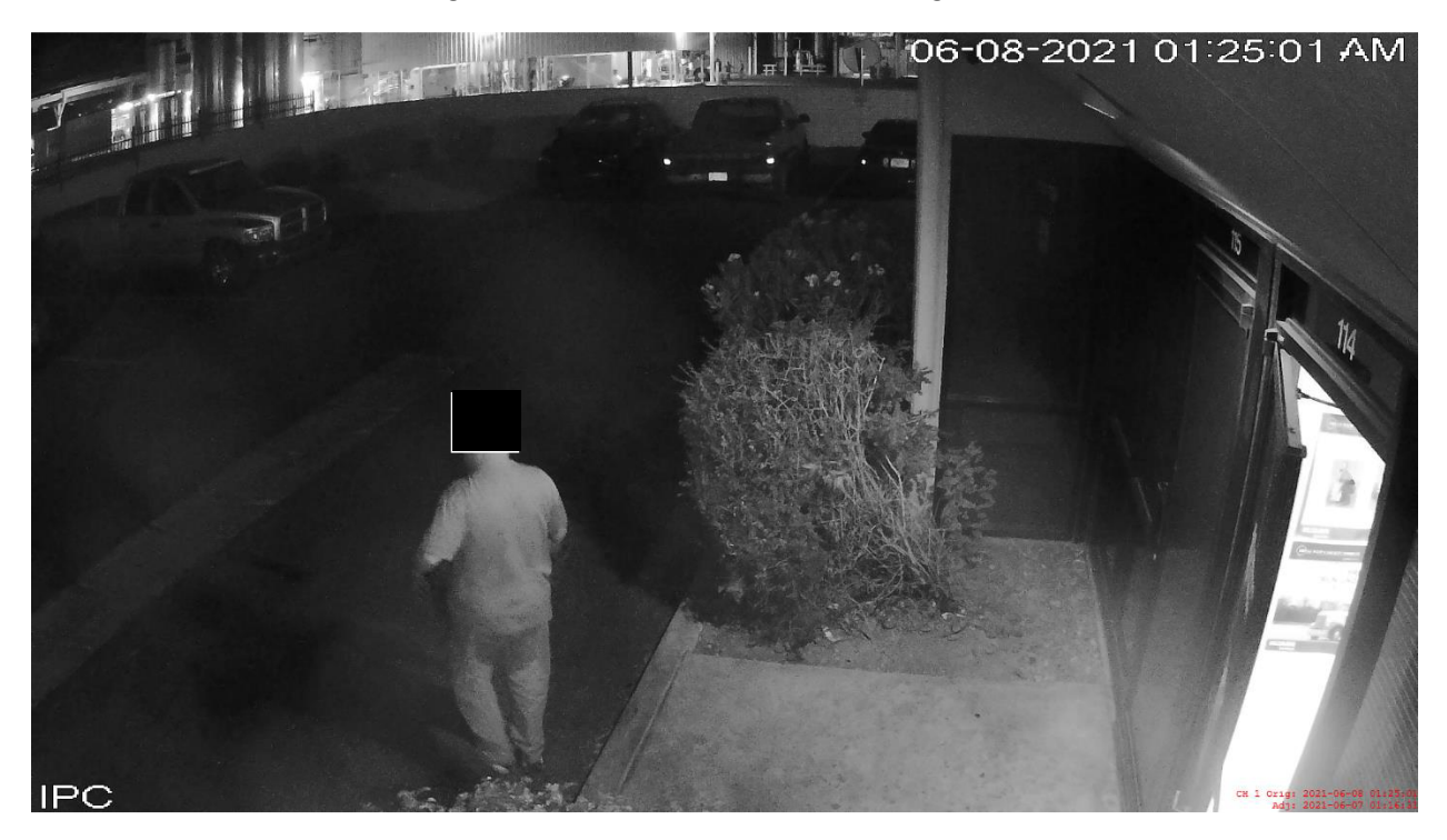
Figure 4. 06/07/2021, 01:16:31 - Driver leaving office.