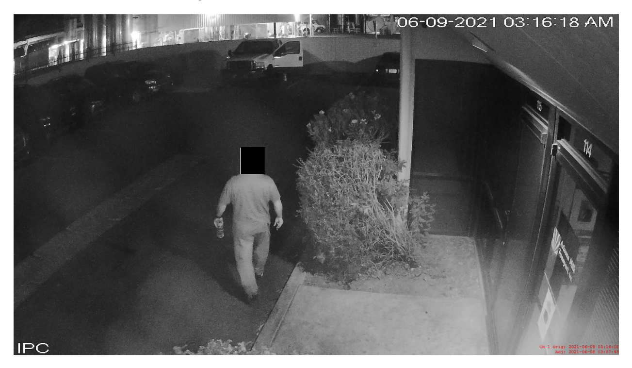
Figure 10. 06/08/2021, 03:07:48 - Driver leaves office.