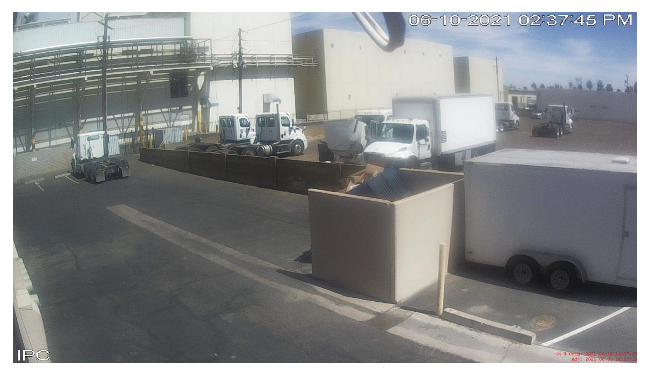
Figure 17. 06/09/2021, 14:29:15 - after parking POV, driver returns to truck and departs. Last sighting before accident.