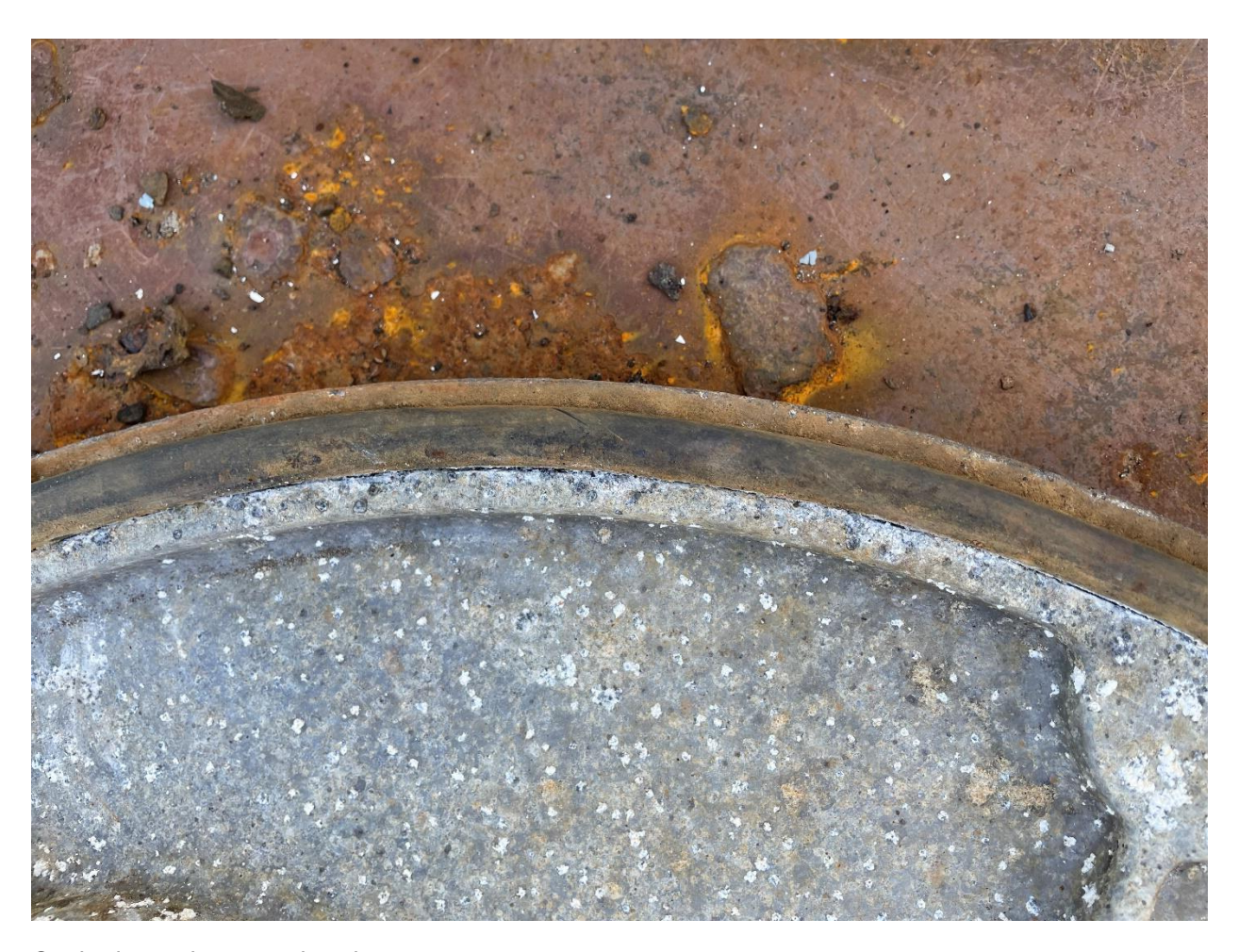
Gasked, port lazarette hatch