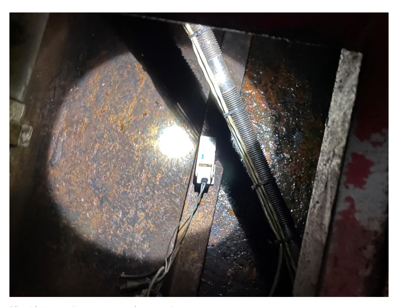
Bilge high water float sensor, engine room forward