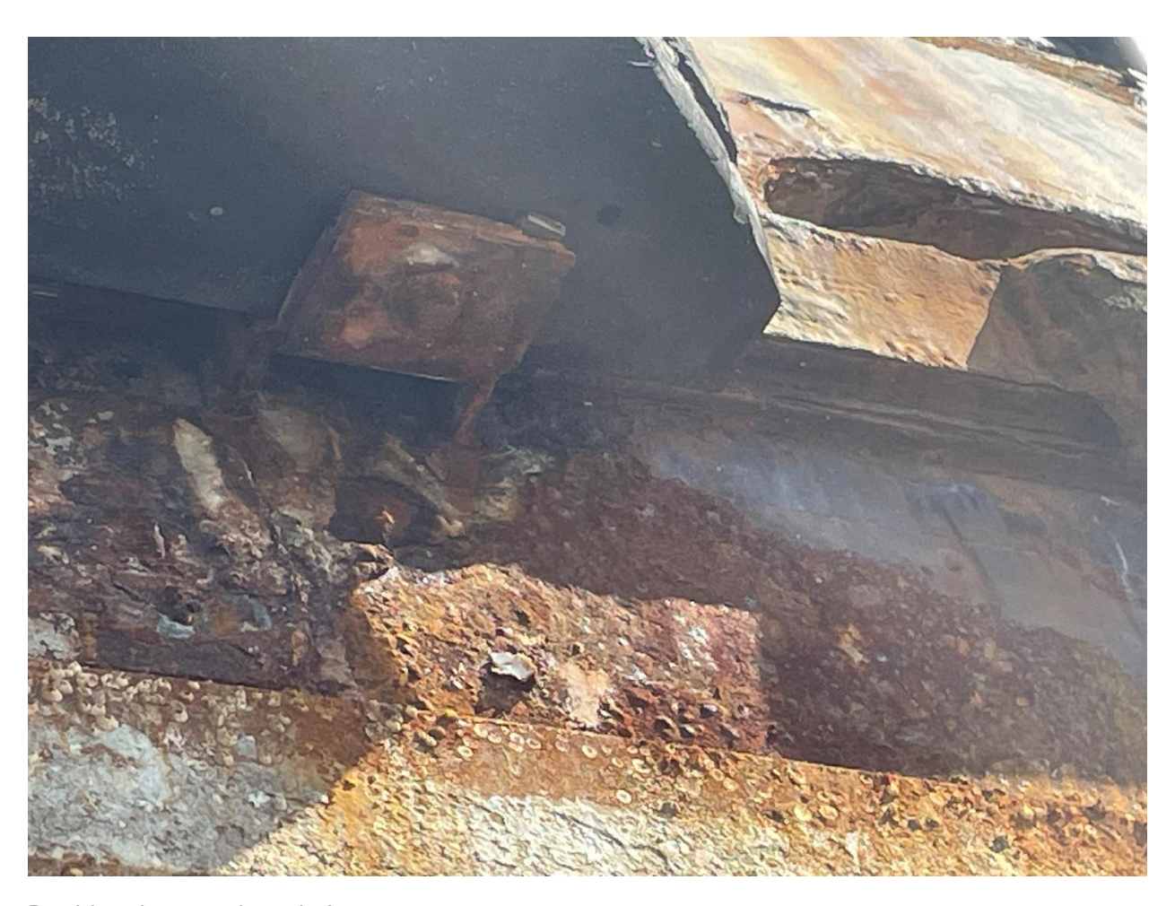
Doubler plate, starboard aft