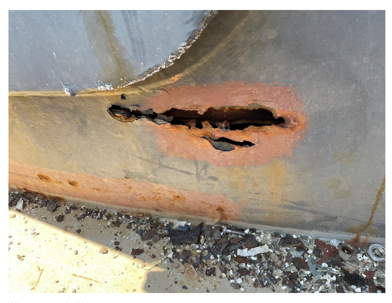
Wastage, port deckhouse