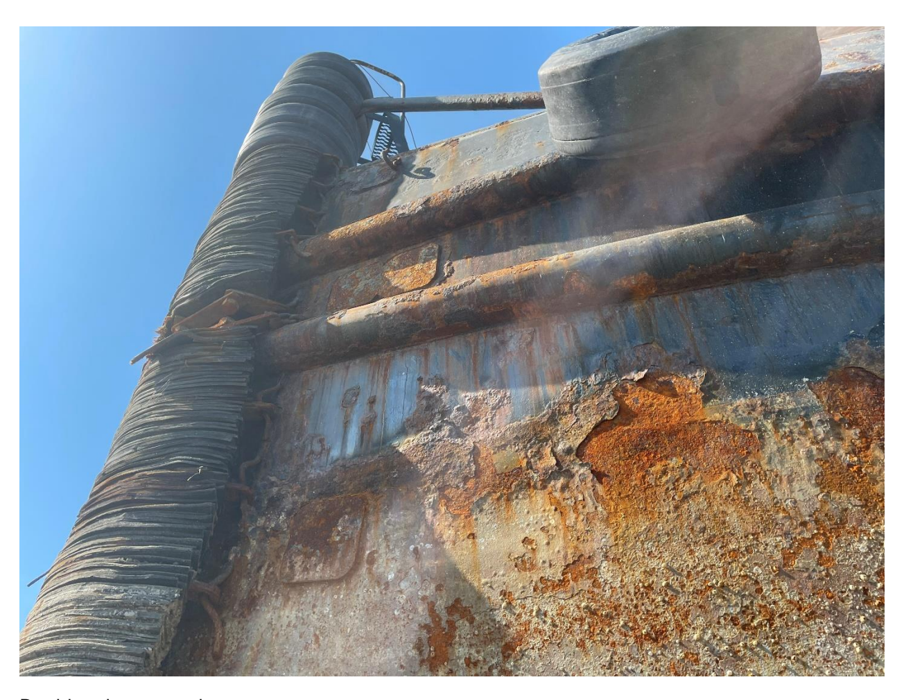
Doubler plates, port bow