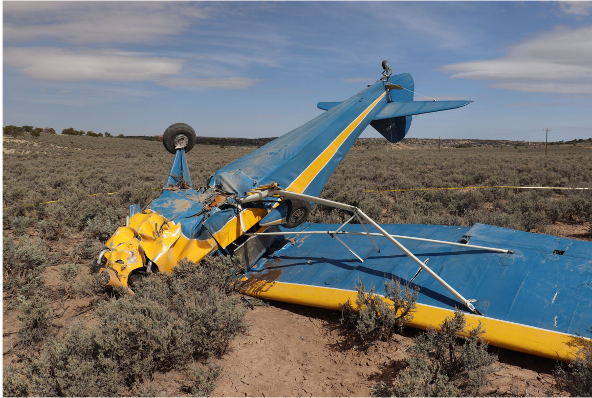
Photograph 1 - View of nosed over airplane