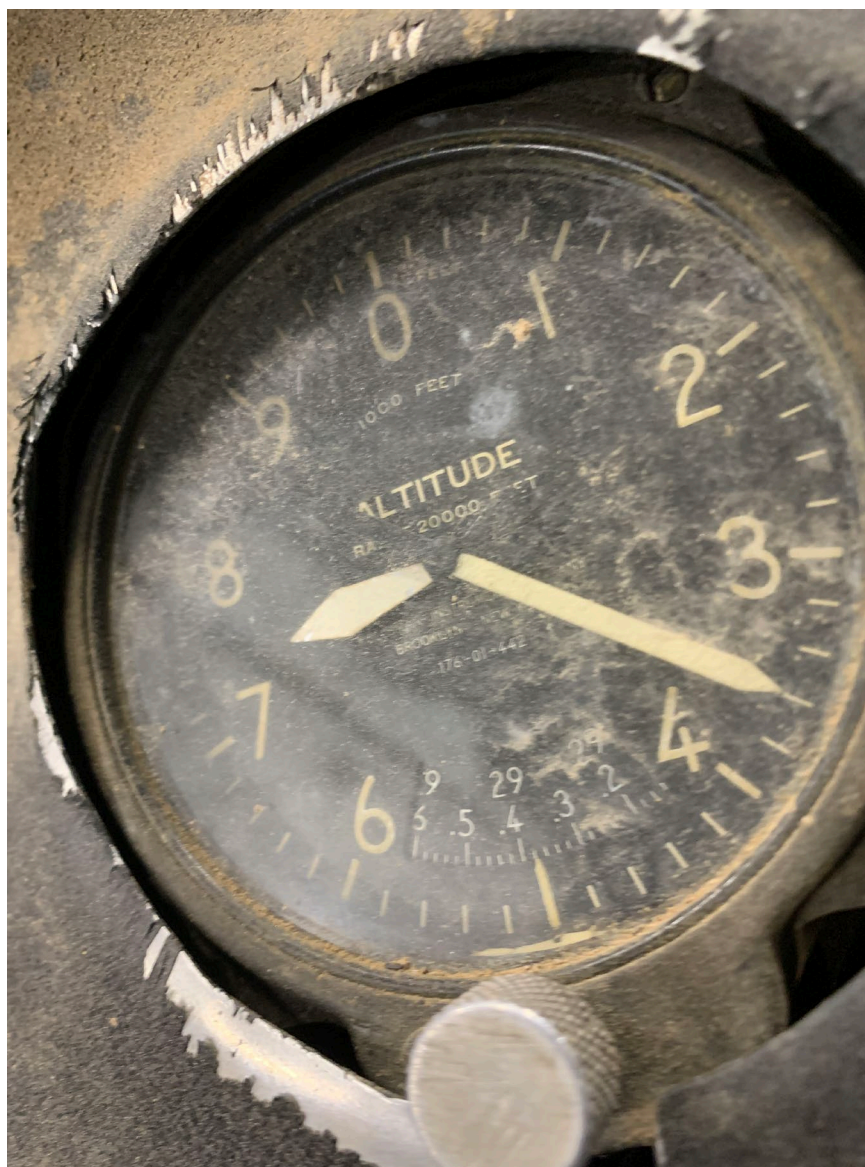
Photograph 4 - View of altimeter and Kohlmann's window