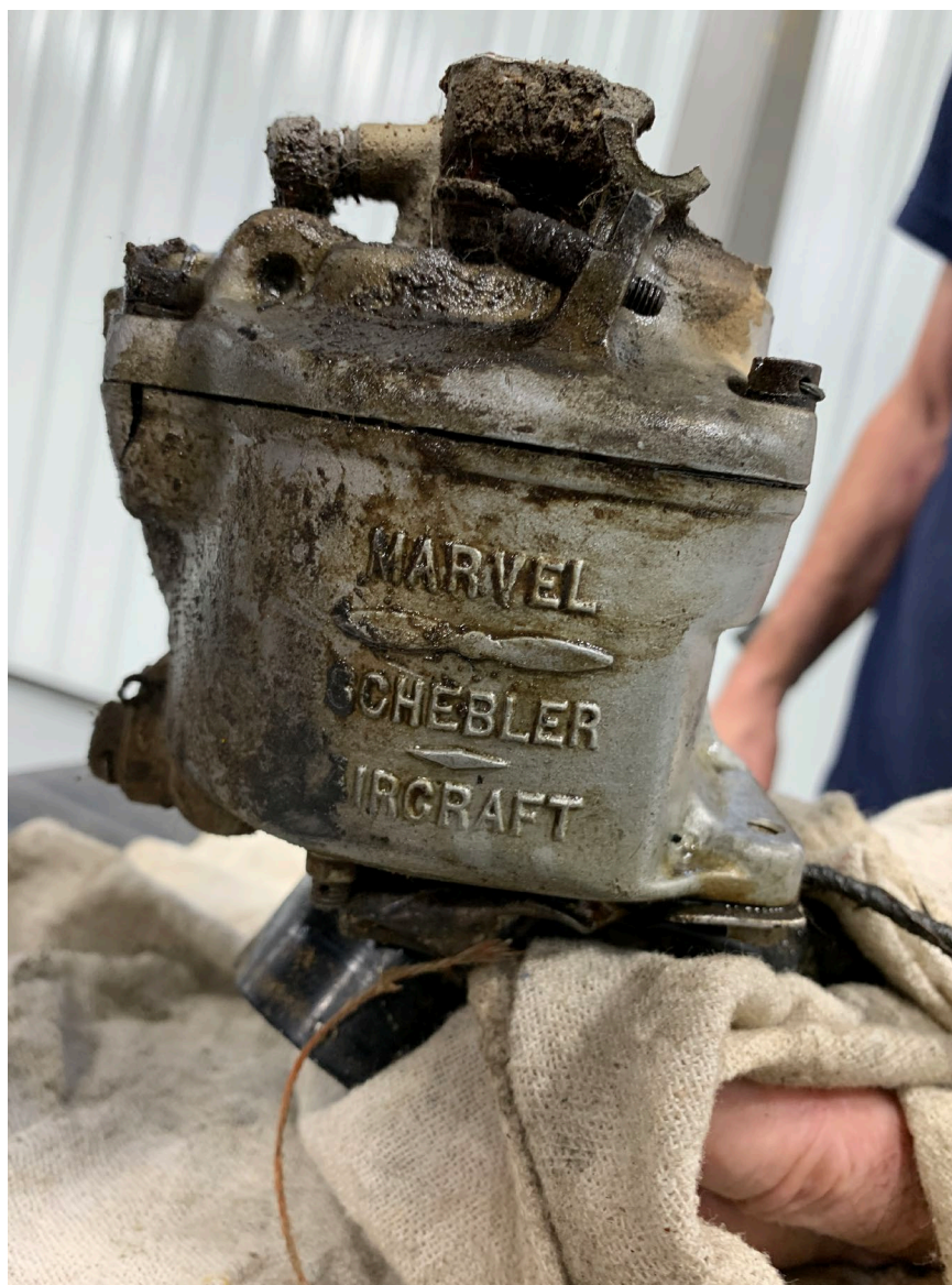
Photograph 6 - View of damaged carburetor during engine examination