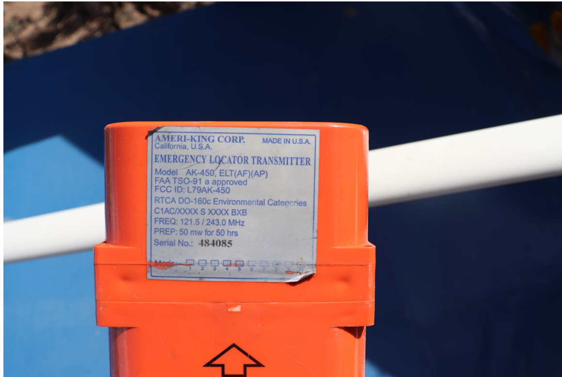
Photograph 2 - View of removed ELT