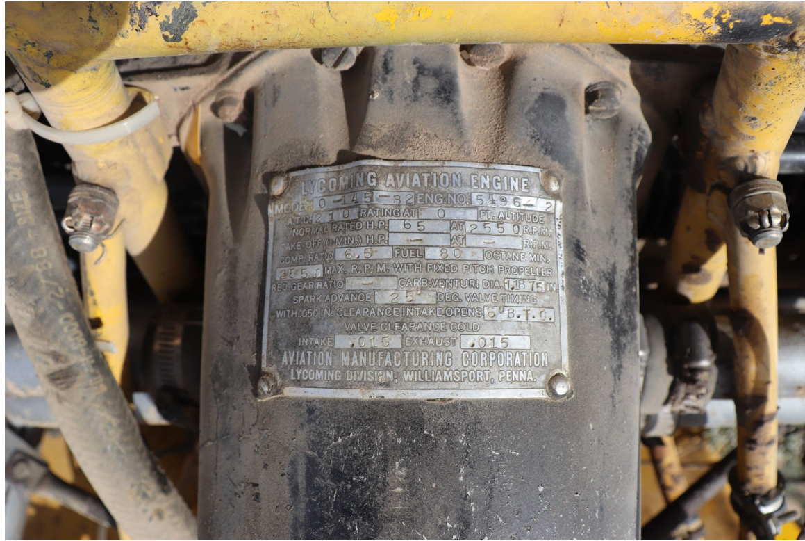
Photograph 3 - View of engine data plate