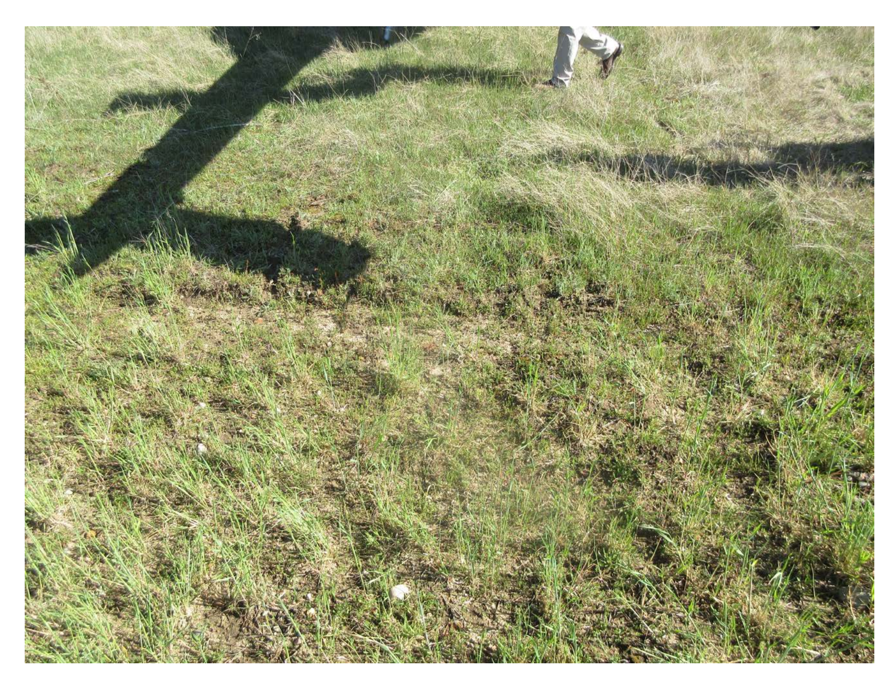
Photo 2 - Ground furrows consistent with a hard landing