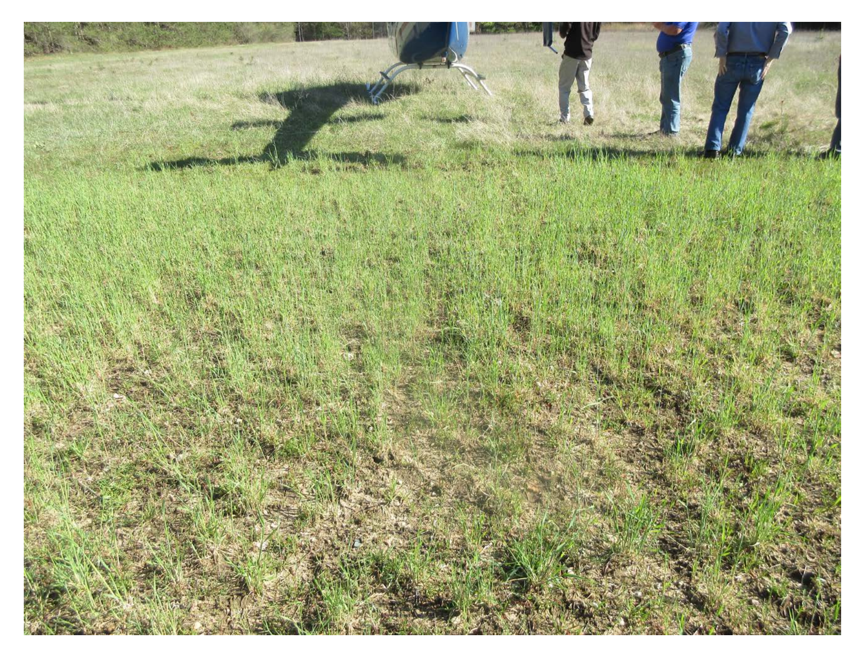
Photo 1-Skid marks in the grass depict where the helicopter touched down and slid