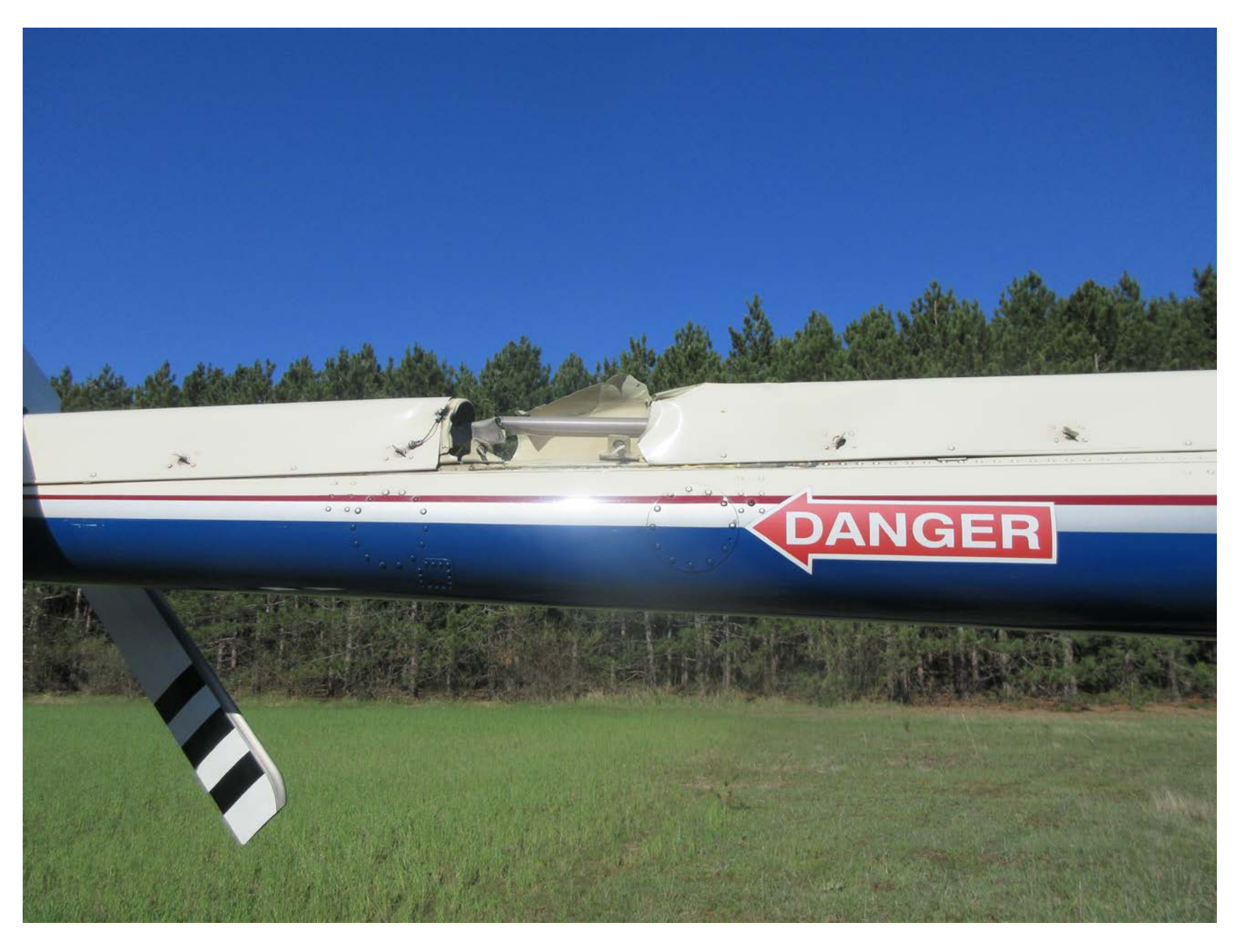
Photo 4 - Tail boom covering torn away, exposing severed tail rotor driveshaft