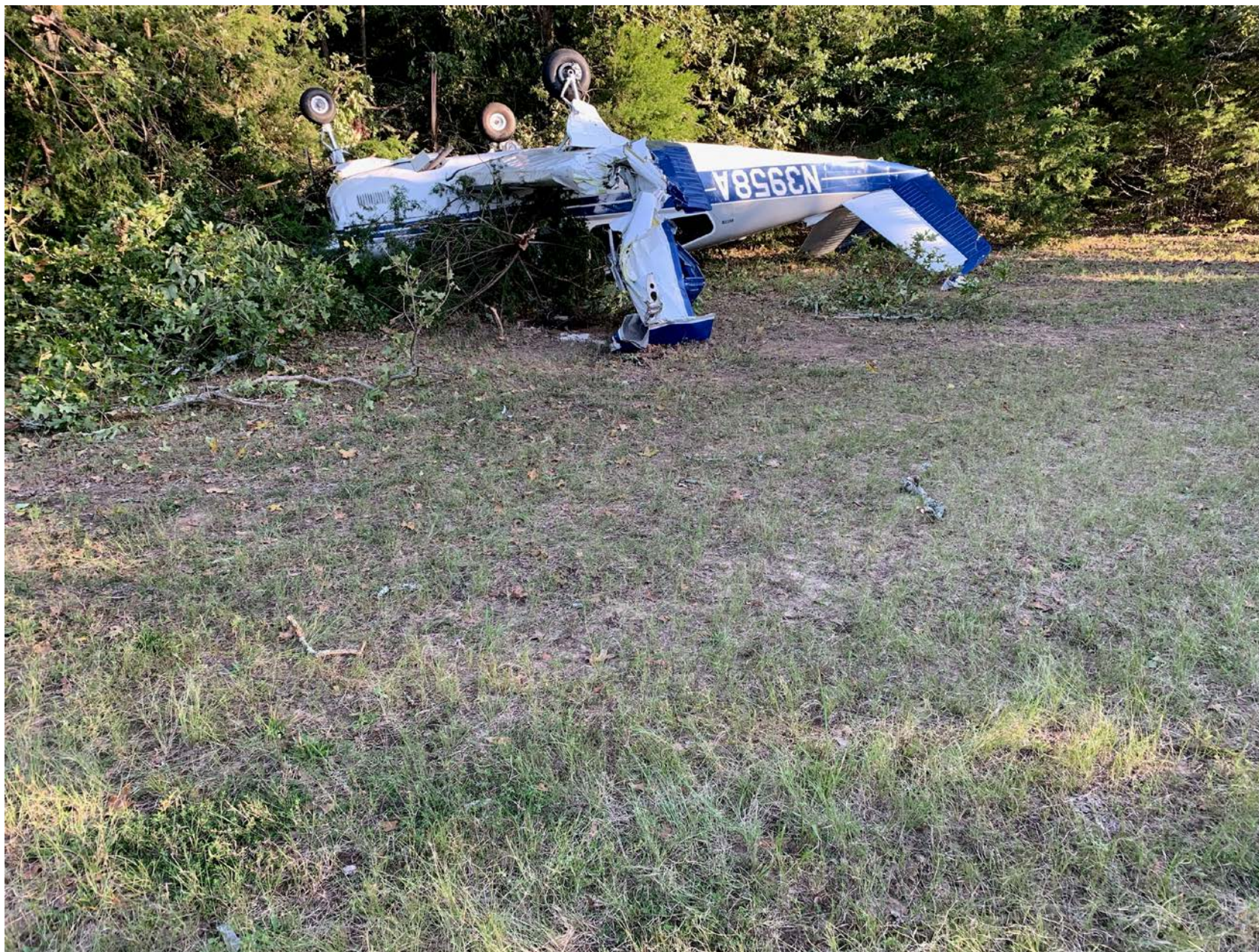
Photo 1 – Supplied view of the right side of the inverted airplane.