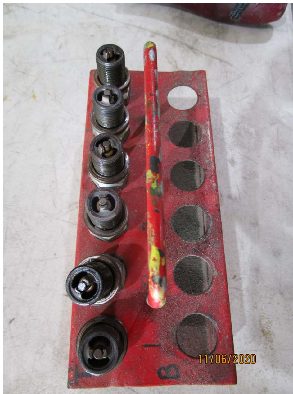
Photo 6 - Supplied view of removed sparkplugs.