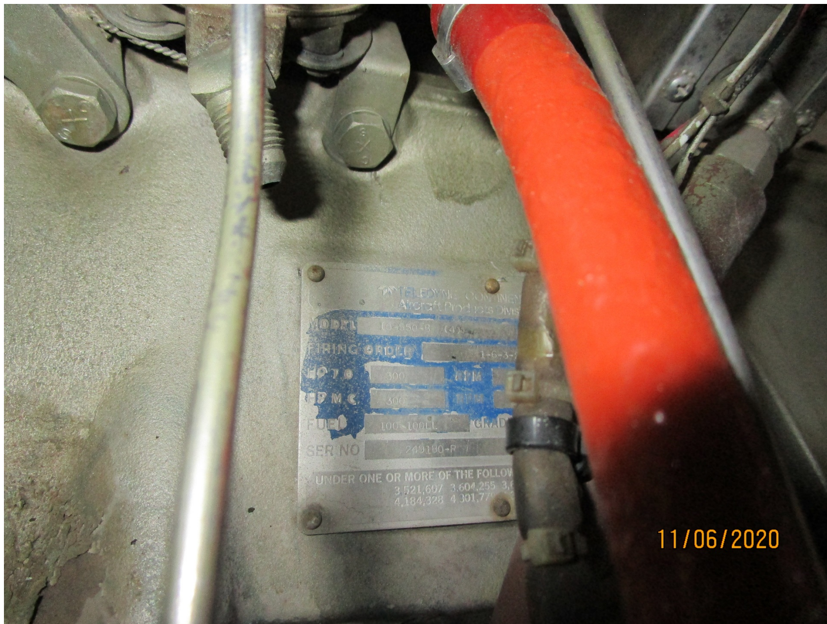
Photo 5 - Supplied view of the engine dataplate.