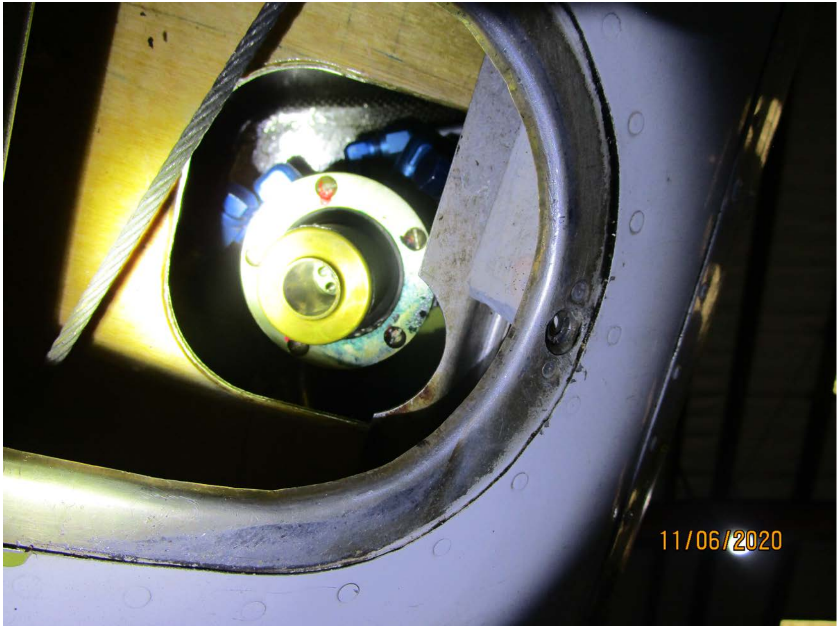
Photo 13 - Supplied view the gascolator assembly. The assembly exhibits blue stains.