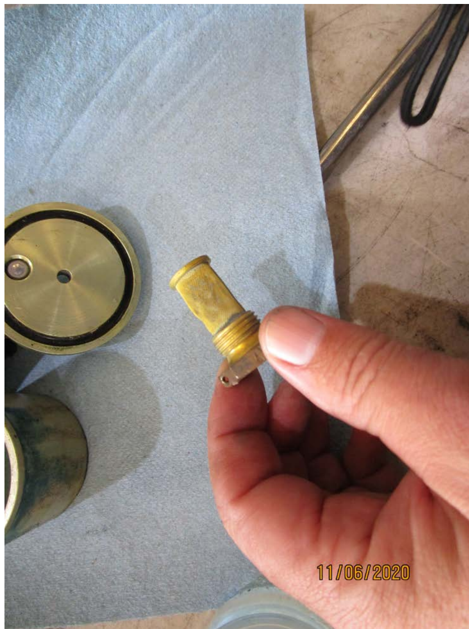
Photo 15 - Supplied view the fuel servo filter.