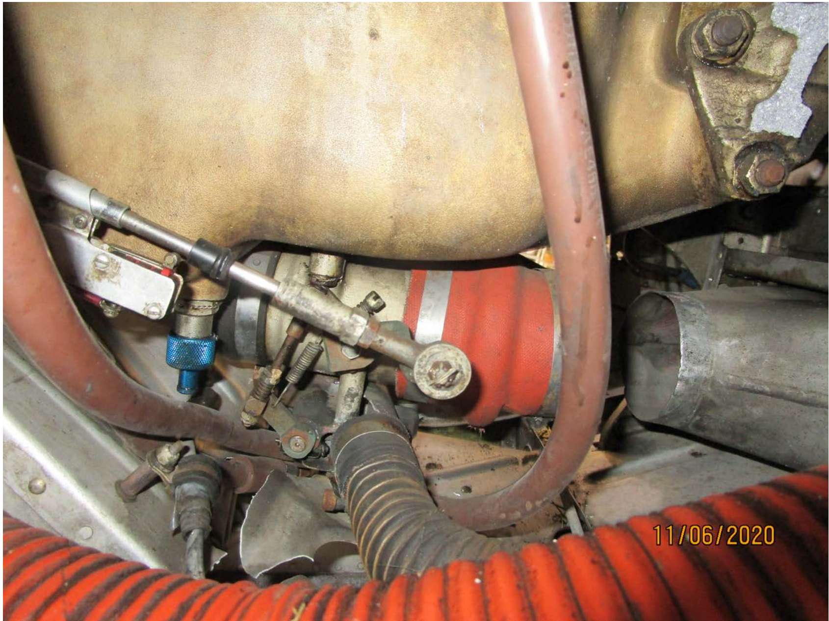
Photo 7 - Supplied view the throttle linkage.