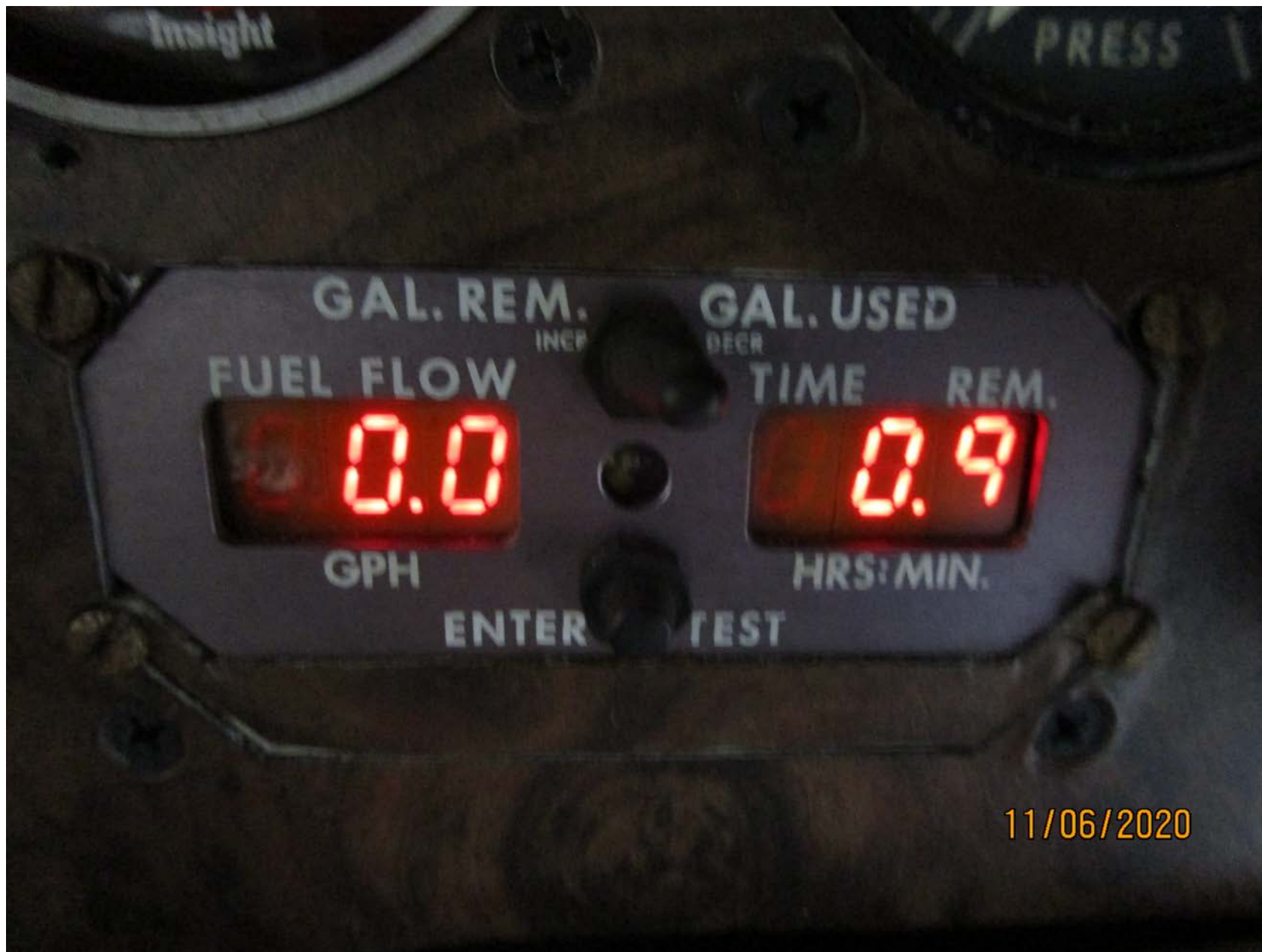
11BPhoto 12 - Supplied view the fuel flow meter.