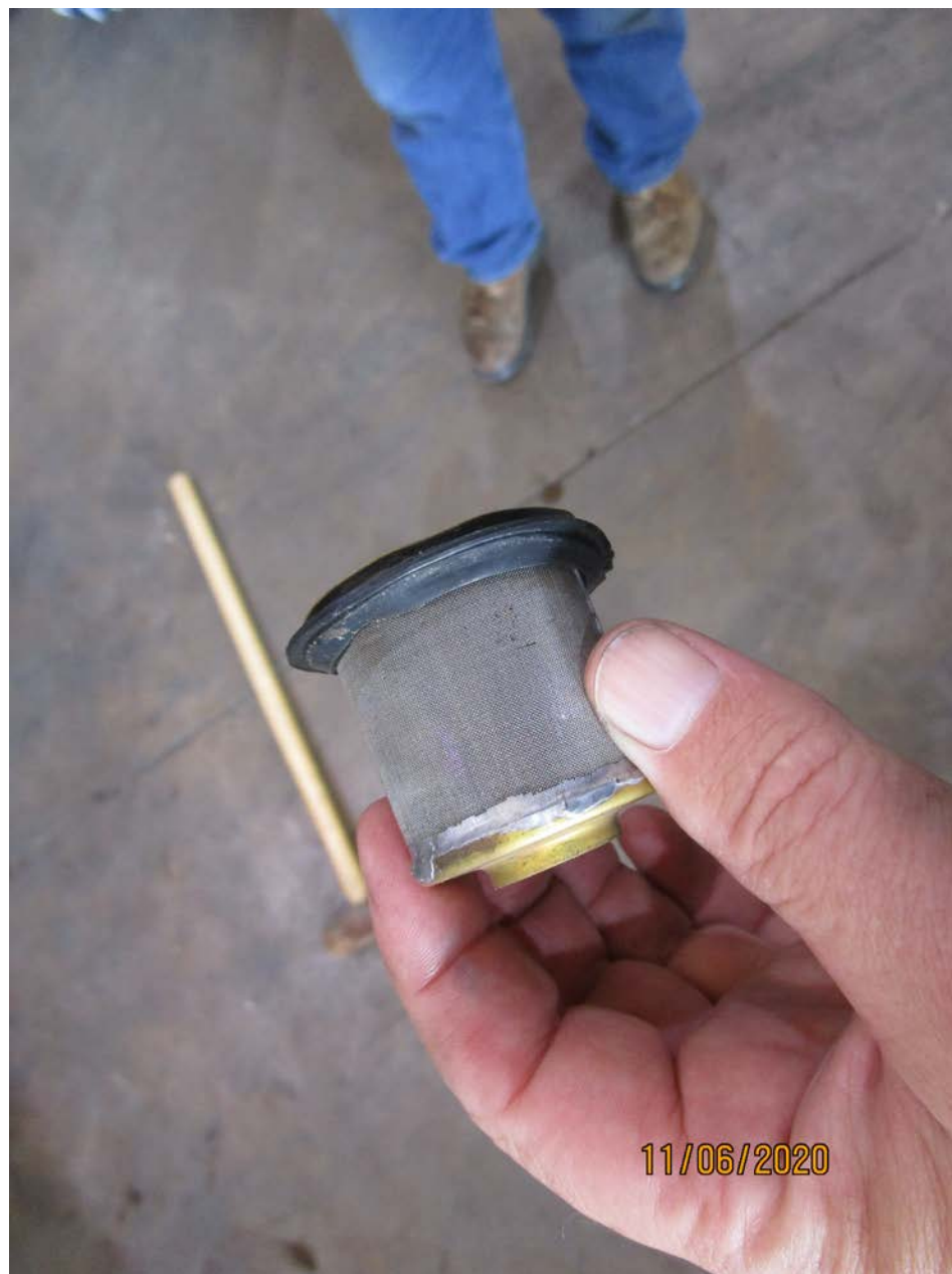
Photo 14 - Supplied view the fuel filter.