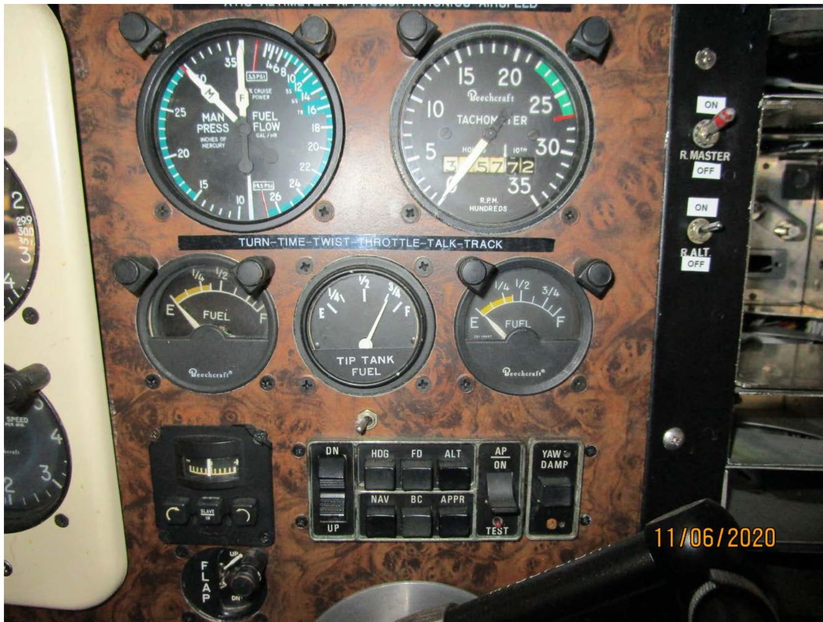
Photo 10 - Supplied view the instrument panel.