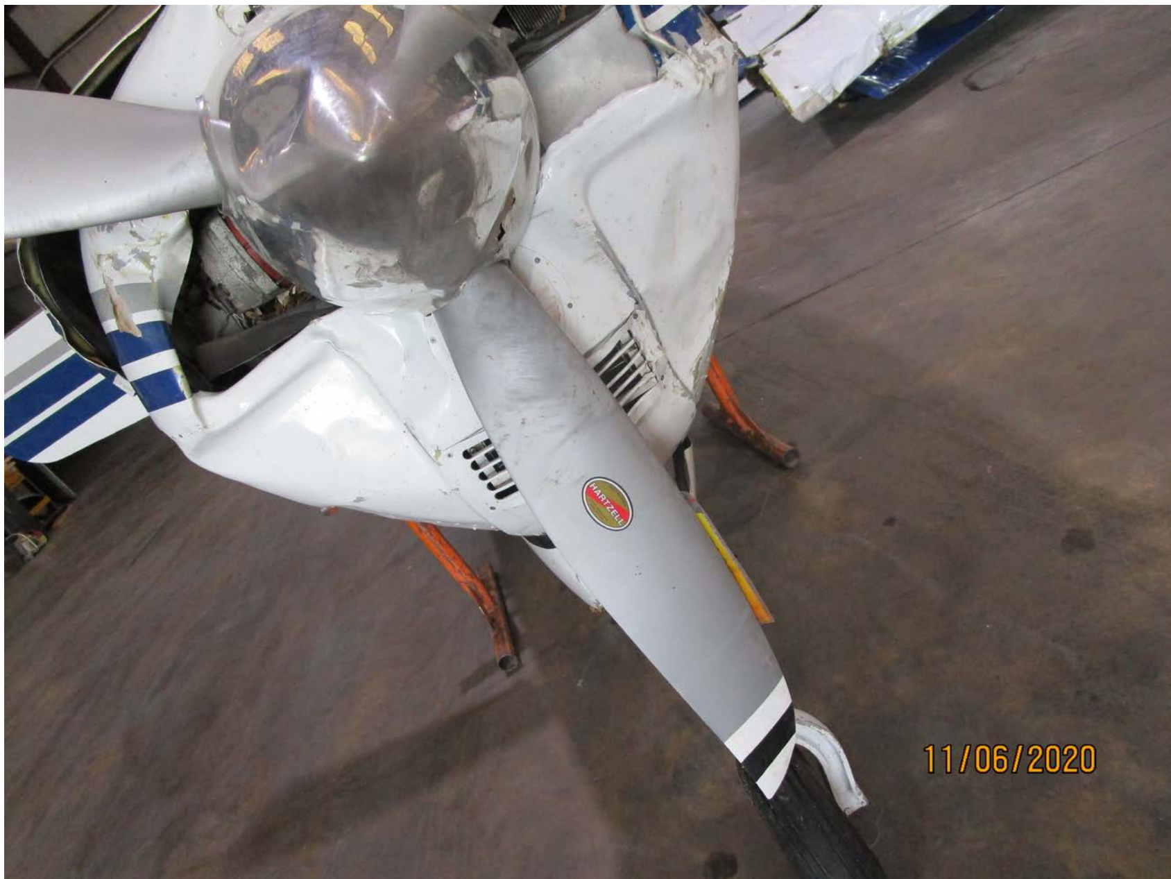
Photo 4 - Supplied view of the front of the recovered airplane.