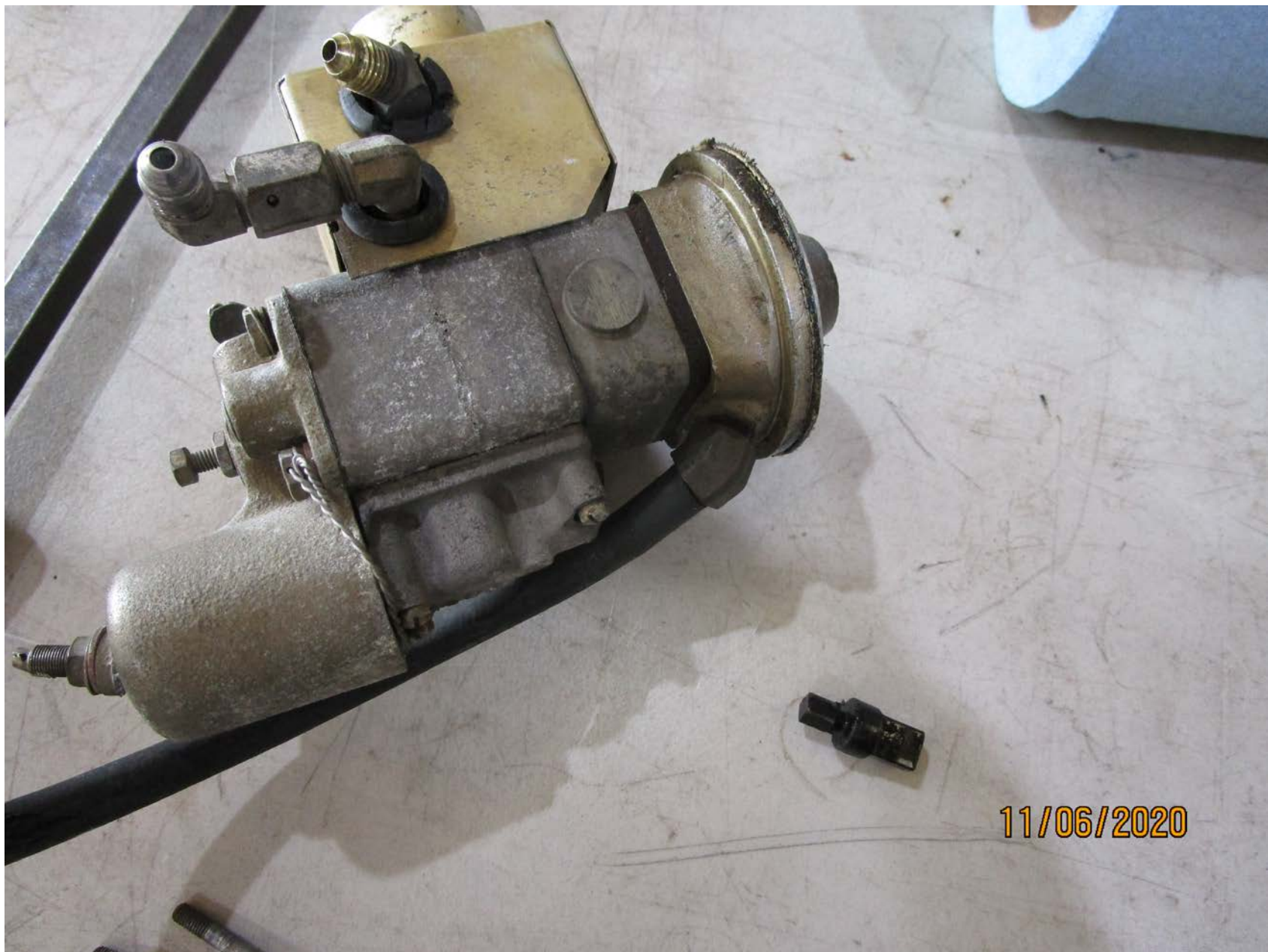
Photo 11 - Supplied view the removed engine driven fuel pump and shear shaft. The shear shaft is intact.