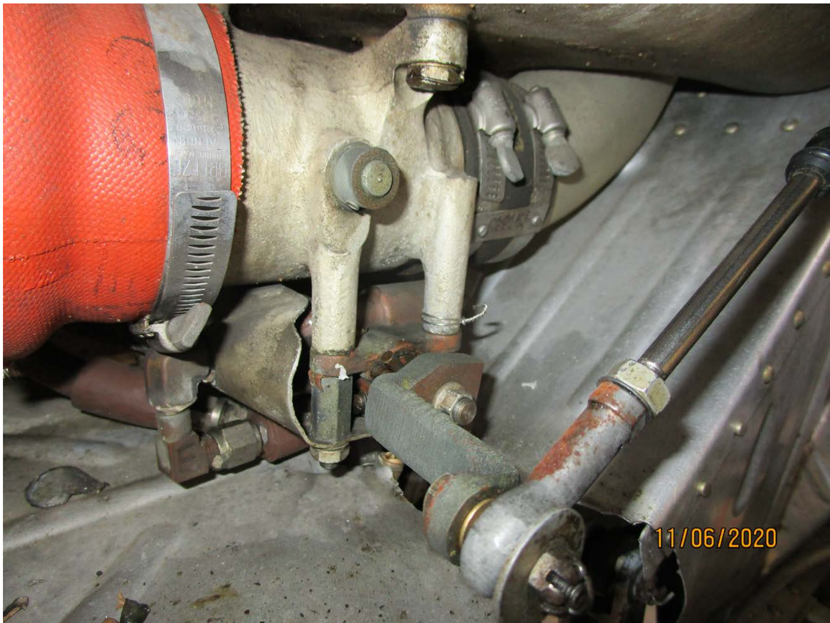
Photo 8 - Supplied view the mixture linkage.