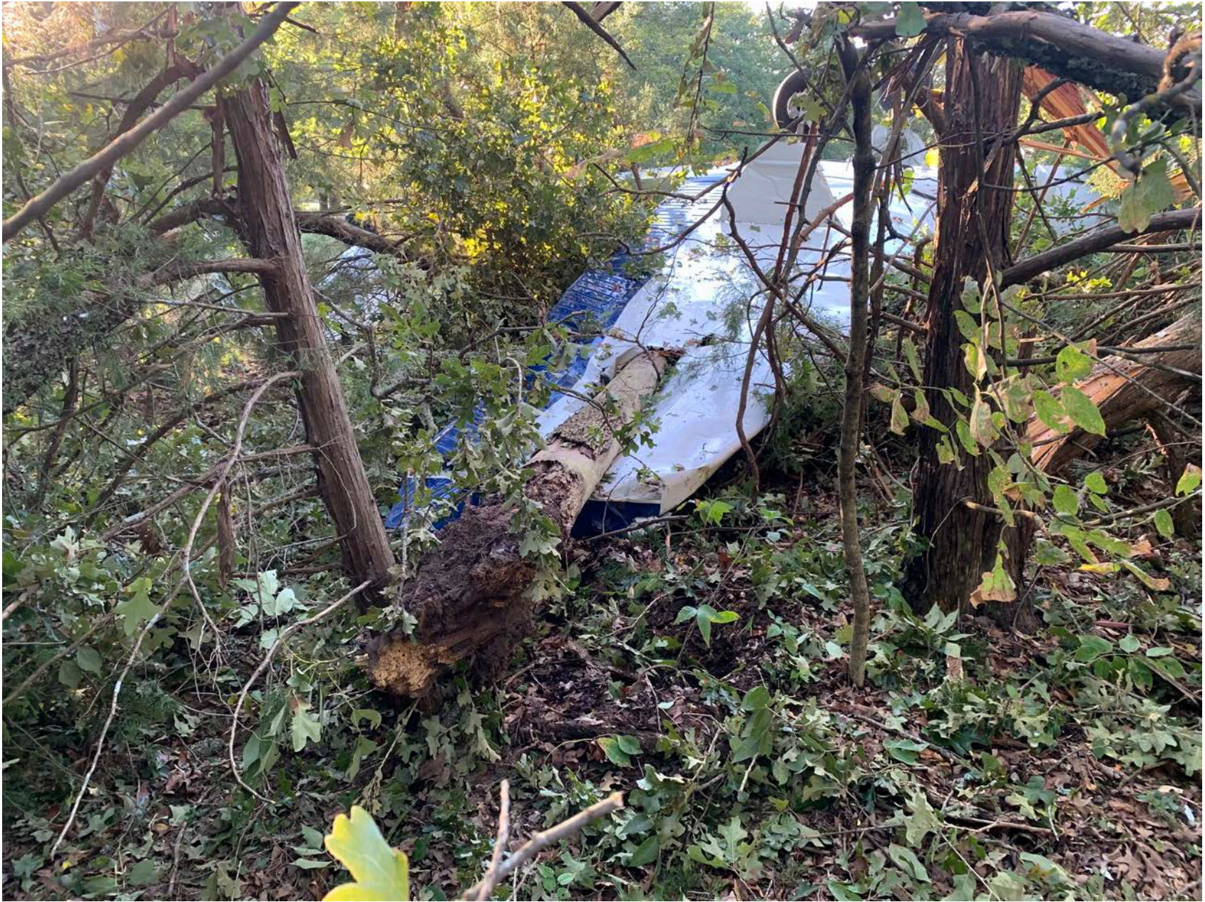
Photo 3 - Supplied view of the left side of the inverted airplane. A tree is observed in a hole in the left wing.