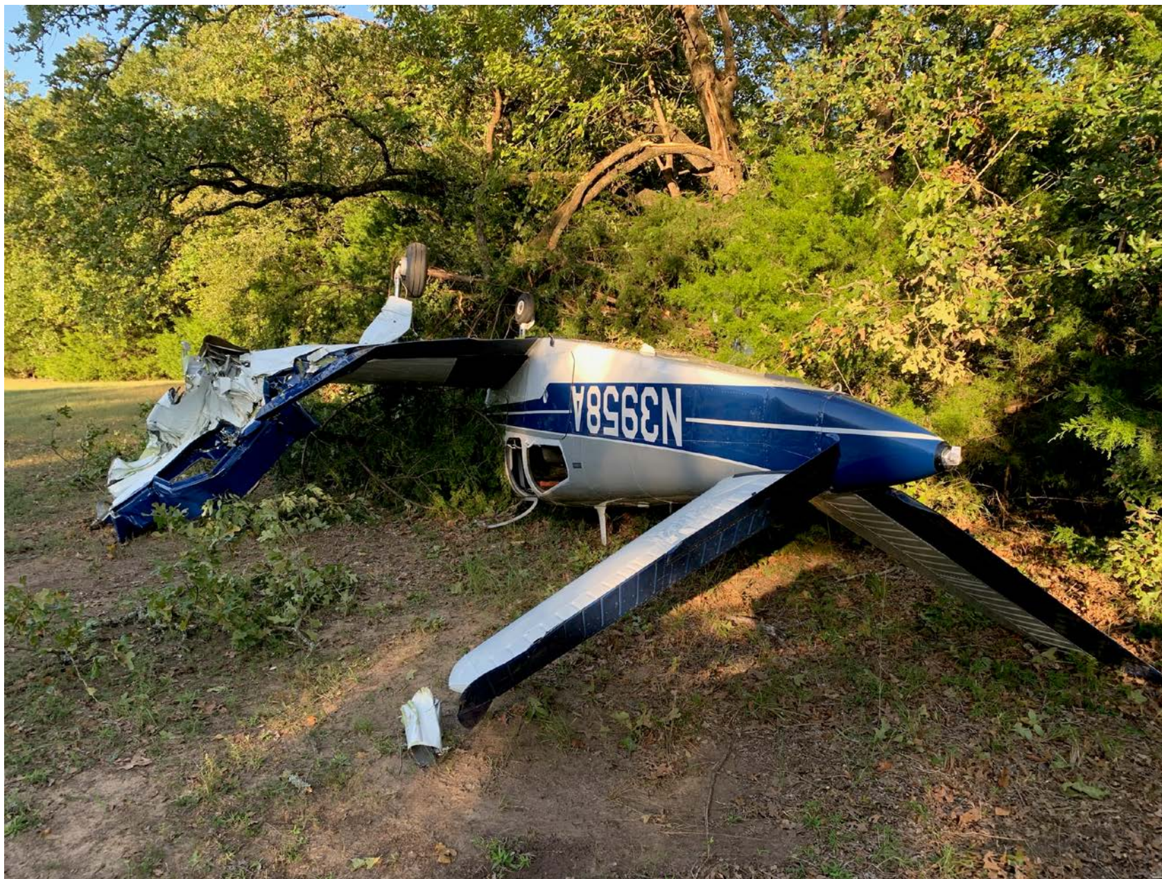
Photo 2 - Supplied quartering view of the right rear side of the inverted airplane.