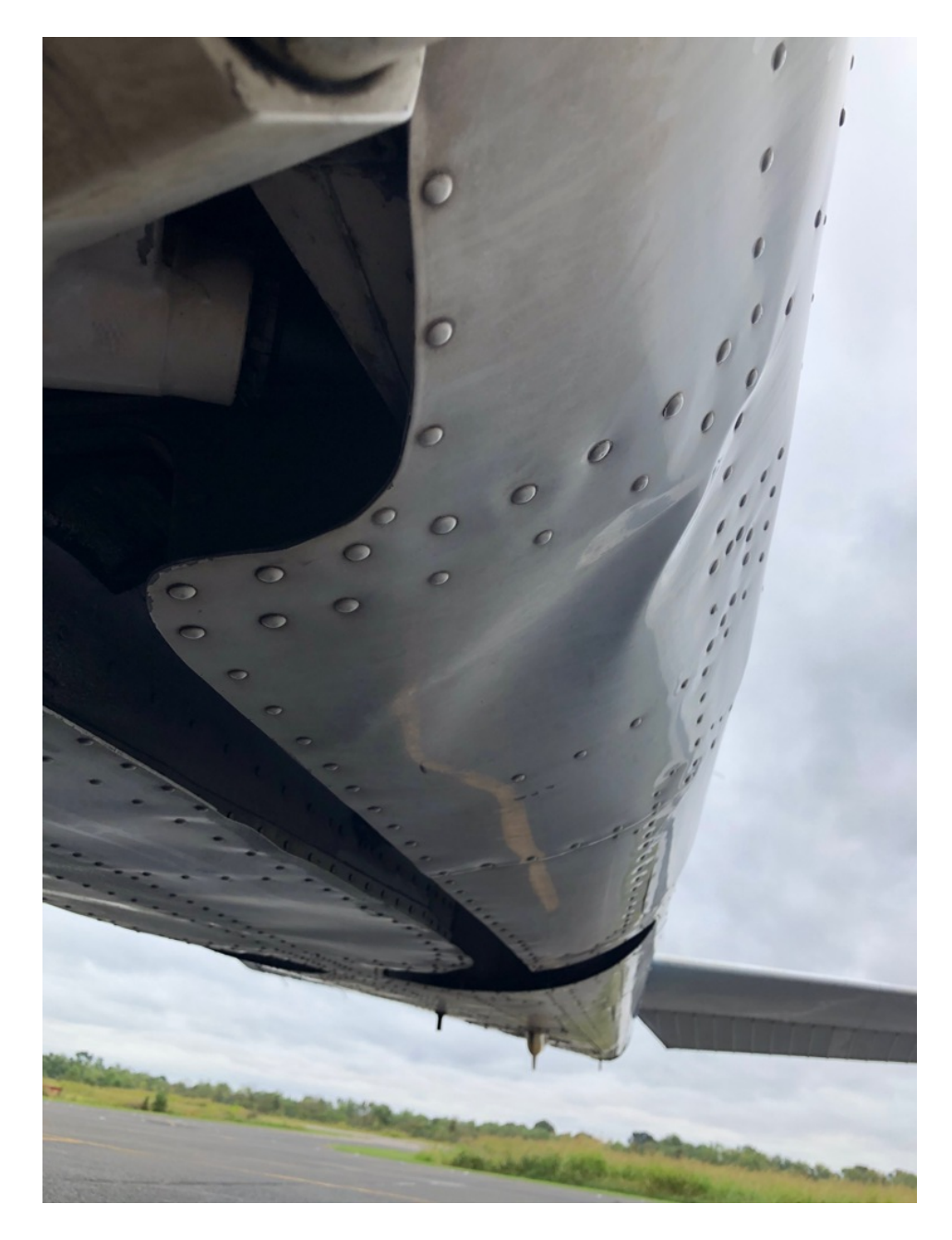
Photo 6 - Supplied photo of the airplane fuselage showing skin deformation around the left main landing gear.