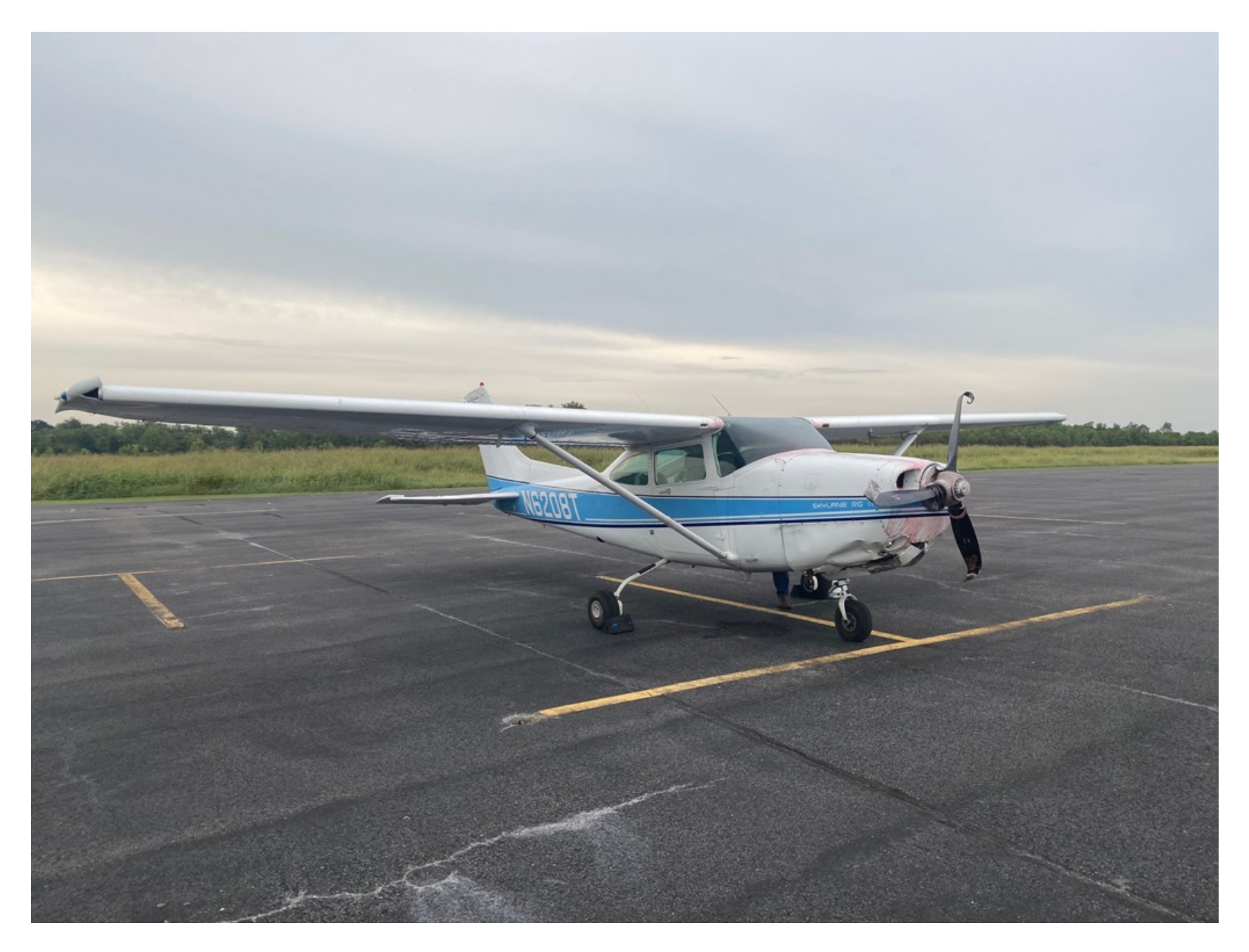
Photo 4 - Supplied photo of the airplane recovered to ramp parking.