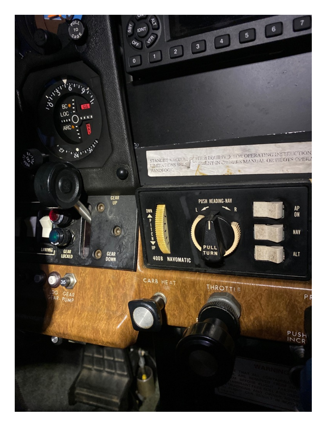
Photo 3 - Supplied photo of the instrument panel with the landing gear handle in the up position.