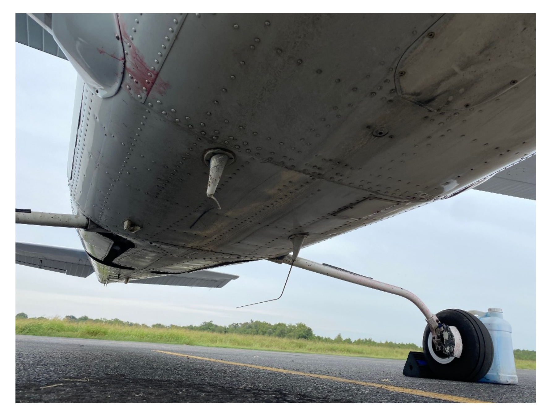
Photo 7 - Supplied photo of the airplane fuselage showing both main landing gear.