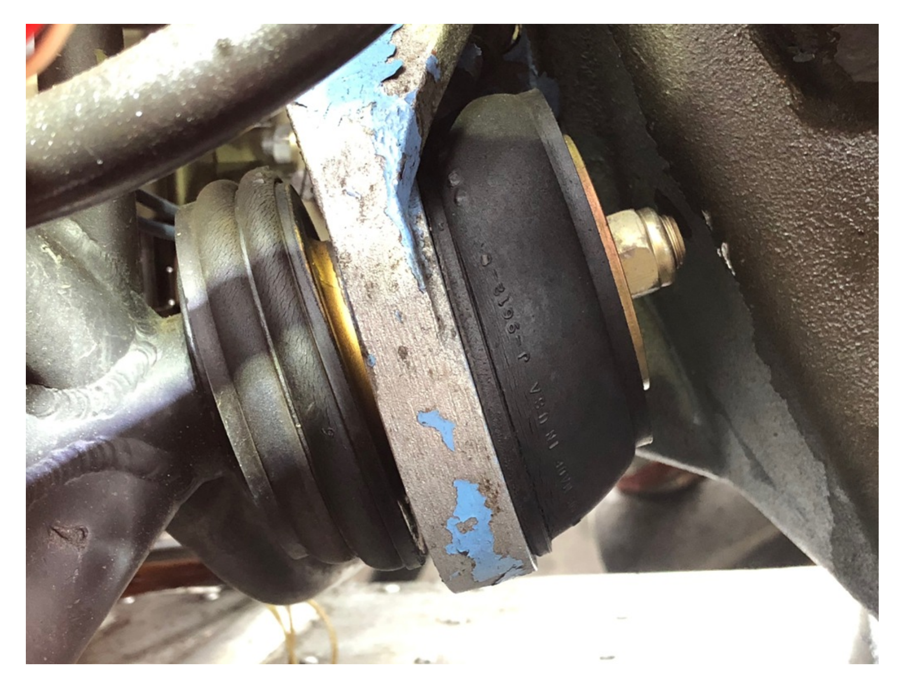
Photo 8 - Supplied photo of the engine mount showing displaced vibration isolation material.