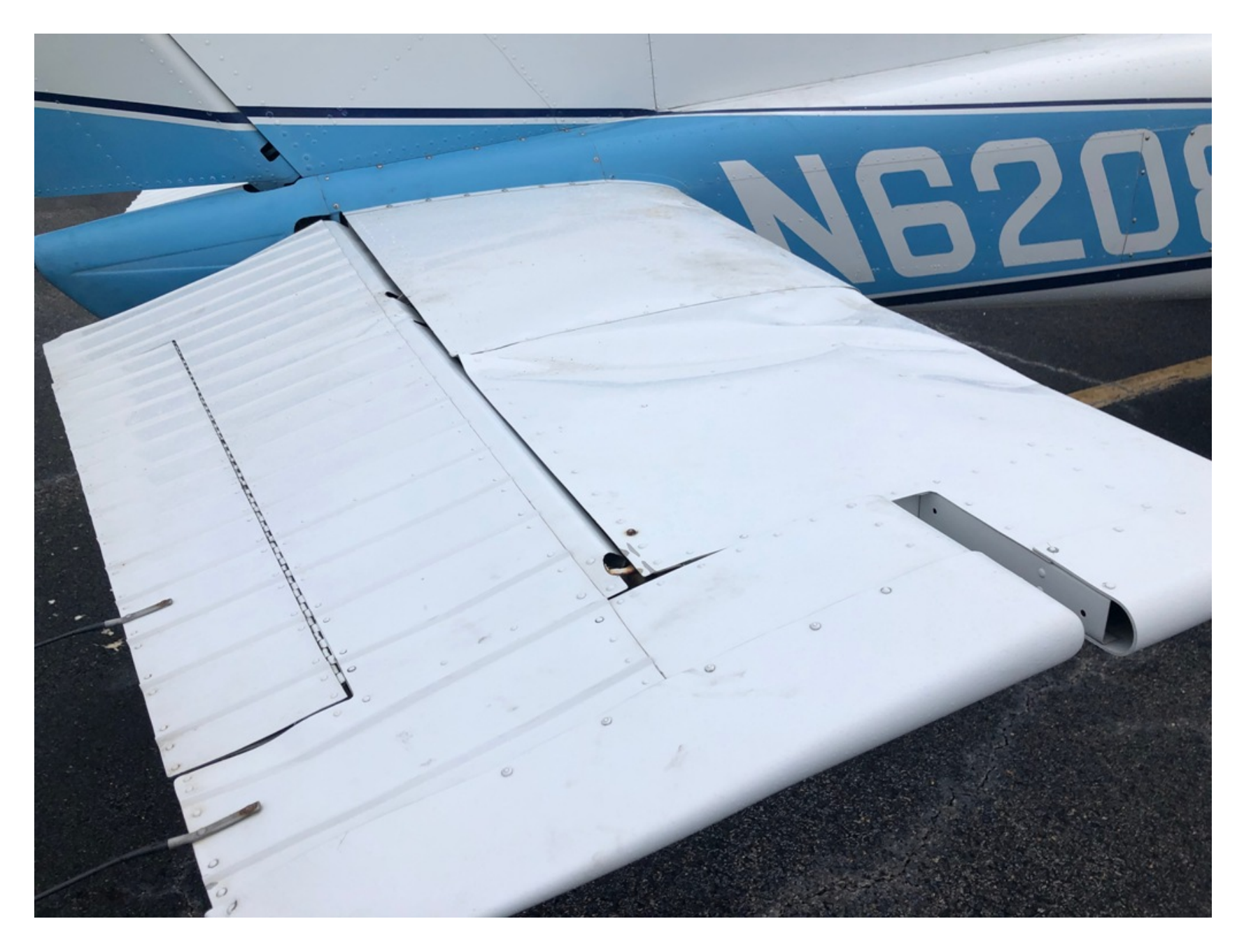
Photo 9 - Supplied photo of the right elevator showing upper skin deformation,