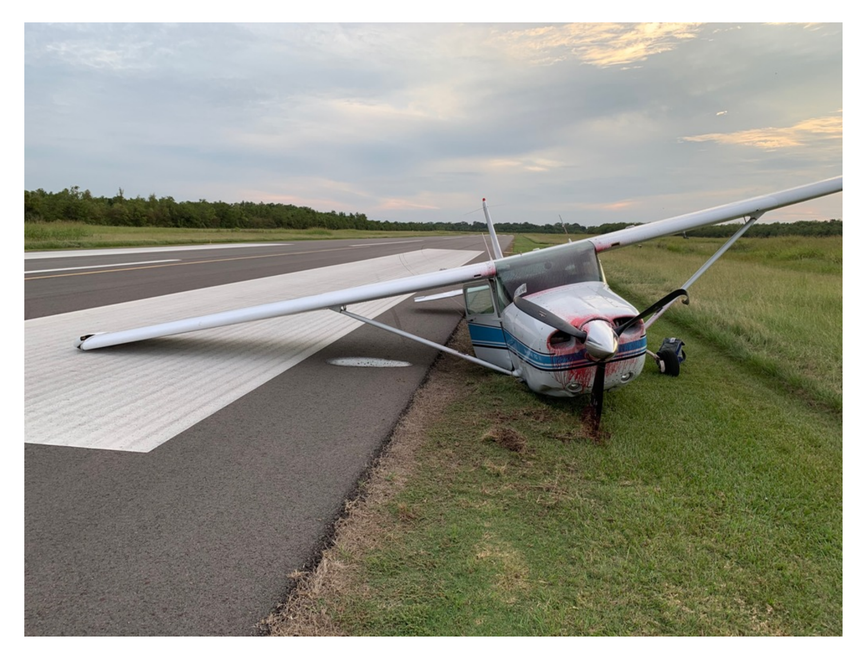
Photo 1 – Supplied photo of the front of the airplane with its nose and right landing gear collapsed.