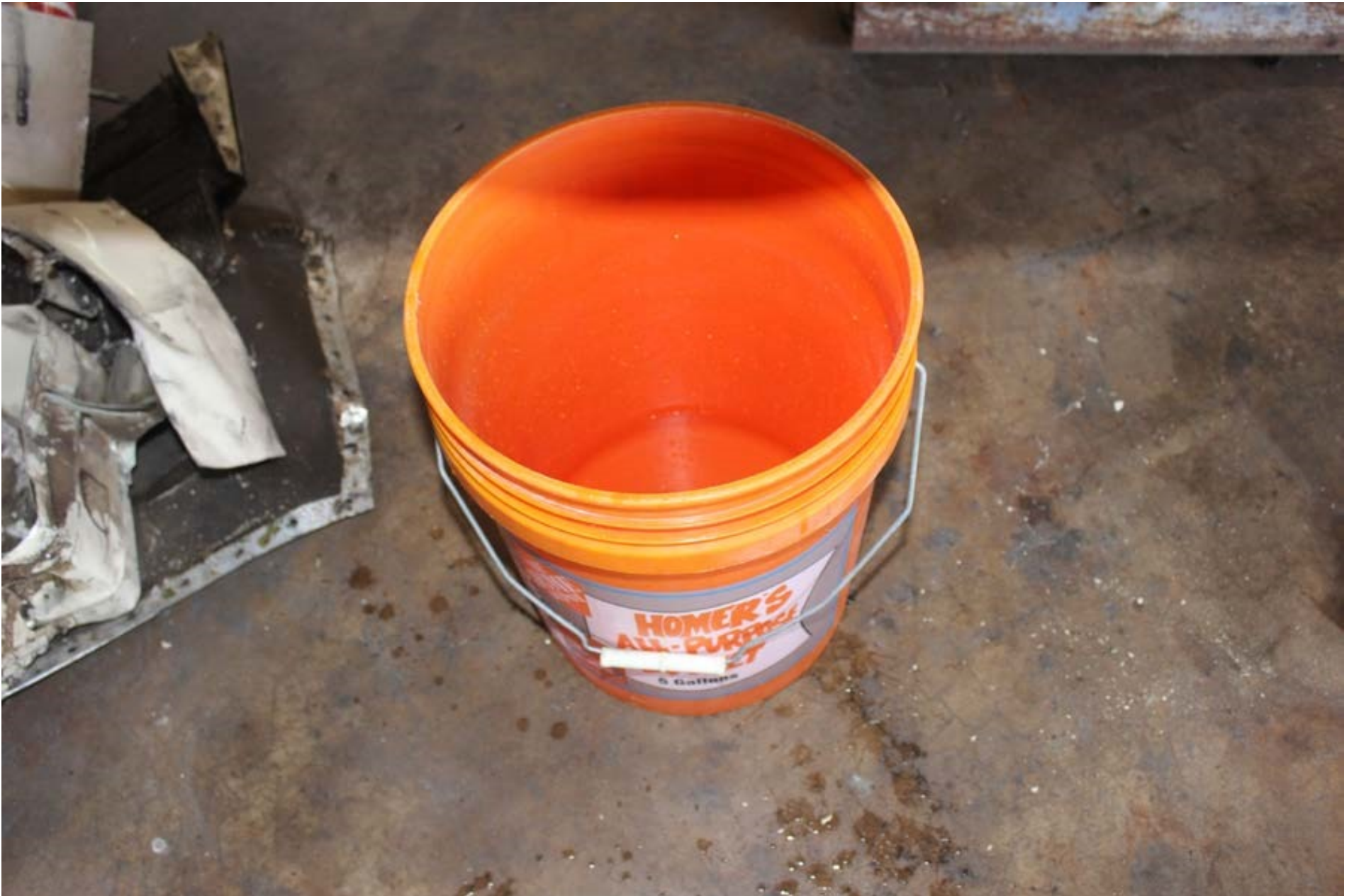
Photo 3 - Supplied photo of about 1/2 gallon of liquid consistent with water from the right header fuel tank.