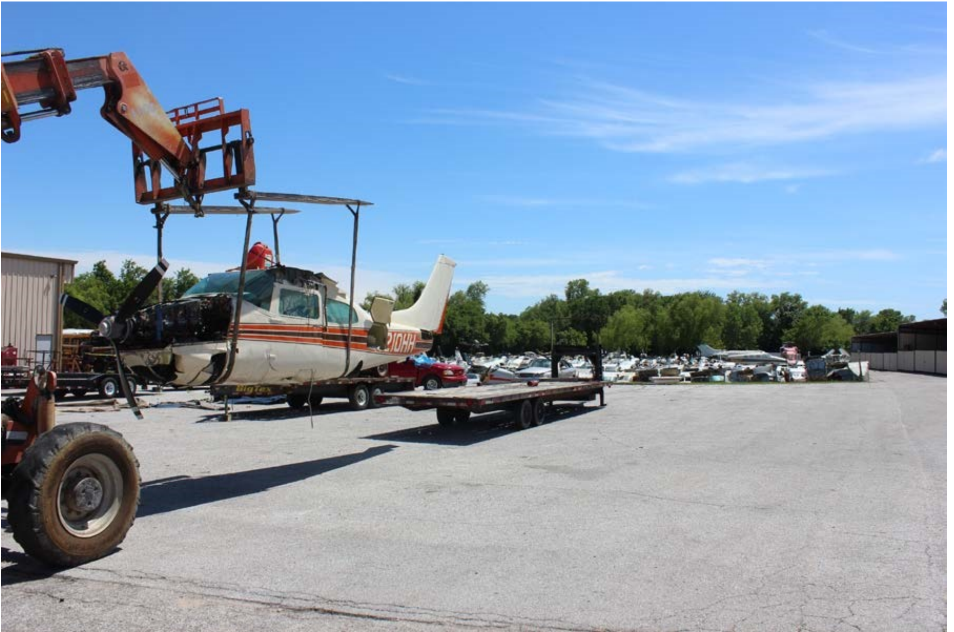
Photo 12 - Supplied photo of the airplane being moved towards a trailer.