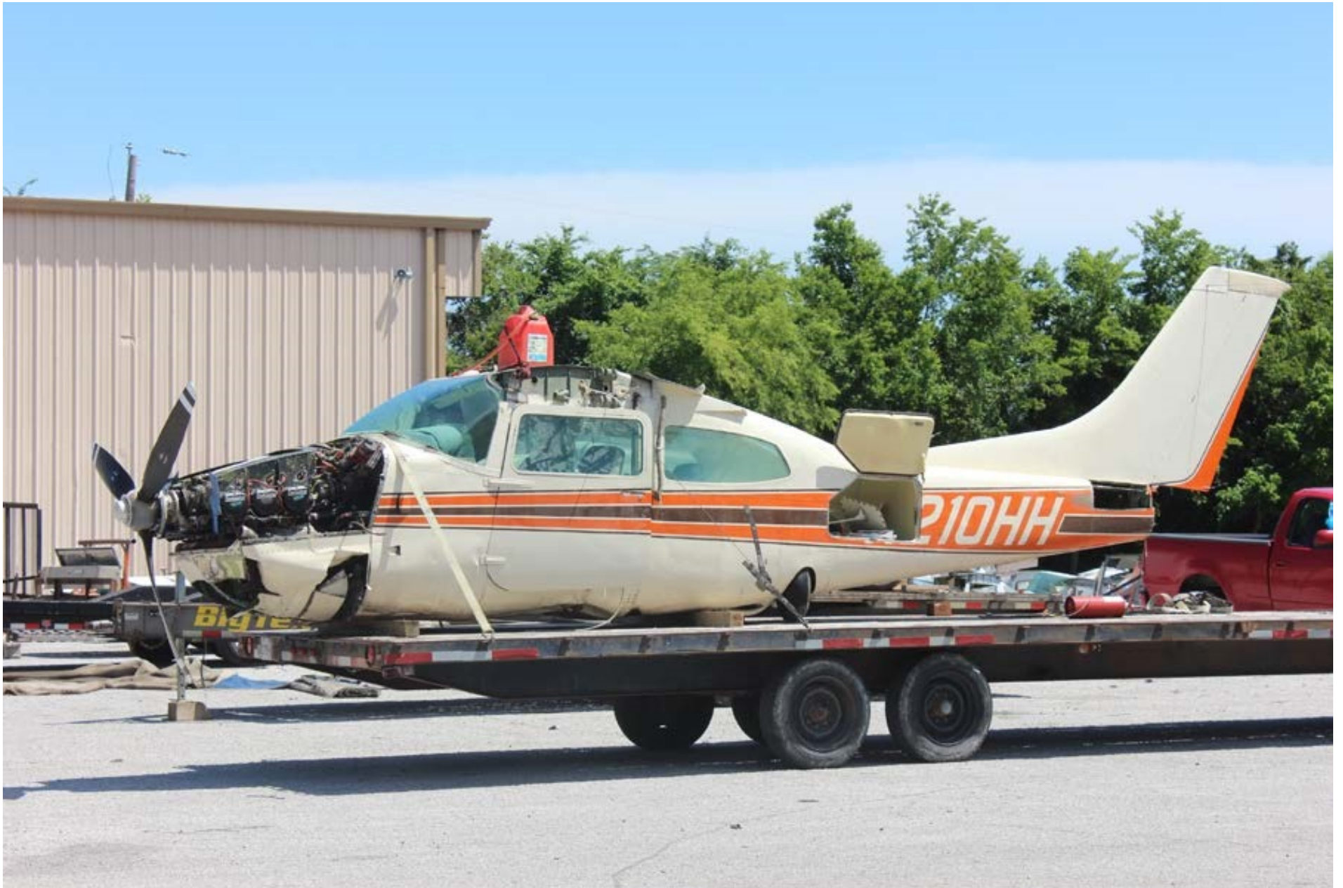
Photo 13 - Supplied photo of the airplane secured on a trailer.