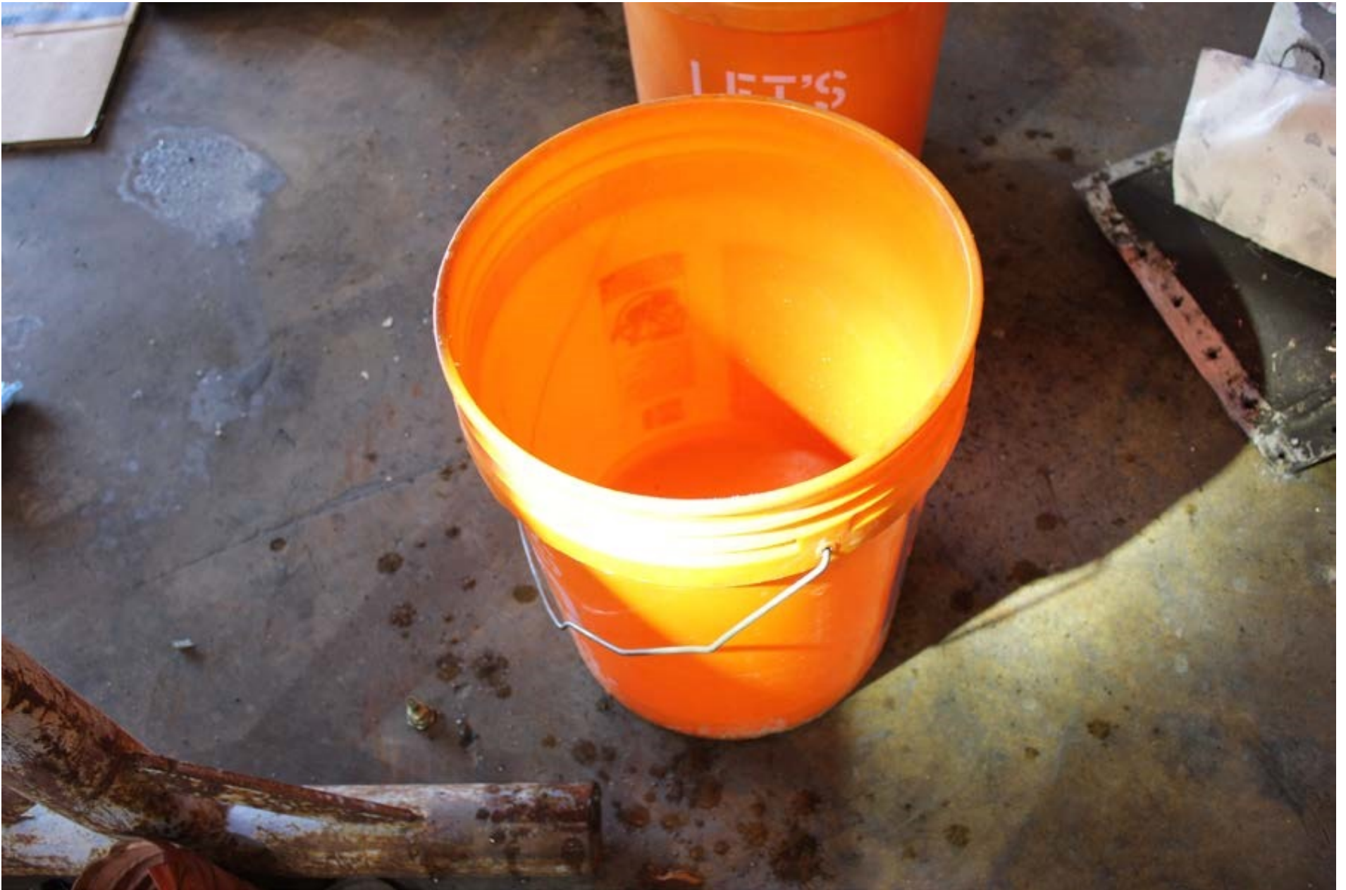
Photo 4 - Supplied photo of about 1/2 gallon of liquid consistent with water from the left header fuel tank.