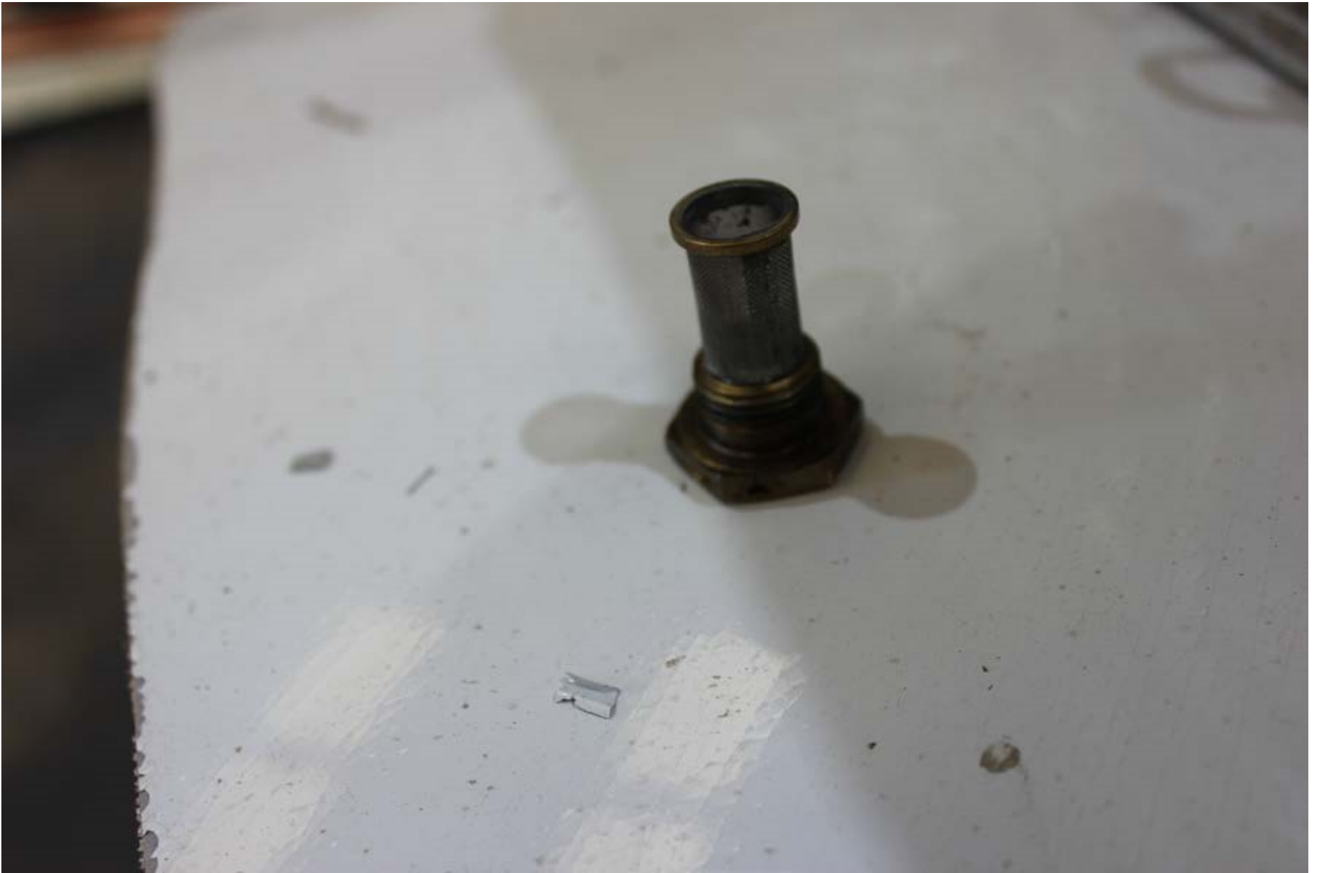
Photo 6 - Supplied close-up photo of the fuel filter screen.