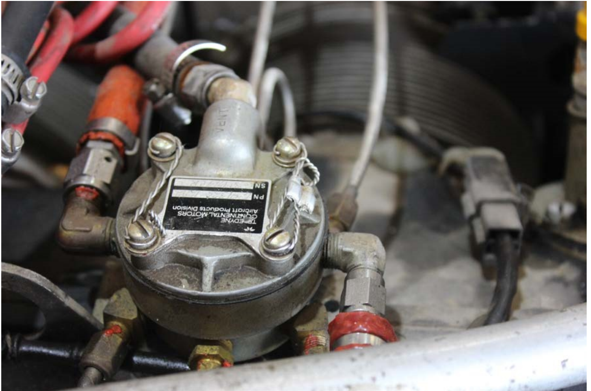
Photo 7 - Supplied close-up photo of the fuel manifold valve.