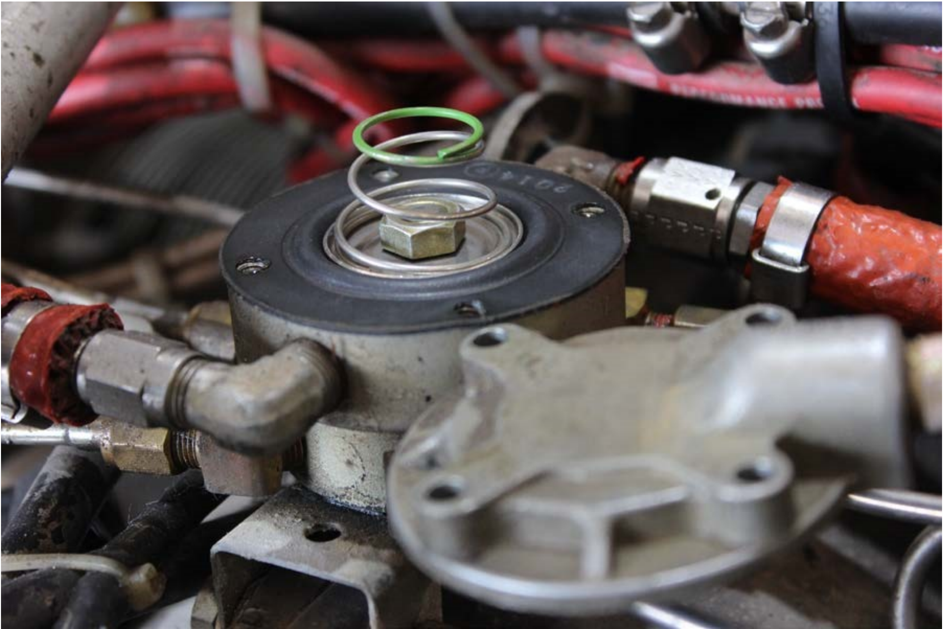
Photo 8 - Supplied close-up photo of the disassembled fuel manifold valve.