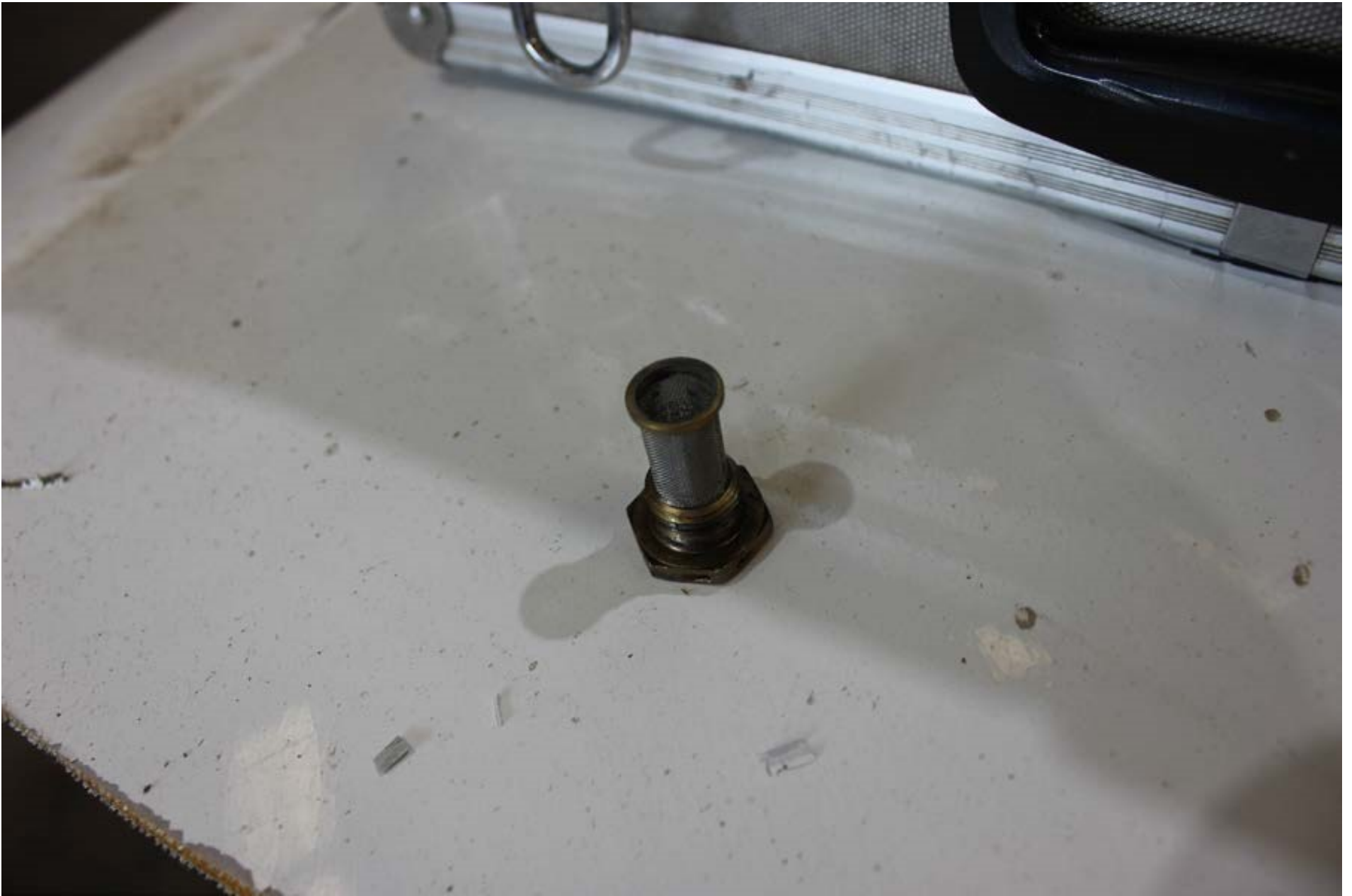
Photo 5 - Supplied photo of the fuel filter screen.