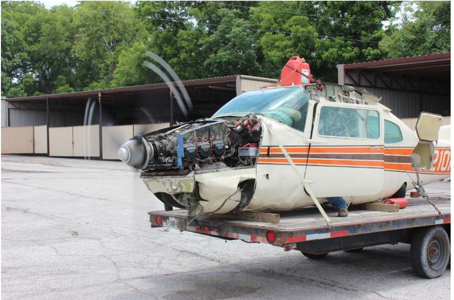
Photo 16 - Supplied photo of the engine run.