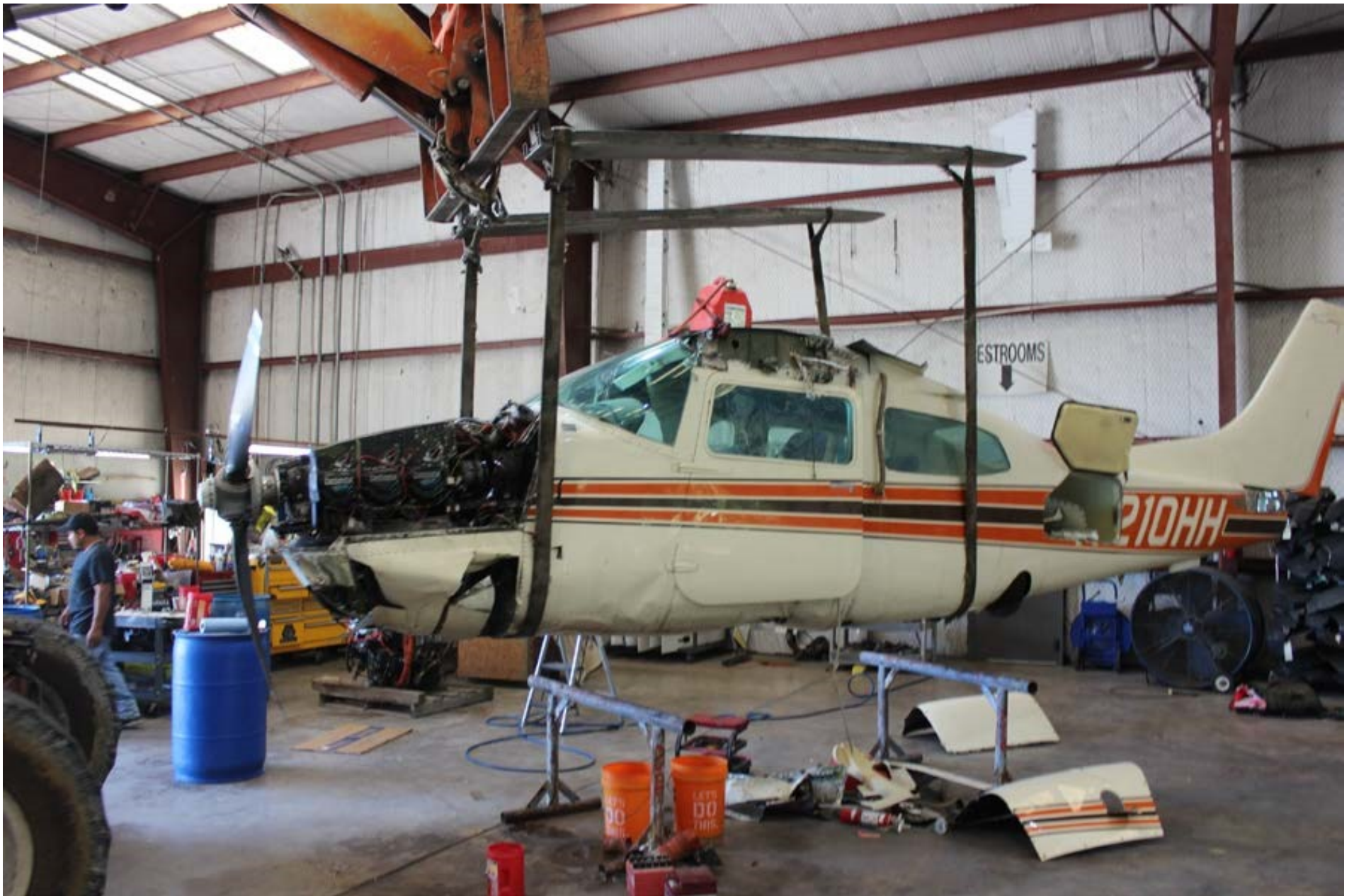
Photo 11 - Supplied photo of the airplane being moved.