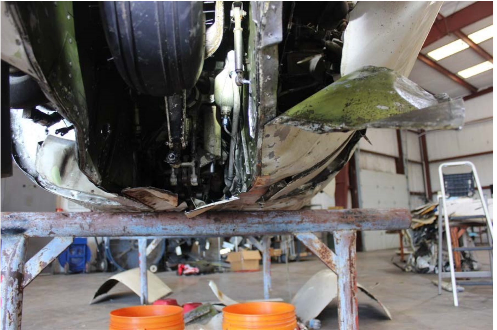
Photo 2 - Supplied photo of the fuel strainer in the nose wheel well.