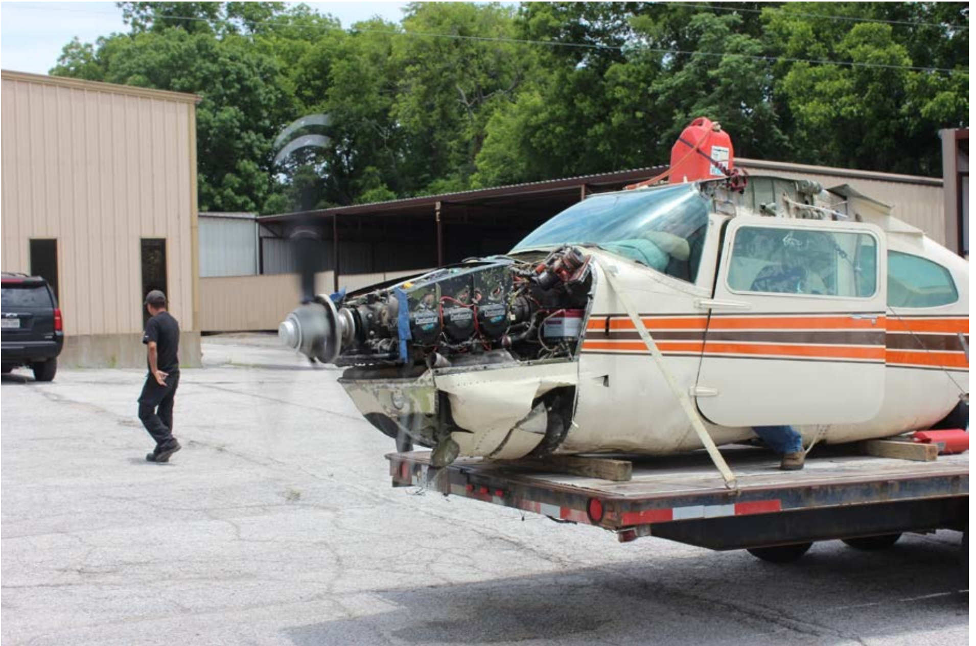
Photo 15 - Supplied photo of the engine start.