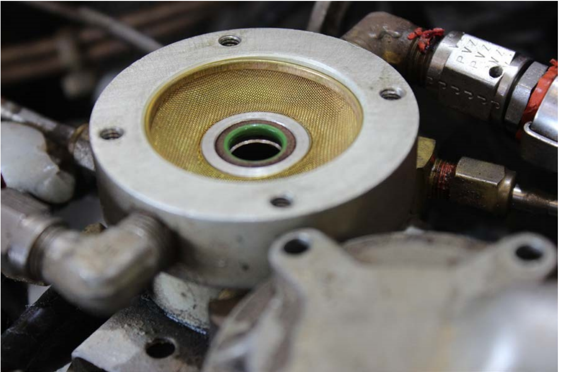
Photo 9 - Supplied close-up photo of the screen in the disassembled fuel manifold valve.