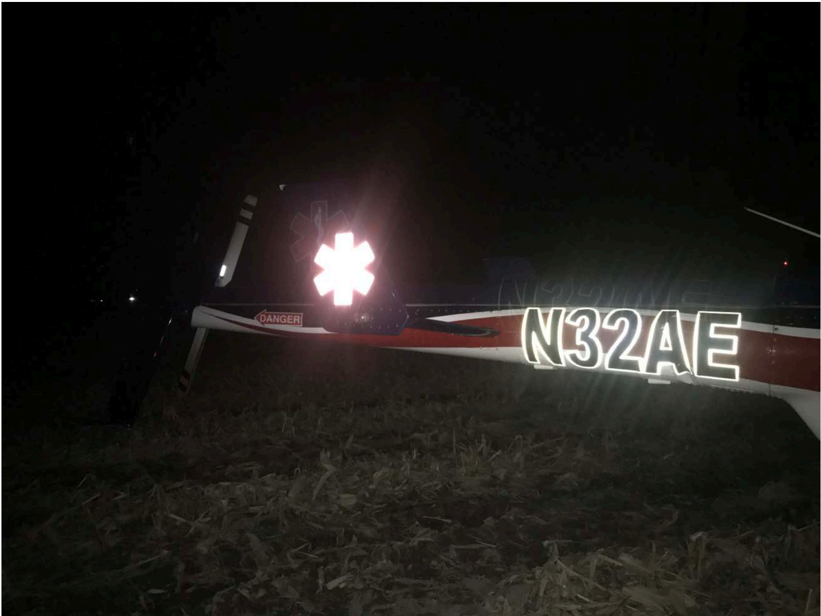
Photo 2 - Supplied photo with a view of the right side of the tailboom.