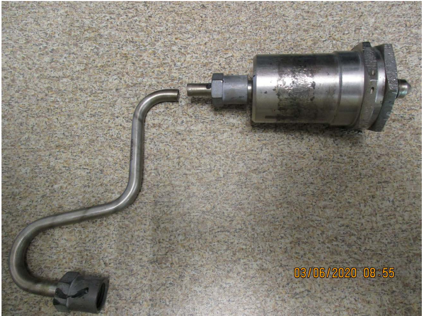
Photo 11 - Supplied photo with a view the Pc Line and its filter. There is a separation in the pneumatic line.