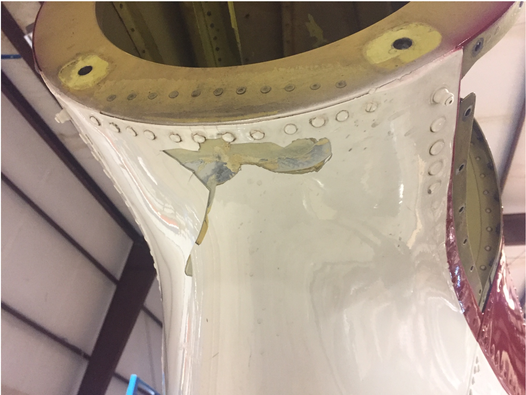
Photo 7 - Supplied photo with a view of deformed skin near the junction of the fuselage and tail boom.