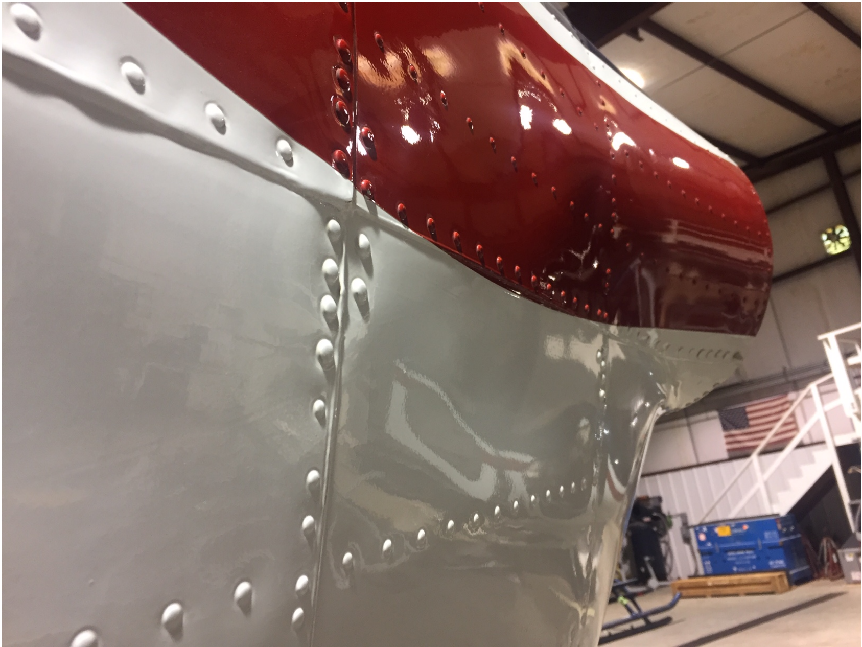
Photo 8 - Supplied photo with a view of deformed skin near the junction of the fuselage and tail boom.