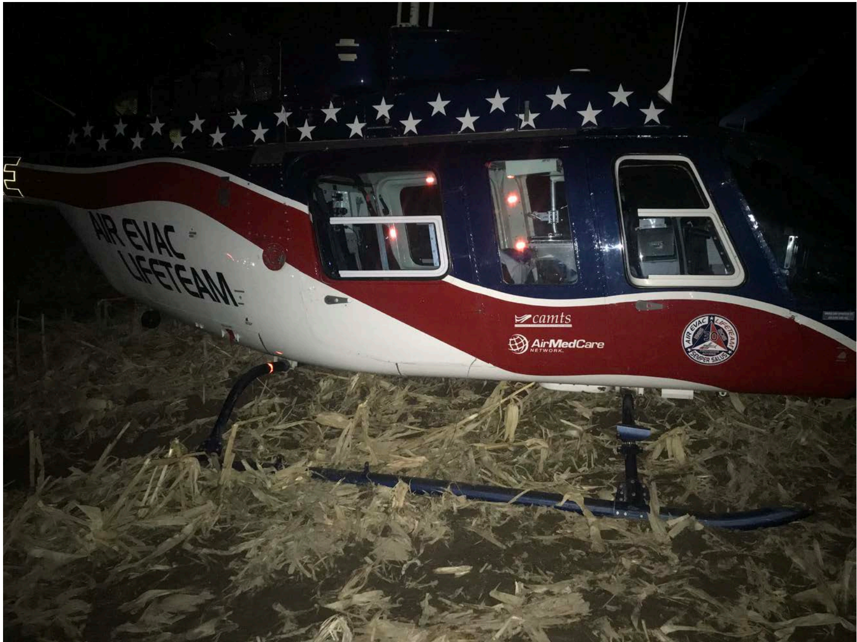
Photo 1 – Supplied photo with a view of the right side of the helicopter.