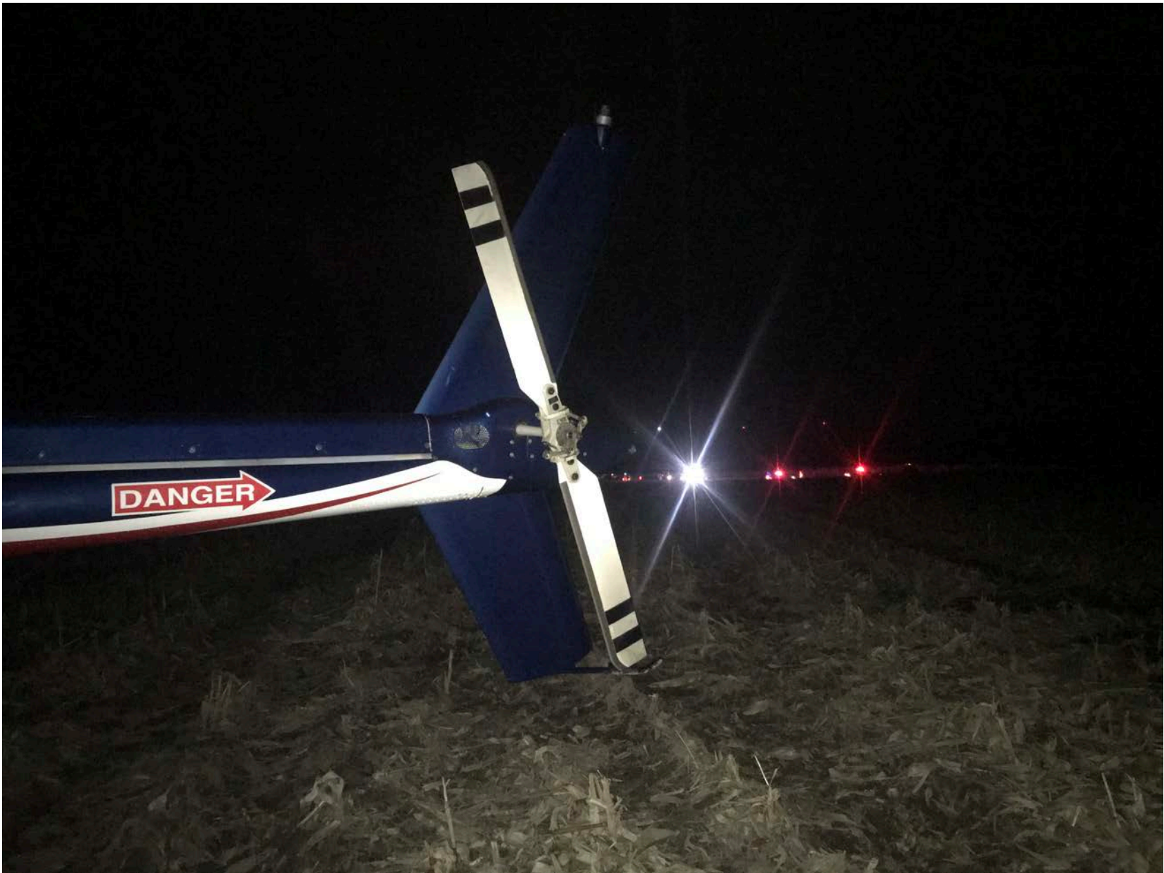
Photo 5 - Supplied photo with a view of the tail rotor.