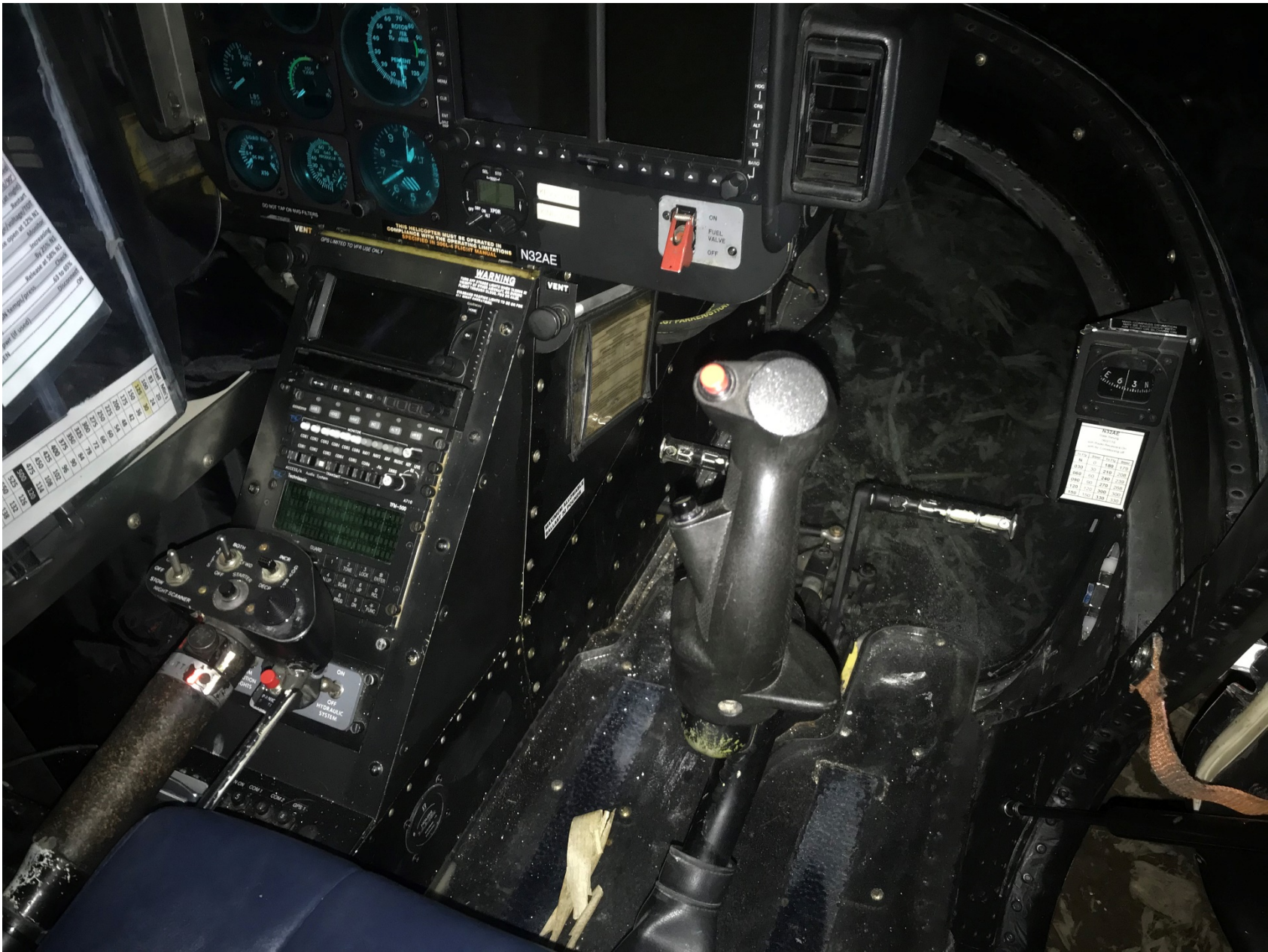
Photo 6 - Supplied photo with a view of the cockpit.