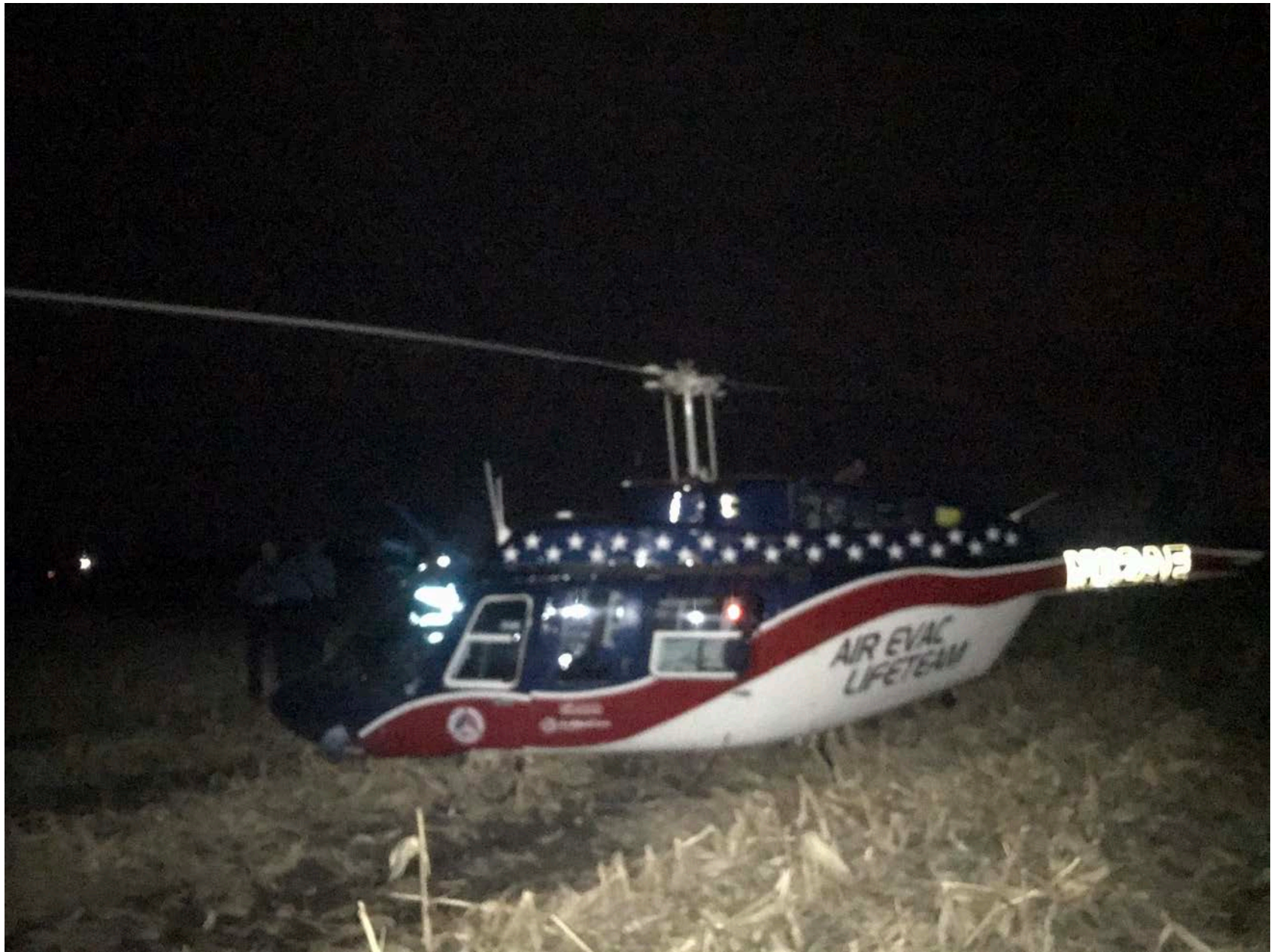
Photo 4 - Supplied photo with a view of the left side of the helicopter.