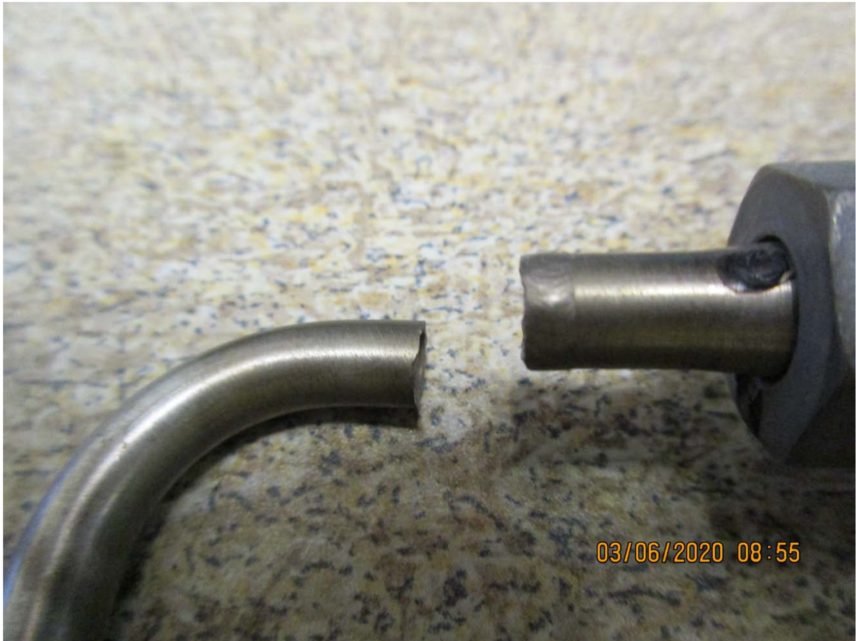
Photo 13 - Supplied photo with a close-up view the separation in th Pc Line.