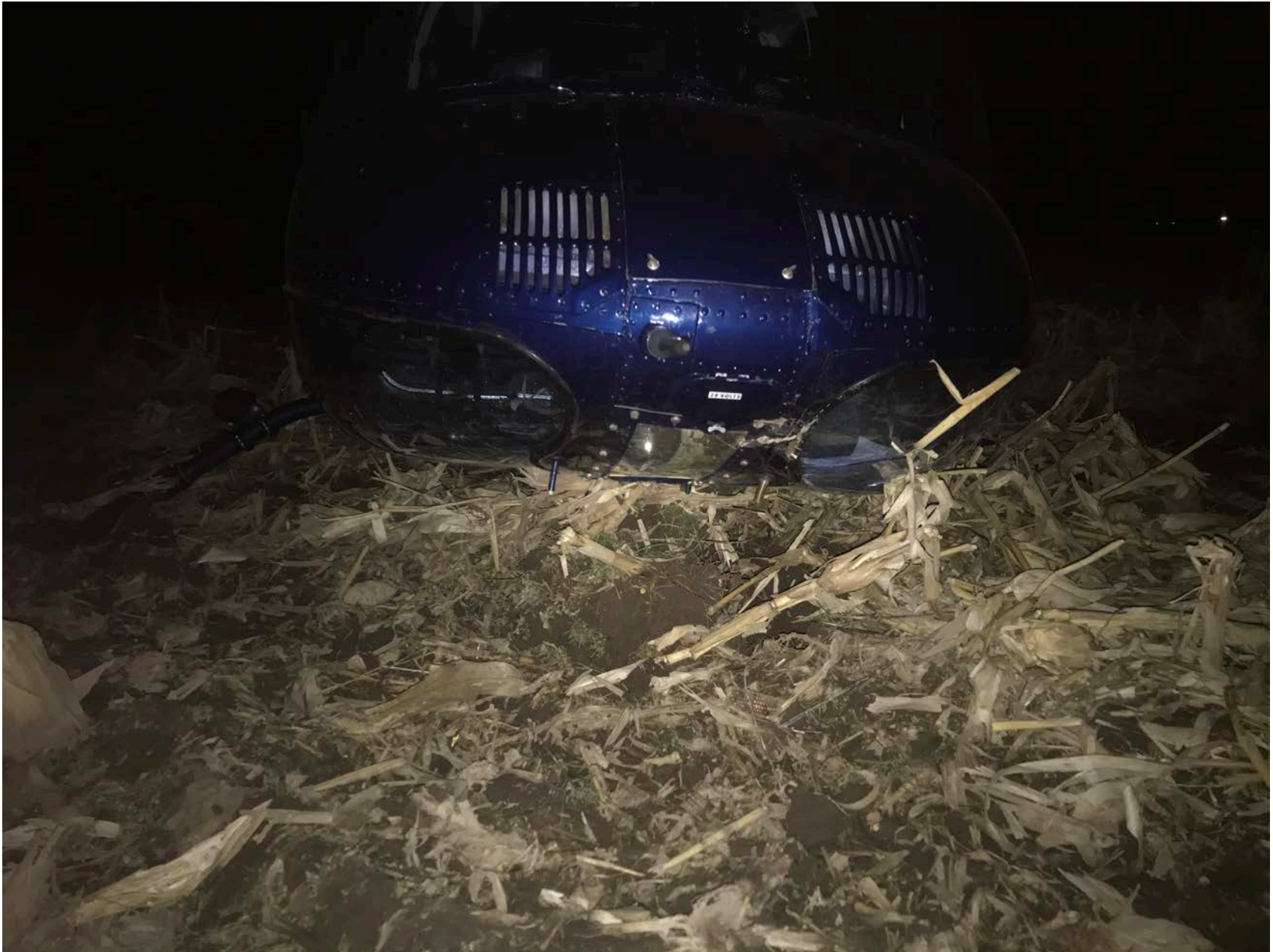
Photo 3 - Supplied photo with a view of the front of the helicopter.