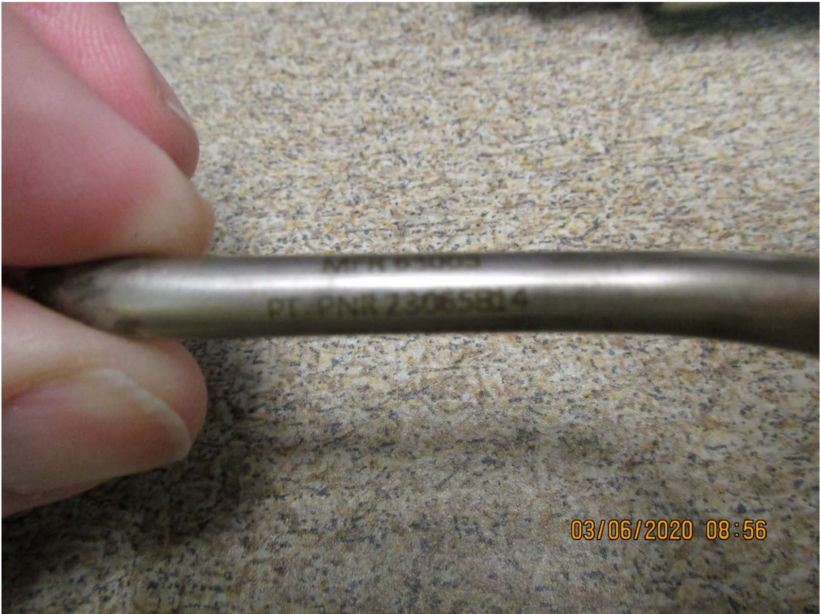
Photo 12 - Supplied photo with a view the Pc Line part number.