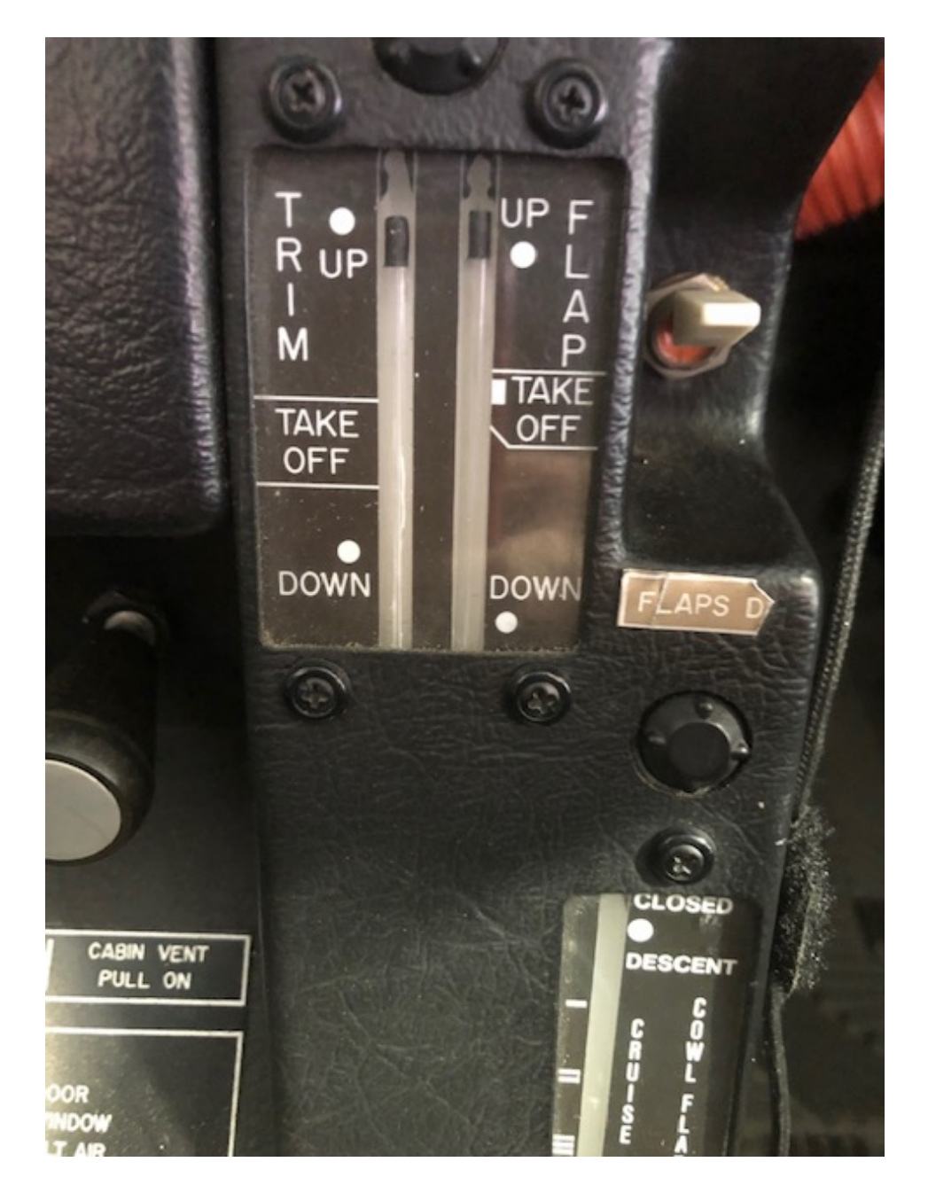
Photo 7 - Supplied view of the trim indicator in the full up position. The jackscrew is at its full extension.