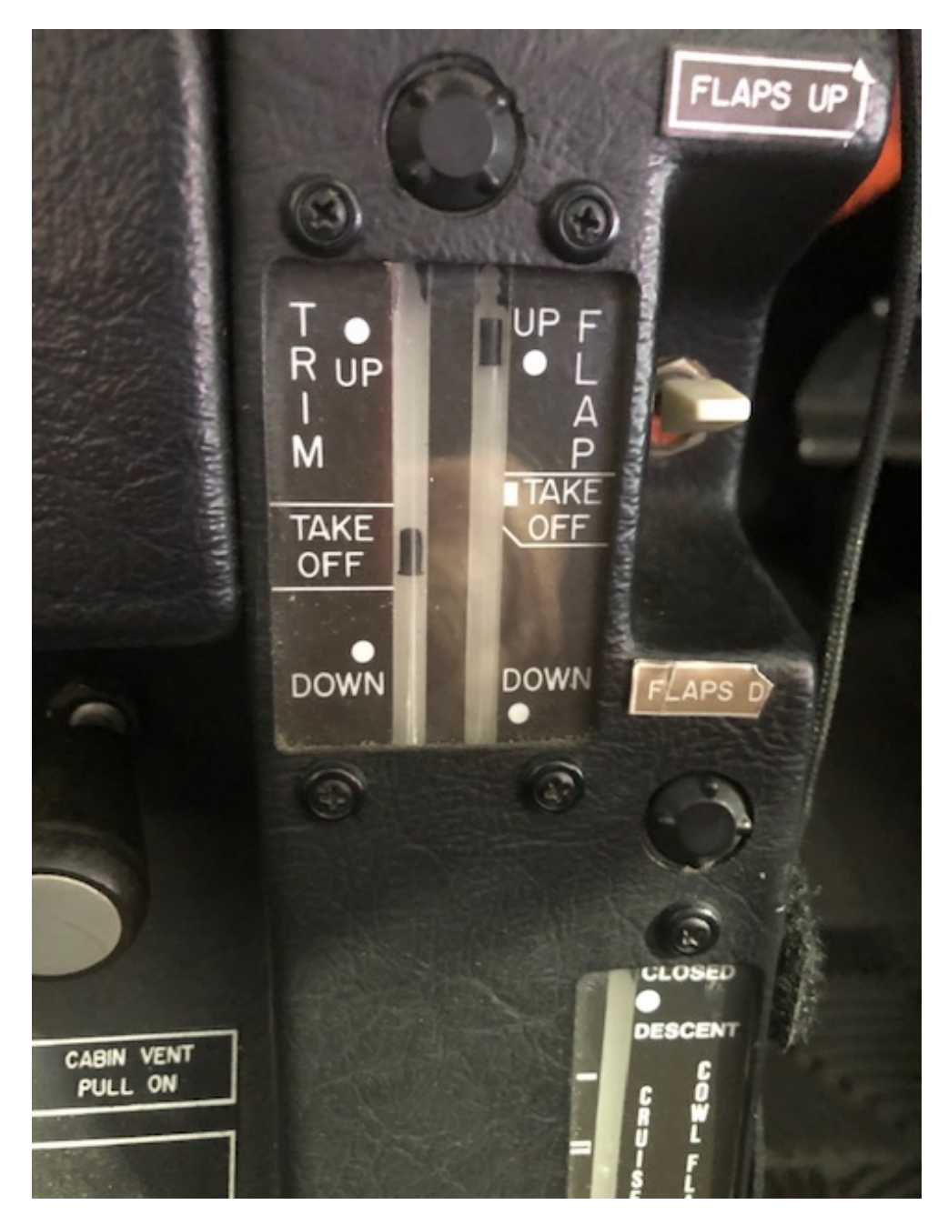
Photo 4 - Supplied view of the trim indicator in the takeoff position. The jackscrew has about 8 threads showing.