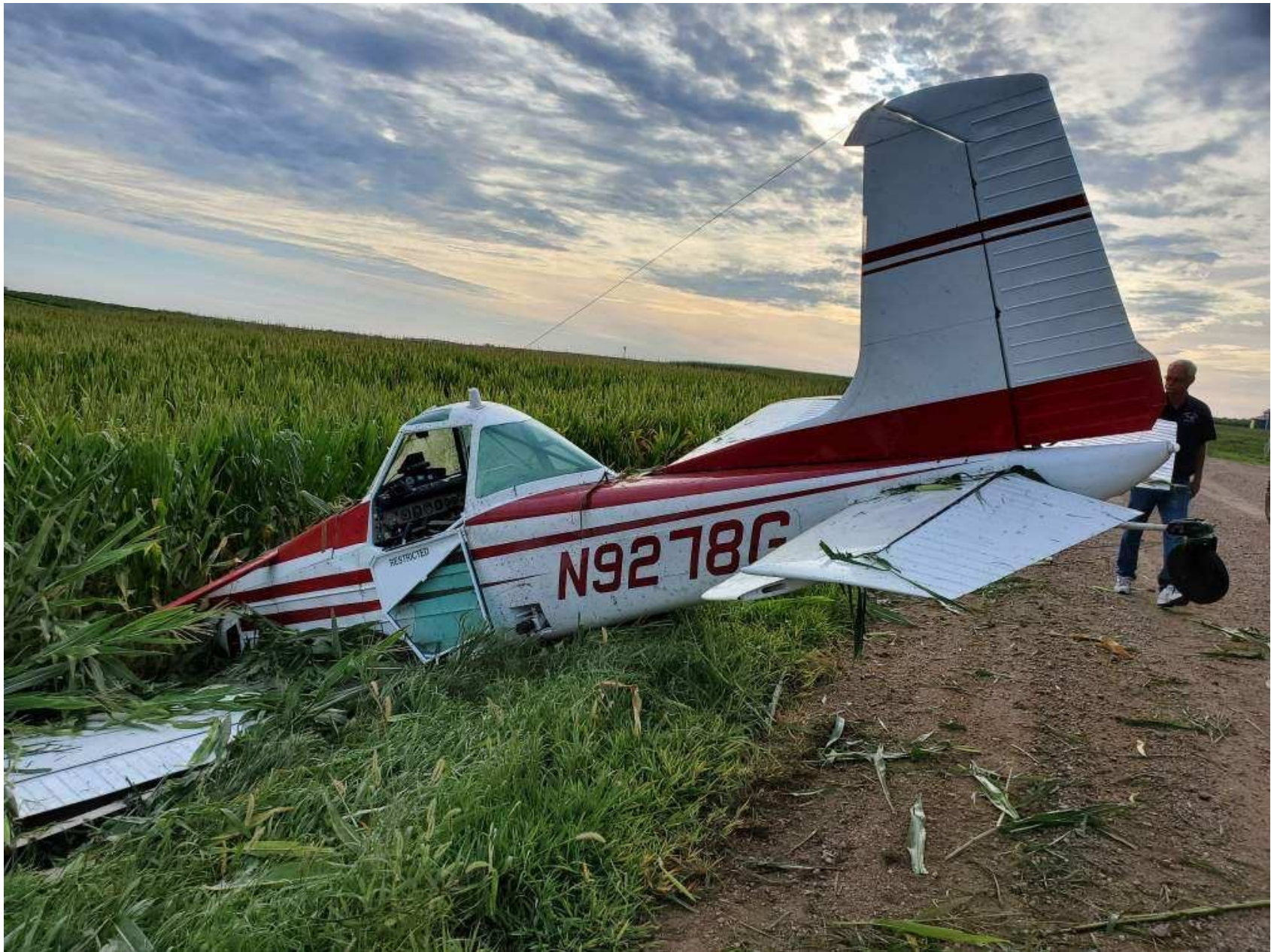
Photo 2 - Supplied photo with a quartering view of the left rear side of the airplane in a farm field.