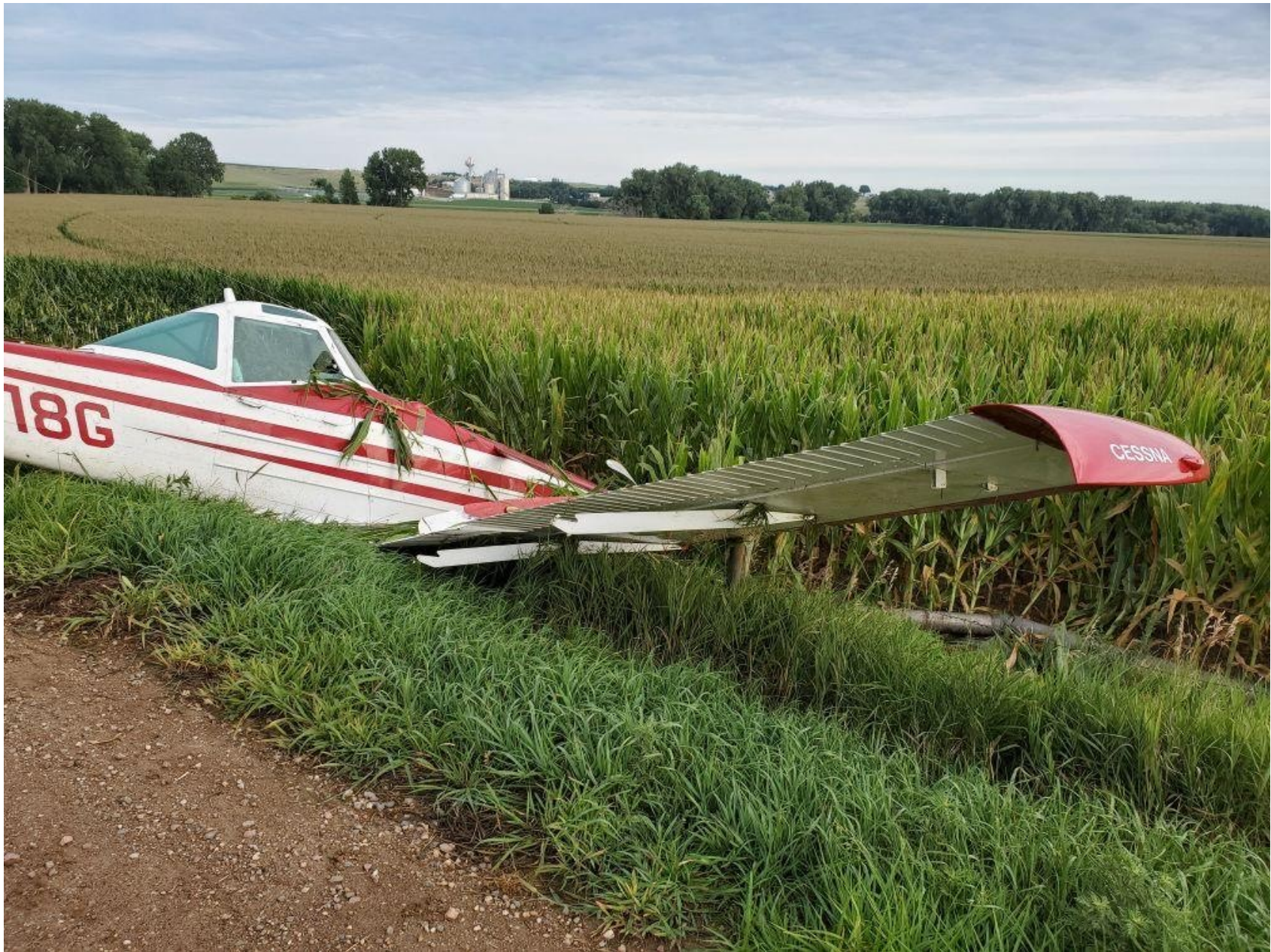
Photo 1 – Supplied photo with a quartering view of the right rear side of the airplane in a farm field.