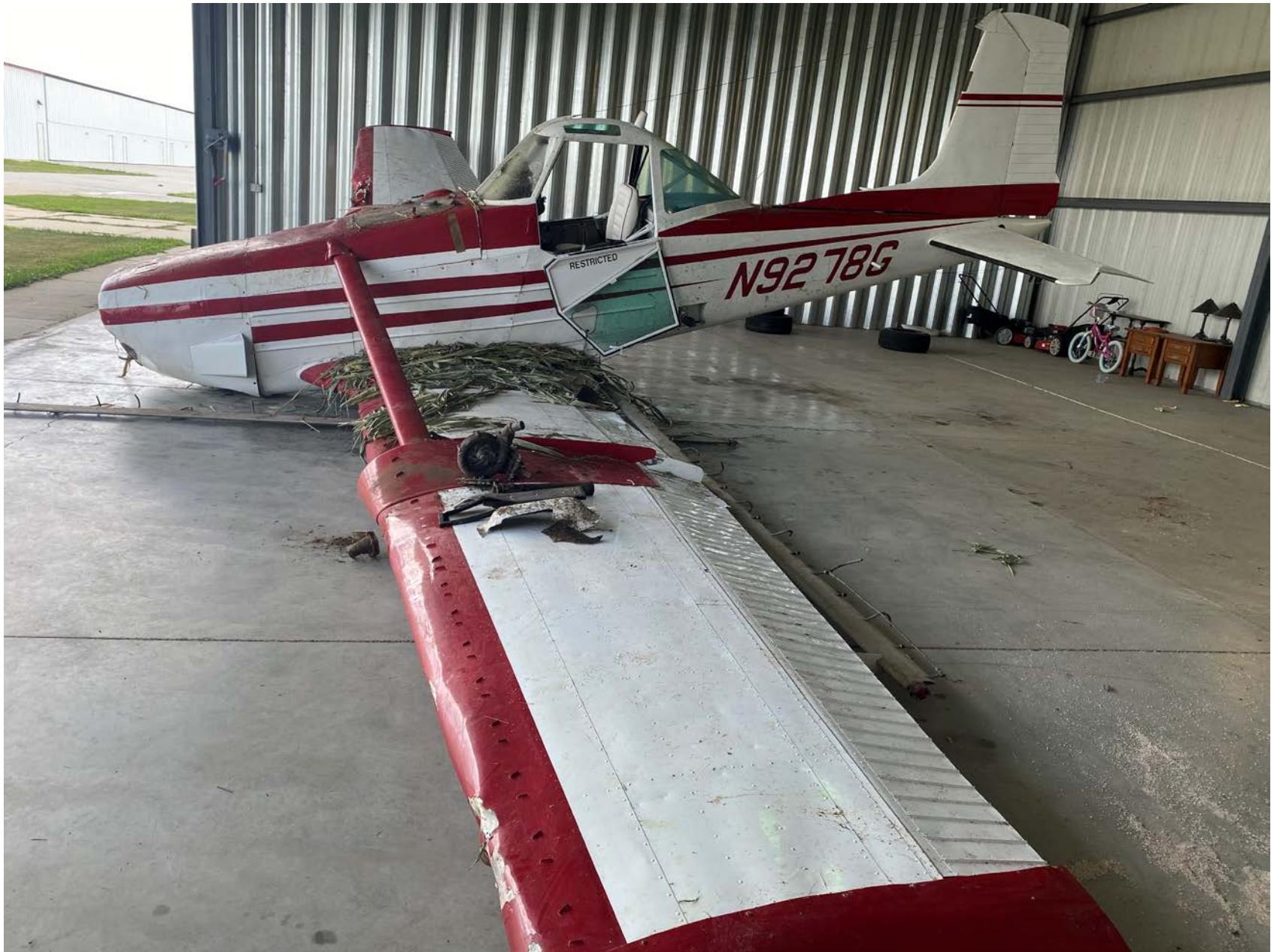
Photo 4 - Supplied photo with a view of the left side of the recovered airplane.