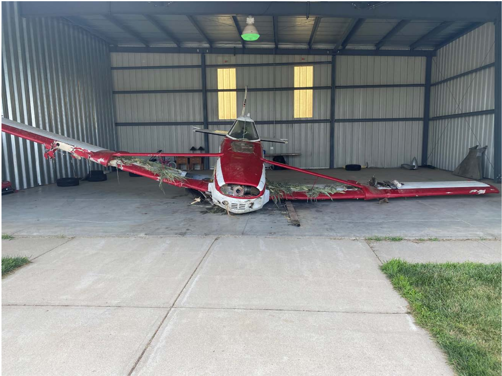
Photo 3 - Supplied photo with a view of the front of the recovered airplane.