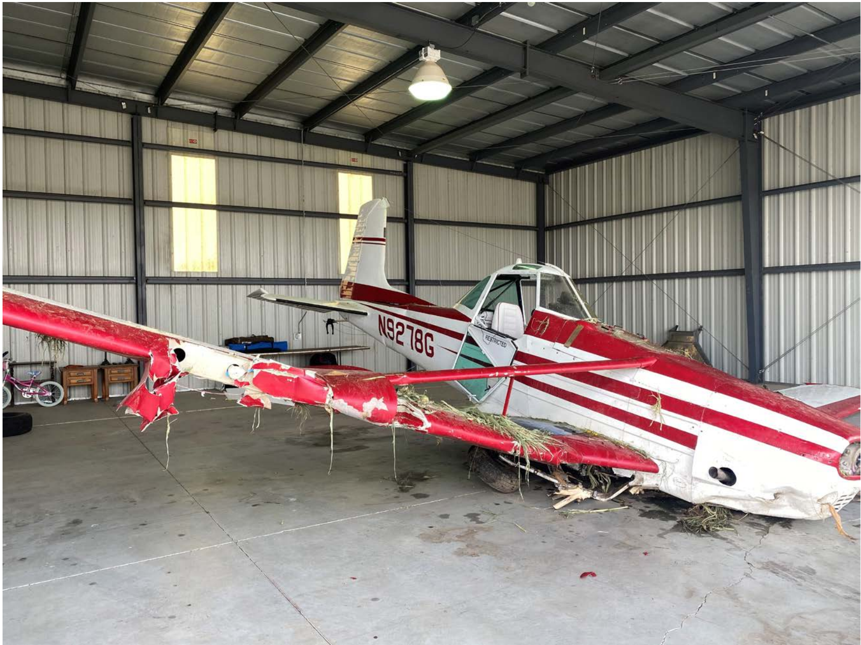
Photo 6 - Supplied photo with a quartering view of the left front side of the recovered airplane.