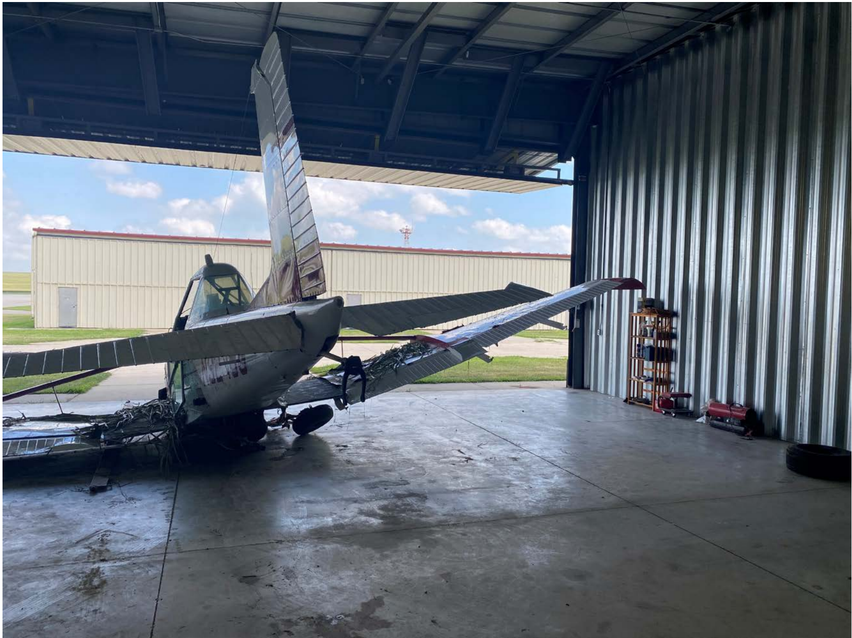
Photo 5 - Supplied photo with a view of the aft side of the recovered airplane.