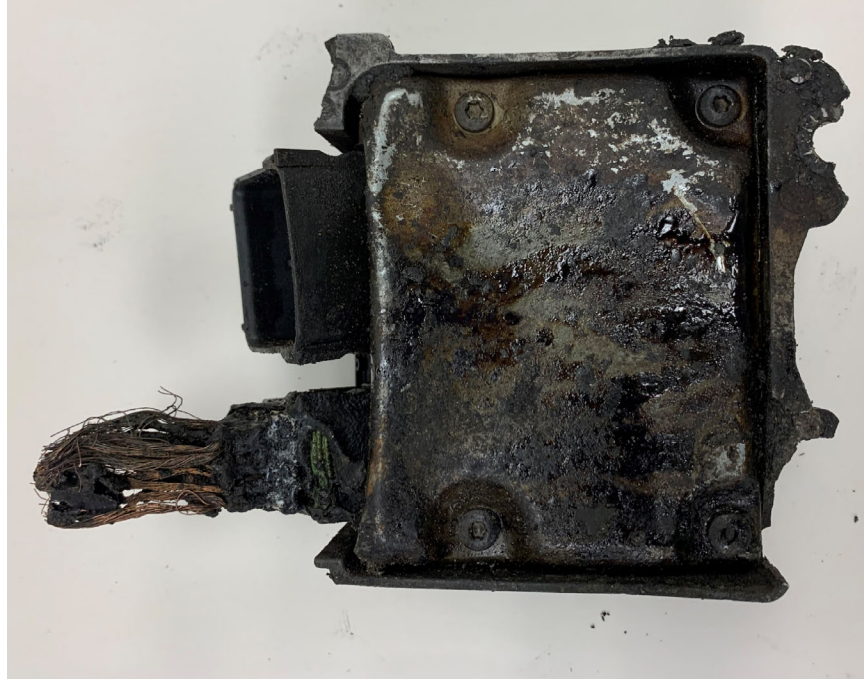
Photograph 1: The damage to the bottom of the ACM from the van