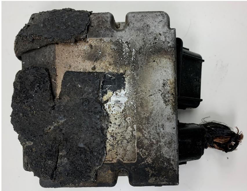
Photograph 2: The damage to the top of the ACM from the van