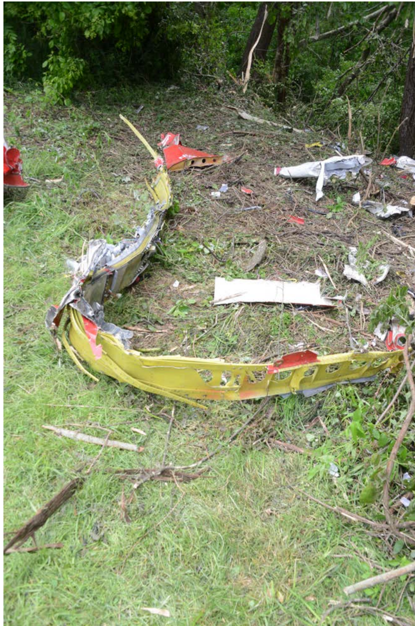
Photo 10 - Close-up view of a separated spar recovered from a separated tree trunk.