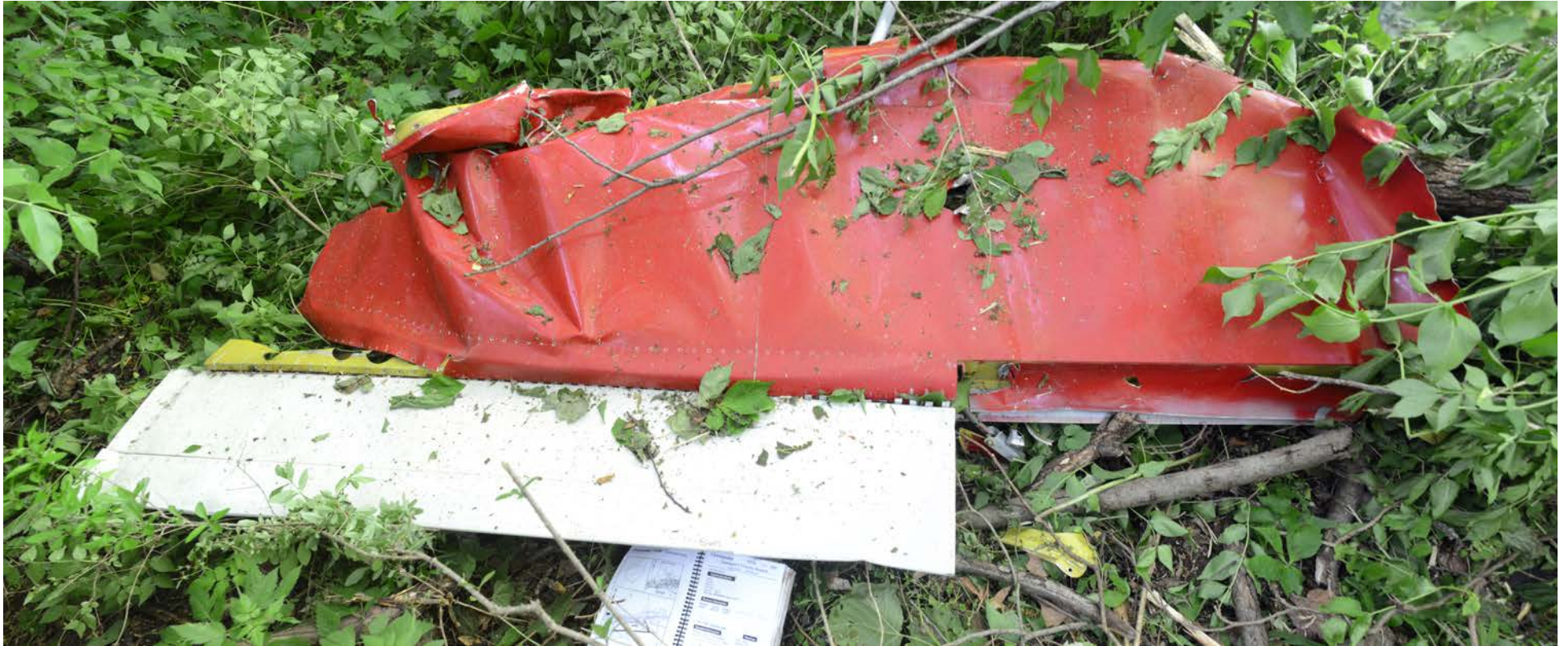
Photo 5 - View of a separated wing.