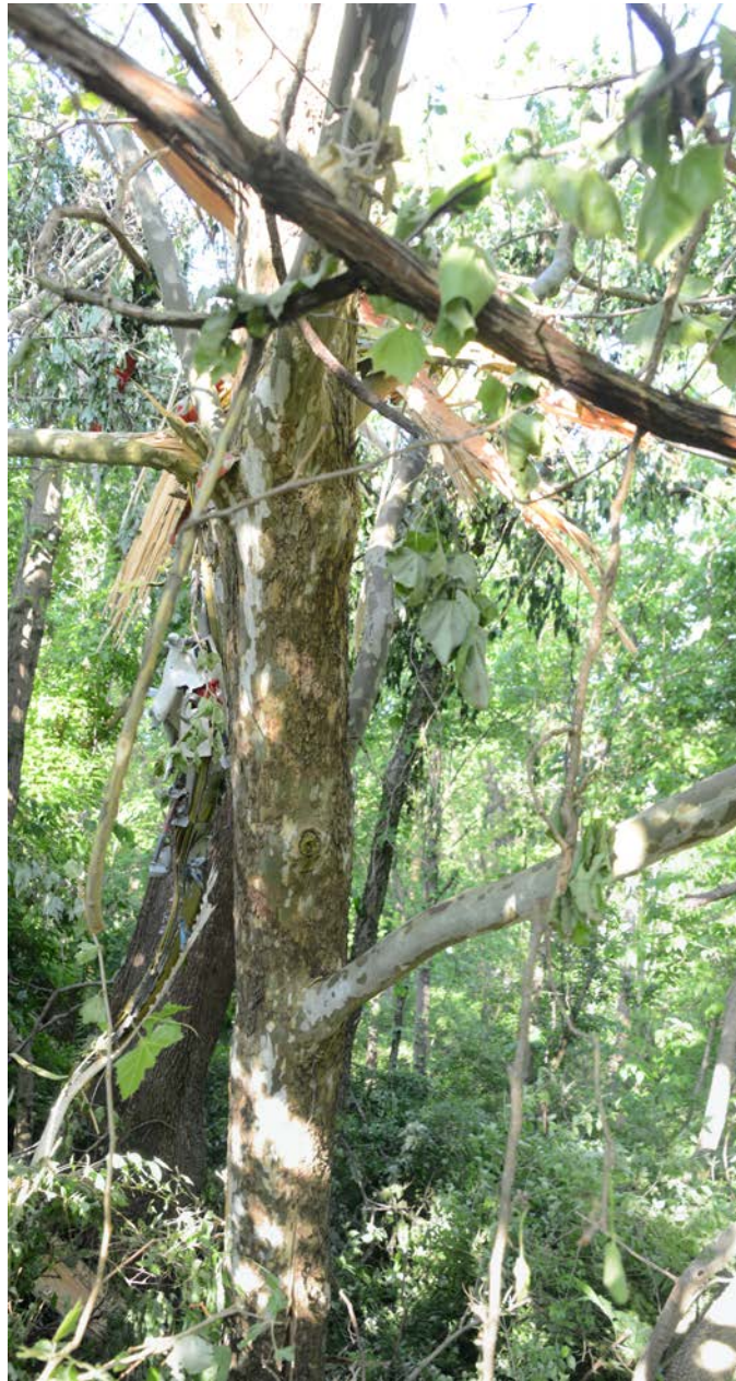
Photo 3 - View of a separated tree trunk under the canopy of trees in a wooded area.