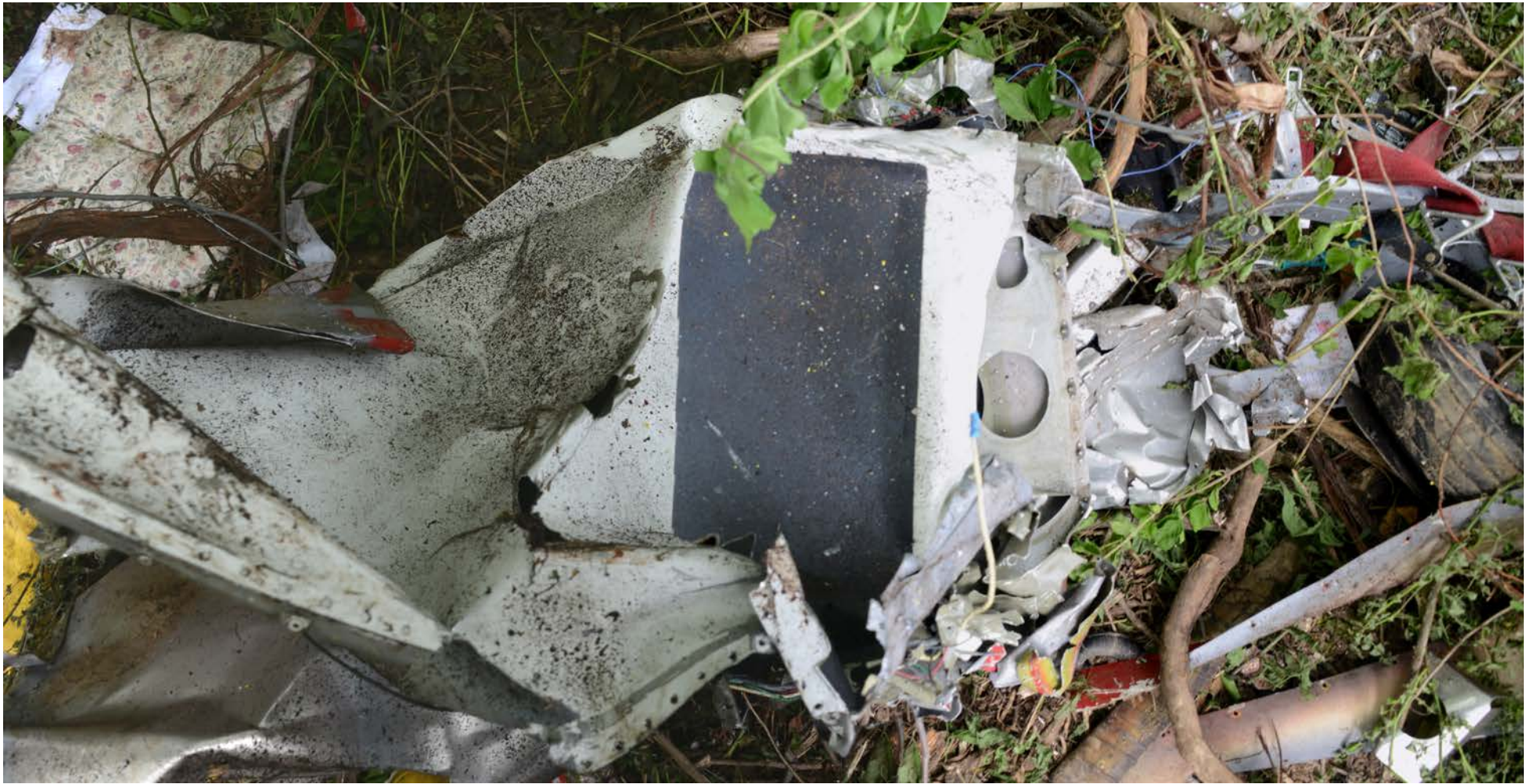
Photo 7 - View of a separated wing section.