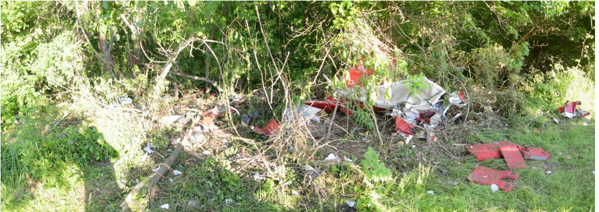
Photo 2 - View of the wreckage under the canopy of trees in a wooded area.