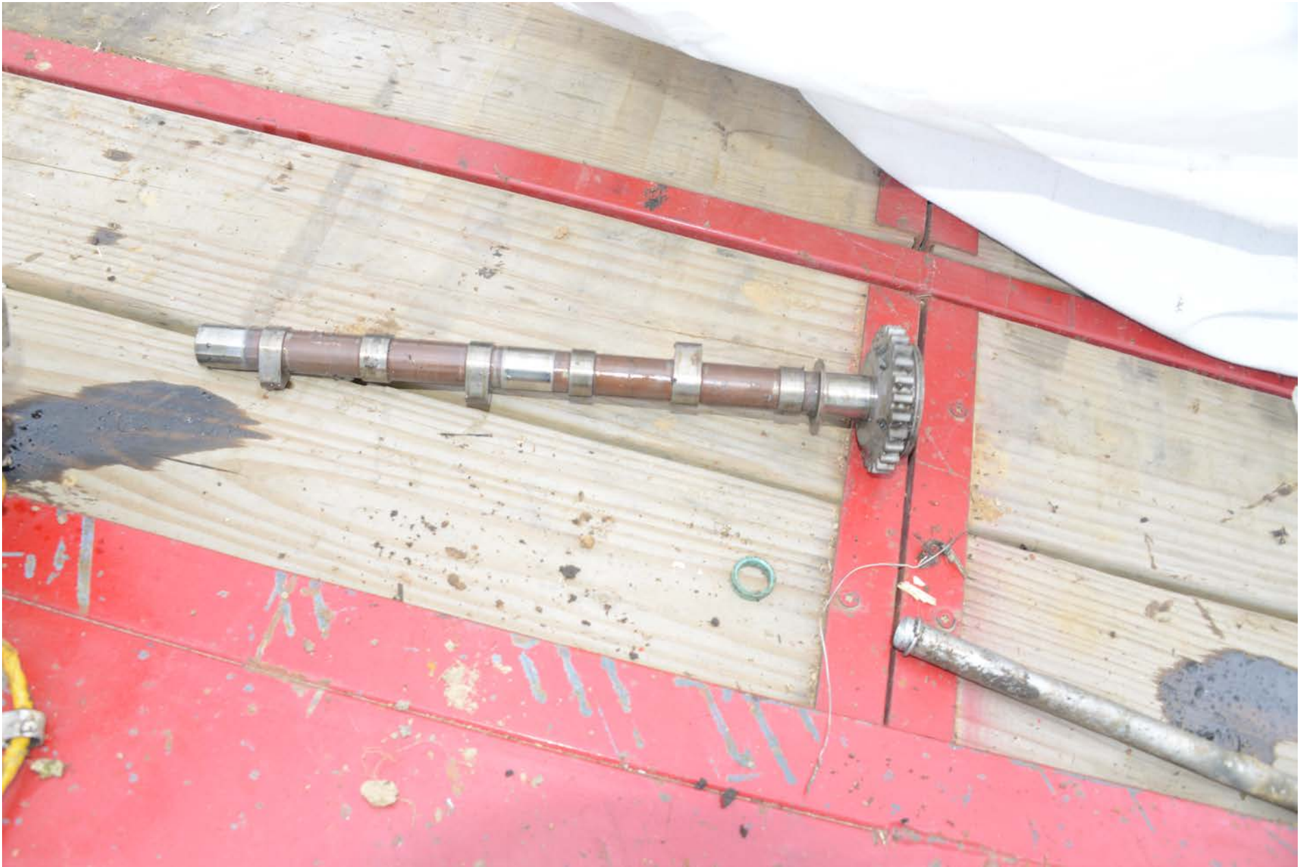
Photo 14 - View of the camshaft from the disassembled engine.