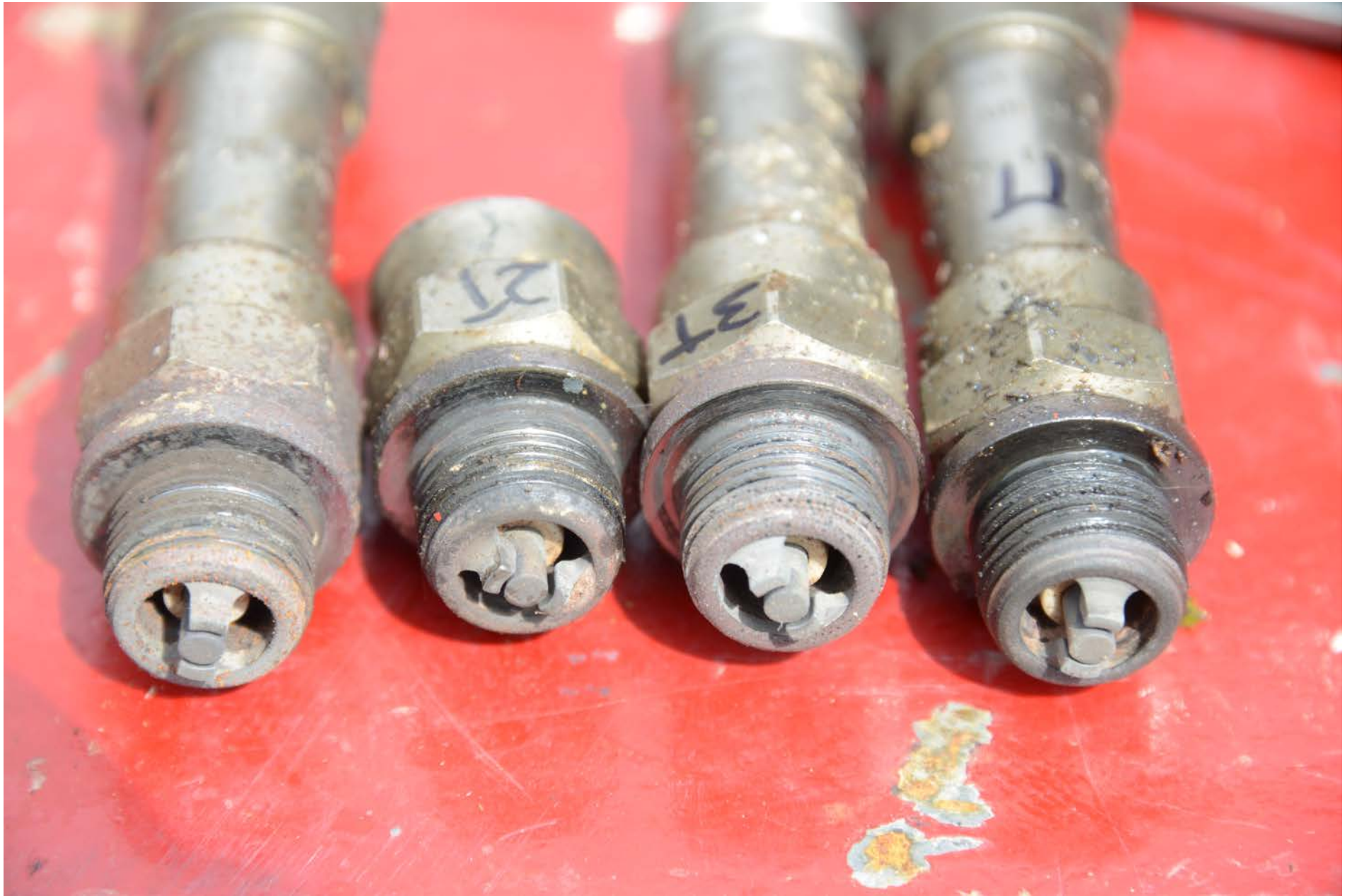
Photo 11 - View of removed sparkplugs.