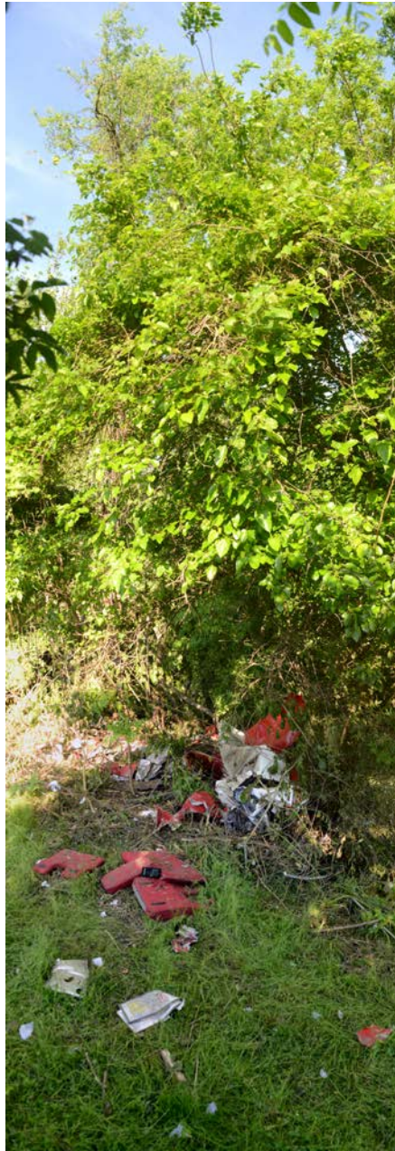
Photo 1 – View of the wreckage under the canopy of trees in a wooded area.