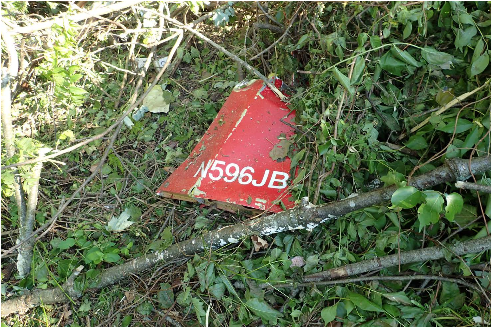
Photo 20 - View of the vertical stabilizer indicating the airplane's N-number.