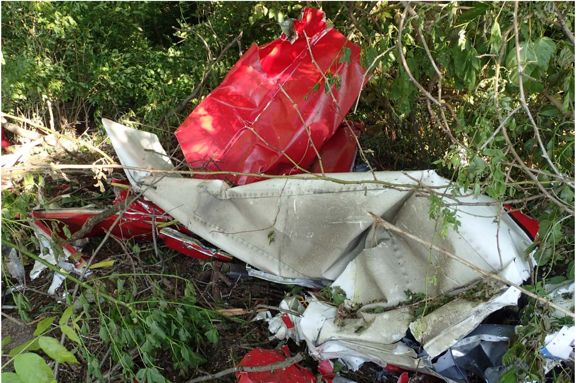
Photo 16 - View of the underside of the fuselage and empennage.