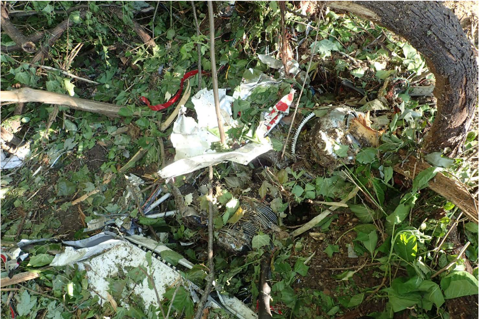
Photo 17 - View of the engine embedded in terrain.