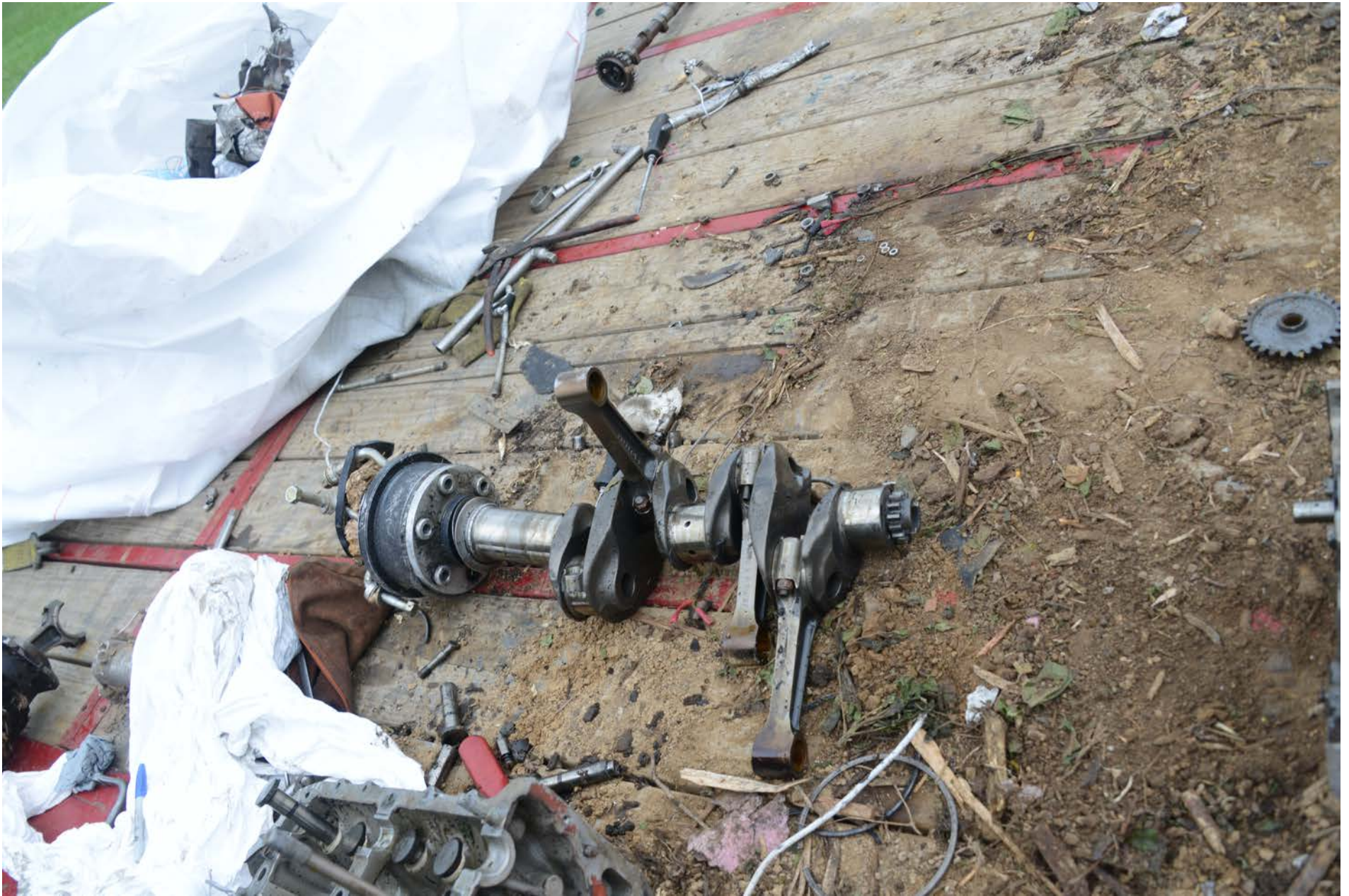
Photo 13 - View of the crankshaft from the disassembled engine.