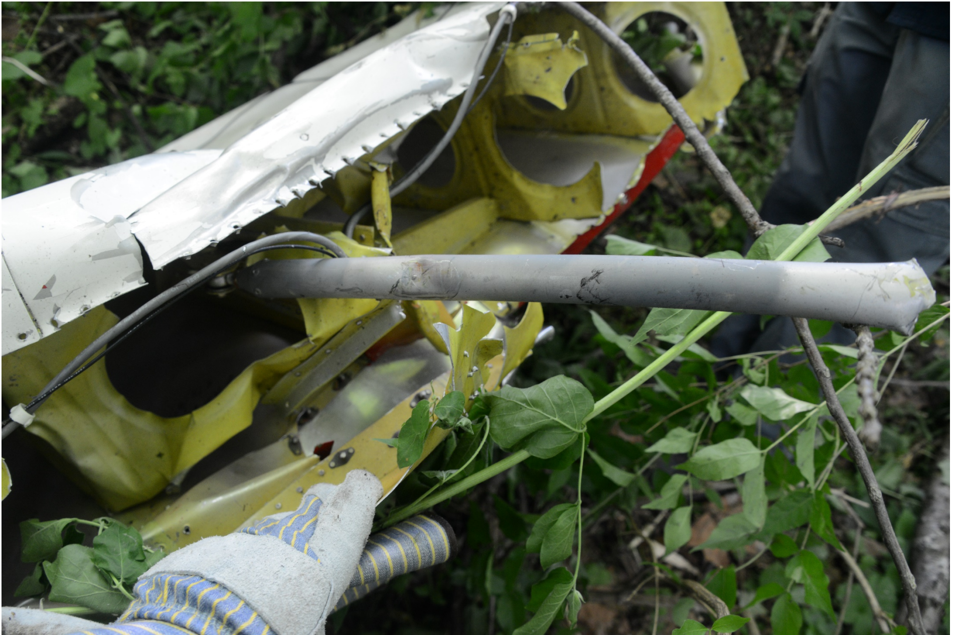
Photo 8 - View of a separated control tube within a separated wing section.