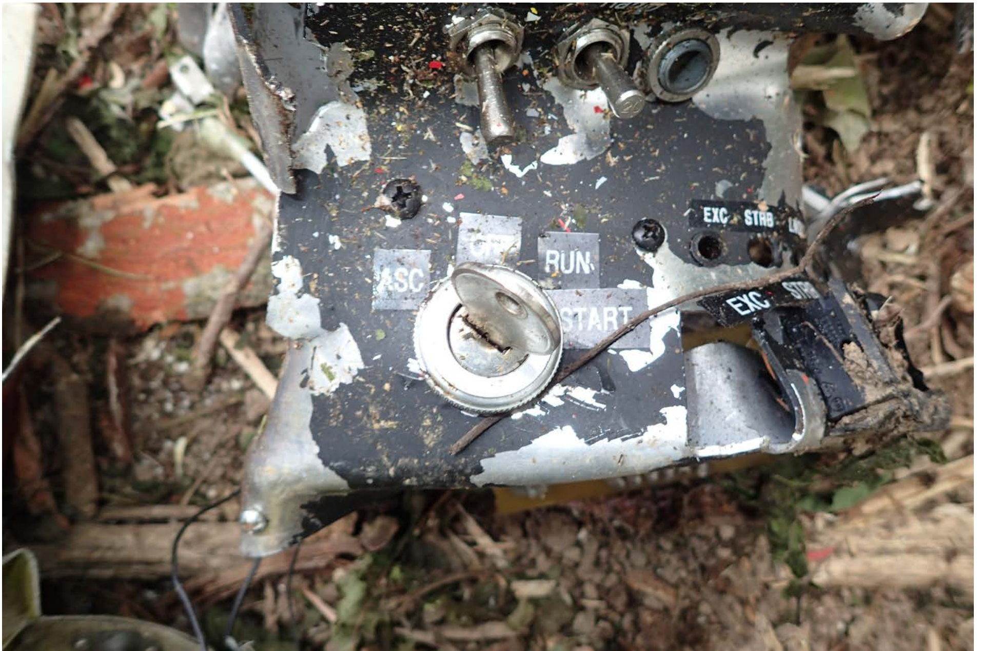
Photo 19 - Close-up view of the ignition switch.