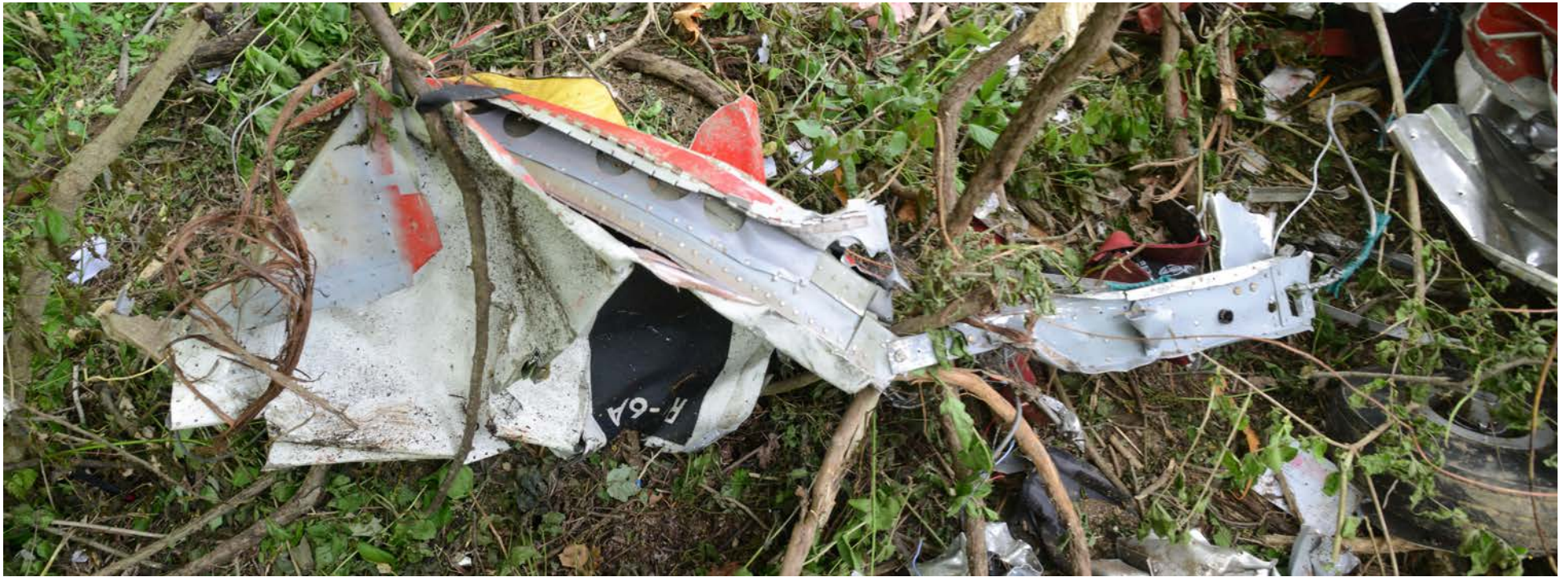
Photo 6 - View of a separated wing section.