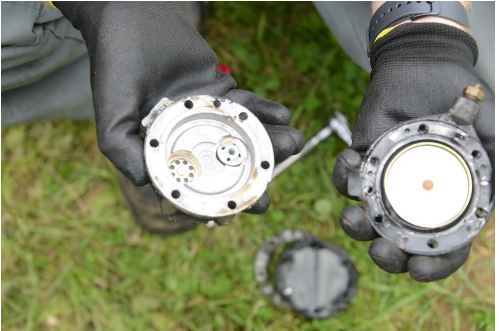
Photo 12 - View of the disassembled engine driven fuel pump.