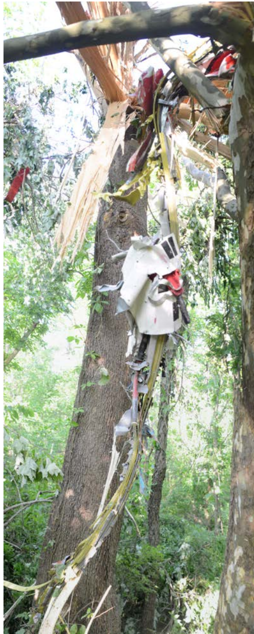
Photo 4 - View of a separated tree trunk and separated airplane parts lodged in the tree trunk under the canopy of trees in a wooded area.