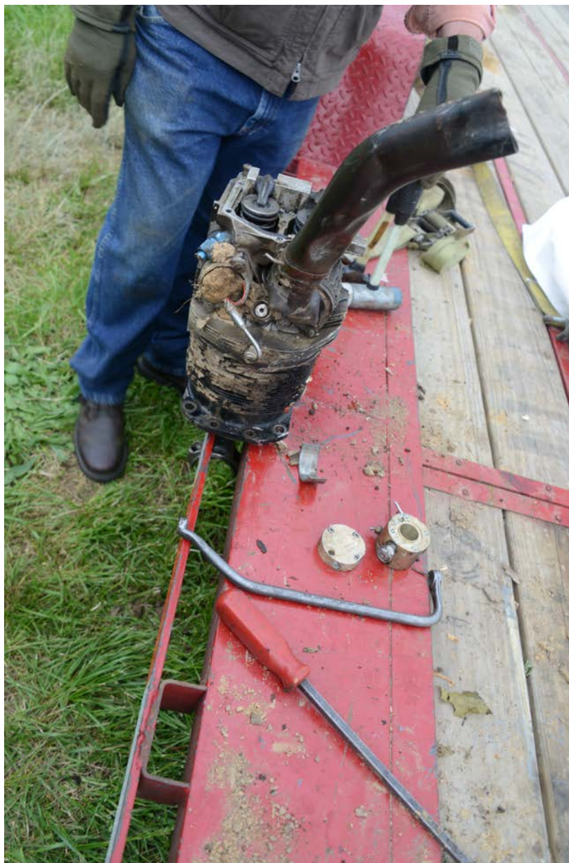
Photo 15 - View of a removed cylinder.