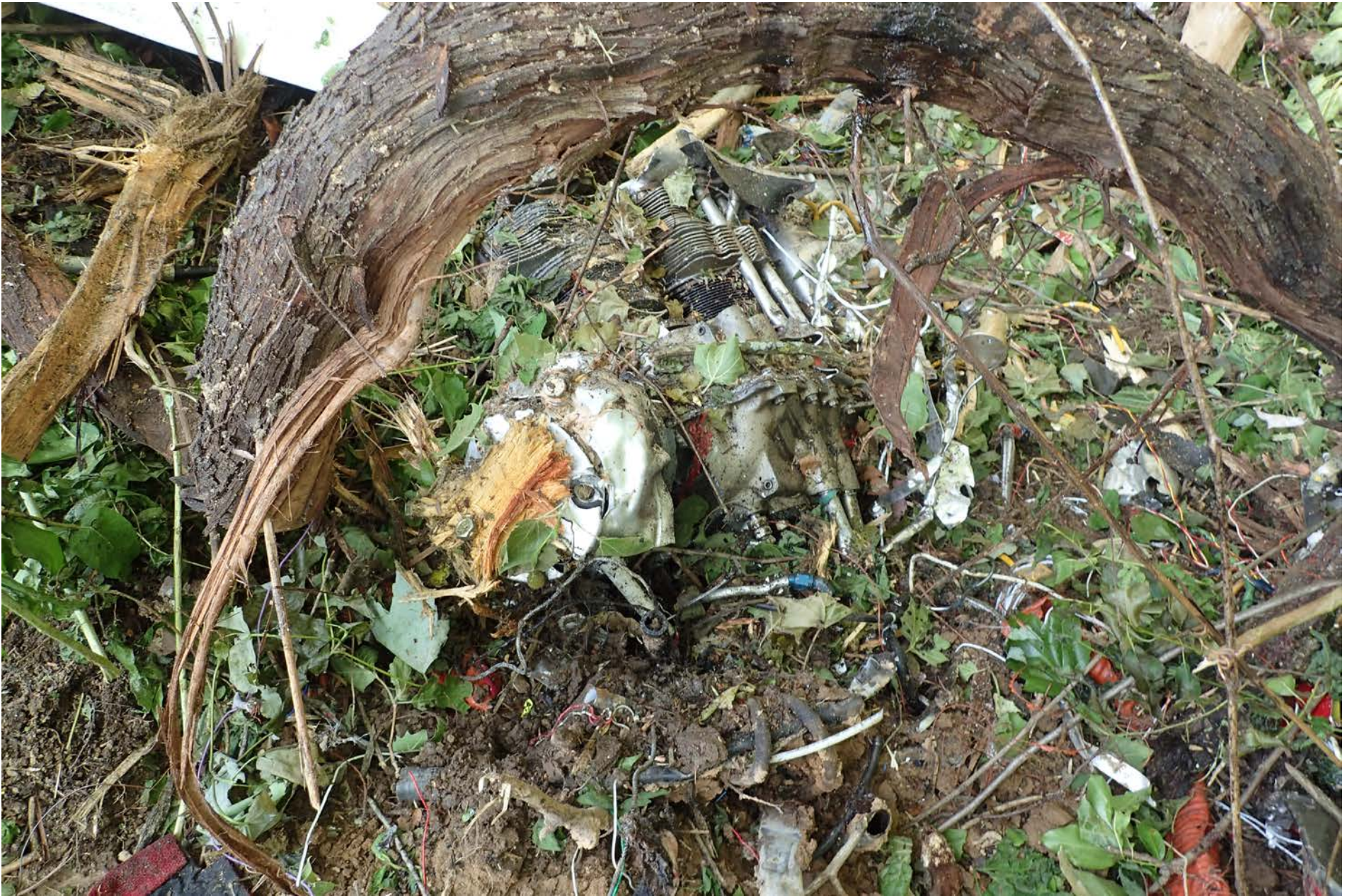
Photo 18 - Close-up view of the engine embedded in terrain.