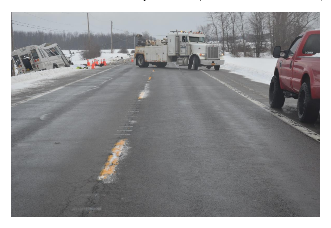
Highway Factors Photograph 3 – Taken on January 28, 2023, at 8:32 a.m., approximately 2 hours and 30 minutes after the crash looking to the east, illustrates bare pavement conditions on State Route 37 in the vicinity of the crash