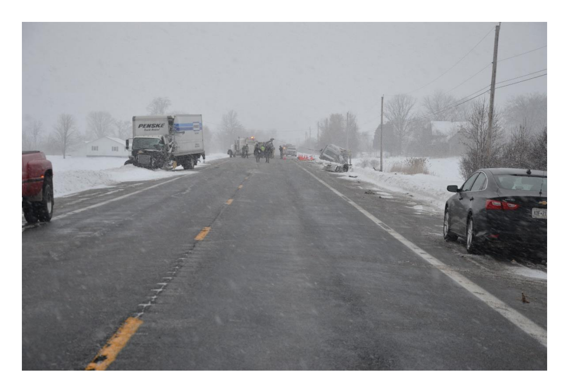
Highway Factors Photograph 2 – Taken on January 28, 2023, at 8:26 a.m., approximately 2 hours and 24 minutes after the crash looking to the west, illustrates bare pavement conditions on State Route 37 in the vicinity of the crash