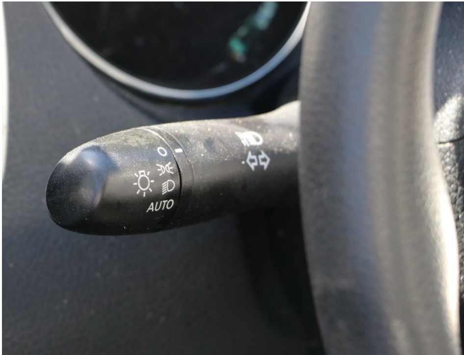
Figure 5. The headlamp selector knob for the SUV.