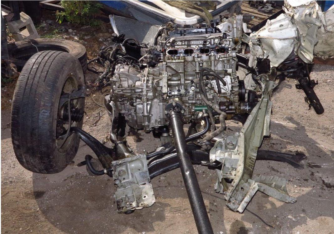
Figure 4. Looking from the rear of the engine toward the front. The tire on the left is the left side of the SUV.