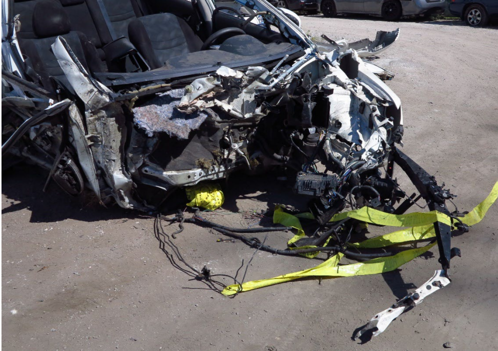
Figure 1. The damage sustained to the right front of the SUV.