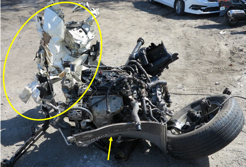
Figure 3. Looking from the front of the engine toward where the passenger compartment would have been.