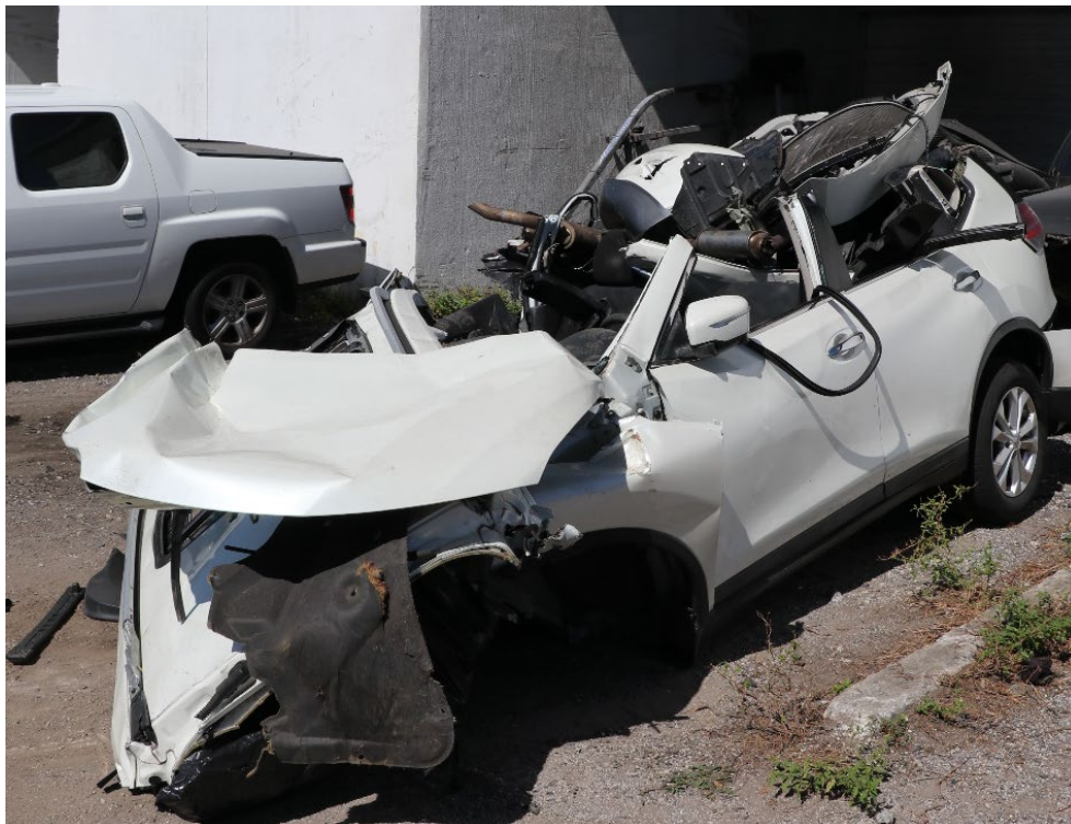
Figure 2. The damage sustained to the left side of the SUV.