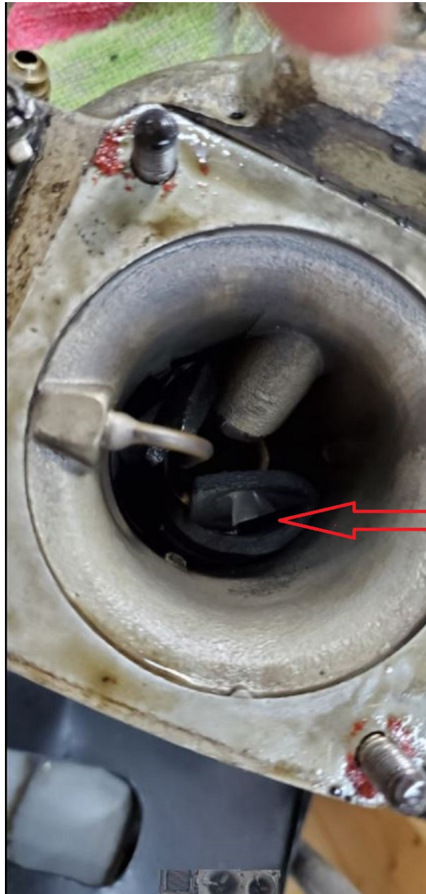
Photo 5 - The carburetor intake. Note the strip of air filter gasket lodged in the throat (arrow)