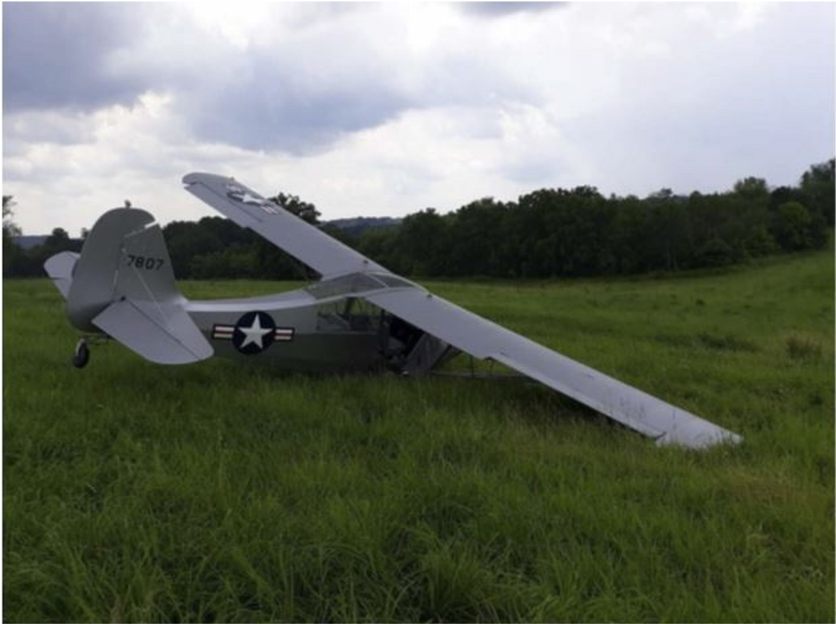
Photo 1 – N9325H, an Aeronca L-16A (7BCM), in a pasture after a forced landing following a total loss of engine power