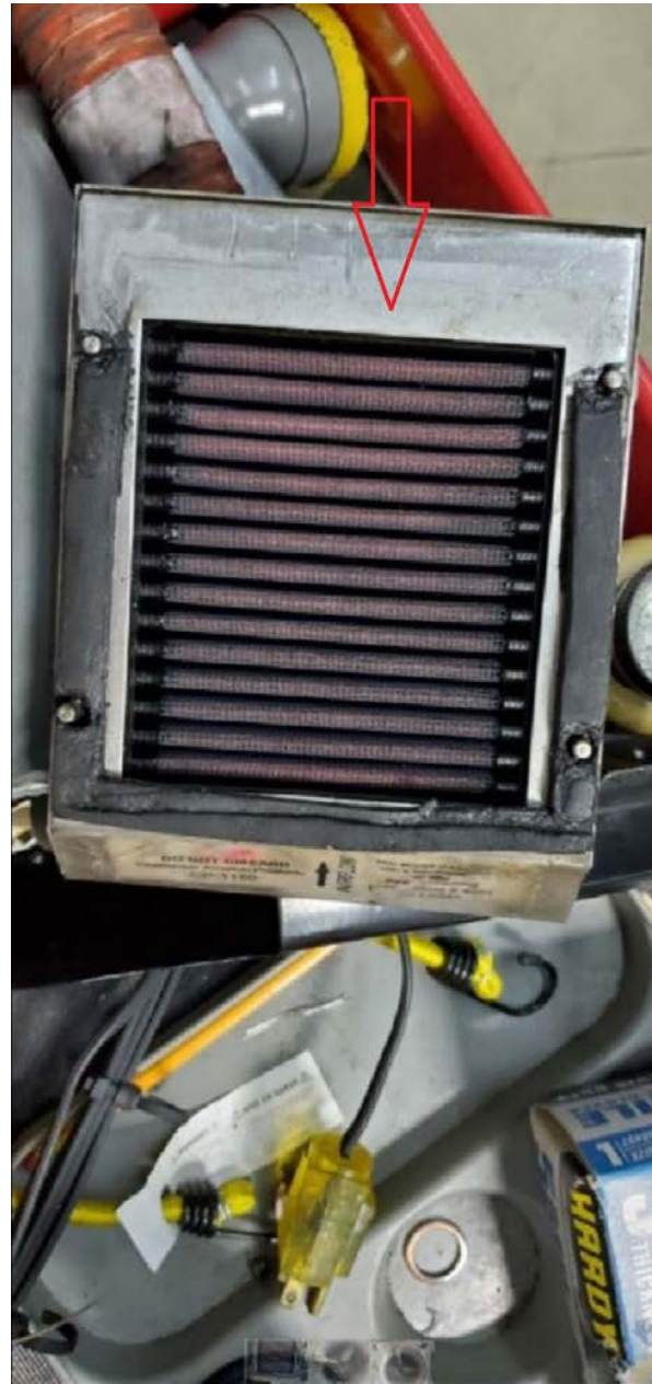
Photo 4 - The condition of the air filter gasket as found by the mechanic. Note the gasket seal is missing from the top of the air filter (arrow)