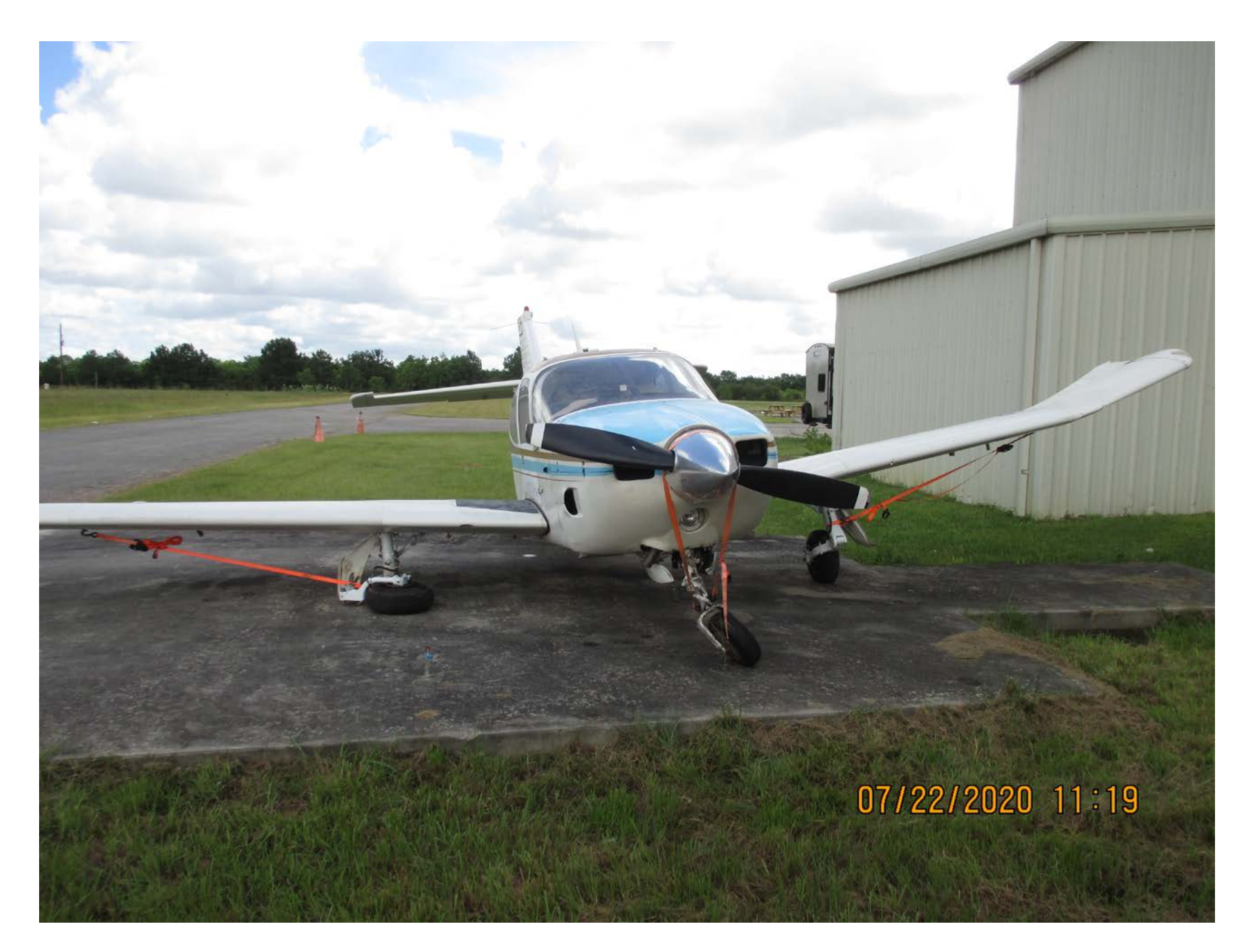
Photo 1 – N1013J, a Rockwell 112, at the David Wayne Hooks Memorial Airport (DWH), after recovery