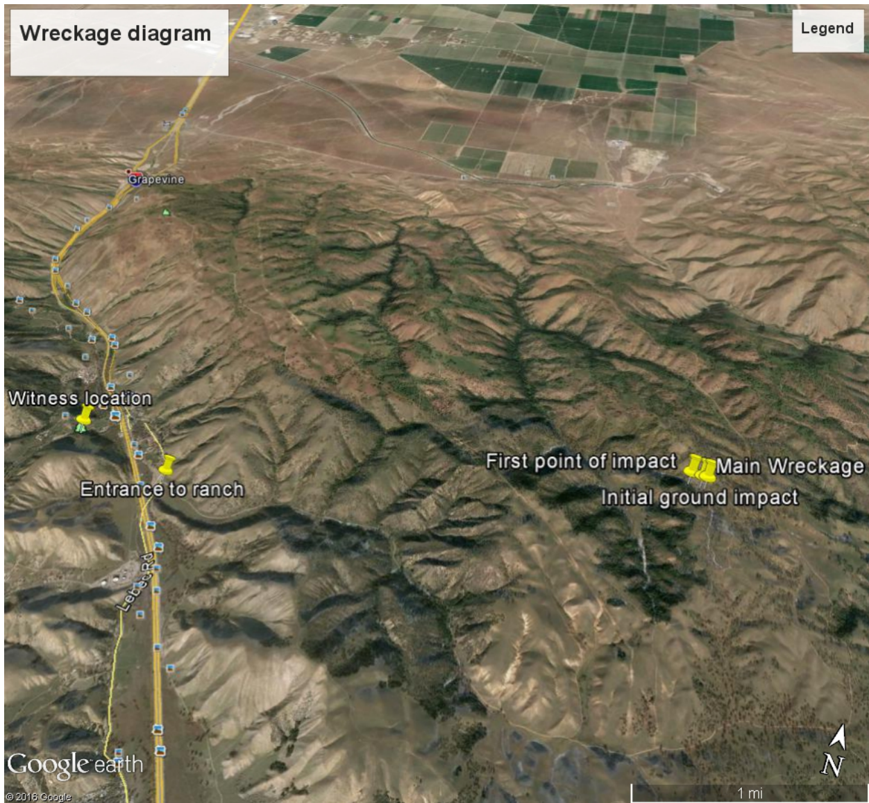
Figure 1: Google Earth view of the witness locations and accident site

Witnesses report seeing a low flying aircraft flying over the interstate, about 4 miles from the accident site. The airplane impacted tree covered terrain on a 090 heading at about 4,000 mean sea level (msl).