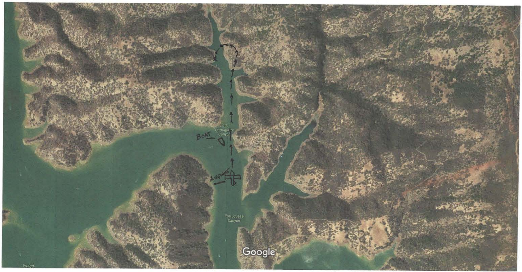
500 ft