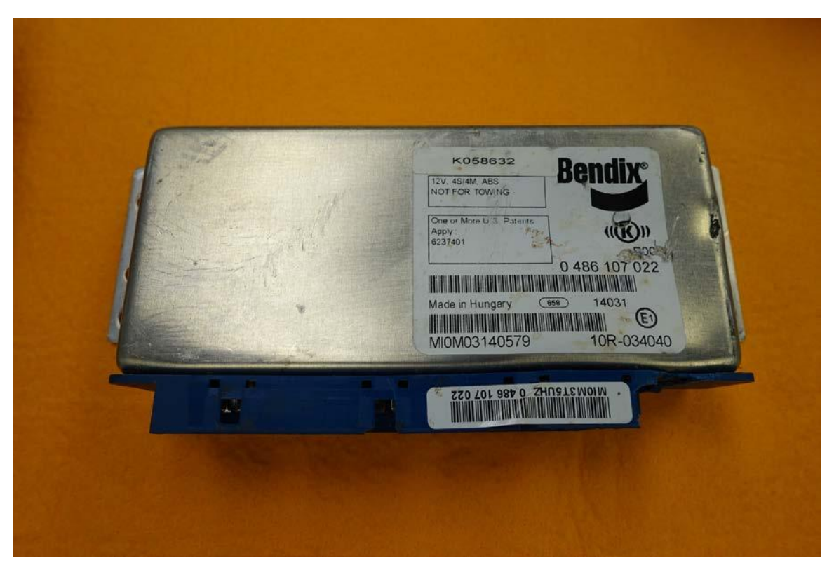
Figure 1: Bendix ABS ECU (Serial No. MI0M03140579)