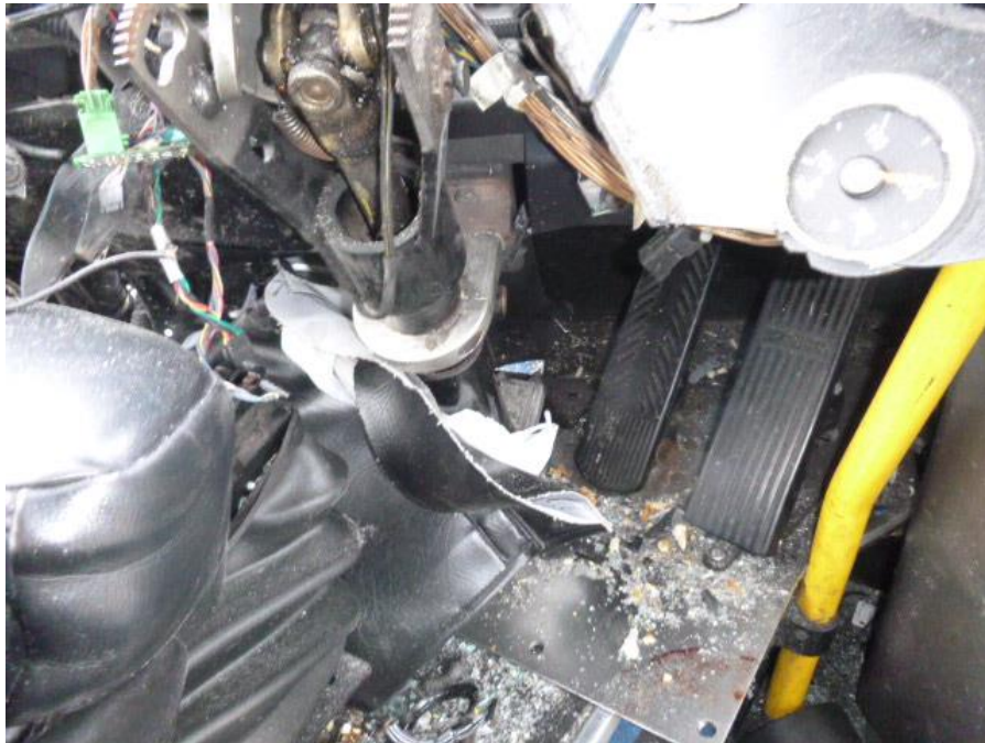
Photo 7 – Brake and accelerator control pedals of the 2005 New Flyer transit bus