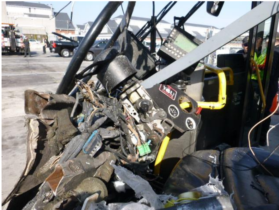
Photo 8 - Steering wheel and column of the 2005 New Flyer transit bus