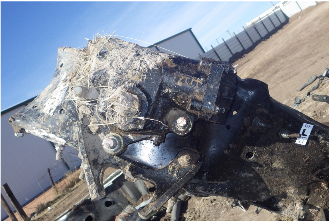
Photo 6 – Showing the Steering gear box at left side frame rail from the 2015 Blue Bird Vision bus modified for prison transport.