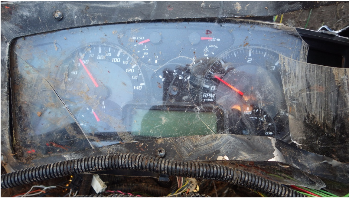
Photo 9 – Instrument cluster containing speedometer from the 2015 Blue Bird Vision bus modified for prison transport.