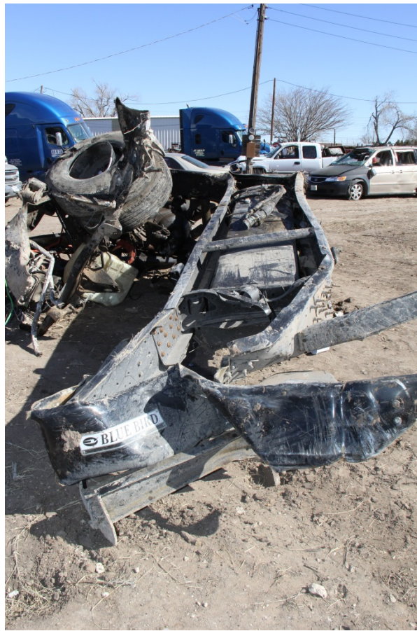
Photo 3 – Front view facing towards the rear of twisted frame rails from the 2015 Blue Bird Vision bus modified for prison transport.