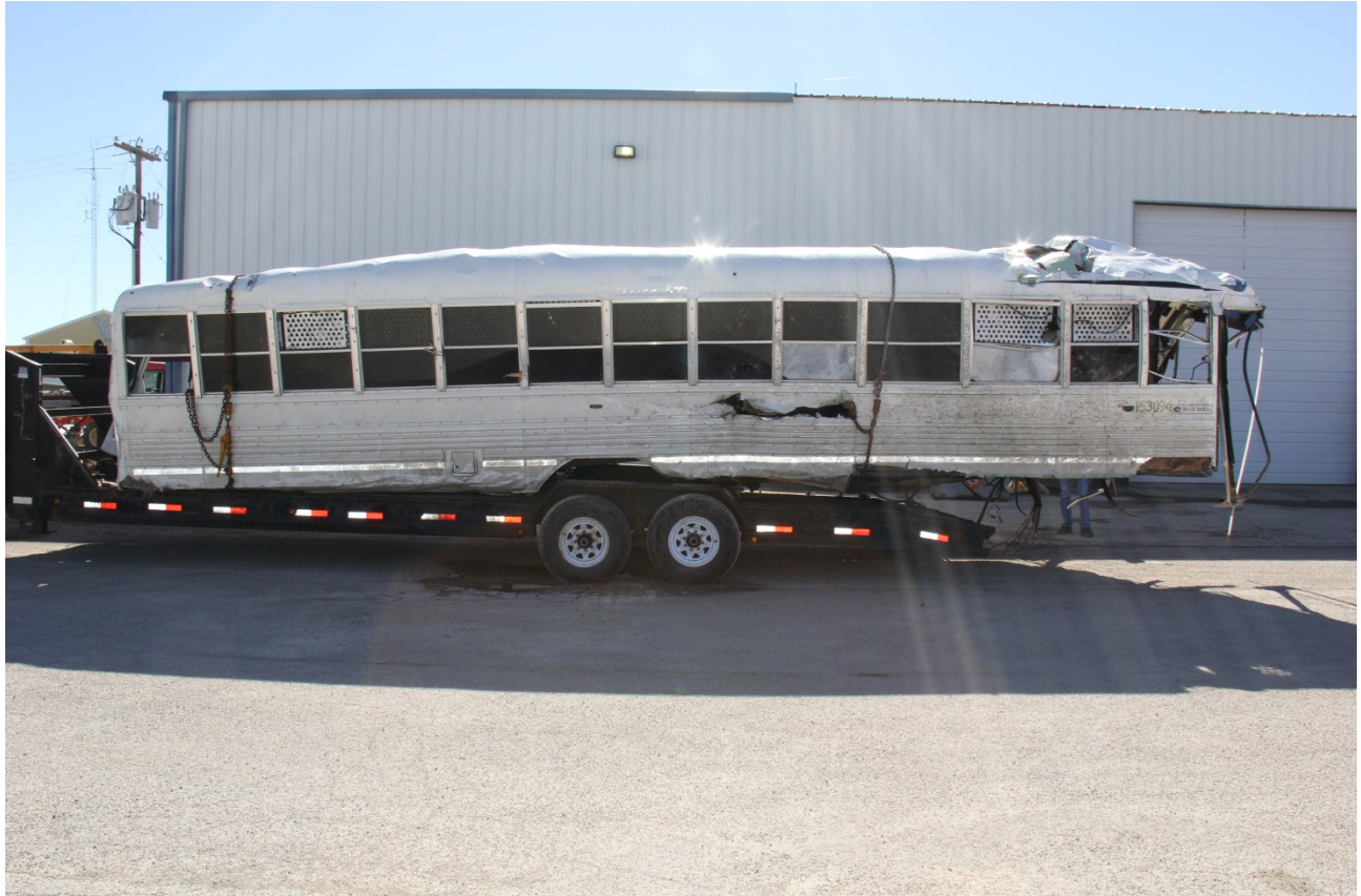
Photo 2 – Right side view of the 2015 Blue Bird Vision bus modified for prison transport body, showing it detached from the frame.