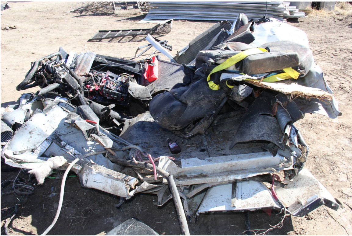
Photo 5 – Left side view of the driver seat area from the 2015 Blue Bird Vision bus modified for prison transport.