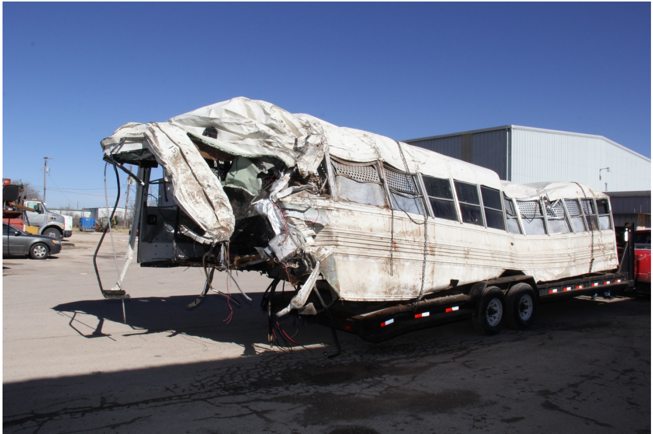
Photo 1 – Left side view of the 2015 Blue Bird Vision bus modified for prison transport body, showing it detached from the frame.