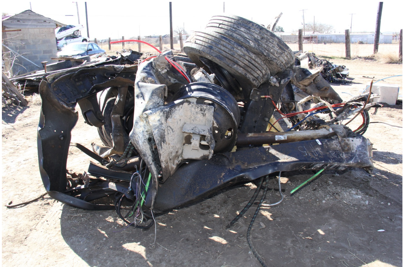
Photo 4 – Rear view facing towards the front of twisted frame rails from the 2015 Blue Bird Vision bus modified for prison transport.