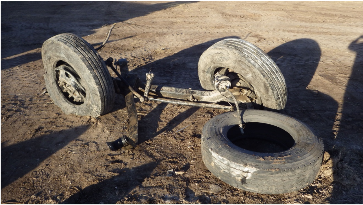
Photo 7 – Front drive axle with steering linkage that was detached from the 2015 Blue Bird Vision bus modified for prison transport.