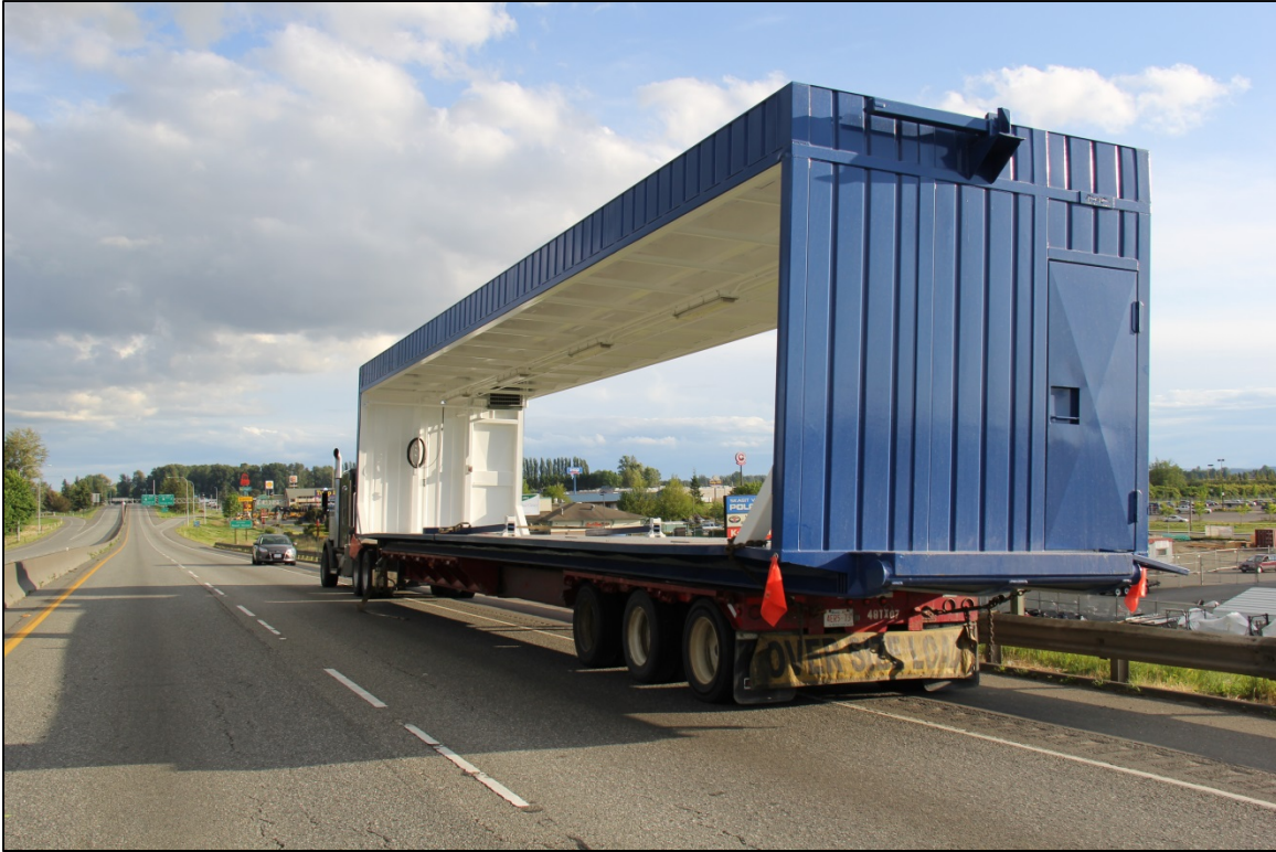
Photograph 6: Oversized load combination stopped on south side of bridge.