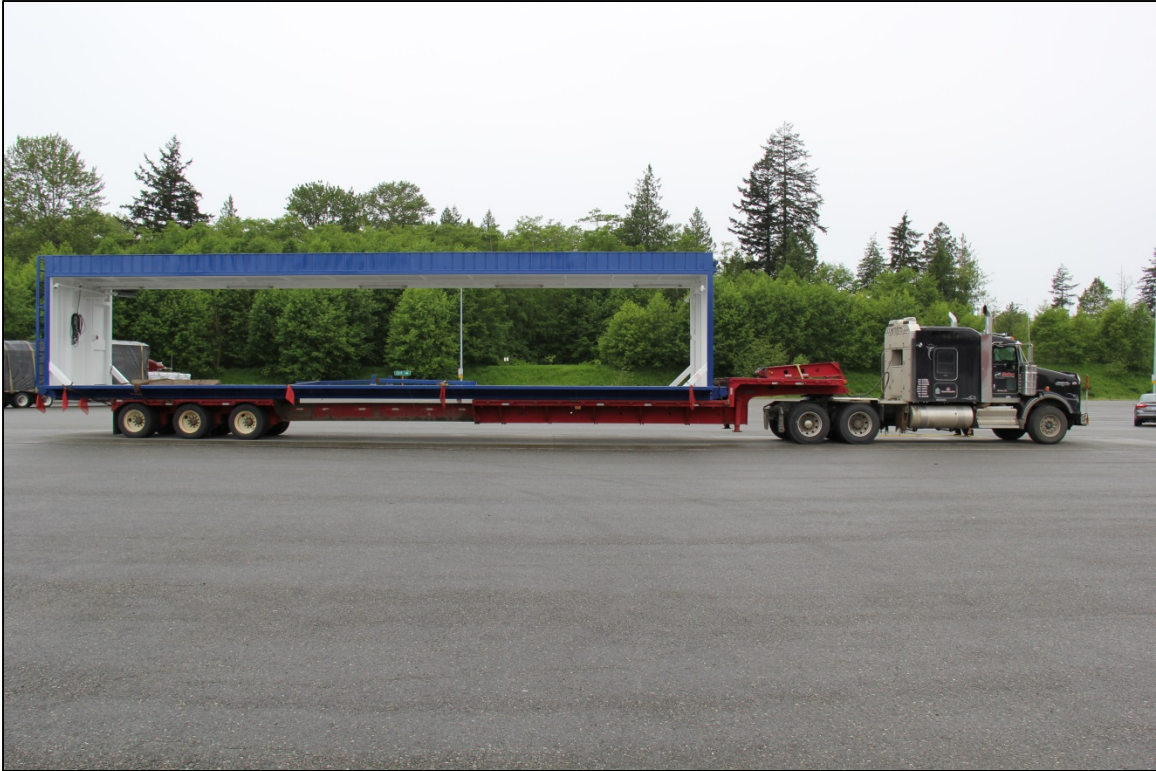
Photograph 12: Exemplar oversize load combination.