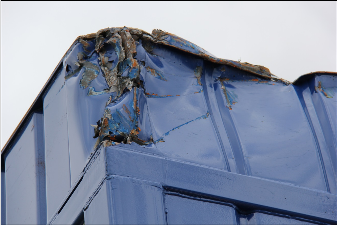
Photograph 8: Impact damage to upper right corner of casing shed.