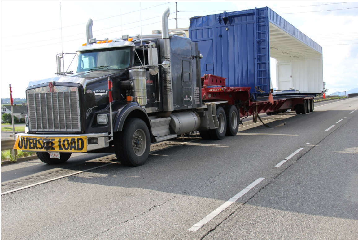
Photograph 5: Oversized load combination stopped on south side of bridge.