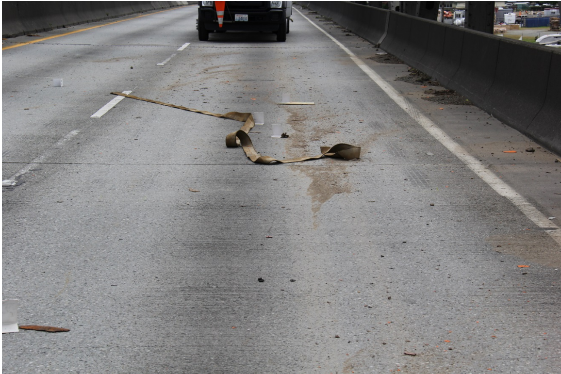
Photograph 3: Debris in right lane of southbound roadway on span number 7.