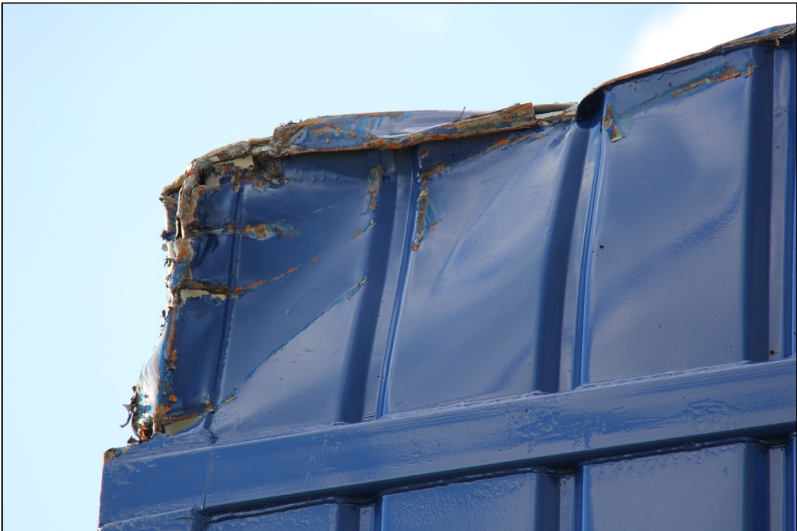
Photograph 9: Impact damage to upper right corner of casing shed.