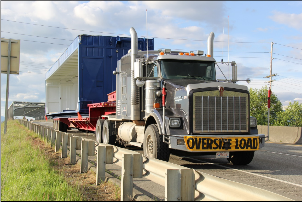
Photograph 4: Oversized load combination stopped on south side of bridge.