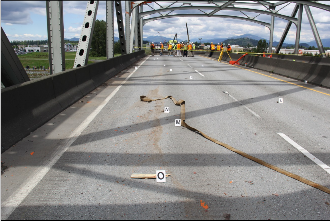
Photograph 2: Debris deposited on span 7 in right lane of southbound roadway.