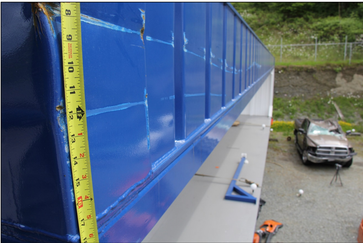
Photograph 11: Impact damage to upper forward side of casing shed.