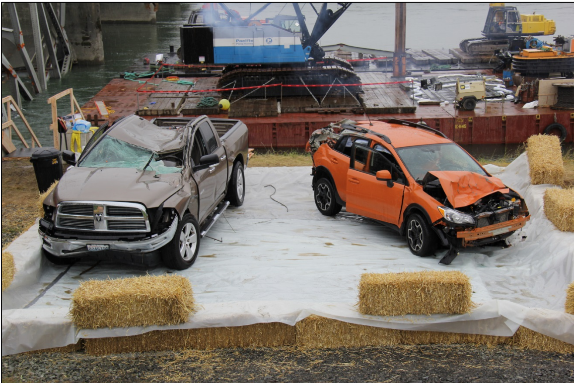
Photograph 13: Subaru Crosstrek and Dodge Ram pickup after recovery from river.