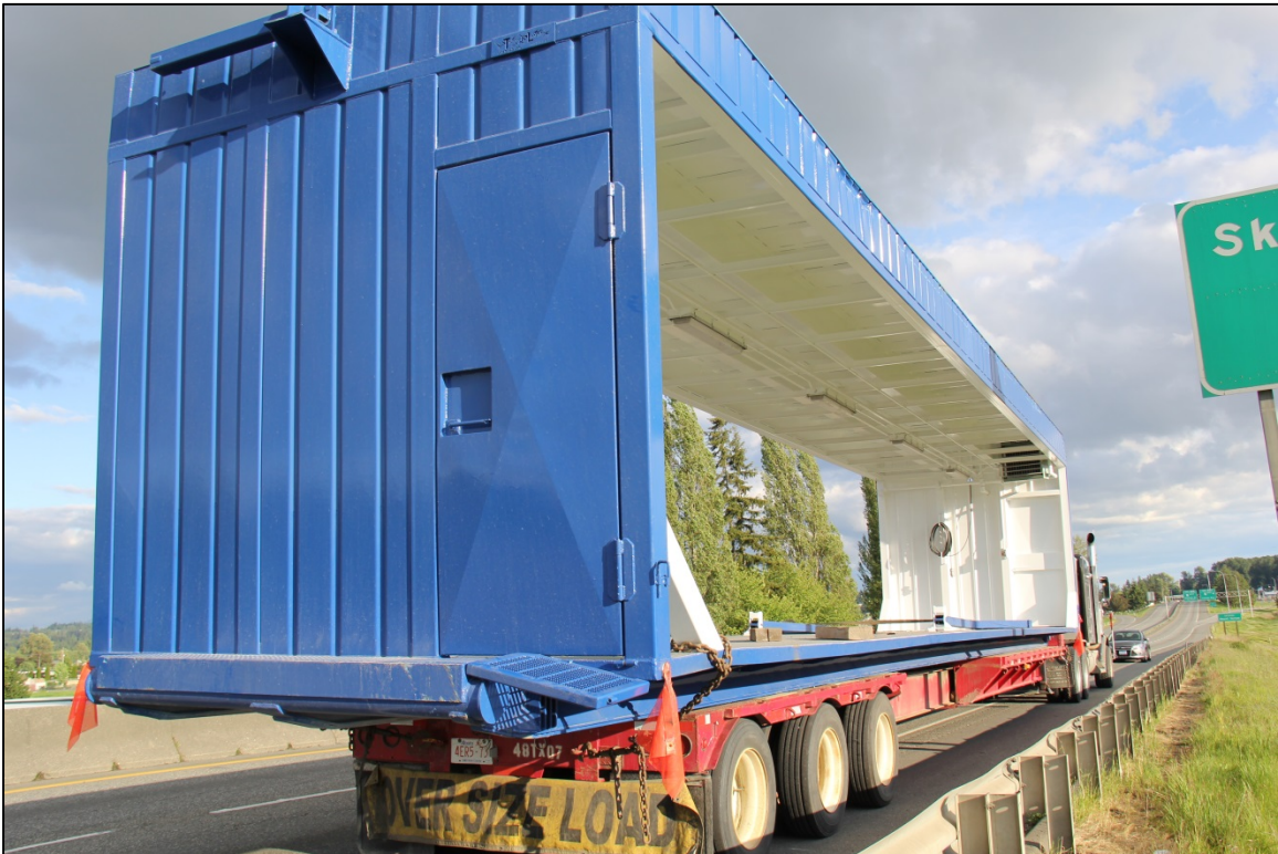
Photograph 7: Oversize load combination stopped on south side of bridge.