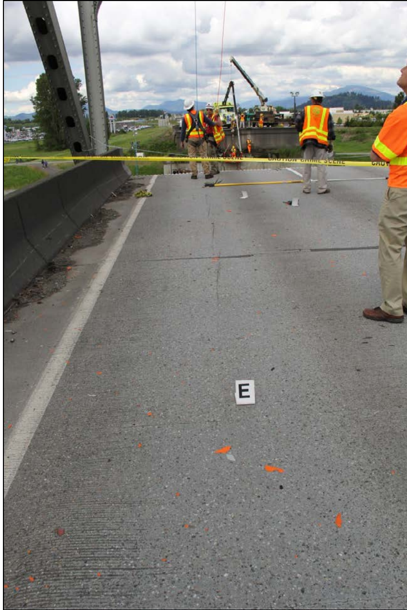
Photograph 1: Tire friction marks on span number 7 in right lane south of the expansion joint between spans 7 and 8.