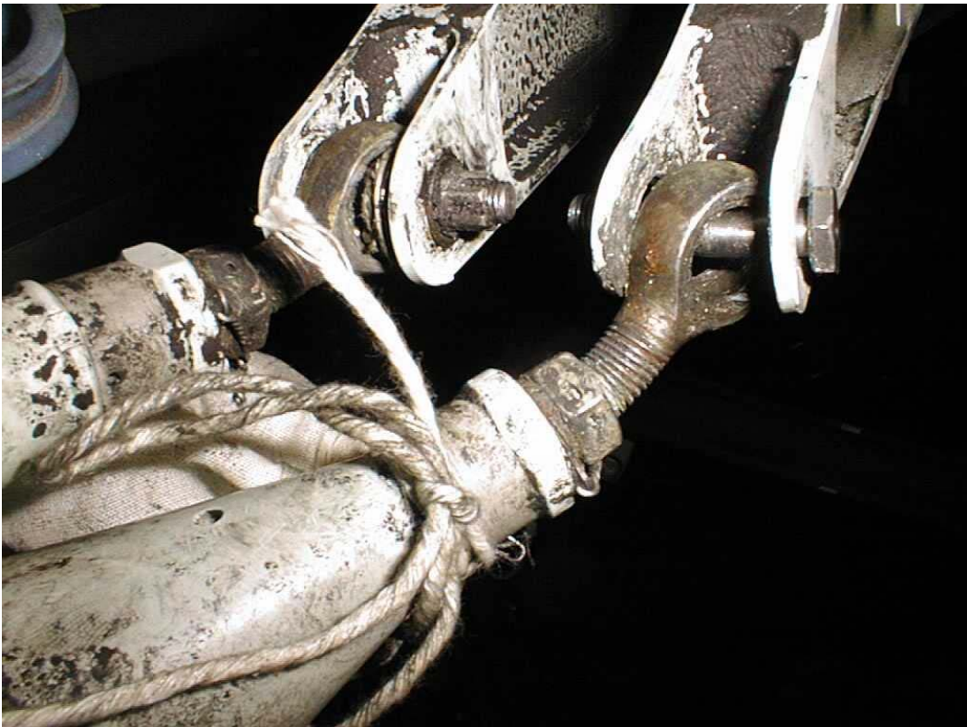
Figure 10. Bellcrank and Pushrods at Rib 3.