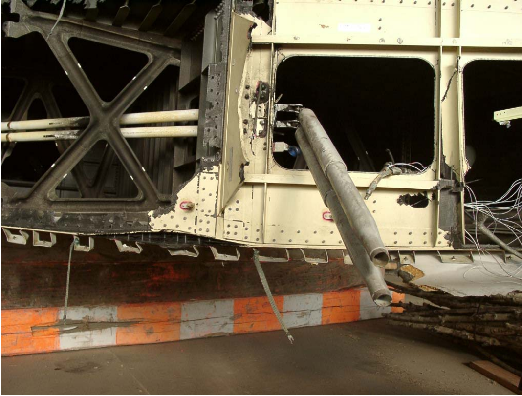
Figure 9. Pushrods and Bellcranks Between Rib 4 and Rib 1.