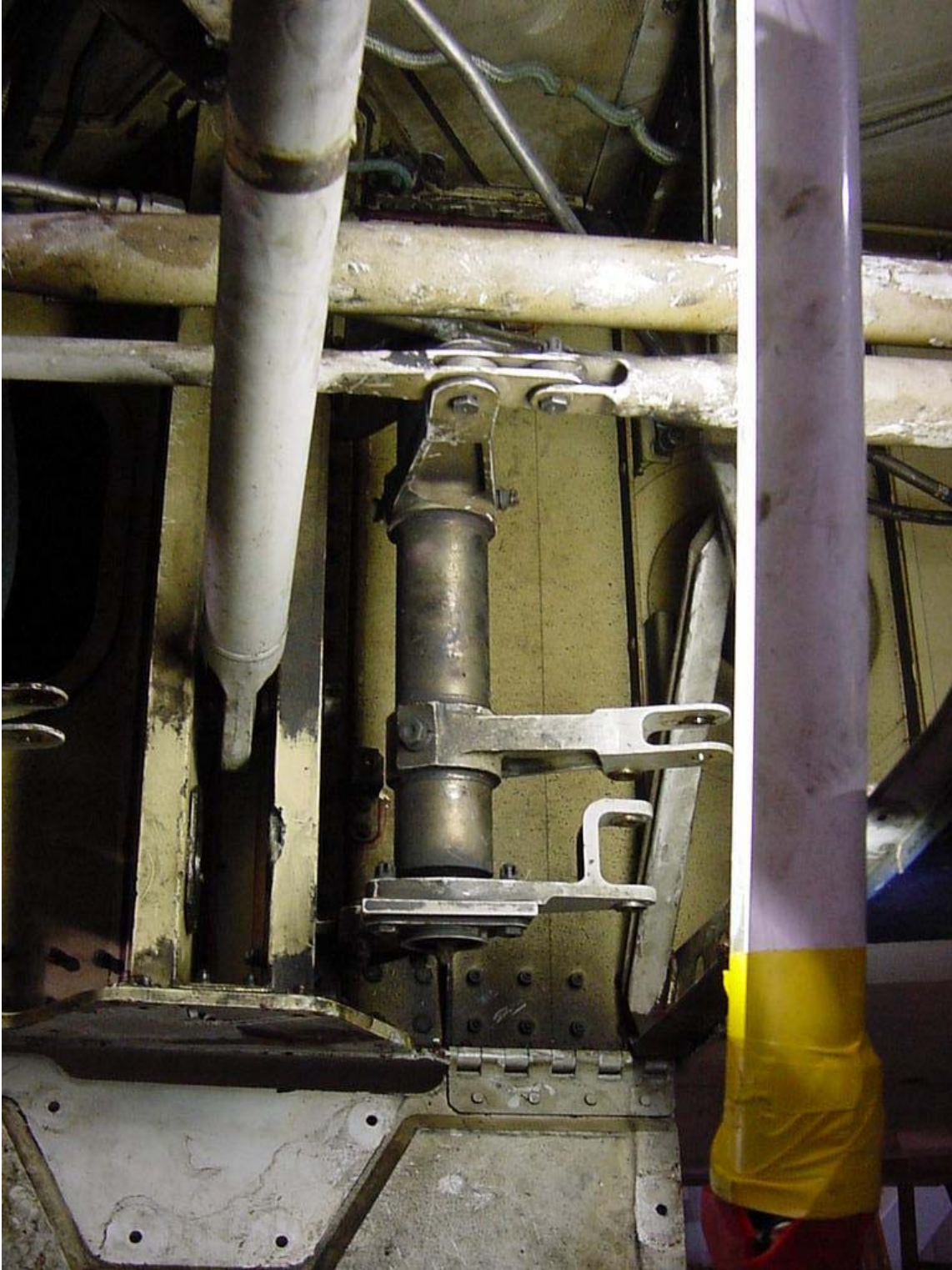
Figure 2. Pushrods and Bellcrank to Lower Rudder Servo