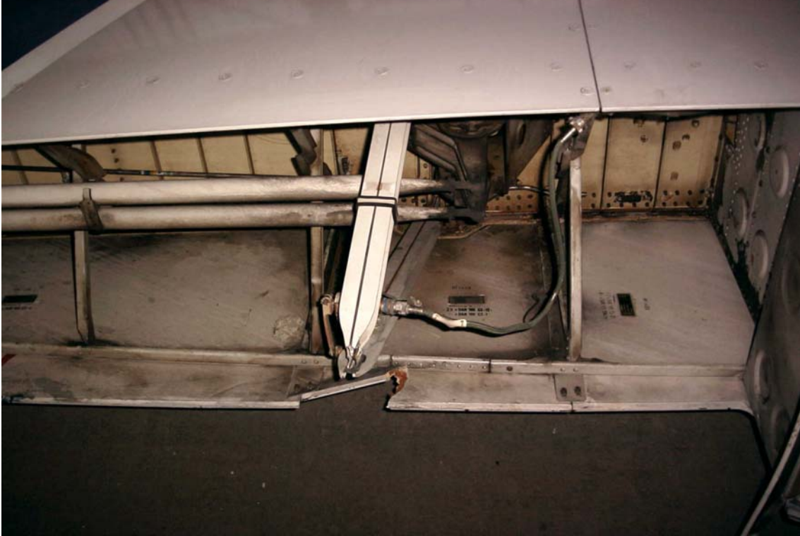
Figure 5. Pushrods and Bellcrank at Hinge 1.