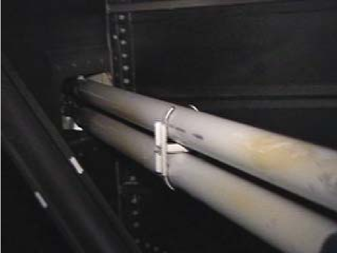
Figure 7. Pushrods Between Hinge 1 and Rib 4.