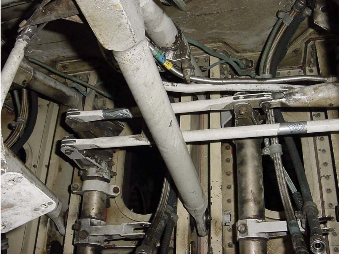
Figure 1. Pushrods and bellcranks to Upper (left) and Middle Rudder Servo Controls