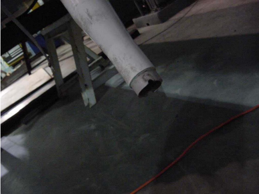
Figure 11. Fractured End of Right Pushrod