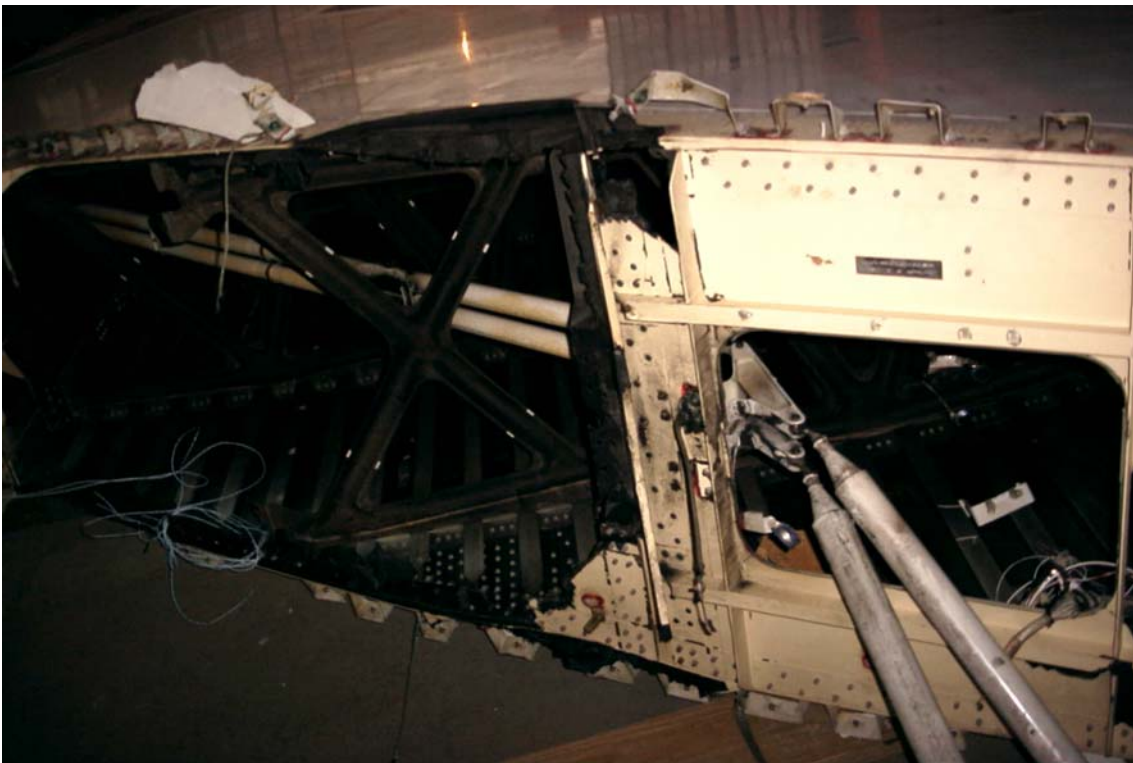
Figure 8. Pushrods and Bellcranks Between Rib 4 and Rib 1.