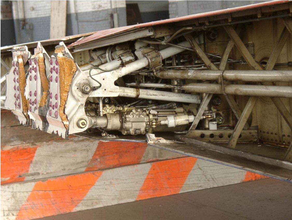
Figure 3. Pushrods to Rudder Servo Controls