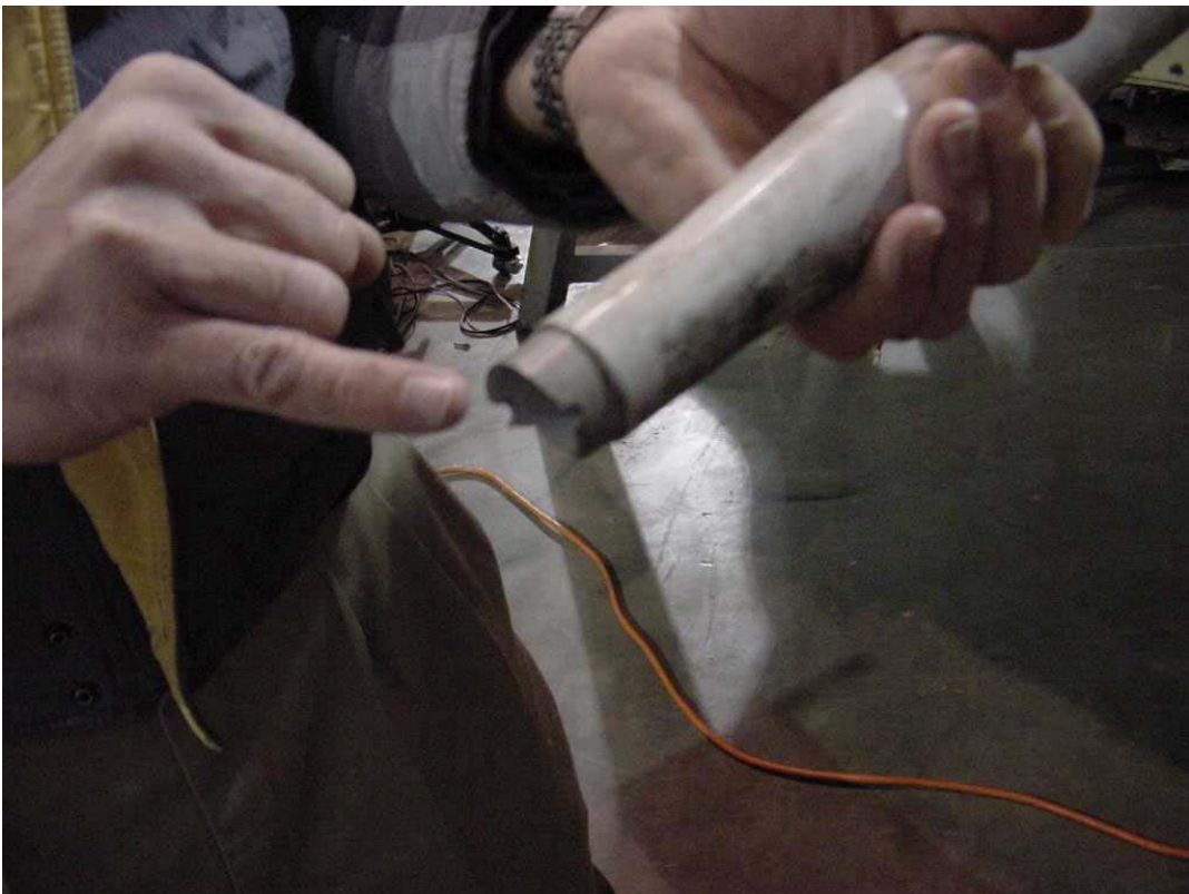
Figure 12. Fractured End of Left Pushrod.