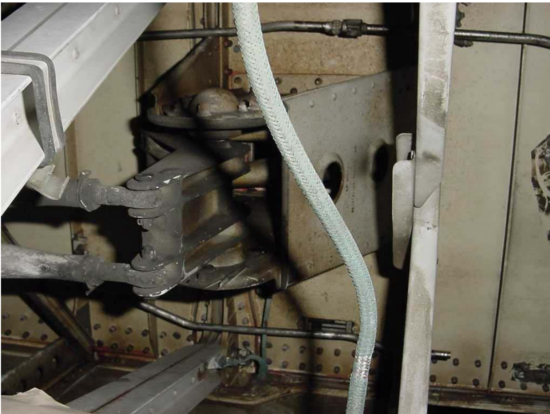
Figure 6. Pushrods and Bellcrank at Hinge 1.