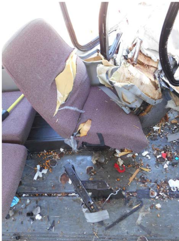
Photo 15. Interior view of seat 2A with seat 2B removed during extrication. NOTE: Sidewall intrusion.