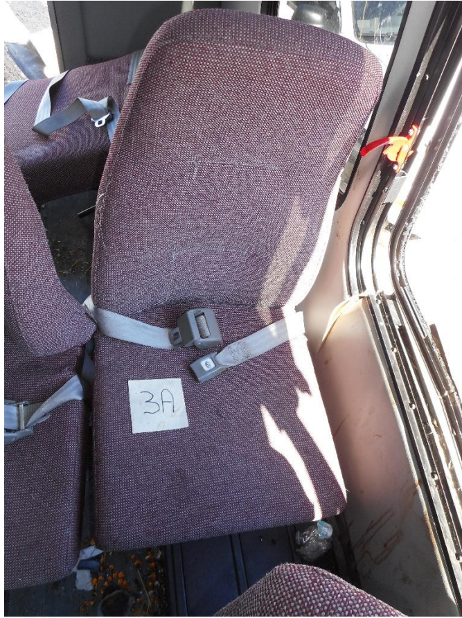
Photo 17. Interior view of seat 3A in 2004 Ford E350 showing “web winder” also known as a traveling retractor.