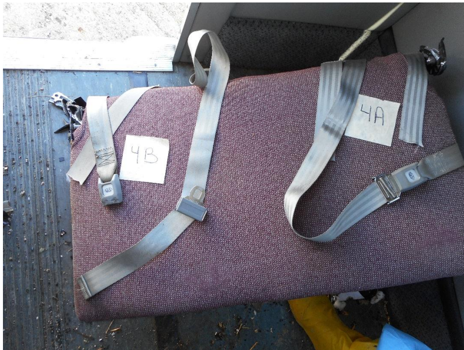
Photo 18. Interior view of row 4 folding bench seats A & B with self-tightening/synching lap belts.