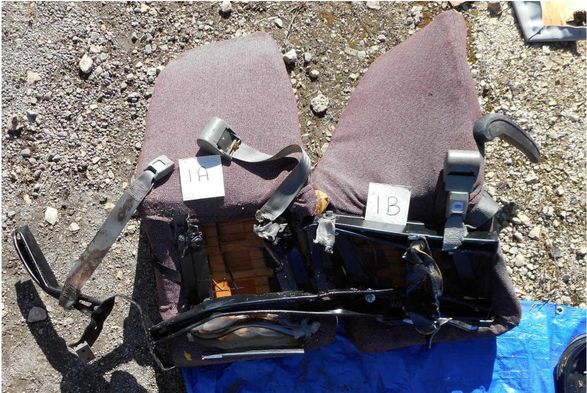
Photo 14 – View of backside of seat row 1A and 1B that were removed during extrication.