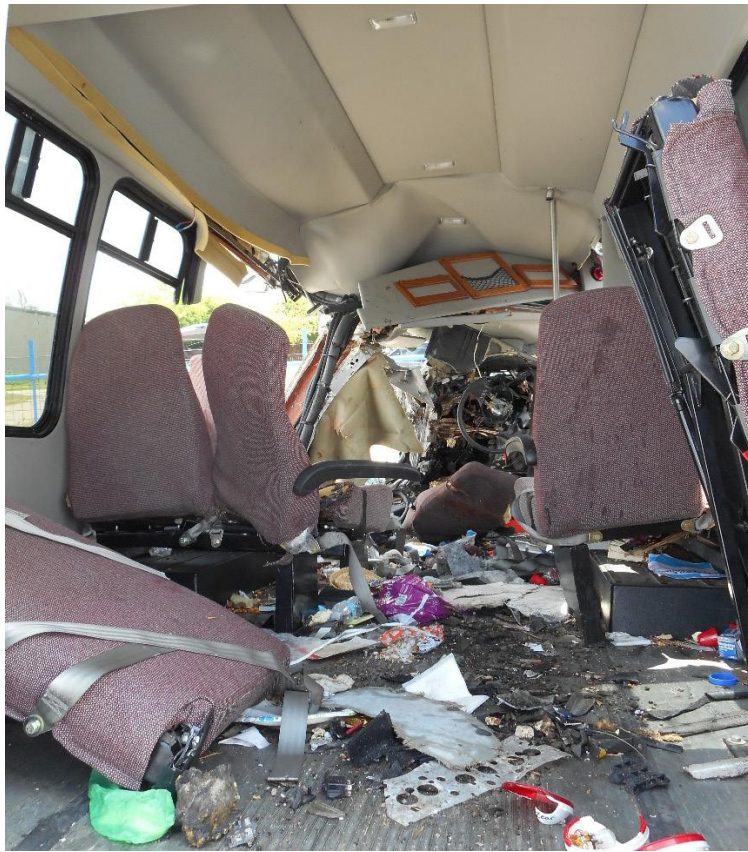
Photo 11 – Interior view from rear looking forward showing extent of intrusion and extrication damage to 2004 Ford E350 cutaway chassis.