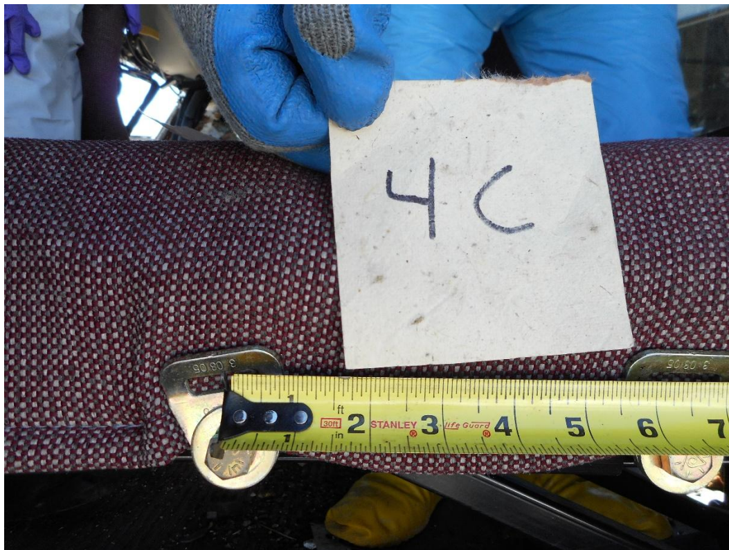
Photo 20. Close-up view of 6.5-inch lateral seat belt anchors in seat 4C. NOTE. Belt removed by first responders during extrication of passenger.