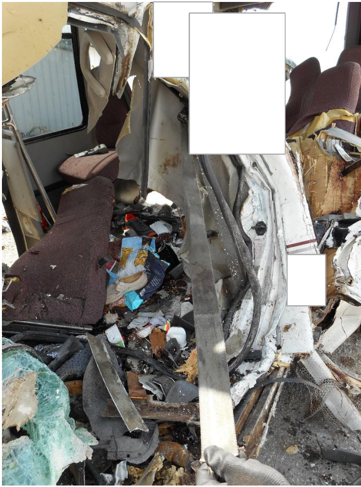
Photo 9 – Close-up view of driver's severed lap and shoulder restraint in 2004 Ford E350 cutaway chassis.