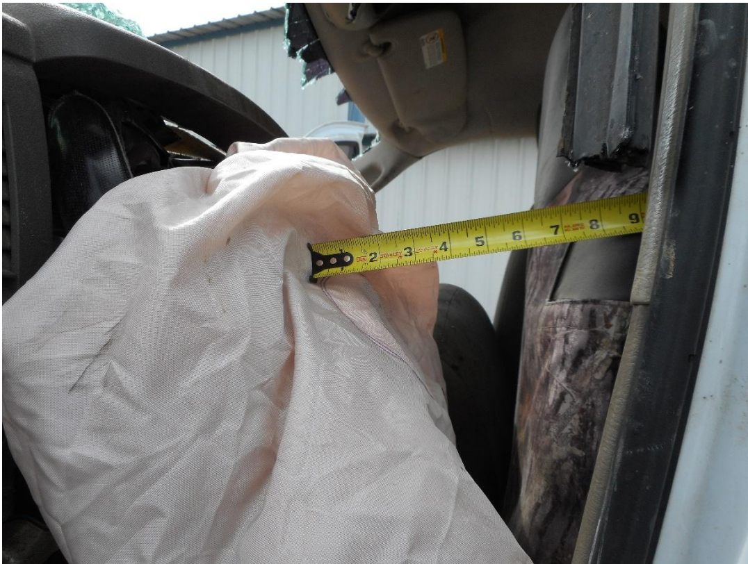
Photo 4 – Interior view from left side showing distance from steering wheel hub to driver seatback.