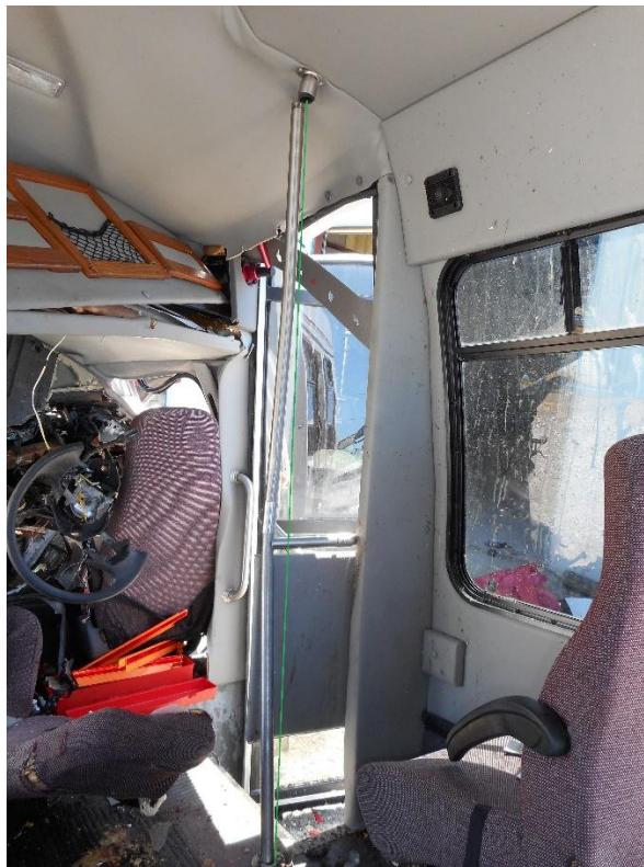
Photo 16. Interior view of loading door area in 2004 Ford E350 showing dislodged vertical entry grab pole.