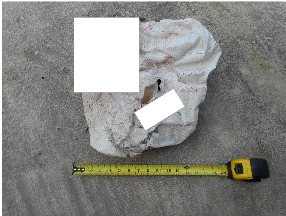
Photo 10 – View of driver's air bag module that was found outside vehicle.