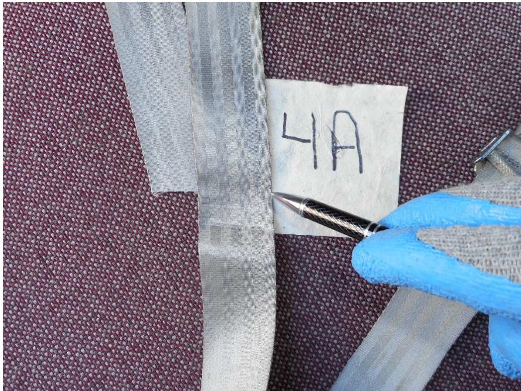
Photo 19. Close-up view of loading mark found on webbing in seat 4A in 2004 Ford E350. Similar loading marks were found on 3 of the 4 self-tightening/synching lap belts across the fourth row.