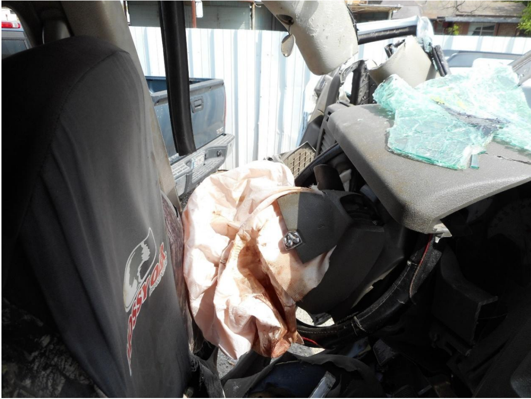
Photo 3 – Interior view of intrusion into driver seating area in 2007 Dodge Ram quad-cab 3500 pickup truck.