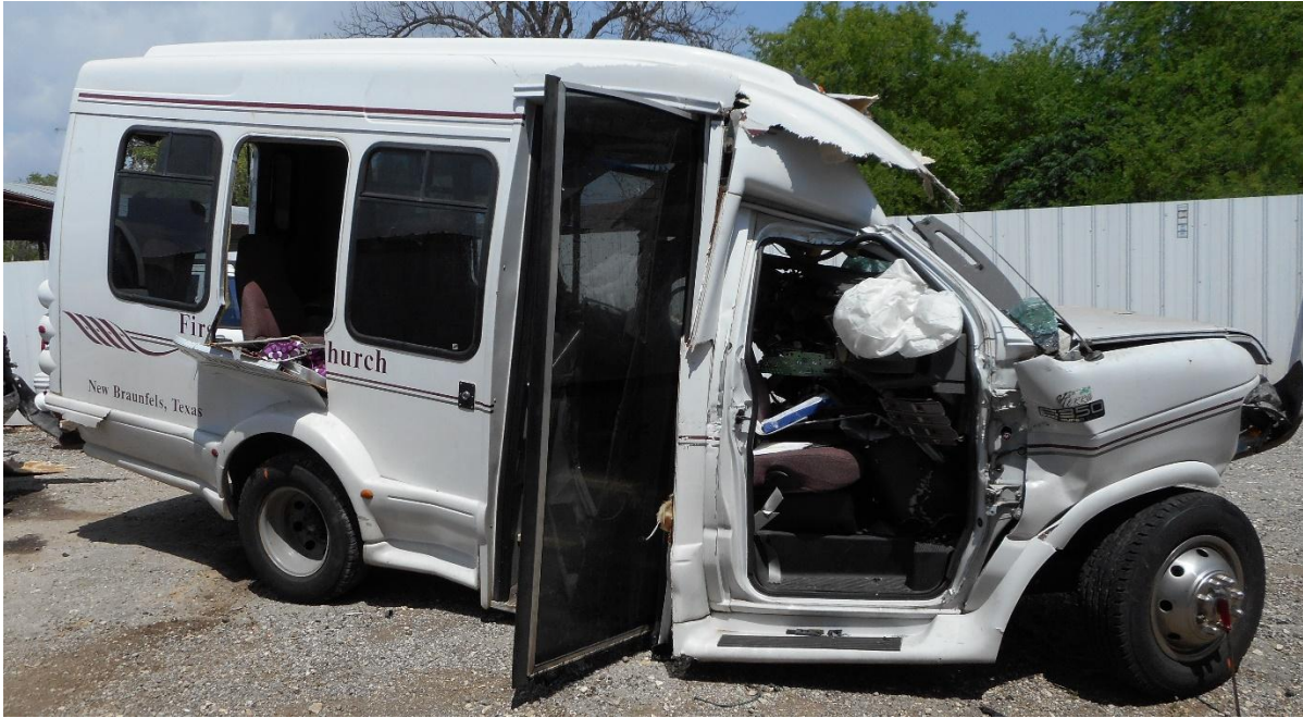
Photo 7 – Exterior view from right side showing deformation and extraction damage to 2004 Ford E350 cutaway chassis with a 13-passenger Turtle Top Vanterra medium-size bus body.