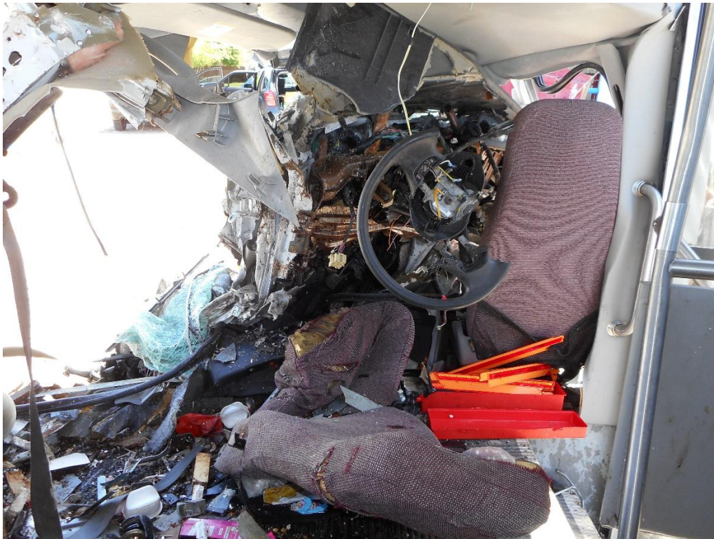
Photo 12 – Closer-up interior view of 2004 Ford E350 showing extent of damage and intrusion into driver and front right passenger area.