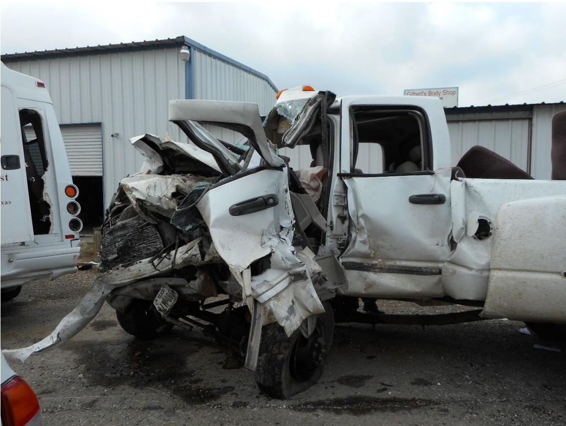
Photo 2 – Left side profile view of deformation to 2007 Dodge Ram quad-cab 3500 pickup truck.