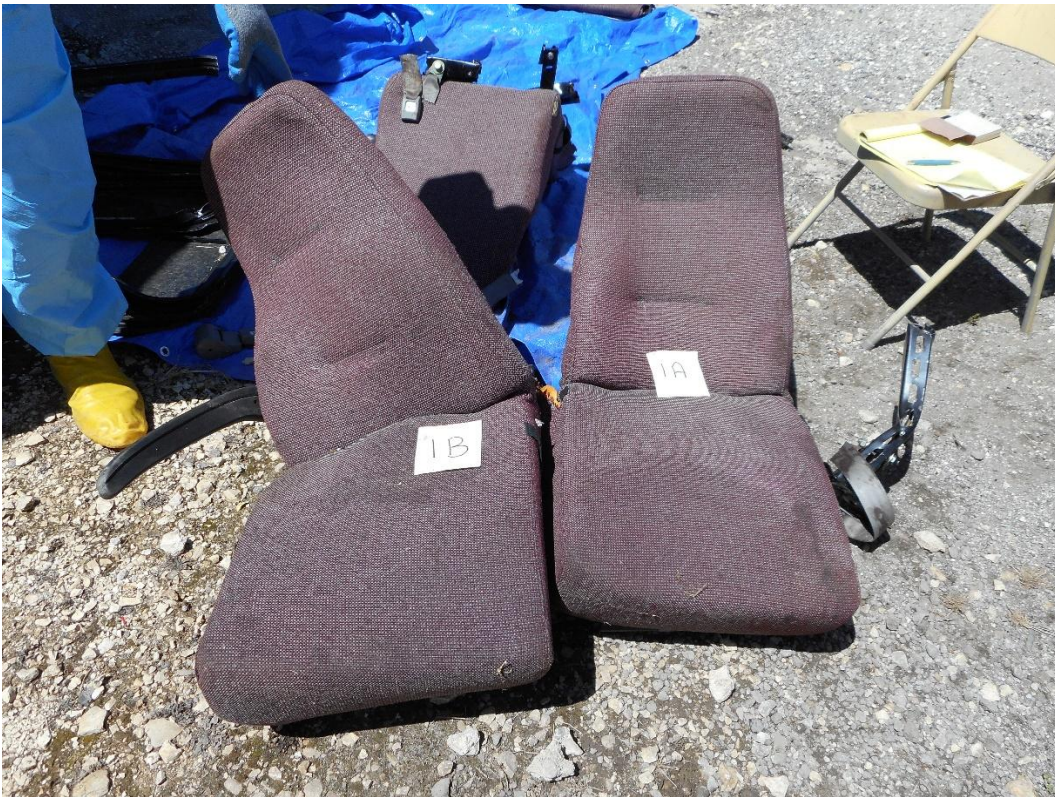
Photo 13 – View of front of seat row 1A and 1B that were removed during extrication.