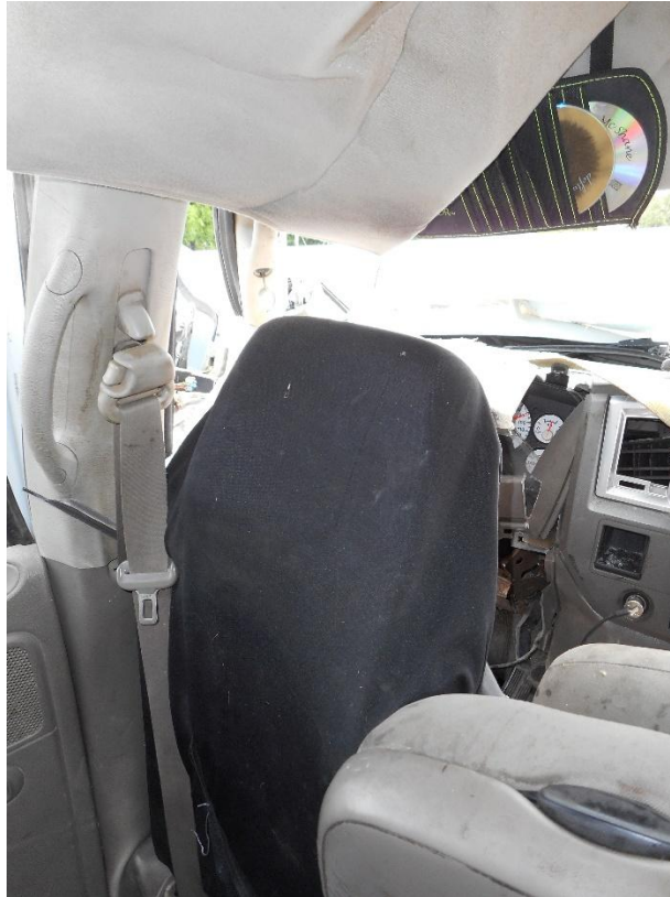
Photo 5 – Interior view of driver seating area in 2007 Dodge Ram quad-cab 3500 pickup truck. NOTE: Driver's seat belt is in locked and stowed position.