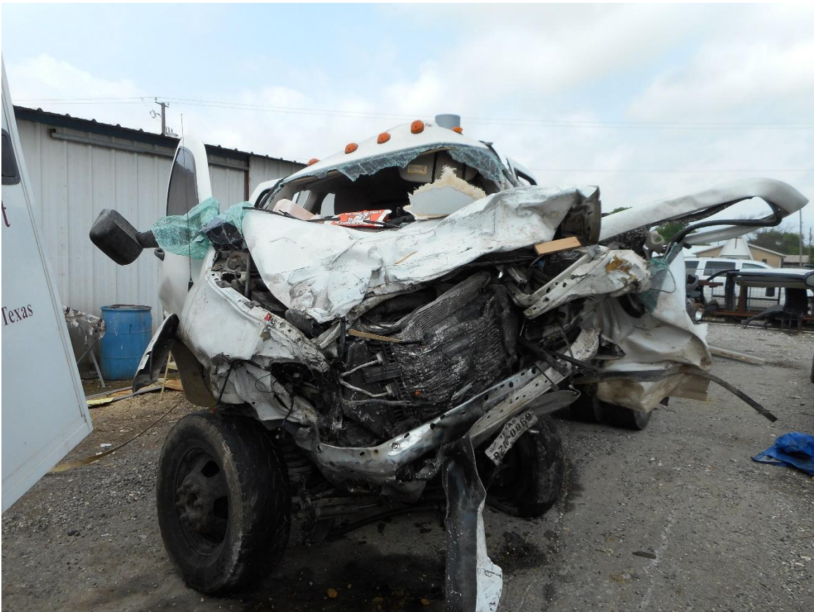
Photo 1 – Frontal view of deformation to 2007 Dodge Ram quad-cab 3500 pickup truck.