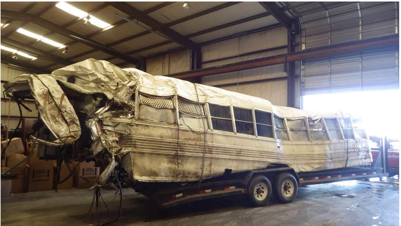
Photo 2 – Left side angle view of Bluebird bus showing missing front end and deformation to side from pillar impacts.