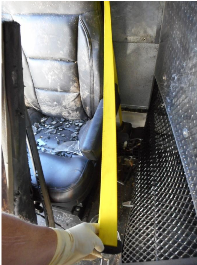
Photo 4 – View of rear jump-seat with seat belt webbing pulled out showing lack of blood.