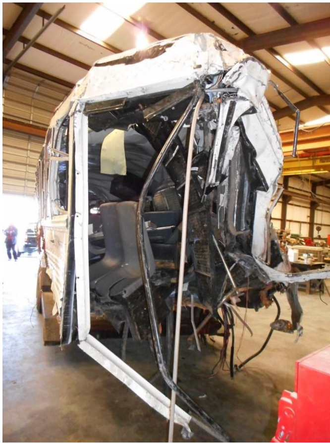
Photo 1 – Frontal view of Bluebird bus showing front end torn away.