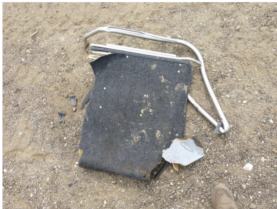
SF Photograph 12 shows the aft side of the driver side privacy panel. The panel was dislodged from the motorcoach and found in the debris pile. It exhibits extensive damage including a fractured portion at the lower inboard corner and steel tubing around the upper and inboard sides is deformed.