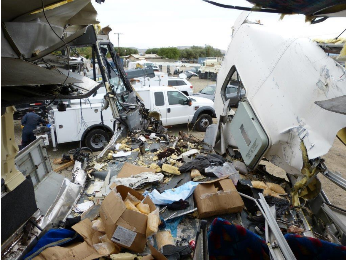
SF Photograph 13 shows a view of the interior looking from the middle of the motorcoach towards the front. Extensive damage and debris is visible. The entire front and roof in this region of the motorcoach is displaced with a large section of the roof visible partially attached to the passenger sidewall.