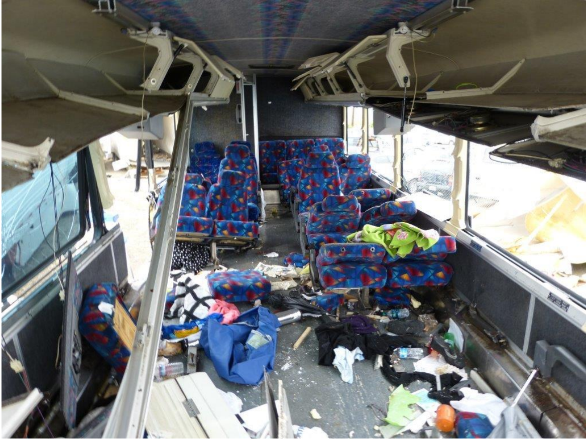
SF Photograph 15 shows a view of the interior looking from the middle of the motorcoach towards the back. The middle of the motorcoach has missing seats, and seats remain in the aft portion of the motorcoach with several exhibiting deformation or damage. The luggage rack are visible, and exhibit severe damage. The passenger windows on the driver side are broken out, and 1 window remains on the passenger side. A section of the passenger sidewall that has been cut away by first responders is visible.