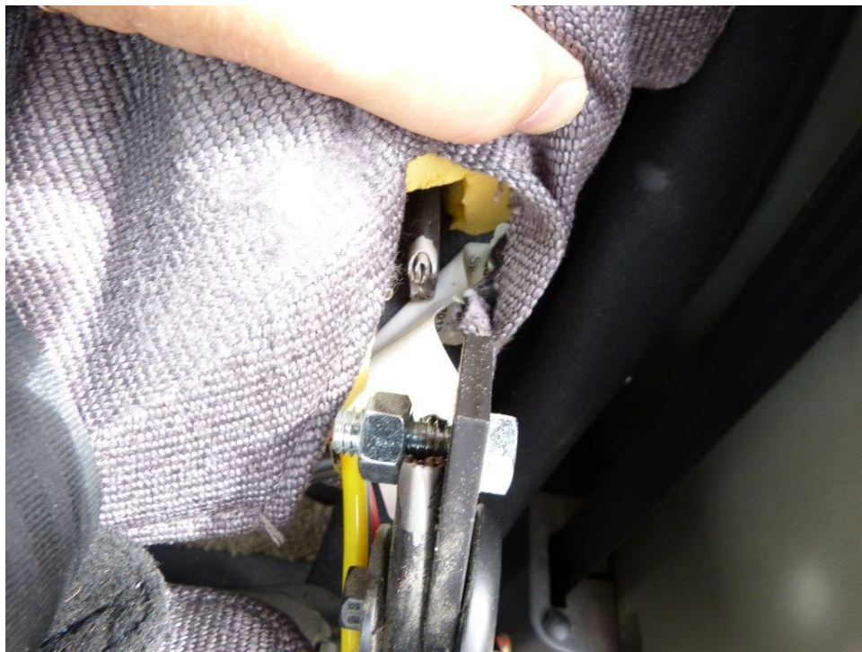
SF Photograph 21 shows a detailed view of the truck driver seat backrest mechanism. The backrest support structure is fractured and separated at the location of an attachment bolt.