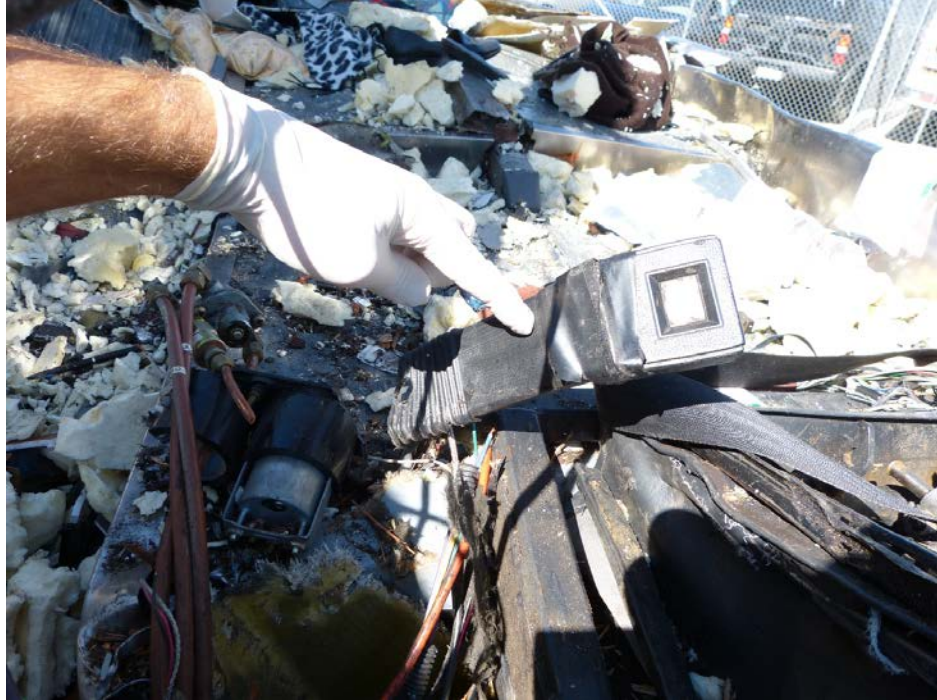
SF Photograph 7 shows the driver seat belt buckle attached to the lower portion of the driver seat frame, which remained attached to the floor of the motorcoach. The buckle is not connected to the belt, and the area surrounding the buckle is extensively damaged.