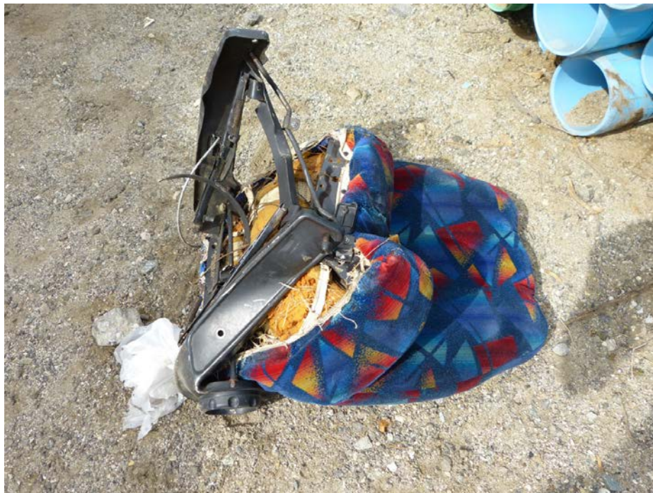
SF Photograph 5 shows a view of the front of the drivers seat. Severe deformation at the front middle section of the seat pan is visible. The lower portion of the seat frame is visible with extensive damage. The headrest is missing.