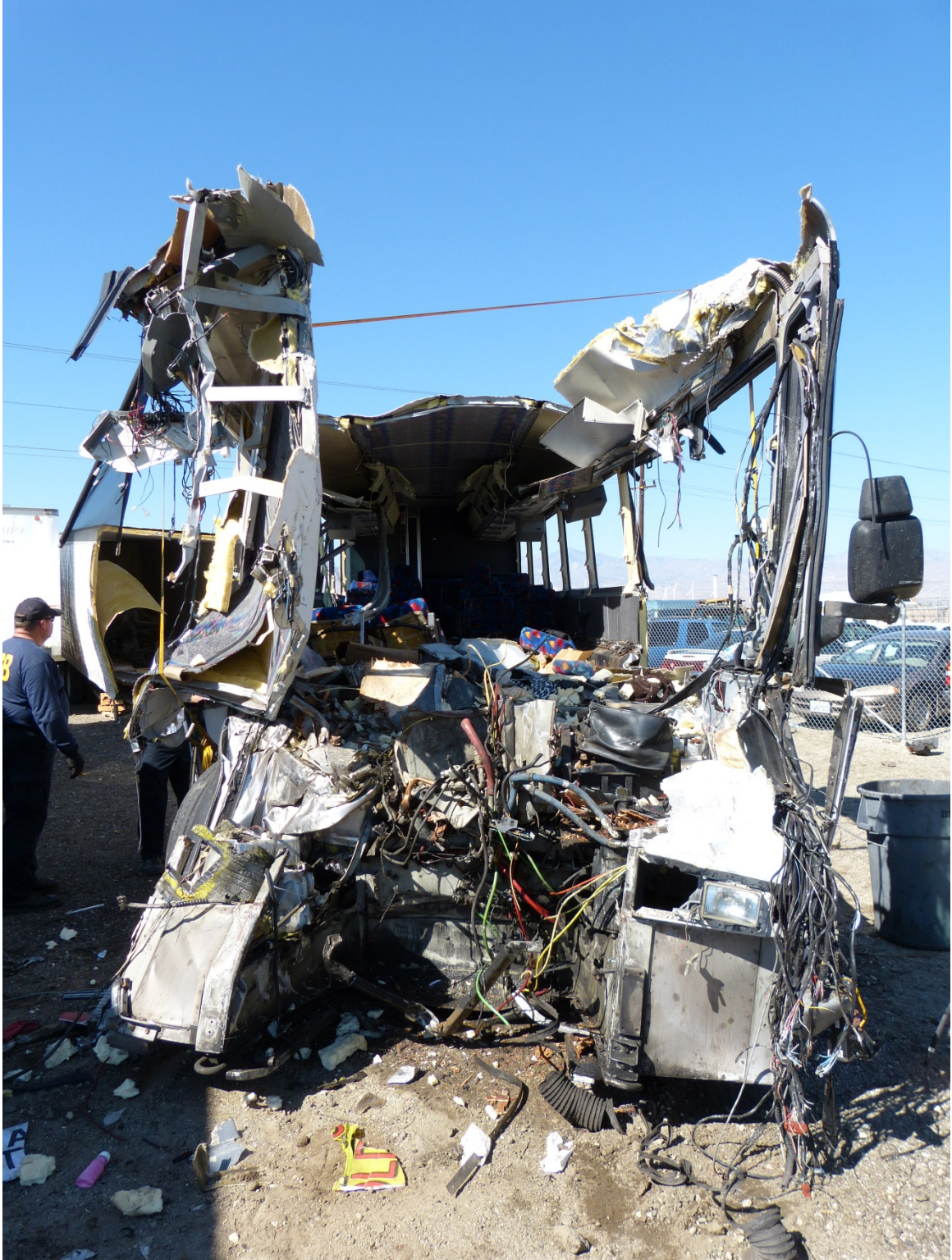
SF Photograph 1 shows a view of the front of the motorcoach. The front of the motorcoach exhibits severe damage with the entire windshield and front panel displaced. The internal components, wiring are visible. The driver seat, front passenger seats, front windows, and portions of the forward sidewalls are visibly displaced.