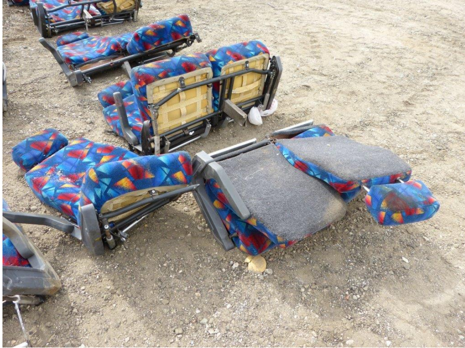
SF Photograph 16 shows a group of passenger seats that were dislodged from the motorcoach and found in the debris pile. The seats exhibit extensive damage, deformation, and evidence of the attachment points being cut by first responders.