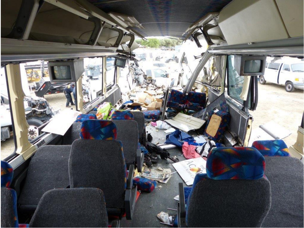
SF Photograph 14 shows a view of the interior looking from near the back of the motorcoach towards the front. The middle section of the motorcoach interior is visible. Seats in the section are missing and there is extensive damage and debris visible. A section of the sidewall on the passenger side is visibly cut away, and most of the passenger windows are broken out.