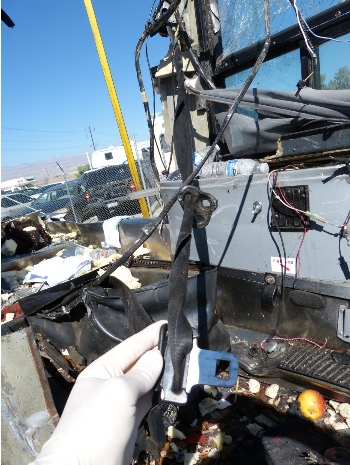
SF Photograph 9 shows a view of the driver seat belt with the webbing, connector, and attachment bracket visible. The attachment bracket is dislodged and the webbing is twisted. Severe damage to the surrounding motorcoach structure is visible, and the sidewall aft of the belt attachment has a large section cut away by responders.