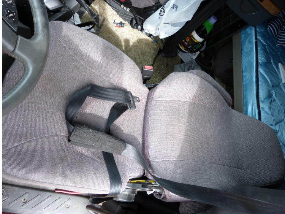
SF Photograph 20 shows a view of the truck driver seat and sleeper berth. Portions of the driver seatbelt visible, and is disconnected and resting on the seat. The seatback is fractured and resting in a reclined position onto the sleeper berth mattress.