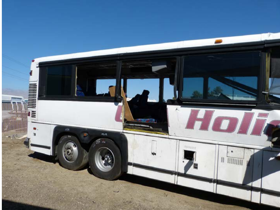
SF Photograph 4 shows the aft portion of passenger side of the motorcoach. The sidewall of the motorcoach forward of the rear wheels exhibits a cutout portion from first responder extrication operations, and the 2 passenger windows in front of the aft passenger window are broken out.