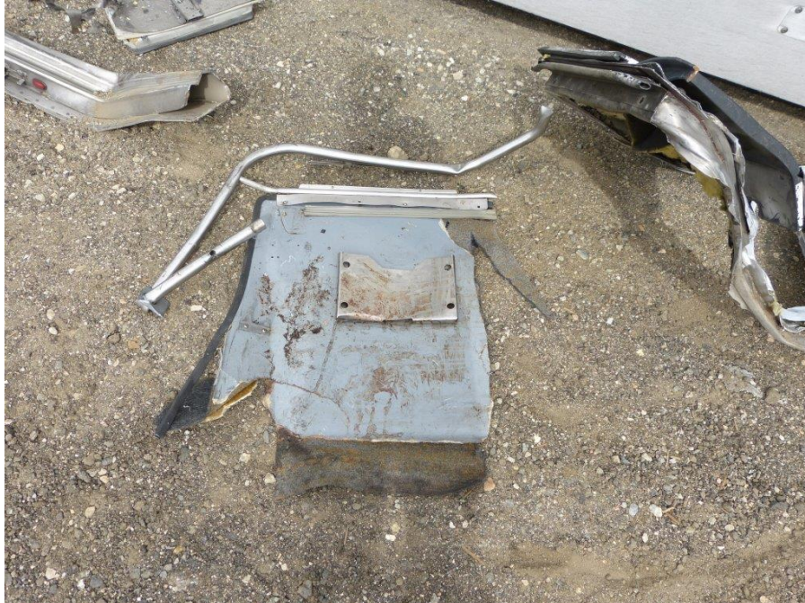
SF Photograph 11 shows the forward side of the driver side privacy panel. The panel was dislodged from the motorcoach and found in the debris pile. It exhibits extensive damage including a fractured portion at the lower inboard corner and steel tubing around the upper and inboard sides is deformed.