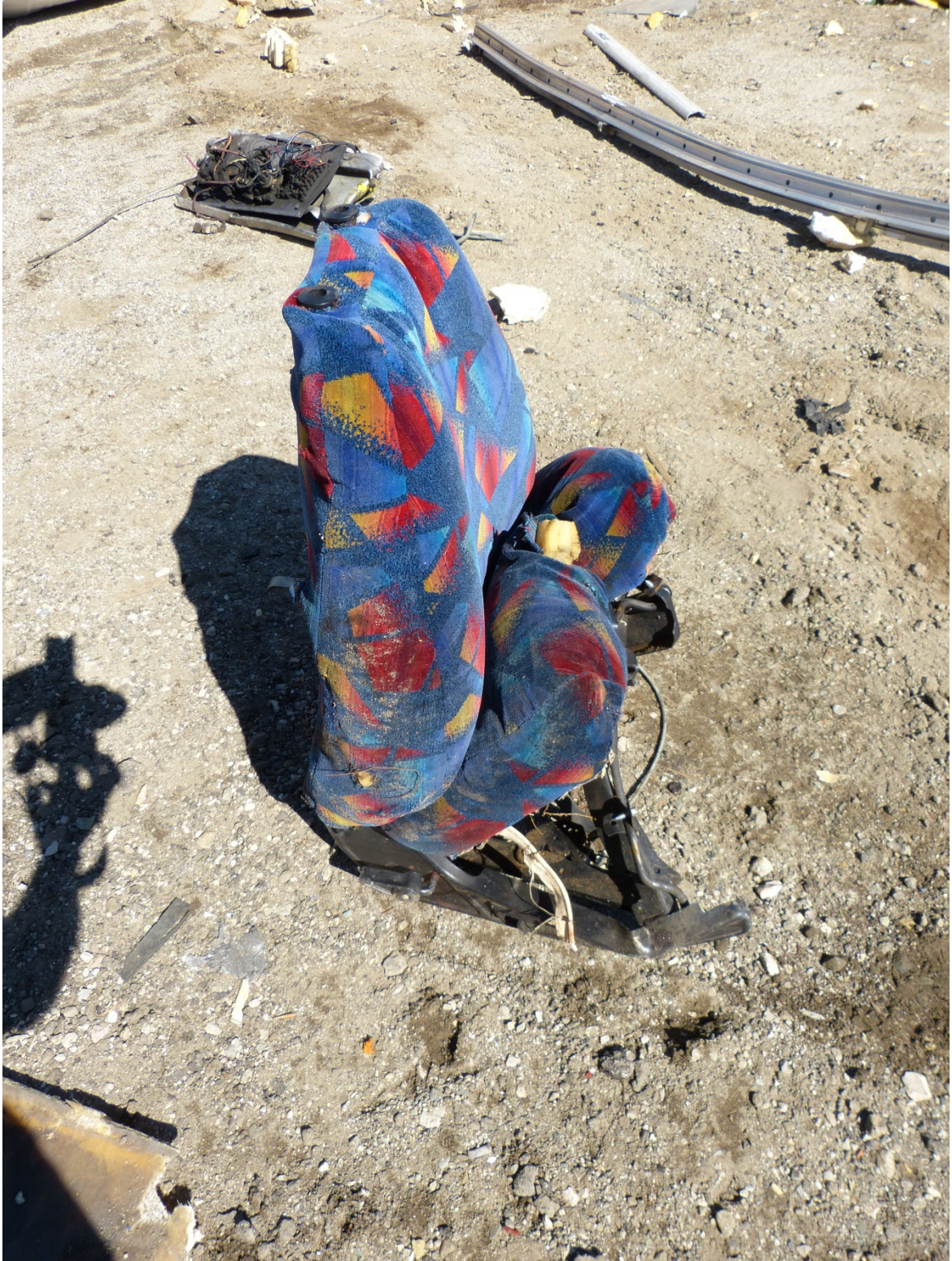
SF Photograph 6 shows an inboard side view of the driver seat. Severe deformation is visible at the middle portion of the seatpan, and the seatframe is severely deformed. The headrest is missing.