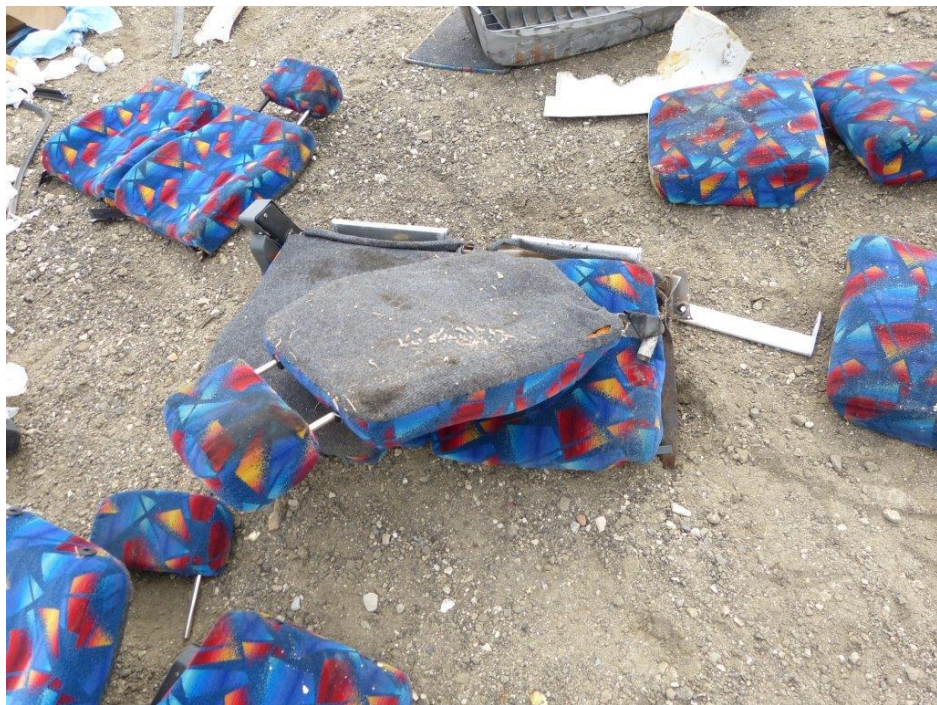
SF Photograph 17 shows a group of passenger seats and components that were dislodged from the motorcoach and found in the debris pile. The seats exhibit extensive damage, deformation, and evidence of the attachment points being cut by first responders. The seats in the middle of the view show deformation likely resulting from occupant impact.