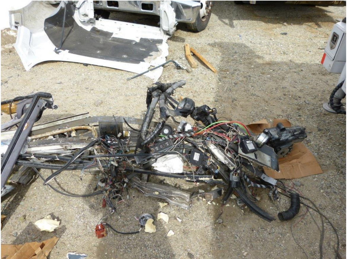
SF Photograph 10 shows the motorcoach steering wheel and portions of the steering column, steering gear, and portions of other surrounding components. The portions of the steering wheel that were found towards the front and back of the motorcoach have been crushed to the center of the wheel. The surrounding components exhibit severe damage.