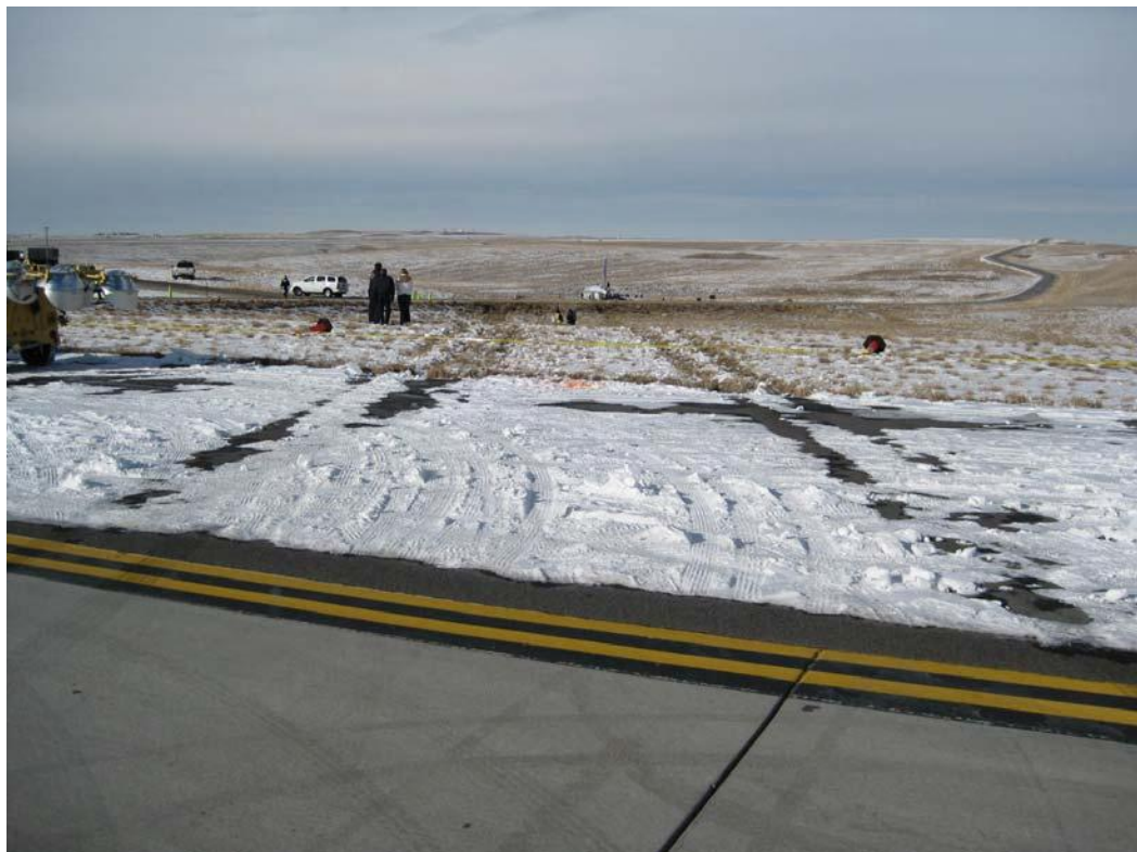
Photograph 2: Crash site as viewed from Taxiway WC.