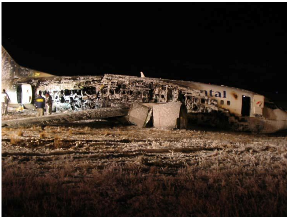
Photograph 10: Exterior burn damage.