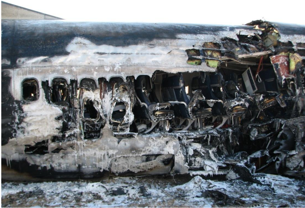
Photograph 9: Exterior burn damage.