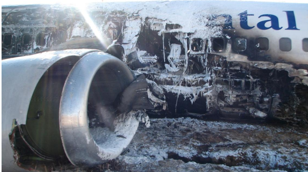
Photograph 8: Exterior burn damage.