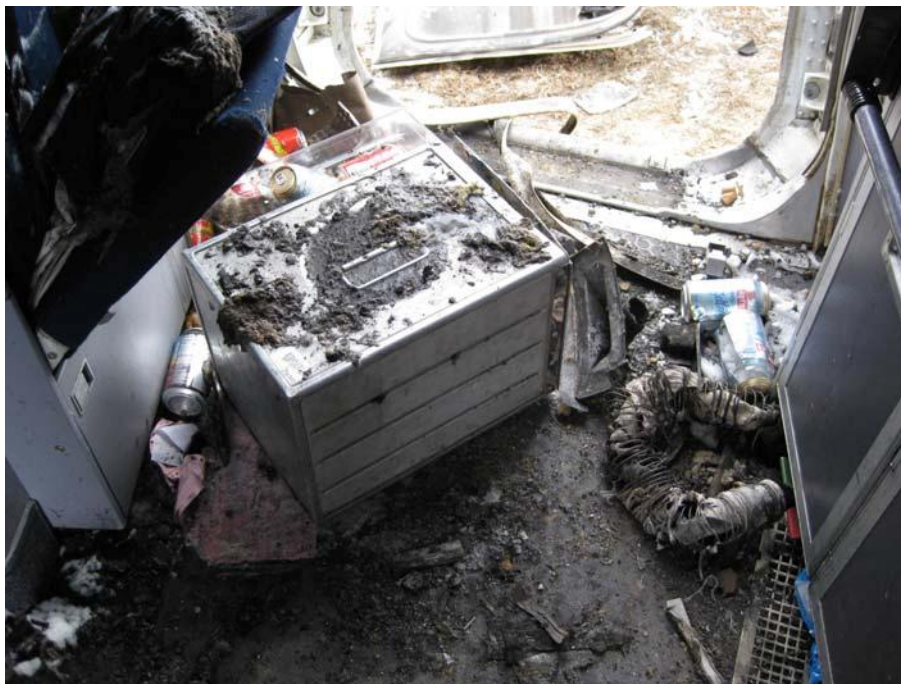
Photograph 12: Vestibule area at door 2R; galley carrier from aft galley on floor under aft-facing flight attendant jumpseat.