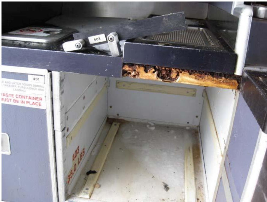
Photograph 11: G4B galley in aft cabin, showing broken latch plate.