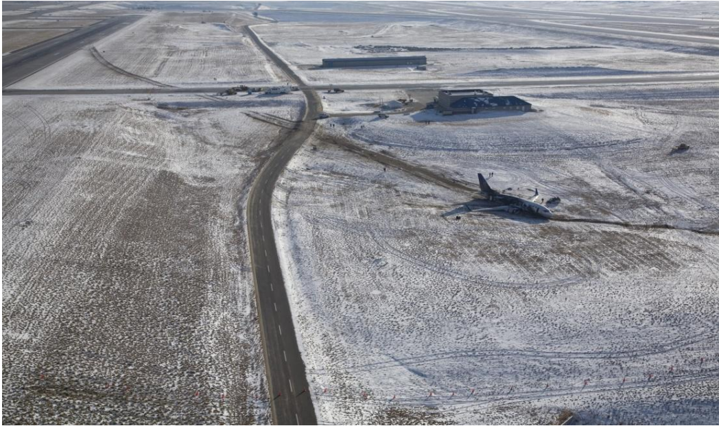
Photograph 1: Ground track of airplane from Runway 34R .