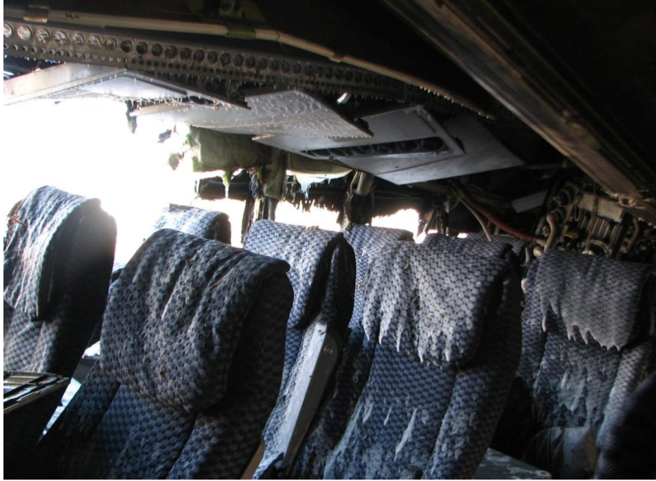
Photograph 7: Right interior of airplane.