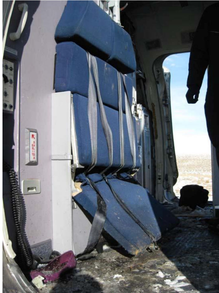
Photograph 5: Flight attendant jumpseat at door 1L.