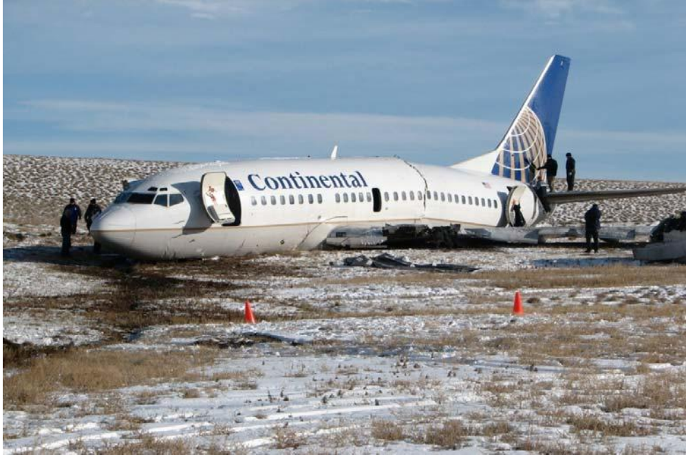
Photograph 3: Left side of airplane.