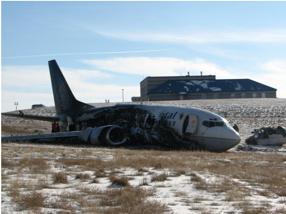
Photograph 4: Right side of airplane, with ARFF 4 fire station in the background.